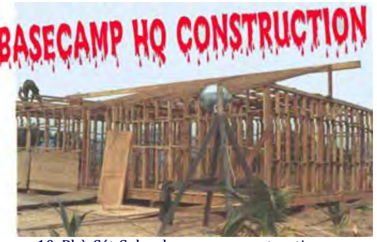
10. Phù Cát Cobra basecamp construction.