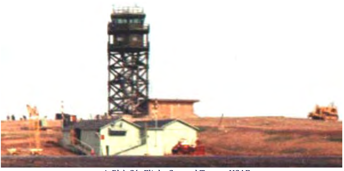
4. Phù Cát Flight Control Tower, USAF.