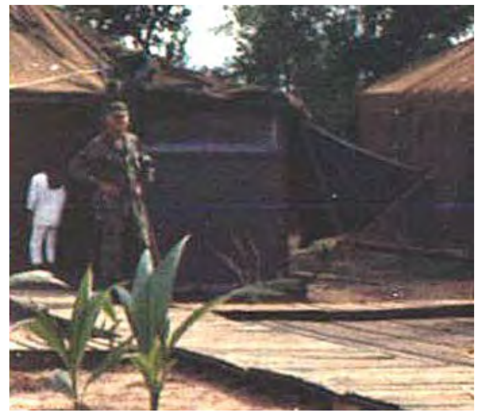
6. What's that Airman doin' with a camera instead of plantin' them there plants?