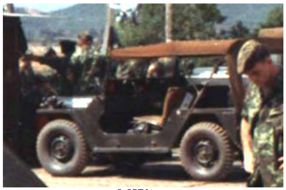
9. QRT Jeeps.