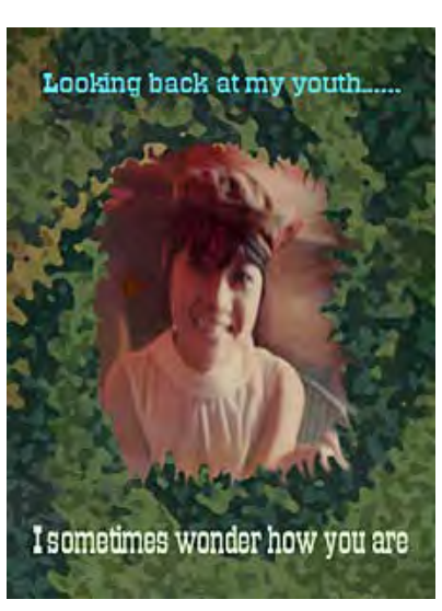
17. Photo taken inside bar in Qui Nhơn. Babysan wearing my cobra beret.