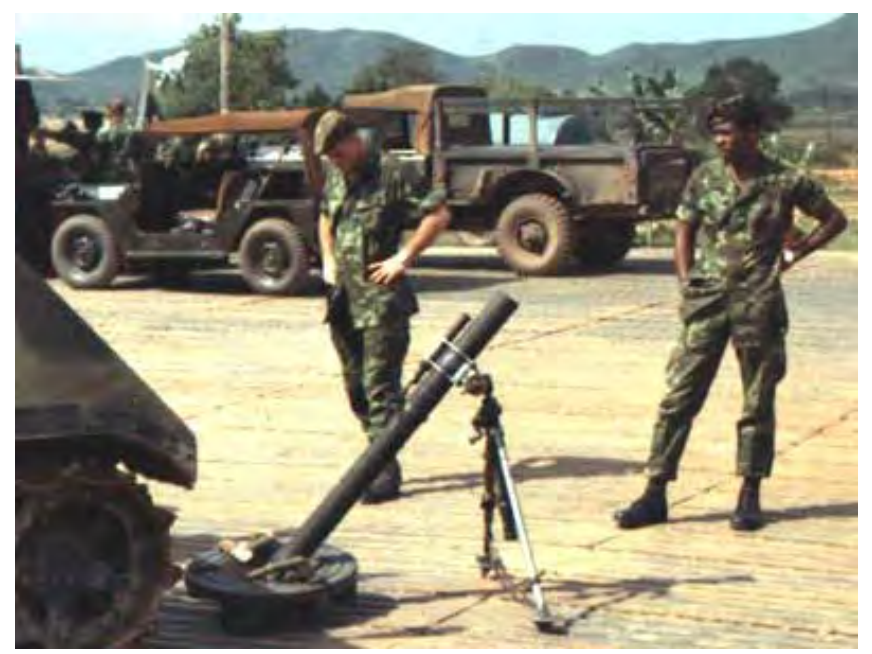
8. Phù Cát Cobra basecamp.