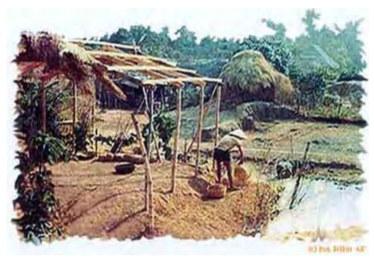
22. Local Villager building on to house - Phu Cat 1968: This photo started as the most used one I had . It had cracks tape marks and holes all over it. Incidently it was taken from a "house" on the Phù Cát Strip, while waiting for some ROK Tiger Div. (troops tore up the house). The old man in the photo would go out and fill the two baskets and bring back to fill in the water hole.