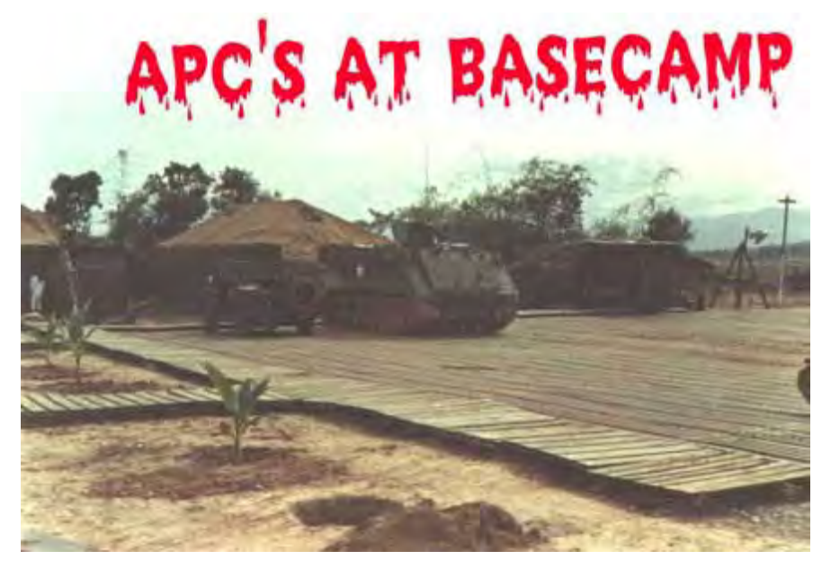
5. Phù Cát 37th SPS basecamp APC's at the ready. Foreground, "Phù Cát AB Beautiful" campaign.