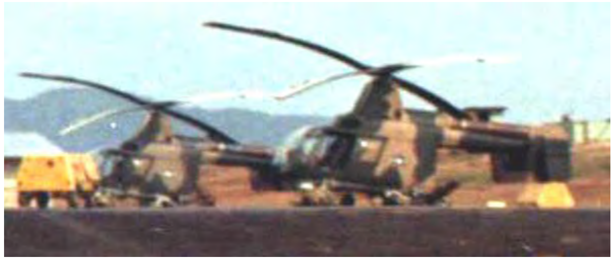
3. Phù Cát Search and Rescue, HH43 USAF helicopters.