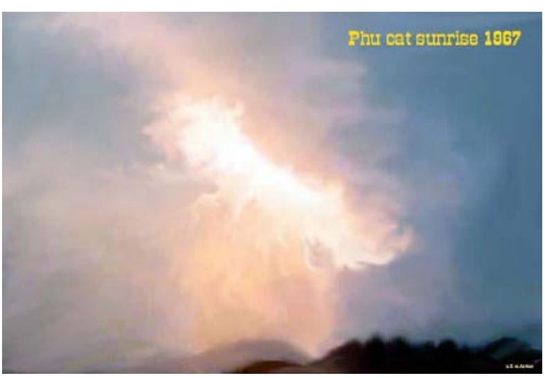
16. Phù Cát Sunrise 1967, taken from 37th SPS armory area. - Ron Arthur photo.

15. Charlie Eleven members leaving Armory area for night ambush outside the wire. Also on board relief for Rook Towers. Cobra Flight set up blocking force beyond K-9 handlers in defense of Phù Cát Air Base.