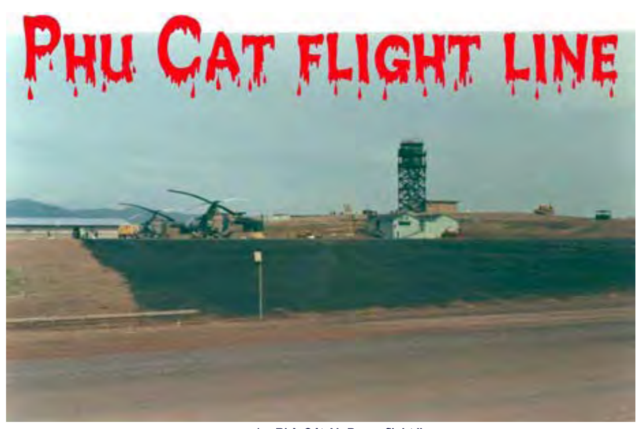
1. Phù Cát Air Base, flight line.

37th Security Police Squadron