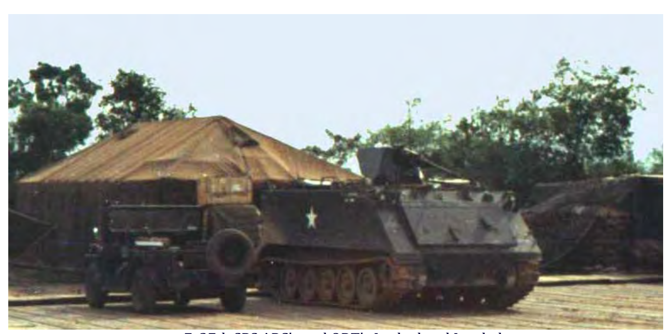
7. 37th SPS APC's and QRT's Locked and Loaded.