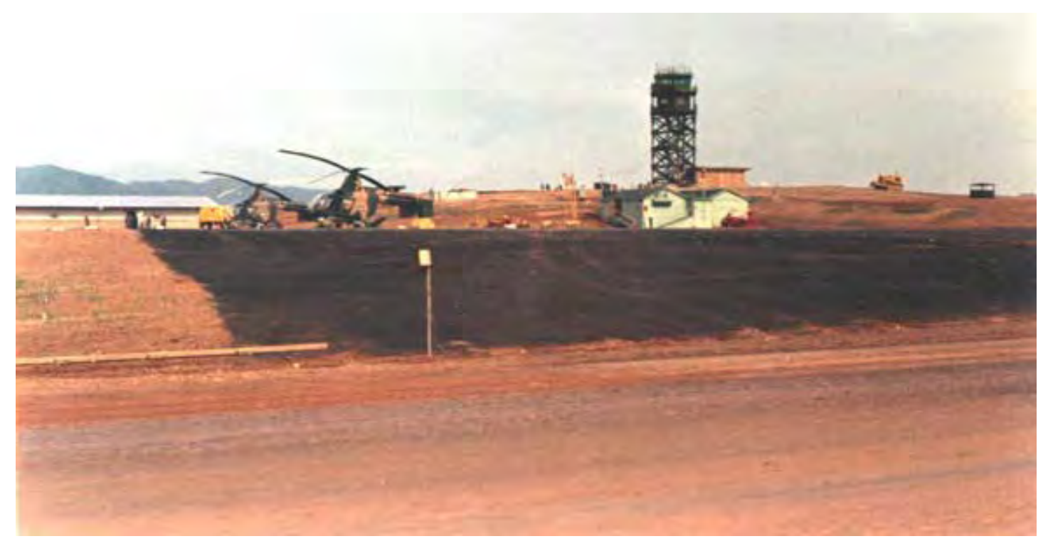
2. (Close up)