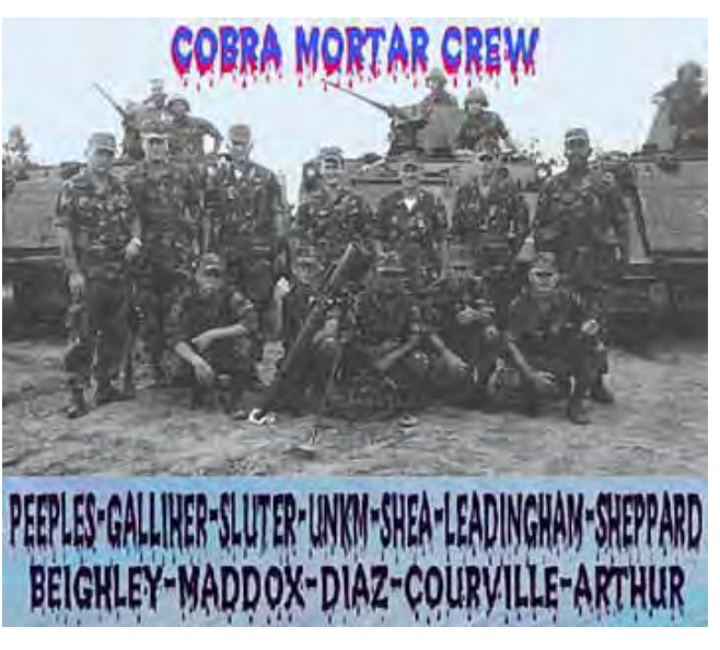
20. Mortar crew Cobra Flight, Phù Cát 1967.