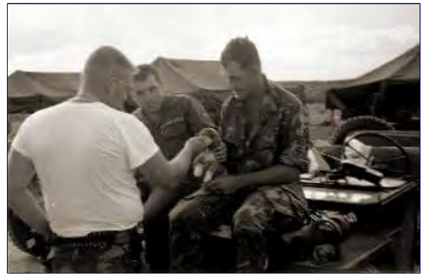
[7] Time out to pet a new mascot! Rabies, Sarge? No way!