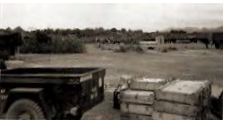
[8] Phù Cát Supplies keep arriving at a steady pace!