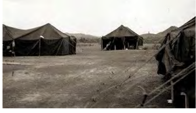
[12] HEY! Where are the cots?