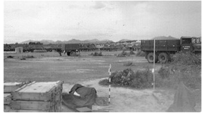
[14] Tent City begins to rise.