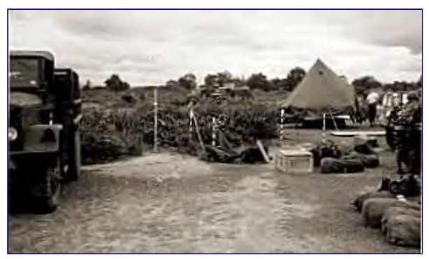
[11] Equipment is trucked in continually.