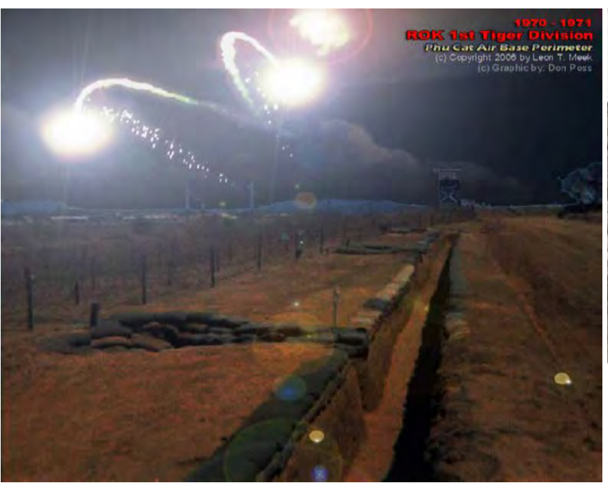
[15] (above) Composite photo of ROK trenches.