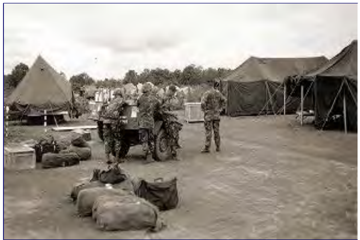
[9] All right you men... Back to work!