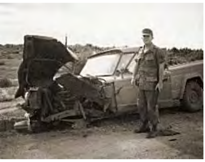
[16] Well... it was a nice ride while it lasted. Where's the BX, anyway?