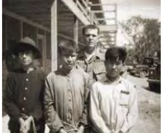
[17] (right) Three VC POWs in custody.