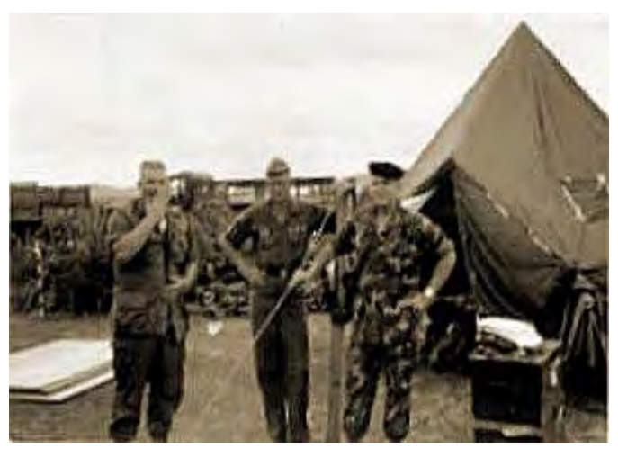
[10] Cots? Who cares! Where's the beer!