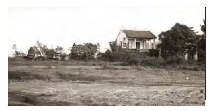
[2 & 3] This temple is the first thing we saw when we drove in to Phù Cát Air Base to-be property. There were still monks in it when we arrived.