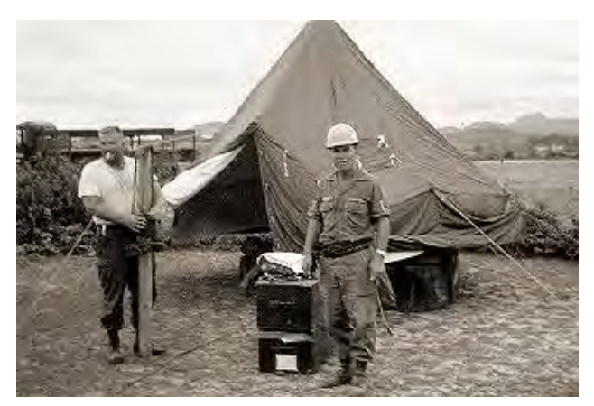
[4] We set up camp adjacent to the Temple and placed our M60's on the elevated graves to give elevated firing positions. Bunkers went up along with the tents in background.