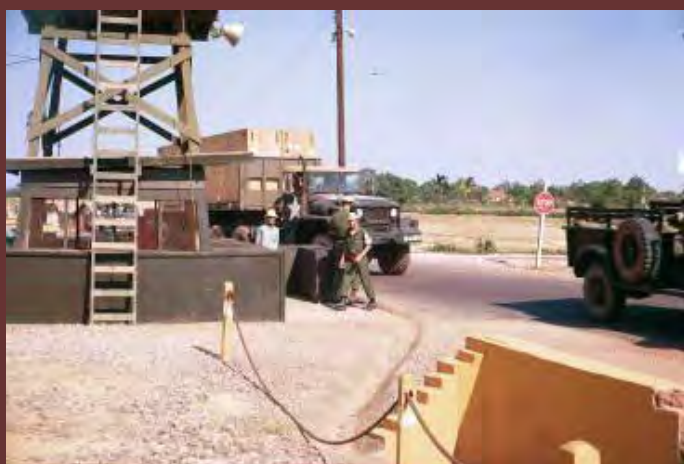
10. Front gate Phù Cát