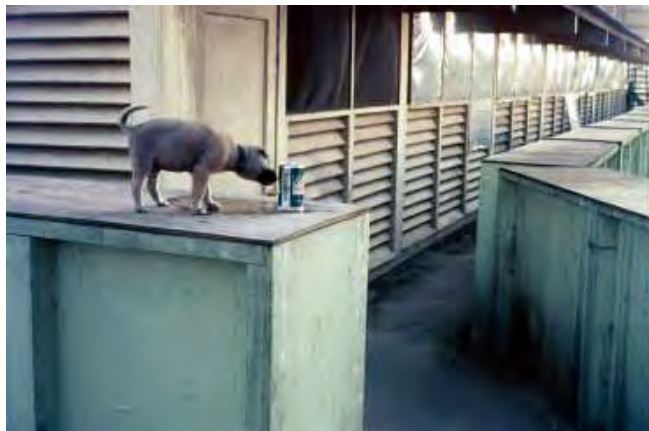
35. First Little Piggy Loved Hamm's beer.