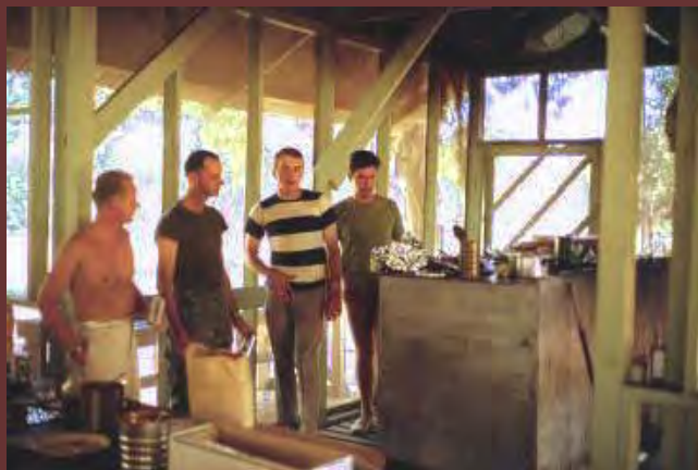
14. Waiting for the steaks to cook