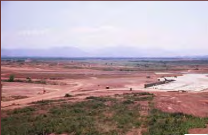
4. Run up area south end of runway.