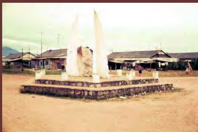
25. Monument near Phù Cát base.