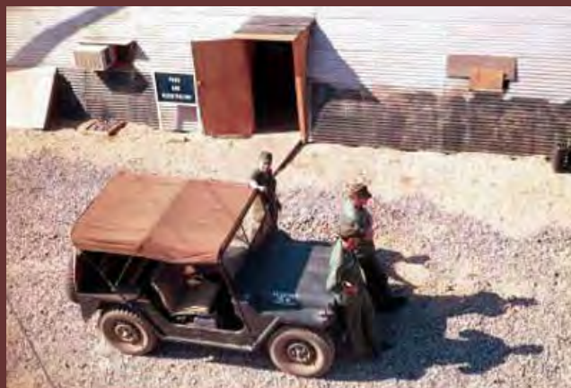
15. Pass and ID front gate