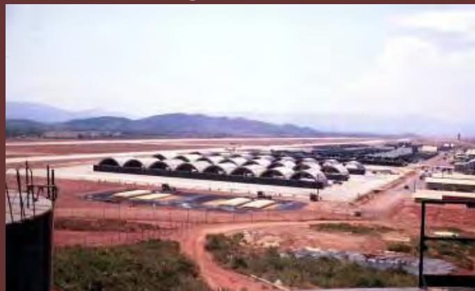
16. Phù Cát flight line and reventment areas