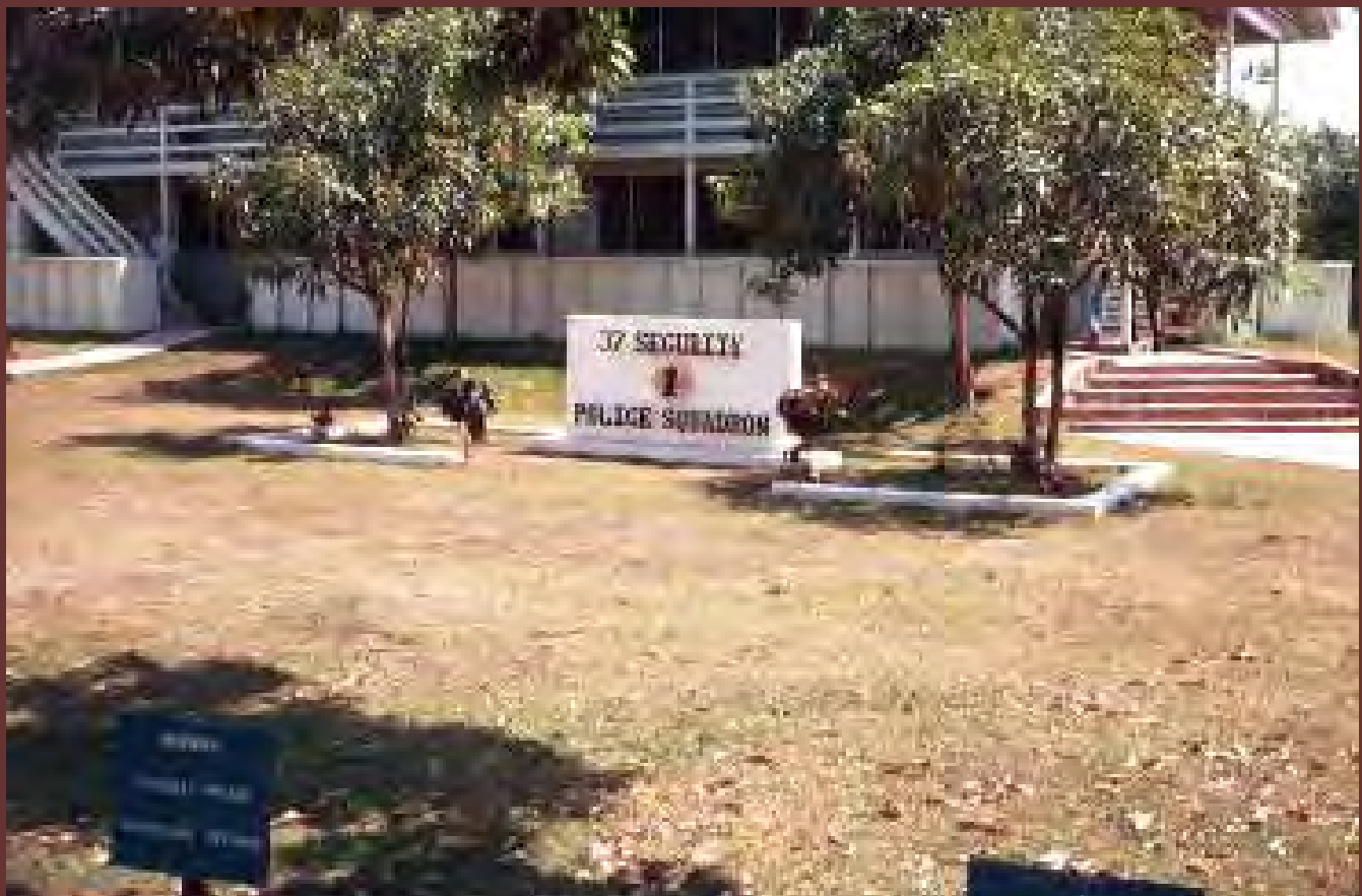
1. Home sweet home