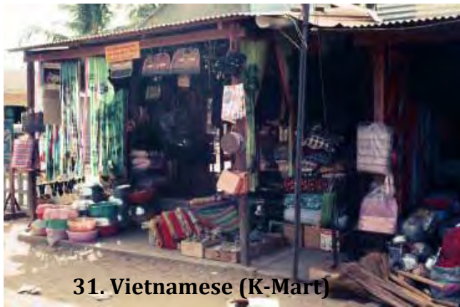
31. Vietnamese (K-Mart)