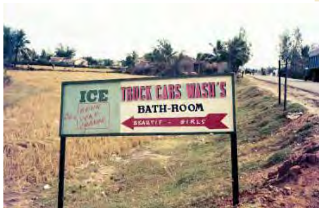
33. (Beautiful-Girls) never located.