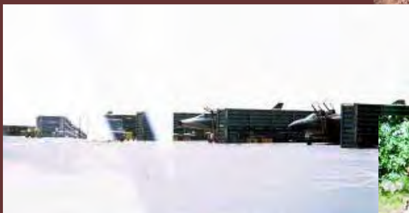
12. (left) Reventment area F-100.