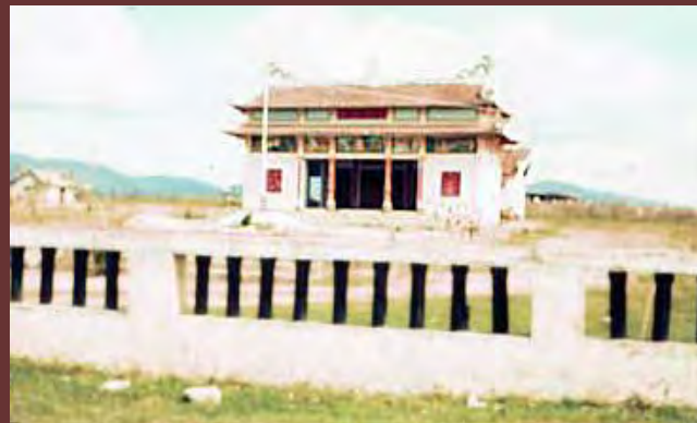
22. Buddhist temple near b