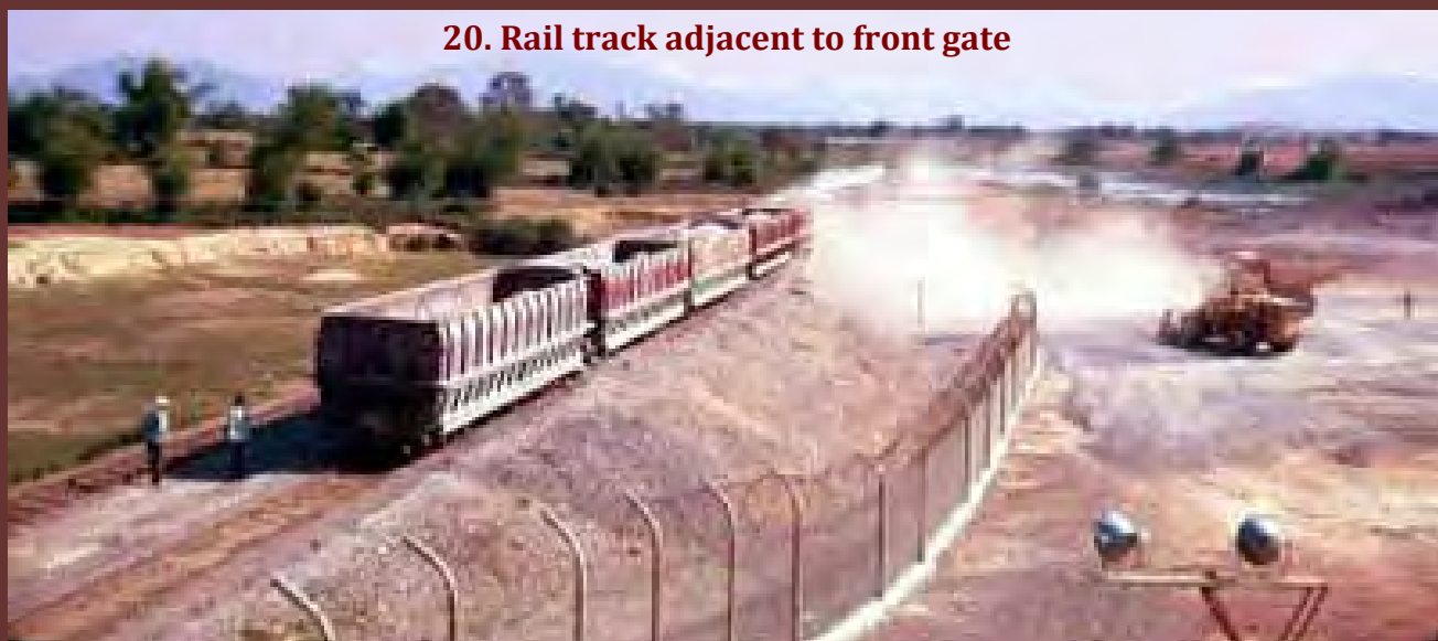
20. Rail track adjacent to front gate