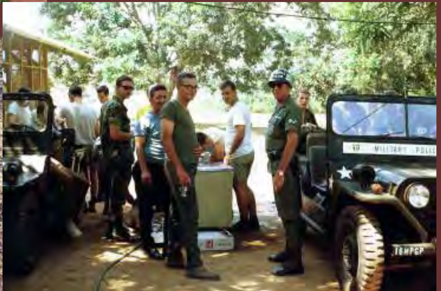
7. Red Horse recreation area (names