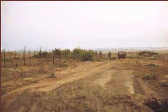
23. Sapper attack area March 1969.