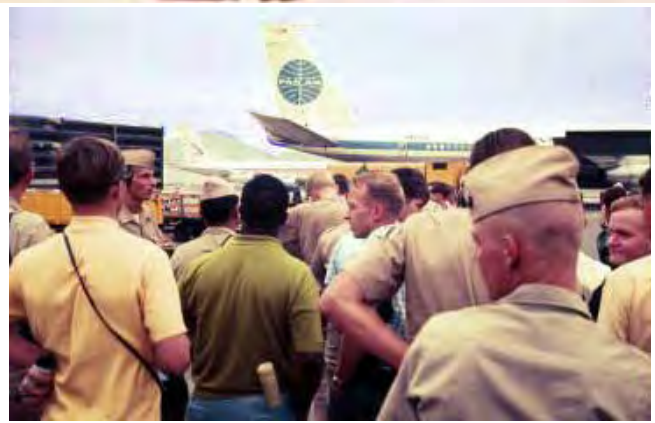
34. R&R Bound, Sydney Australia.