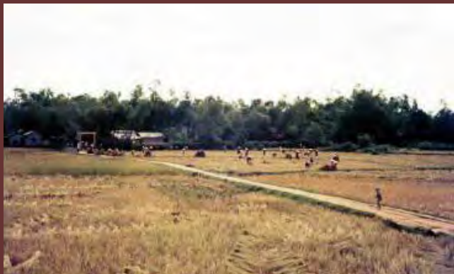
21. Farmers working the rice fields next to base