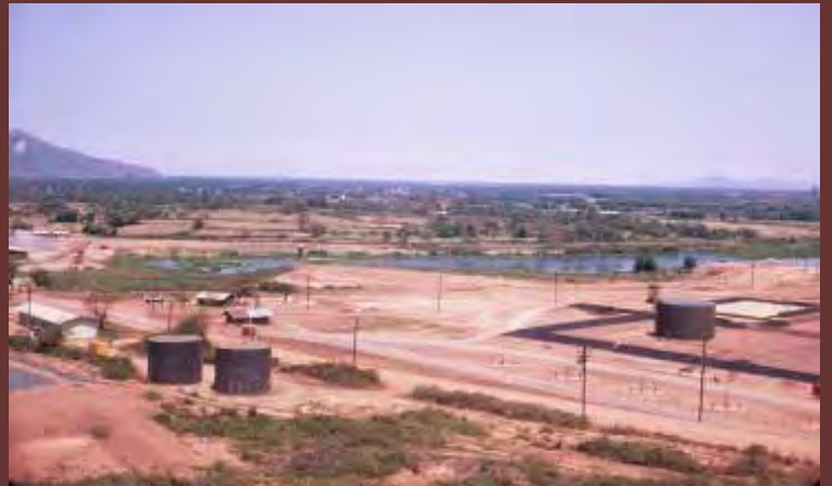
6. Fuel storage area