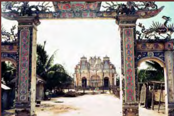
27. Buddhist temple near base.