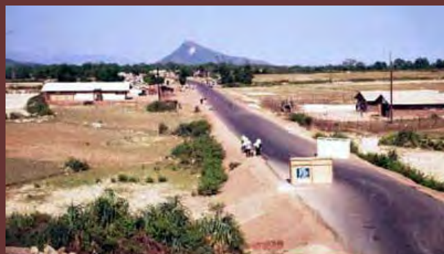
18. "The Strip" from front gate