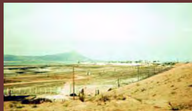
19. Perimeter area Phu Cat