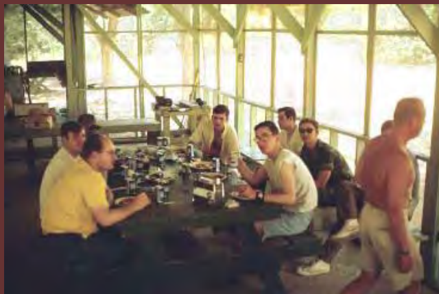
24. Recognize anyone