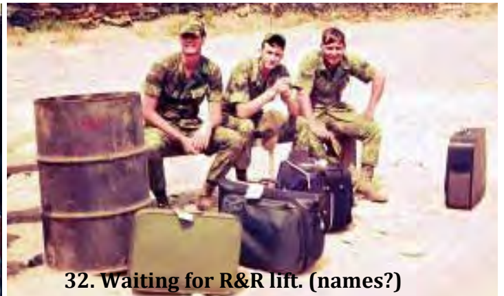
32. Waiting for R&R lift. (names?)