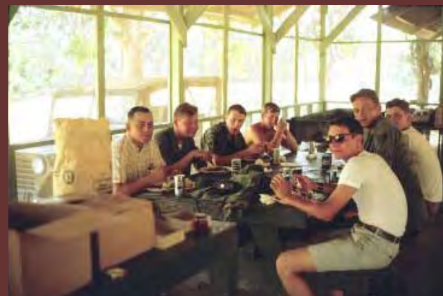
26. Anyone look famili