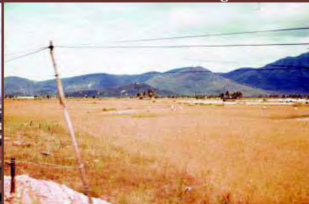
17. Rice paddy around perimeter