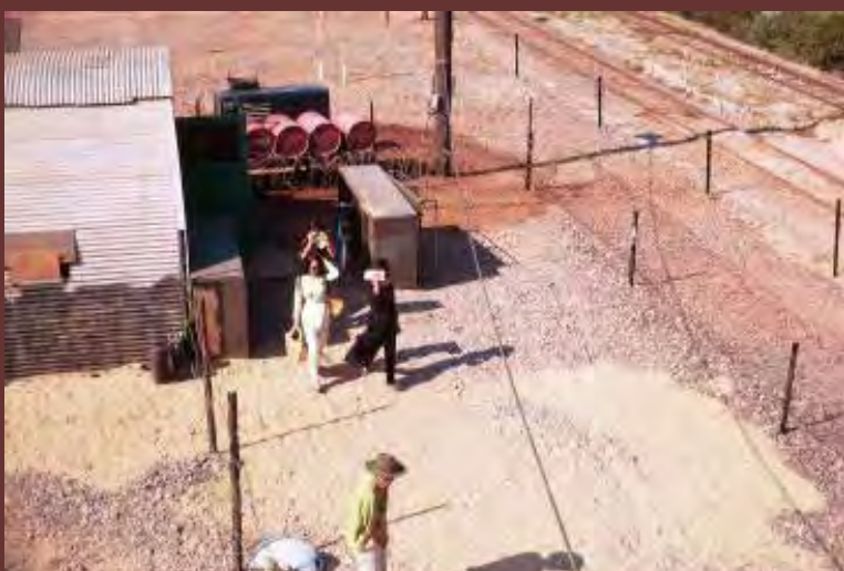
11. (above) Front gate mamasans leaving base.