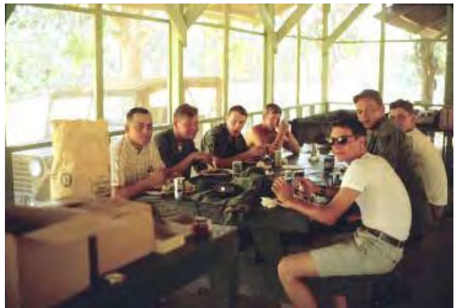
36. Anyone look familiar?