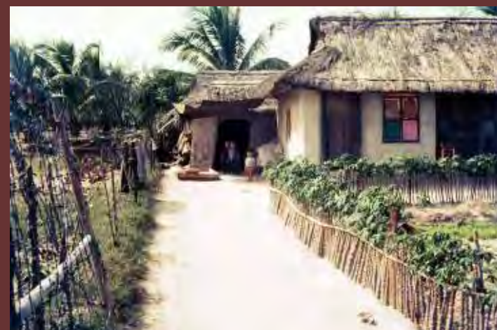
28. Vietnamese home along "The Stri