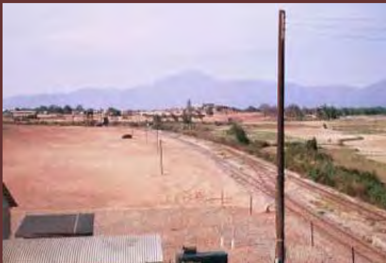
8. ROK camp adjacent to base.