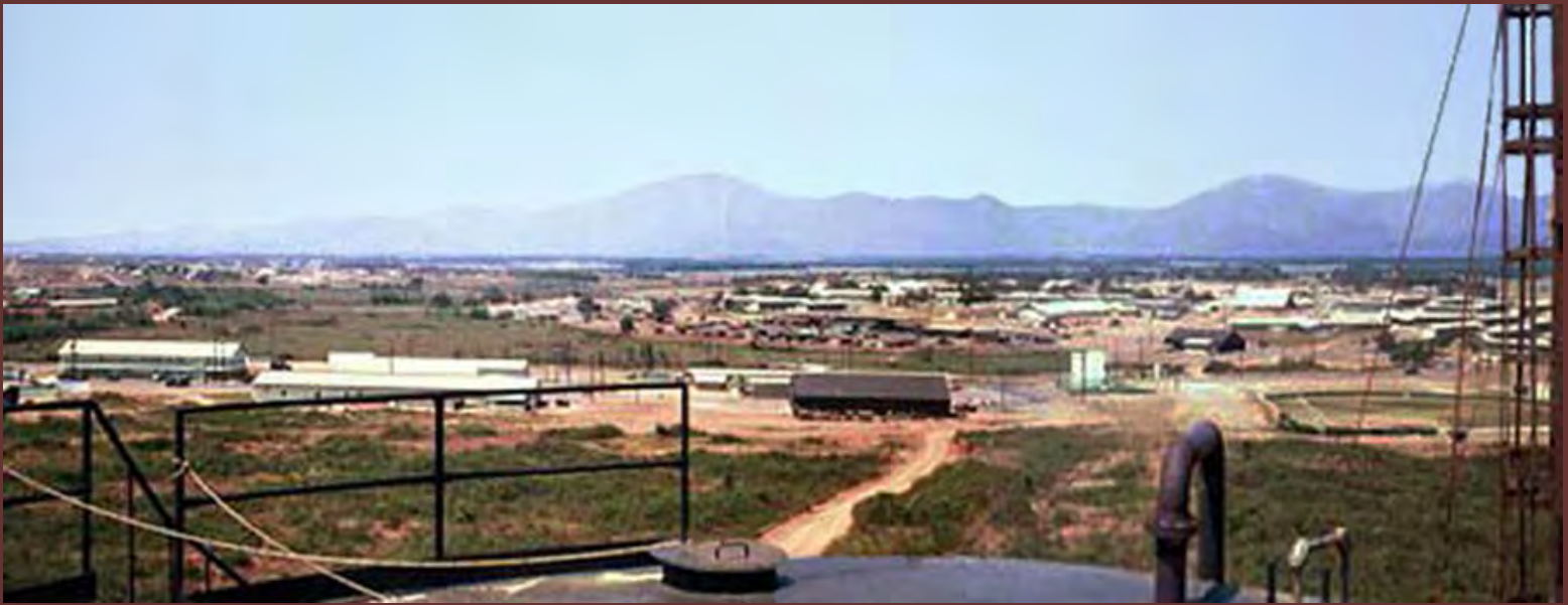
2. & 3. (composite) Phù Cát AFB (water tower post).