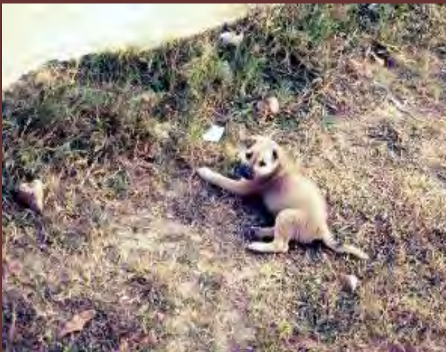
5. "Mac" Law enforcement mascot