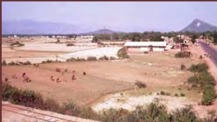
9. Front gate looking towards Hwy-1.