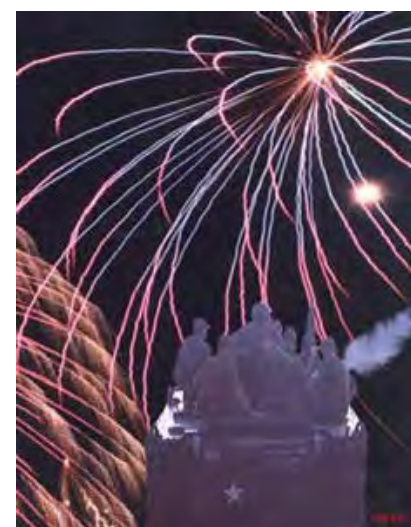
13. Phù Cát SPS composite combat art.