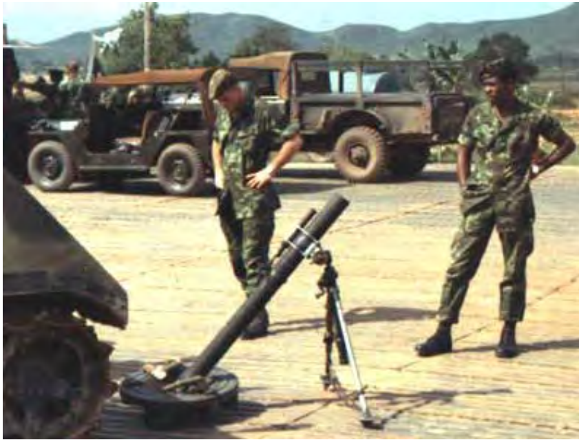
8. Phù Cát Cobra basecamp.