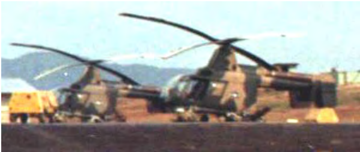
3. Phù Cát Search and Rescue, HH43 USAF helicopters.