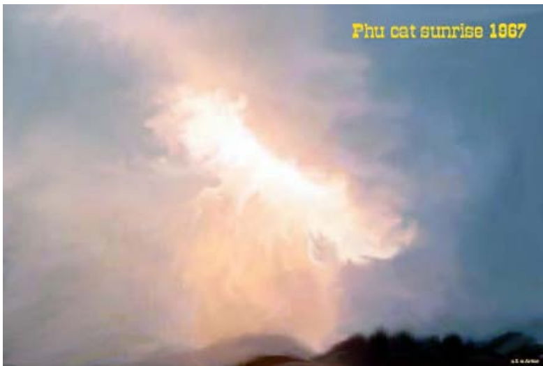
16. Phù Cát Sunrise 1967, taken from 37th SPS armory area.