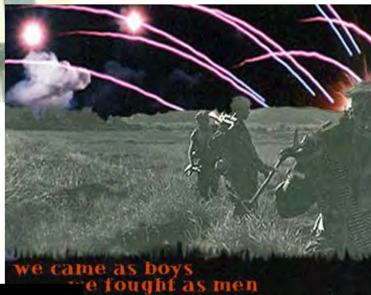
24. (below) Phù Cát Cobra Recon, 1967