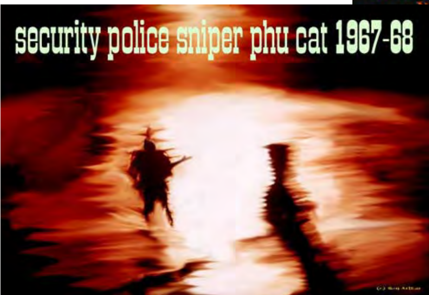
25. Cobra Flight Sniper - I took this photo late one night at Phù Cát from the balcony of the barracks, looking toward the armory. It shows a member of cobra flight heading out on ambush. The original photo was rather foggy but I cleaned it up as much as possible.