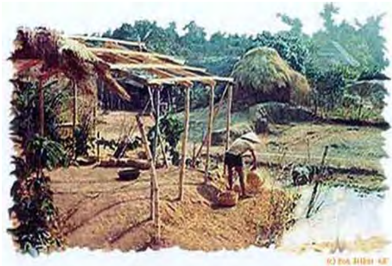
22. Local Villager building on to house - Phu Cat 1968: This photo started as the most used one I had . It had cracks tape marks and holes all over it. Incidentally it was taken from a "house" on the Phù Cát Strip, while waiting for some ROK Tiger Div. (troops tore up the house). The old man in the photo would go out and fill the two baskets and bring back to fill in the water hole.