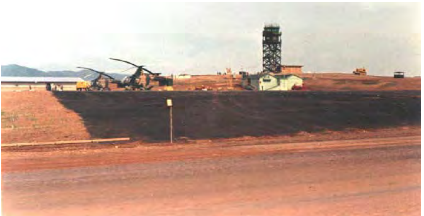
2. (Close up)