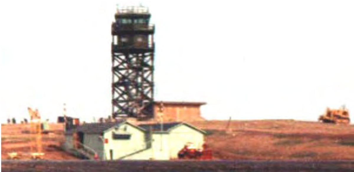
4. Phù Cát Flight Control Tower, USAF.