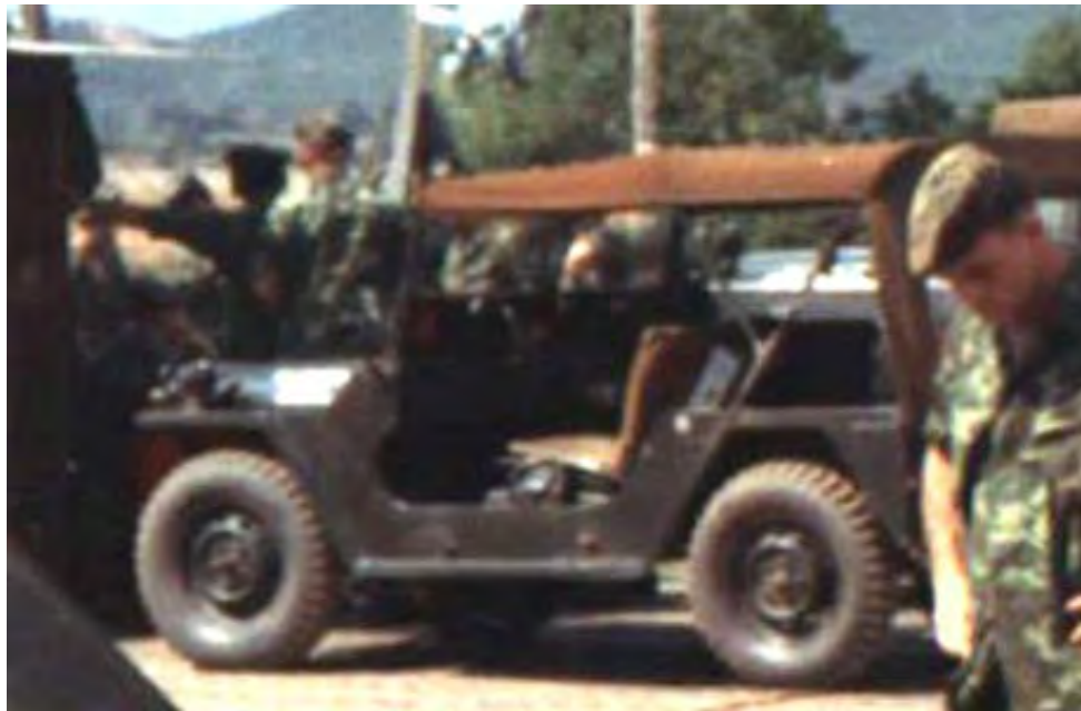
9. QRT Jeeps.