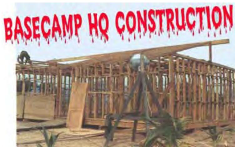
10. Phù Cát Cobra basecamp construction.