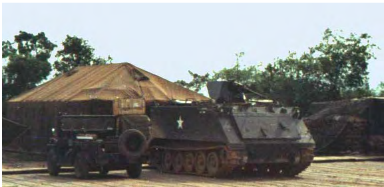
7. 37th SPS APC's and QRT's Locked and Loaded.