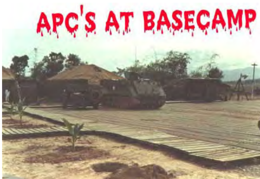
5. Phù Cát 37th SPS basecamp APC's at the ready. Foreground, "Phù Cát AB Beautiful" campaign.