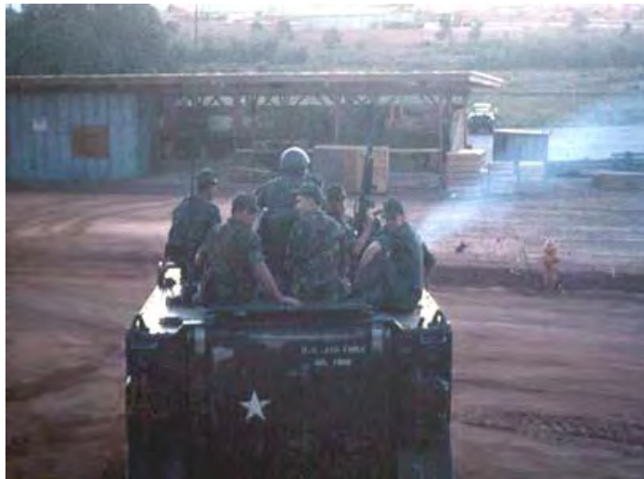
15. Charlie Eleven members leaving Armory area for night ambush outside the wire. Also on board relief for Rook Towers. Cobra Flight set up blocking force beyond K-9 handlers in defense of Phù Cát Air Base.