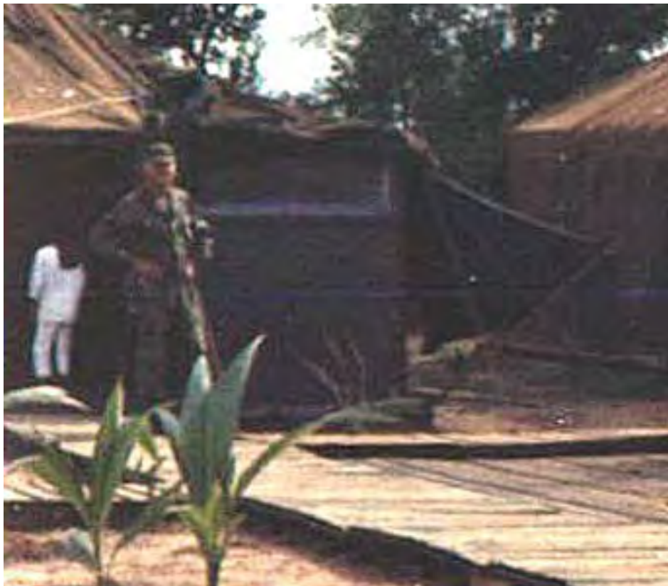
6. What's that Airman doin' with a camera instead of plantin' them there plants?