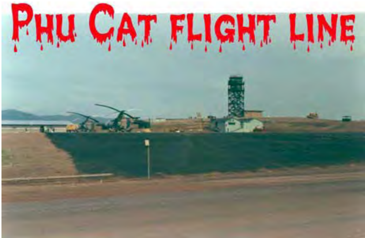
1. Phù Cát Air Base, flight line.