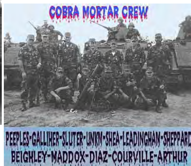
20. Mortar crew Cobra Flight, Phù Cát 1967.