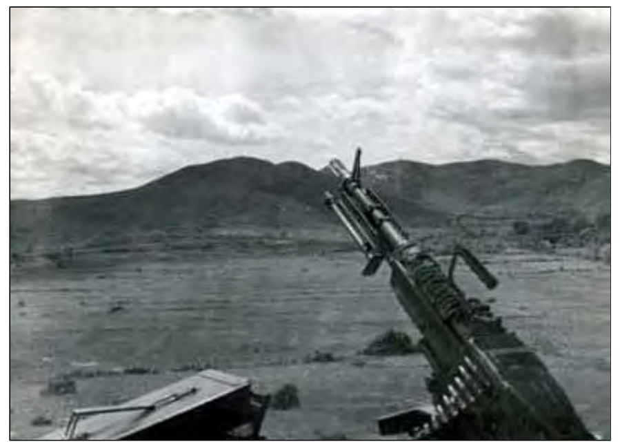
M60 Gun Tower overlooking K-9 Posts. The Hill, in the background, had a hilltop observation post manned by SP's.