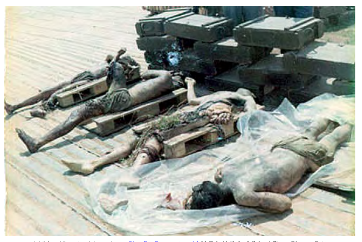
Killed In Action: Four (4) Viet Cong

Additional Restricted Area photos: Phu Cat Sapper Attack! 22 Feb 1969, by Michael Sipes (Photos: RA)