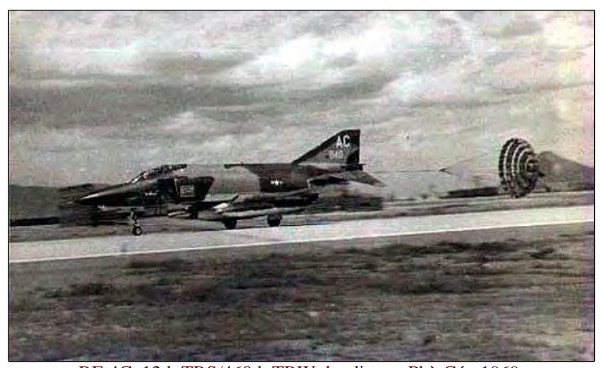
RF-4C, 12th TRS/460th TRW, landing at Phù Cát, 1969.