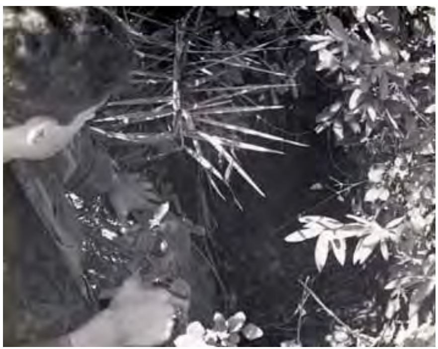
K-9 handler Vince DeGuilio (dog King, out of sight) looks into a Viet Cong tunnel found on post.

Phu Cat AB was attacked several times in 1969, by Stand Off rockets & mortars, and by Sappers. The sapper attack of February 22, 1969 was defeated and failed to damage or destroy any US or RVN Aircraft. Here are two photos, taken the morning after a sapper attack, of captured VC weapons: