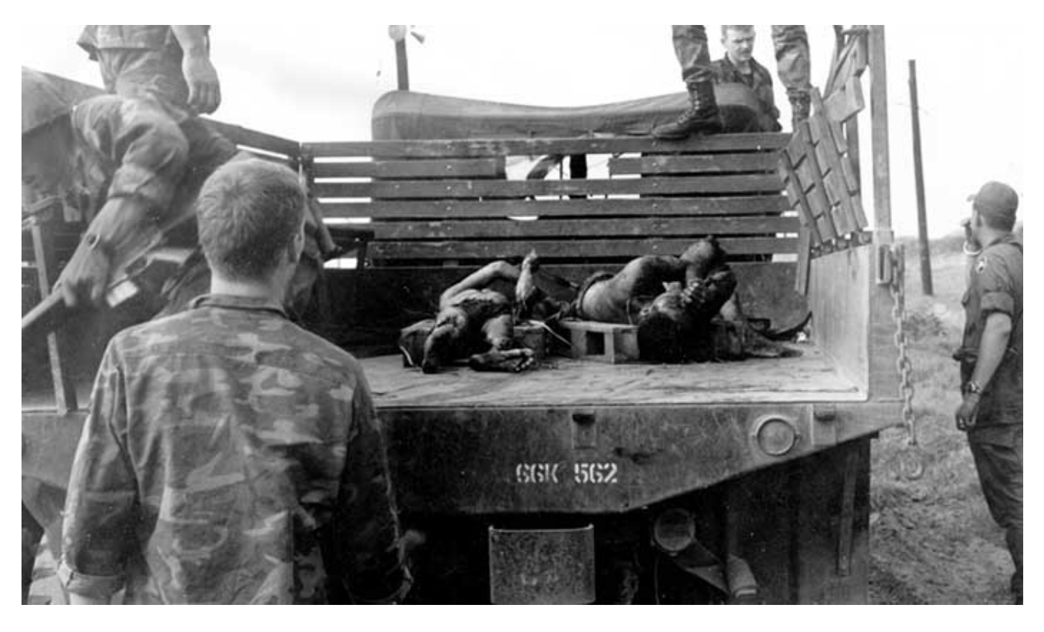
Photo above, and closeup below SP Truck being loaded with KIA Viet Cong bodies. Concrete blocks are used to keep rigor mortis bodies in place as vehicle moves.