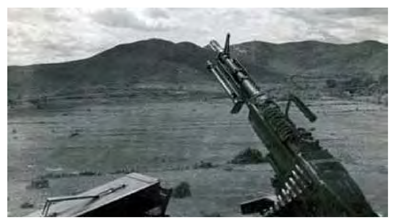
(above) Phan Rang AB perimeter fields, as seen from SP Towers with M60 machineguns.

(below) Recovered Viet Cong weapons, explosives, and equipment. One of the other recon groups uncovered a large cache of weapons and the clothing left behind as the sapper team disrobed to leave behind as much human scent as possible. Of interest is that undergarments of at least two women were found in the clothing pile. By the clothing count, projections were that the sapper team was about strong.