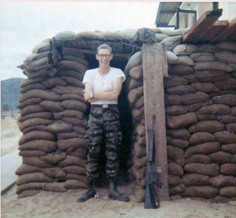
13. Nha Trang AB. Bunker.