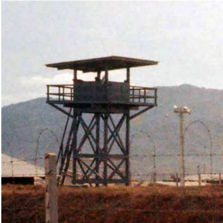
4. Nha Trang AB, K-9. View from above Tower.

Photo by Joe Russo, NT, 14th SPS; PR, 35th SPS K9: Prince 522M. 1969-1971.