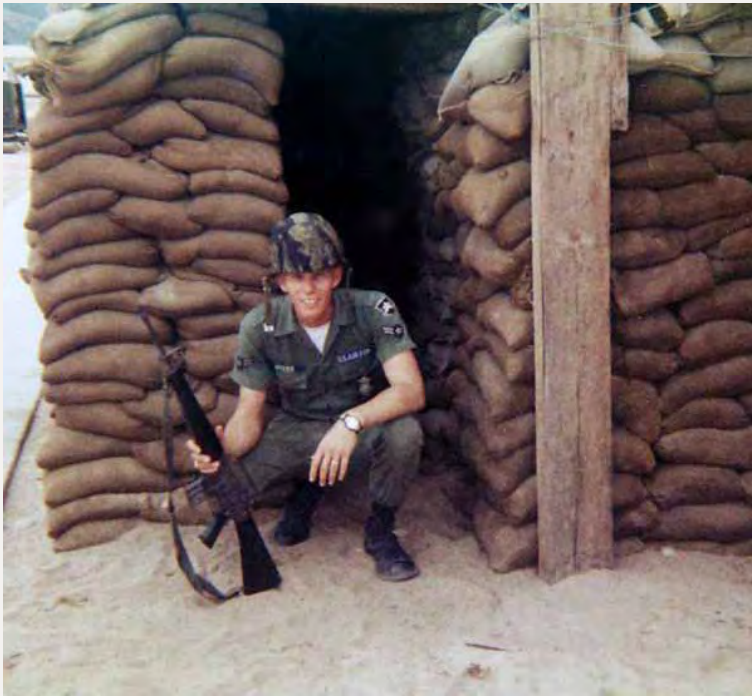
11. Nha Trang AB. Bunker. 1965-1966.