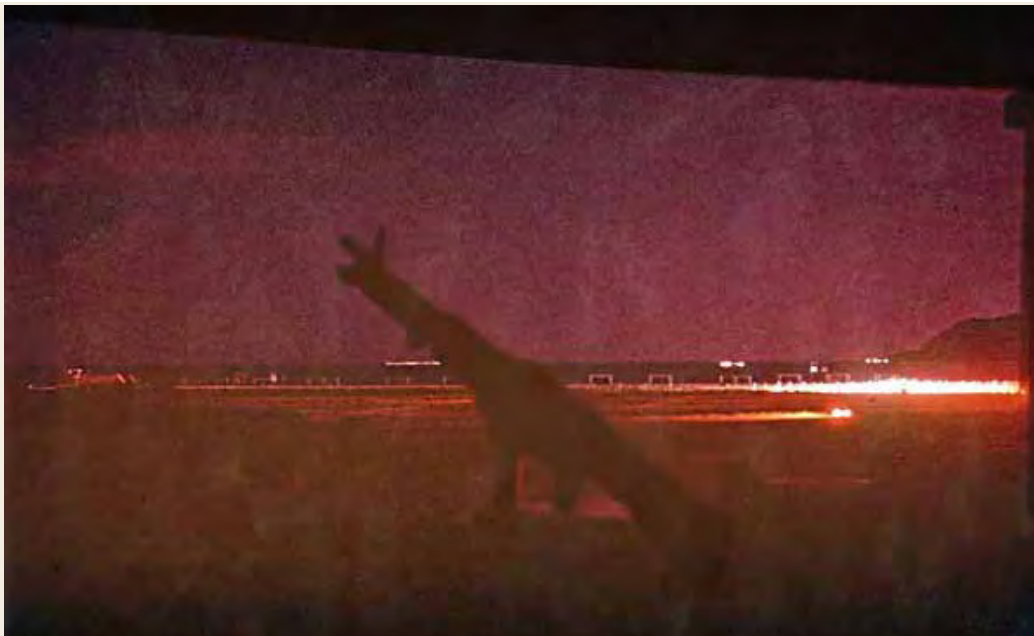
7. Nha Trang AB. View from Tower-320. 1969-1970.