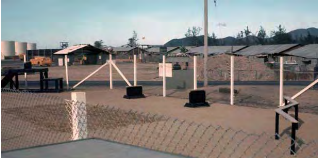
1. Nha Trang AB, K-9. Gate Post (center). Note Tower (center left). PR, 35th SPS K9: Prince 522M. 1969-1971.