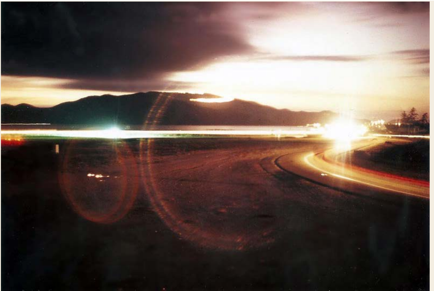
9. Nha Trang AB. Dawn View from Tower-320 (timed-exposure photo). 1969-1970.