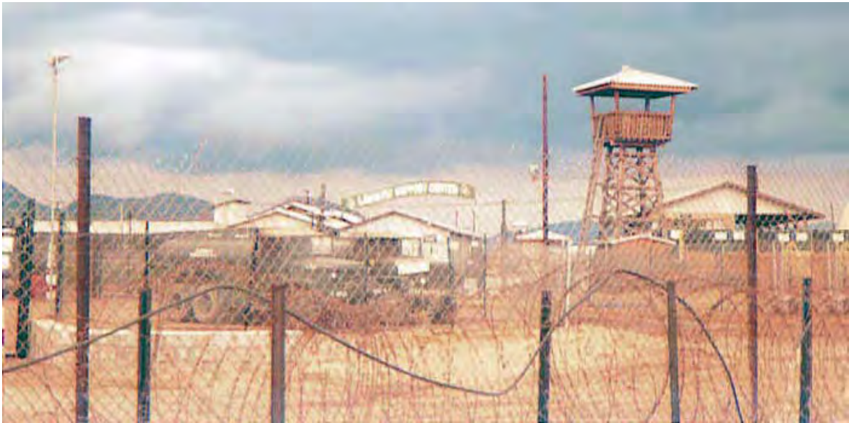
18. Nha Trang AB. Tower near Green Beret Camp. 1969.