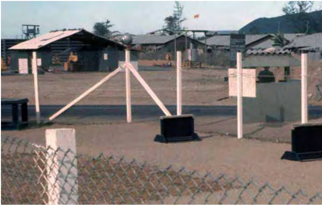
3. Nha Trang AB, K-9. Close Up of Tower.

Photo by Joe Russo, NT, 14th SPS; PR, 35th SPS K9: Prince 522M. 1969-1971.