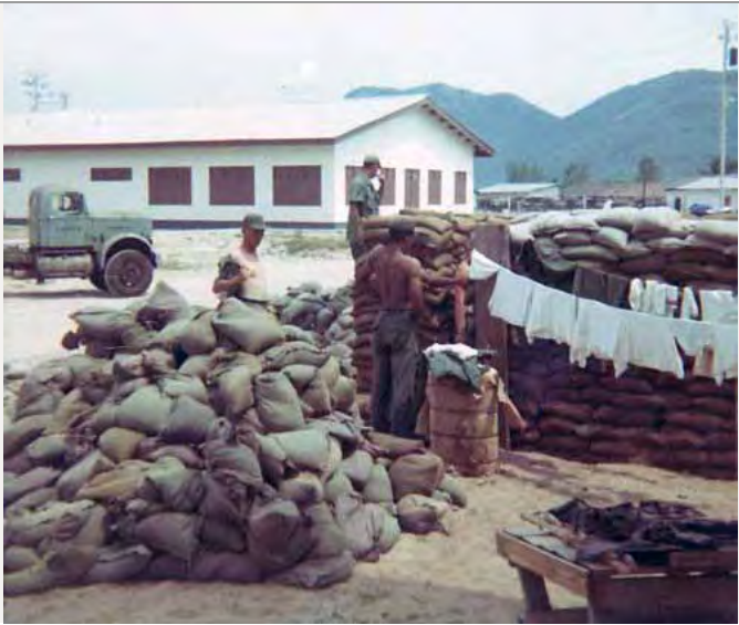
15. Nha Trang AB. 6253rd APS Bunker... and wannabe-bunker-pile.