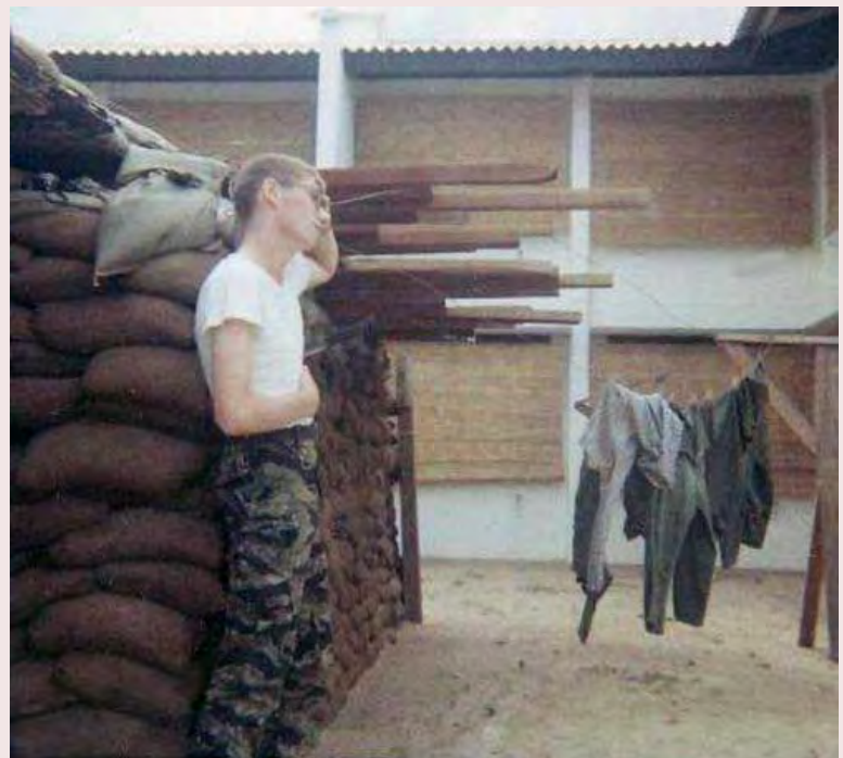
14. Nha Trang AB. Bunker.