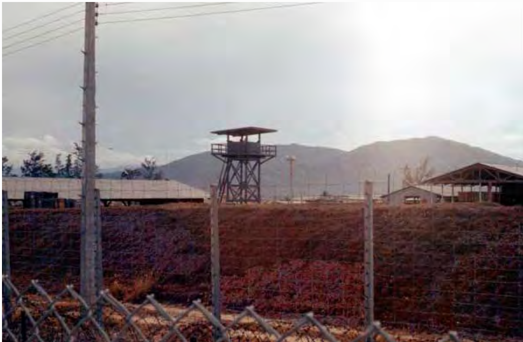
2. Nha Trang AB, K-9. Close Up: Tower. Note SP on the parapet. K9: Prince 522M. 1969-1971.