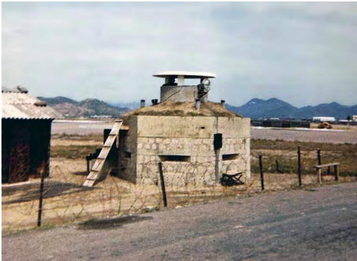
17. Nha Trang AB. 14th SPS, old French Bunker. 1969.

Photo by Joe Russo, NT, 14th SPS; PR, 35th SPS K9: Prince 522M. 1969-1971.