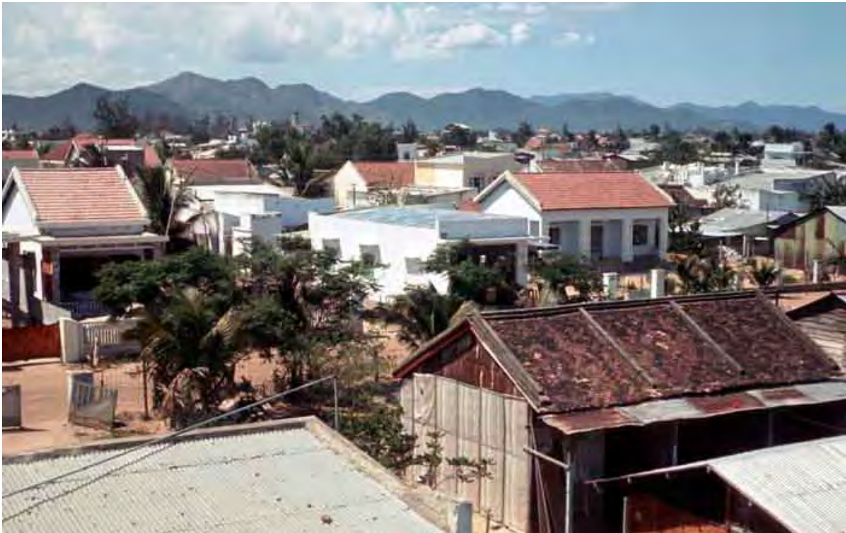
5. Nha Trang AB, K-9. View from above Tower.

Photo by Joe Russo, NT, 14th SPS; PR, 35th SPS K9: Prince 522M. 1969-1971.