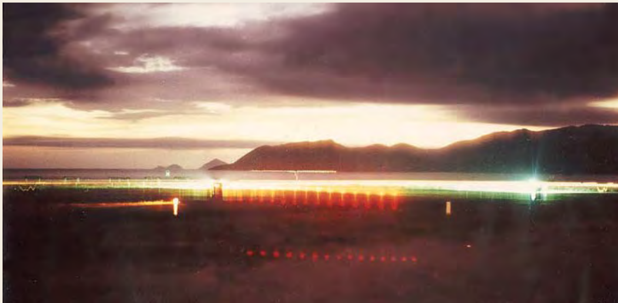
8. Nha Trang AB. Dawn View from Tower-320 (timed-exposure photo). 1969-1970.