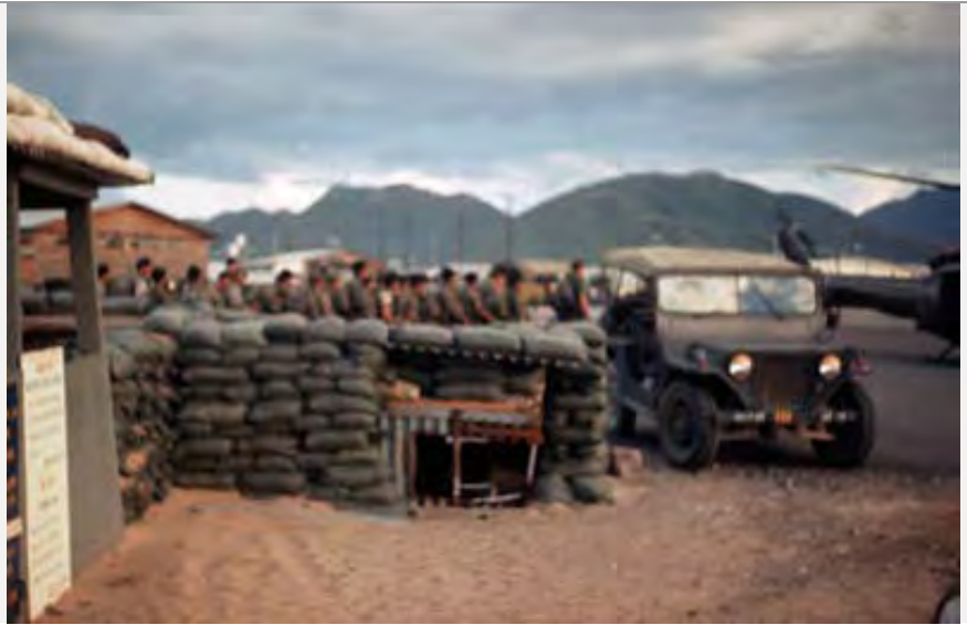
16. Nha Trang AB, Bunker.