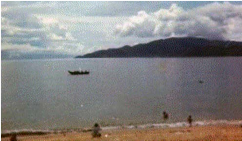
9. Nha Trang AB: Hon Tri Island.