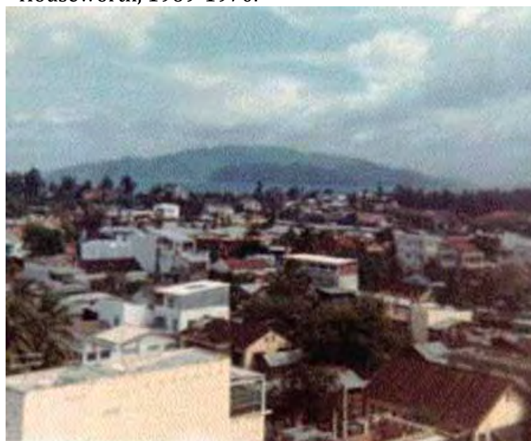
8. Nha Trang AB: City.