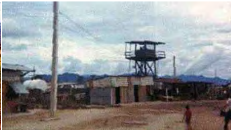
6. Nha Trang AB: POL Tower.