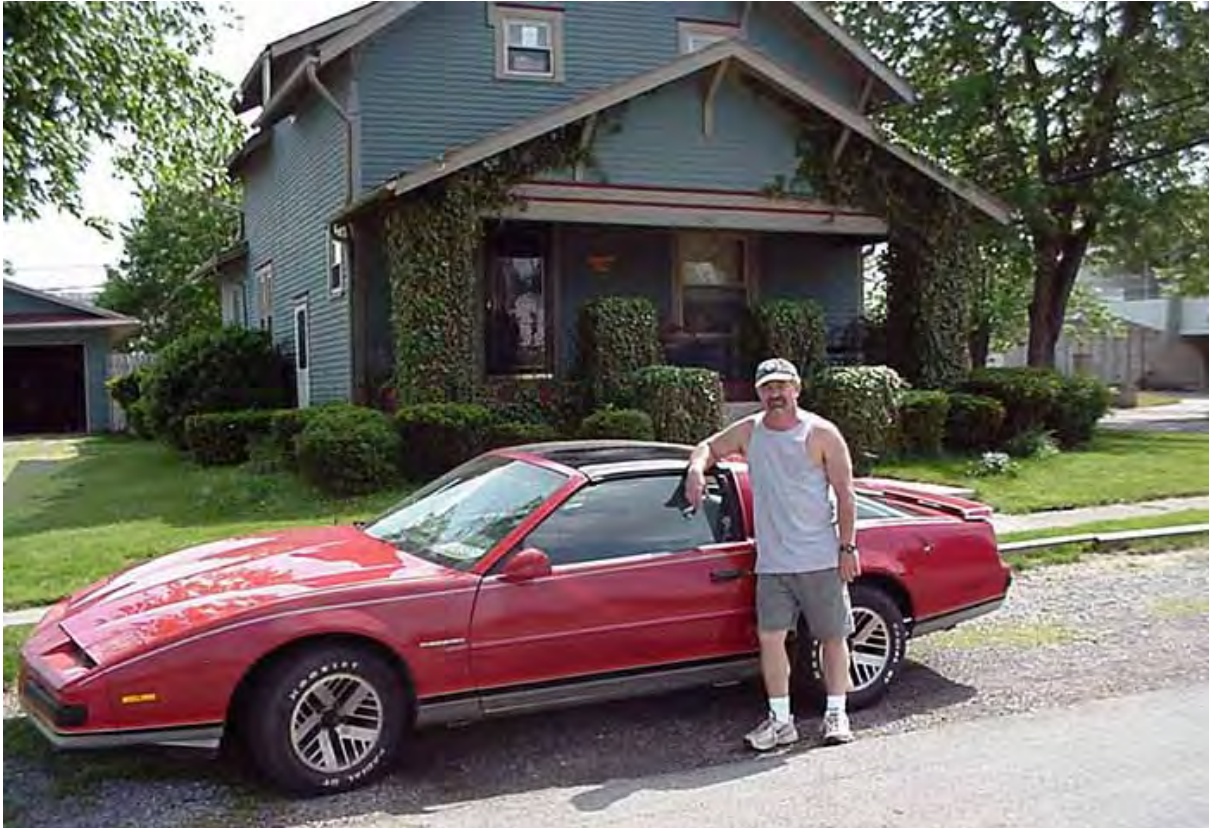
12. Nha Trang AB: 30 years later.