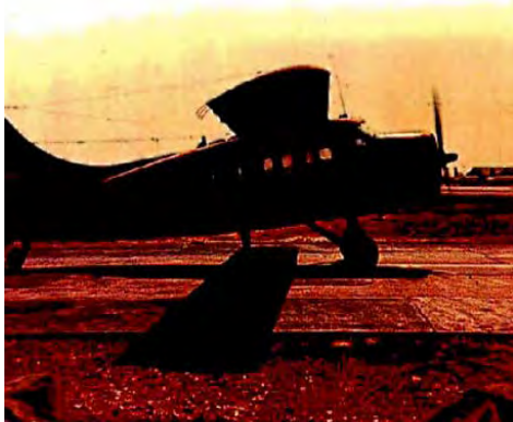
Photo, Birddog - 1969

Life, and the war, moved on and I was on my way from Tan Son Nhut Air Base to a base called Nha Trang. Earlier, I had snapped this photo of what I recall as a "Birddog" aircraft taking off from TSN sometime between 8/67--8/68. As best I recall, the Birddogs scouted for enemy locations and communicated their whereabouts to tactical units, air and ground types. We used to receive BDA (battle damage assessment) reports from AF tactical fighters and relay them to 7th