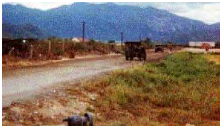
5. Nha Trang AB: Camp Mac.