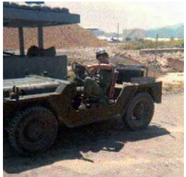
3. Nha Trang AB: SP Law Enforcement Jeep.