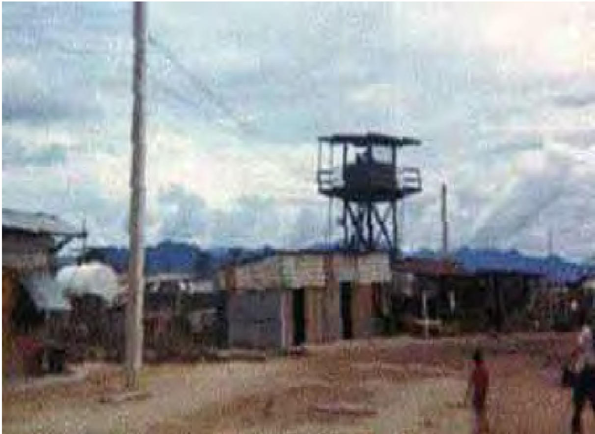
11. Nha Trang AB: French built Bunker.