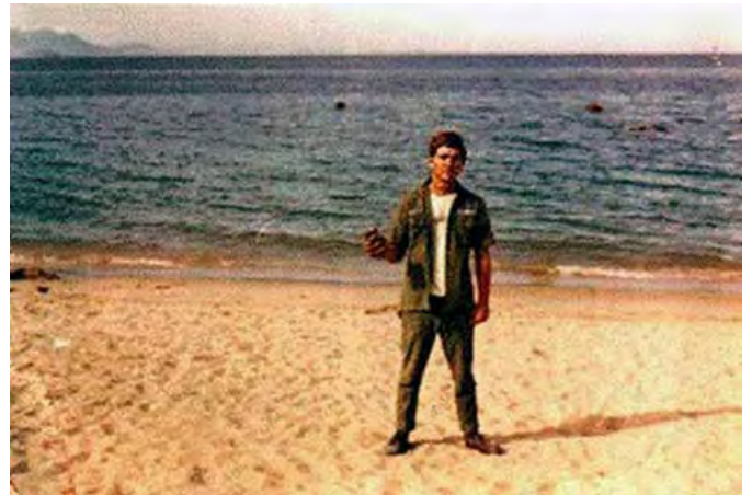
10. Nha Trang AB: Beach.