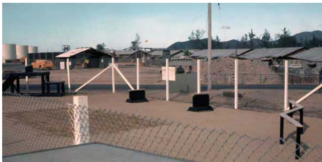
8. Nha Trang AB, K-9. Gate Post (center). Note Tower (center left). 1969.