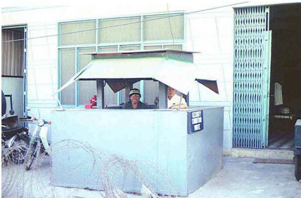
21. Nha Trang AB. Hotel post. Chinese Nung Guards. nt-anthony-niemotka-1-hotel-post-chinese nung-guard-1968-1969.jpg