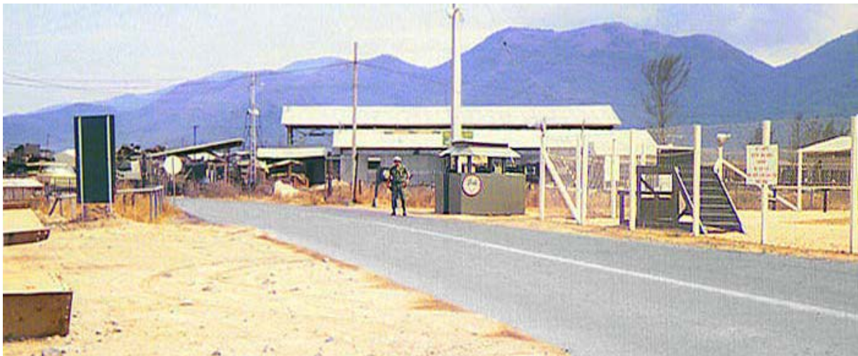
16. Nha Trang AB Gate Post-4, by K-9 Training (note stairs inside fence).