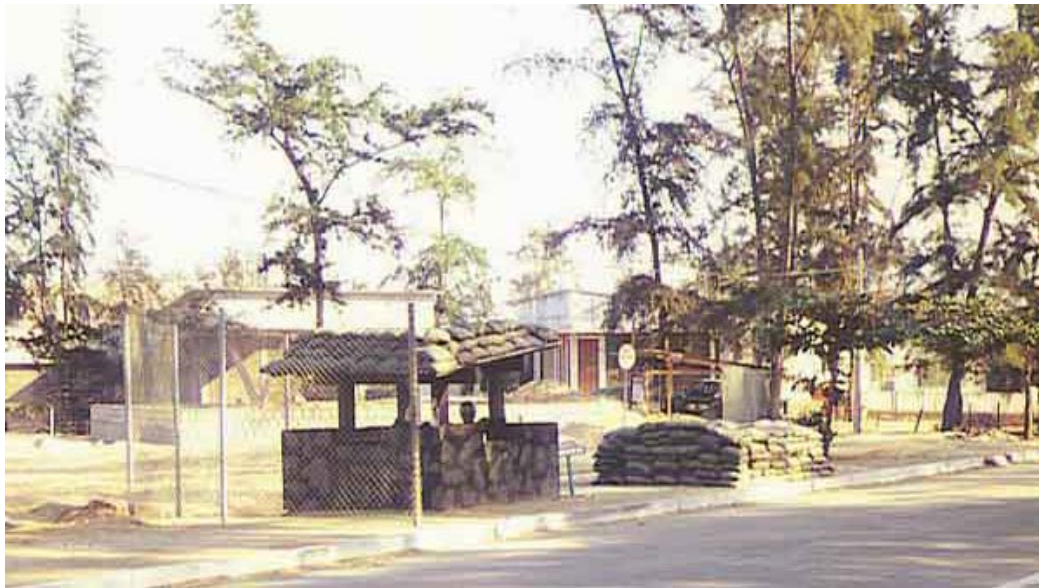
11a. Nha Trang AB, Gate Post-1. Entrance for a hospital for our injured Americans.