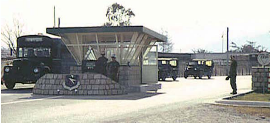
10b. Nha Trang AB Main Gate, Close Up.