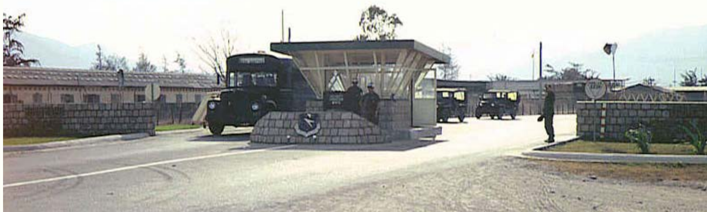
10a. Nha Trang AB Main Gate.