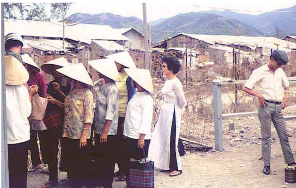
14. Nha Trang AB Gate Post-4. Entry/Exit for Civilian Vietnamese workers. Women go thru the shack and are searched by a Chinese female.