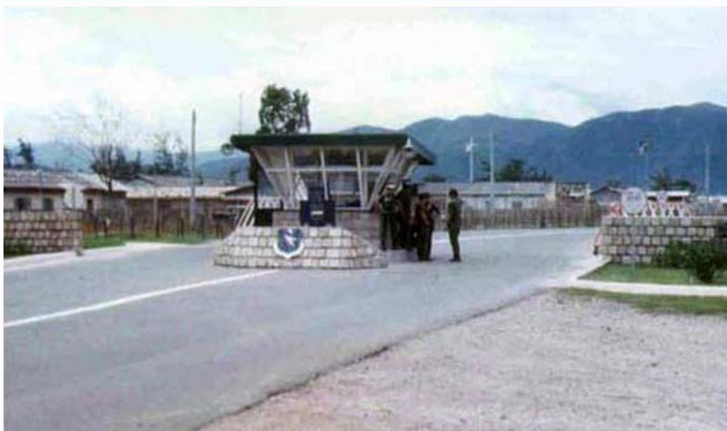
1. Nha Trang AB, Main Gate. 1969.