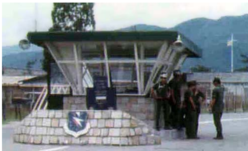
2. Nha Trang AB, Main Gate. 1969.