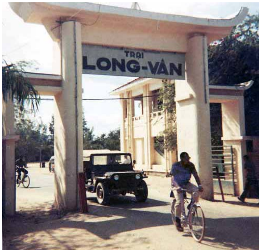
7. Nha Trang AB, Civilian Gate. Trai Long-Van. 1965.