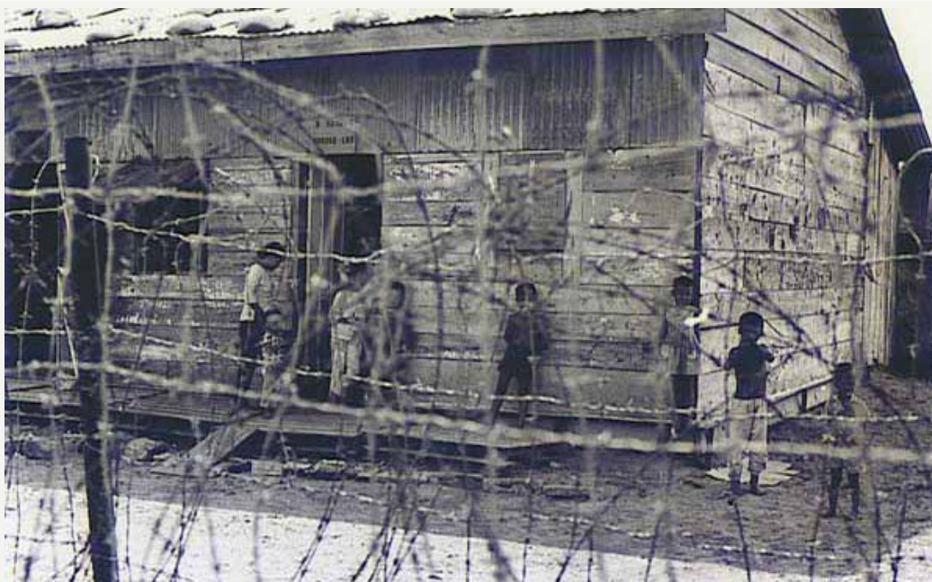
18. Nha Trang AB Gate Post-4. View from Post-4. Mamasan shewing kids inside.