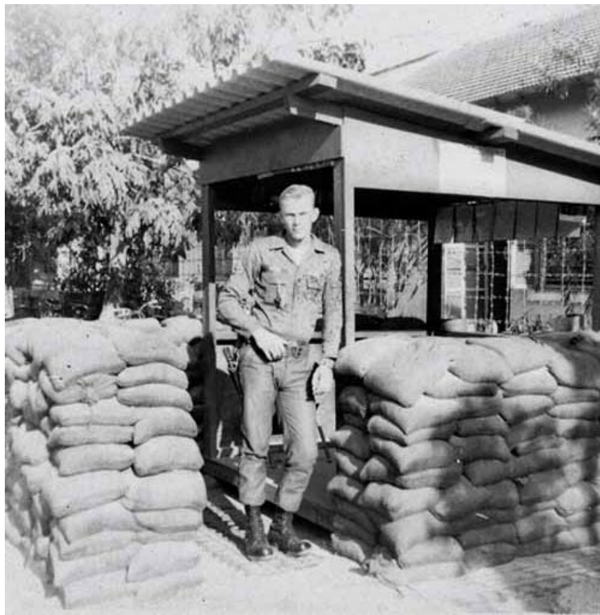
5. Nha Trang AB, Gate Post. 1965.