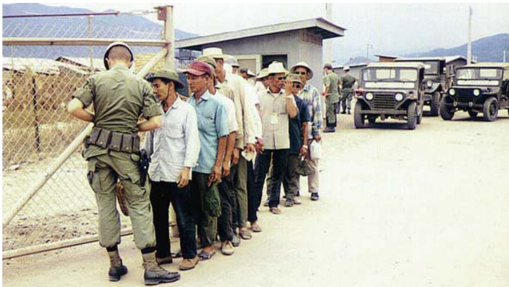
13. Nha Trang AB Gate Post-4. Civilian workers being screened.