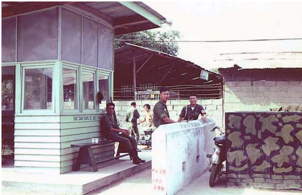
20. Nha Trang AB Gate Post-4. VNAF QC PV Gate Post-1.