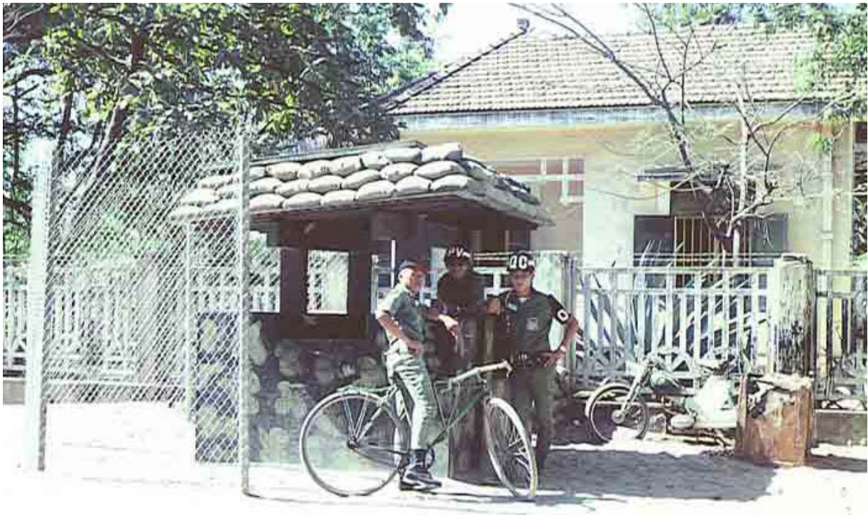
19. Nha Trang AB Gate Post-4. VNAF QC PV Gate Post-2.