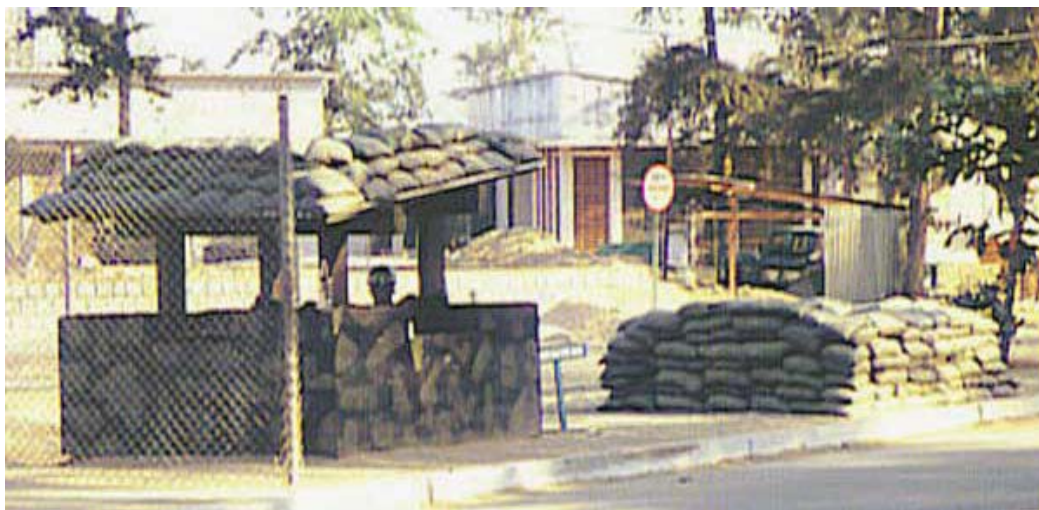
11b. Nha Trang AB Gate Post-1, Close Up.