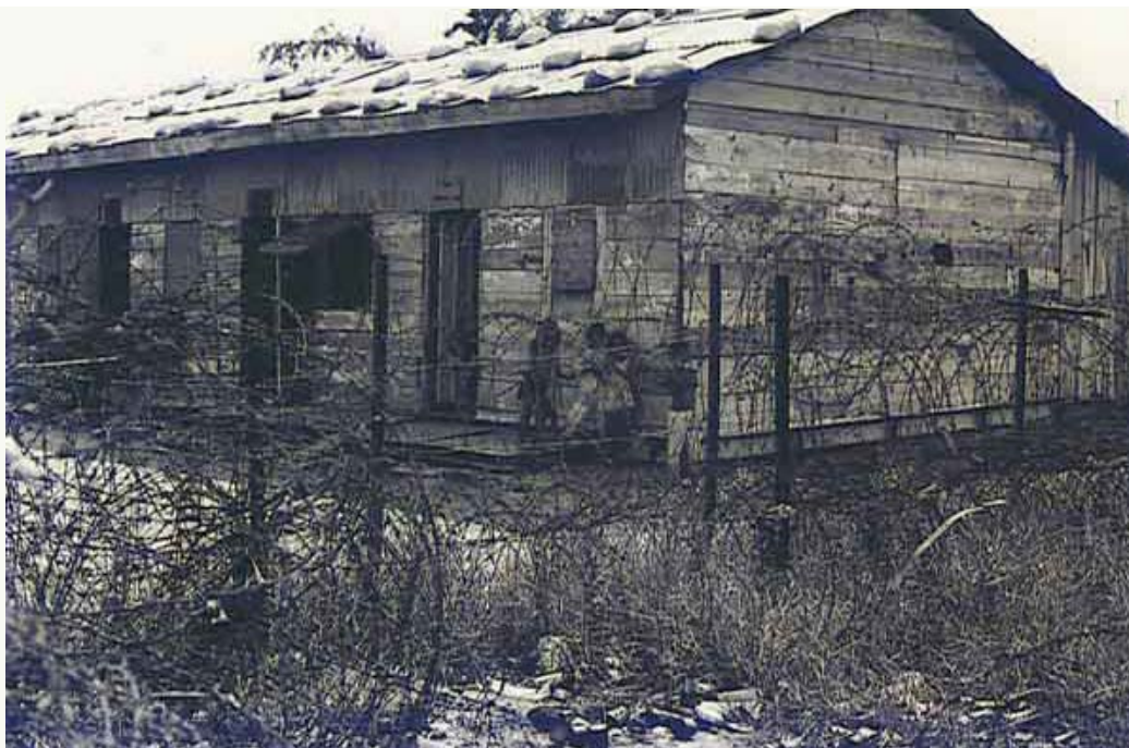
17. Nha Trang AB Gate Post-4. View of housing from Post-4. Kids playing on porch.