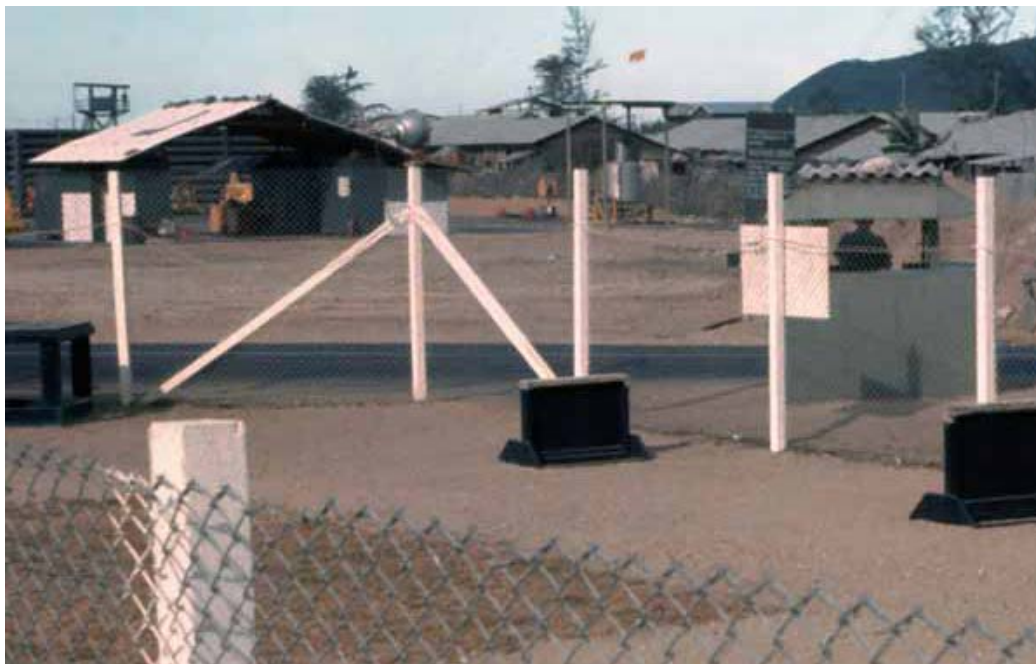
9. Nha Trang AB, K-9. Close Up: Gate Post (center). Note Tower (center left). You can see the SP on the parapet. 1969.