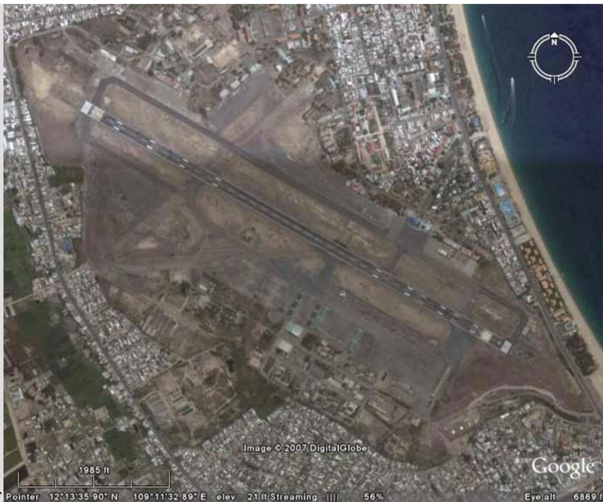
• Satellite of imaged Fly Over at 6,869 feet altitude. NT AB,