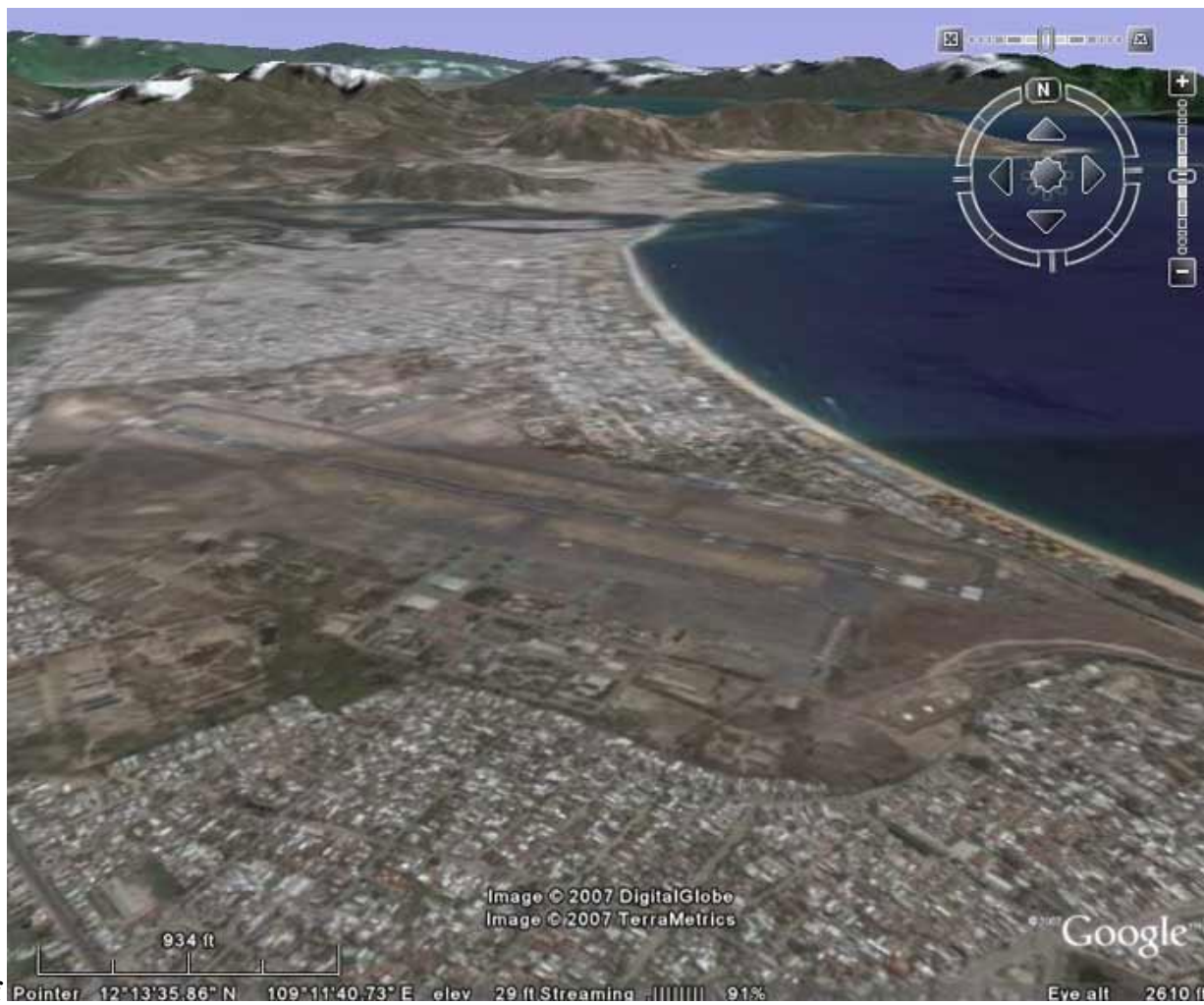
• Satellite of NT AB, imaged/angled North at 2610 feet altitude.