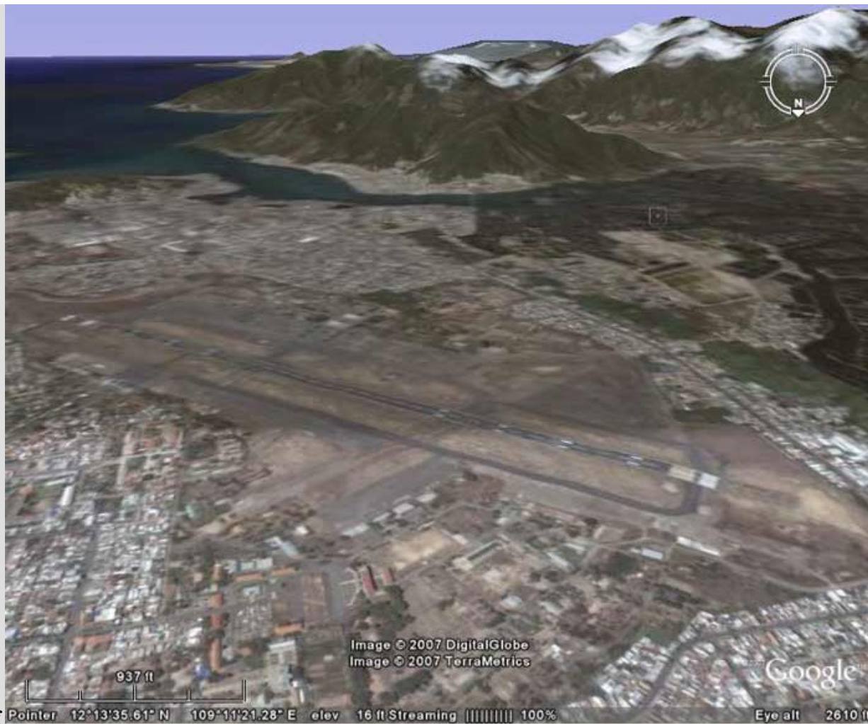
• Satellite of Pointer 12°13'35.61" N 109°11'21.28" E elev 16 ft Streaming ||||| 100% Eye alt 2610 ft NT AB, imaged/angled South at 2,610 feet altitude.