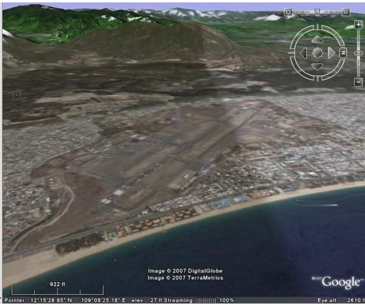
• Satellite of NT AB, imaged/angled West at 2,610 feet altitude.