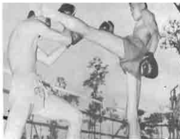
THAI BOXING-BASE AMPHITHEATER

The base library is one of the best field libraries in Southeast Asia, with more than 12,000 volumes including fiction, non-fiction, biographies and reference books. The library subscribes to the McNaughton book rental plan through which it gets many of the best sellers at about the same time they are available in United States. The selections available to base personnel are further increased through an inter-library loan system