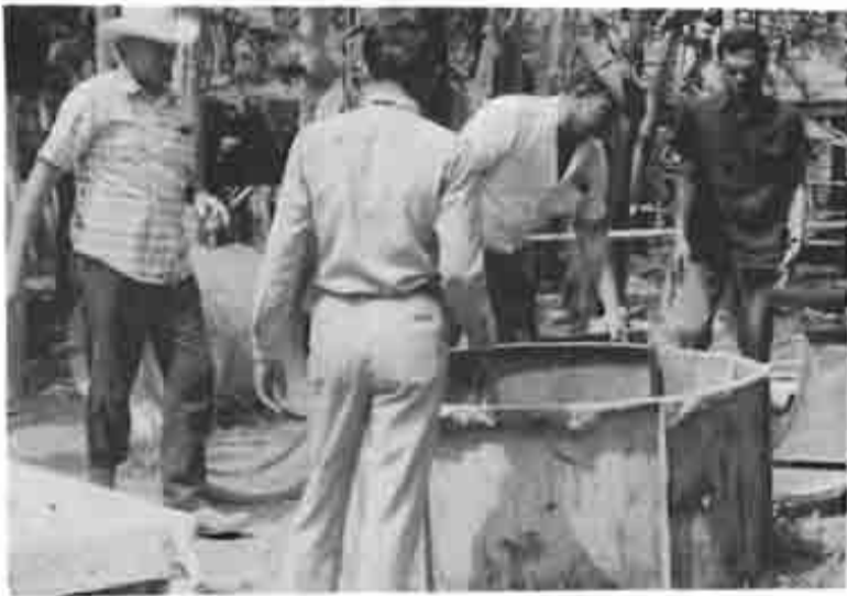
INSTALLING A WELL

but no train service is available. The roads leading to the city, both from Sakon Nakhon to the southwest and Ubon to the south, are mostly unpaved. Poor road conditions during some parts of the year often limit automobile driving to the city itself.