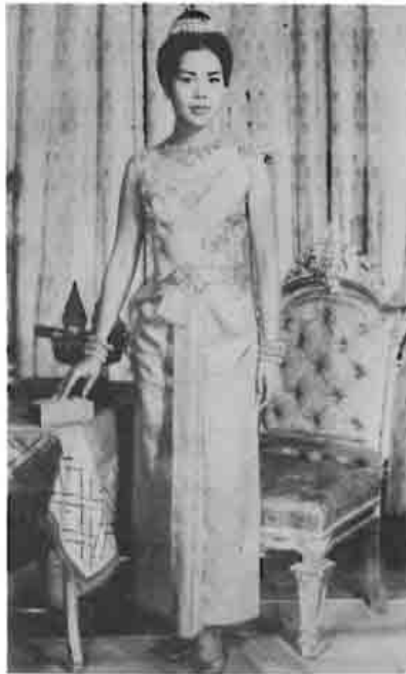
KING AND QUEEN OF THAILAND

Thailand is a country about the size of France and nearly as large as Texas, with a population of more than 30 million. The Royal Kingdom of Thailand is located on the Southeast Asian peninsula, bordered on the east by Cambodia, and Laos, on the west by Burma, on the north by Burma and Laos, and on the south by Malaysia and the Gulf of Thailand.