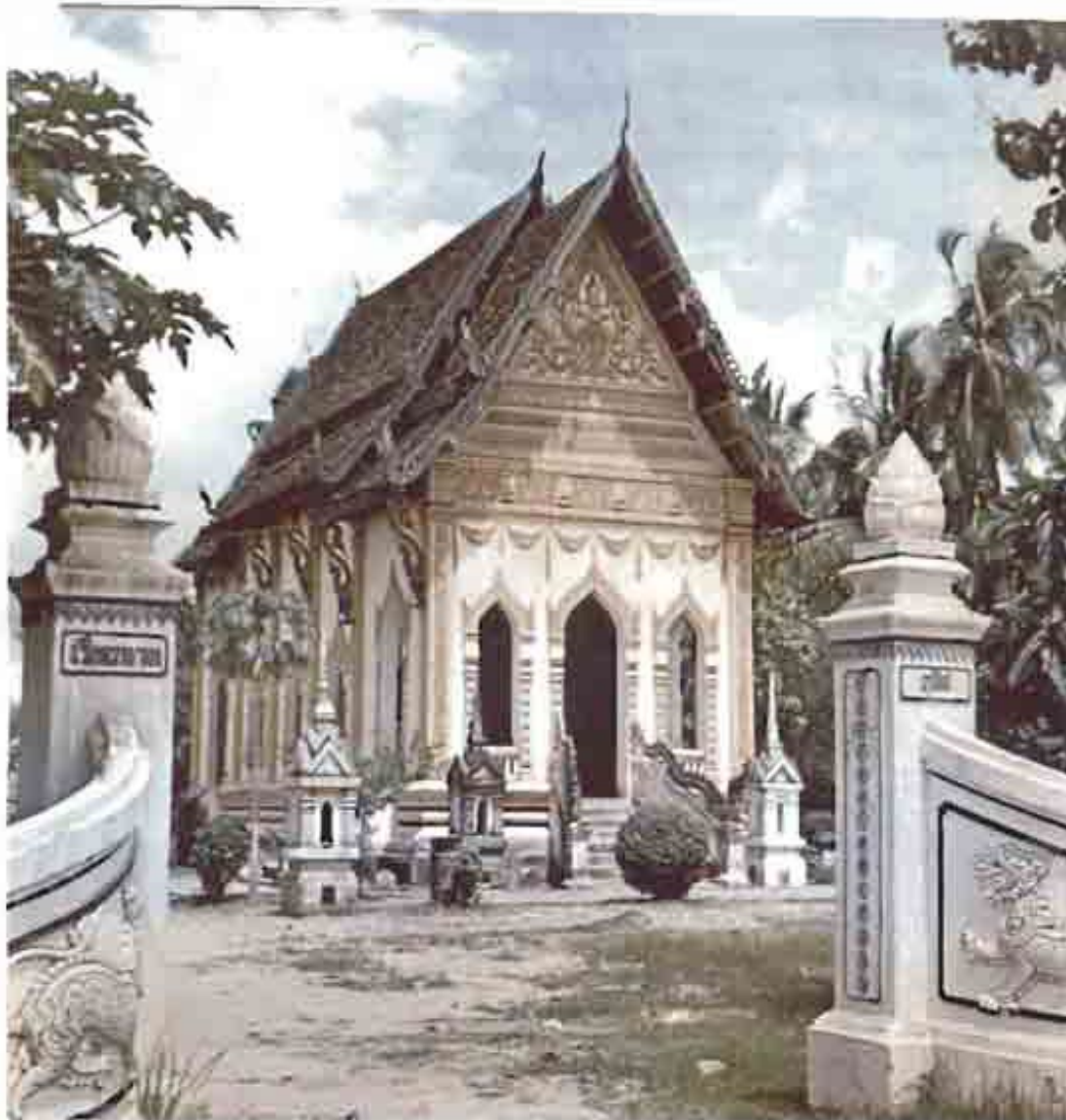
TEMPLE IN NAKHON PHANOM CITY