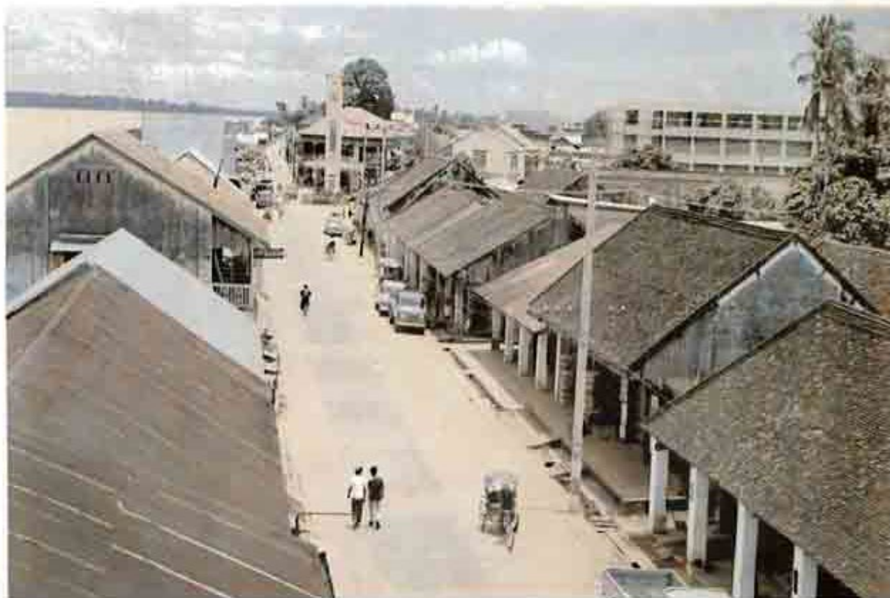
NAKHON PHANOM MAIN STREET

Thailand has been an independent country for hundreds of years, far longer than the U.S. It hasn't been the colony of any country, developing its own culture and heritage. The Thais are justly proud of this freedom.