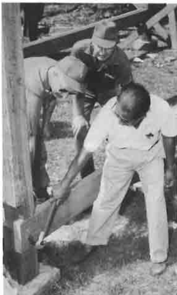
BUILDING A SCHOOL

Nakhon Phanom RTAFB is approximately nine miles southwest of the city. Several smaller villages are located between the town and base. Numerous