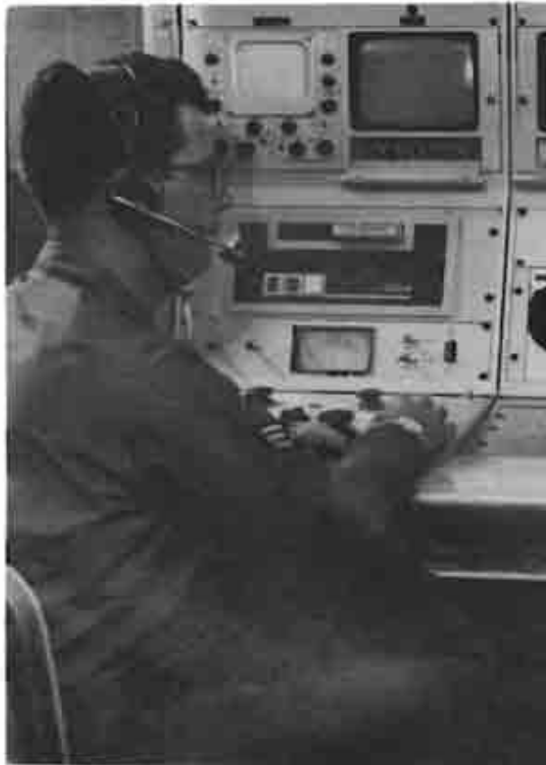
AFTN - CHANNEL 74

The local AFRTS television station went on the air for the first time on