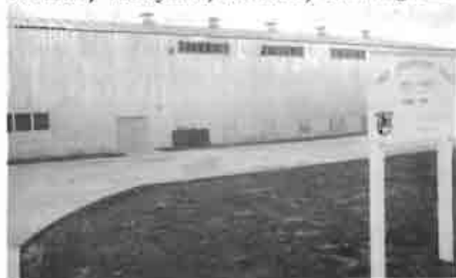
New Base Gym

Besides the varsity competition, there is a growing participation in intramural activities. These include softball, basketball, volleyball, bowling and touch football.