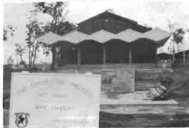
New Base Theater