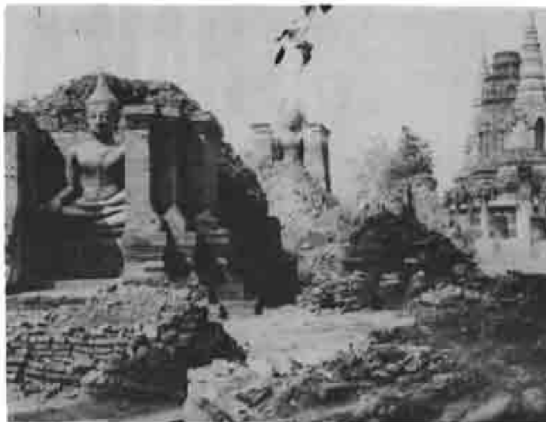
SUKO THAI RUINS

hospitable and very much interested in the western world. Many of the people speak English, and this is, for the most part, the "foreign" language taught in public schools.