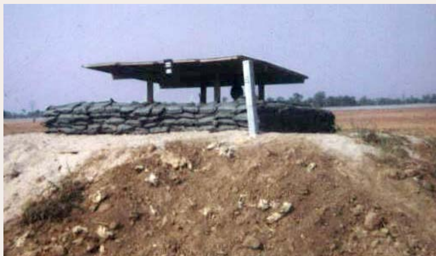
2c. NKP Perimeter Bunker.