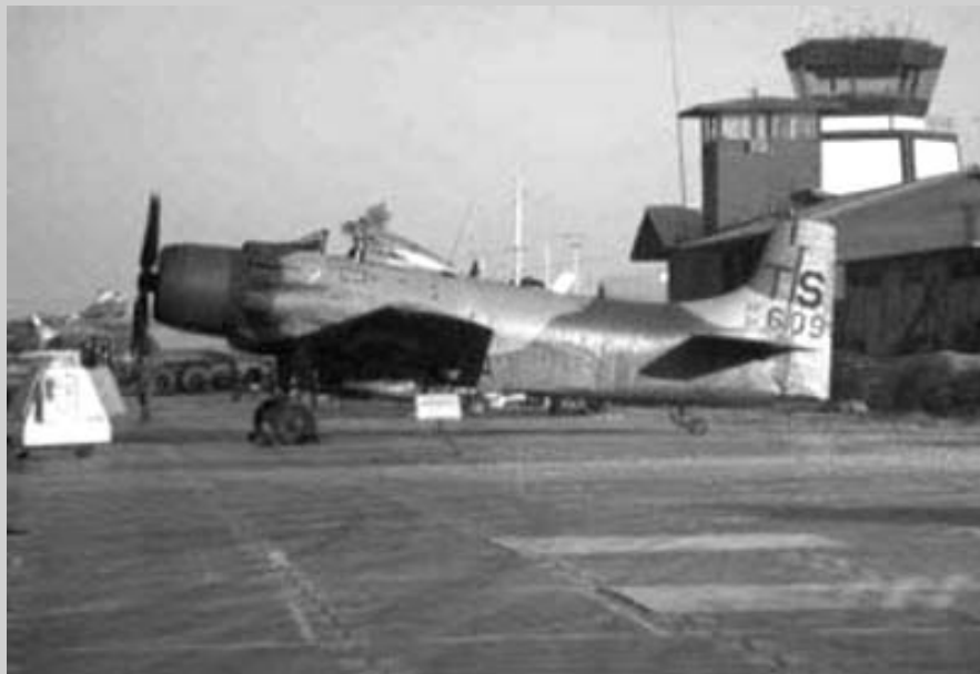
11. NKP Control Tower, above tail of parked A1E Spad.