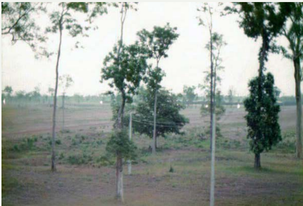
4. NKP Tower, Bravo-1, in Tango Baker section.

Tower is located on the north perimeter in Bravo sector, with view to the South.