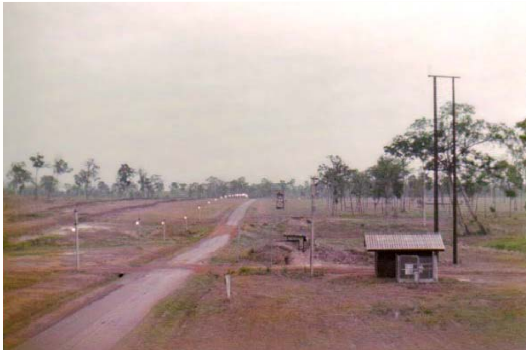
2a. NKP Tower, Bravo-1, in Tango Baker section. Tower is located on the north perimeter in Bravo sector, with view to the East. 1974-1975.