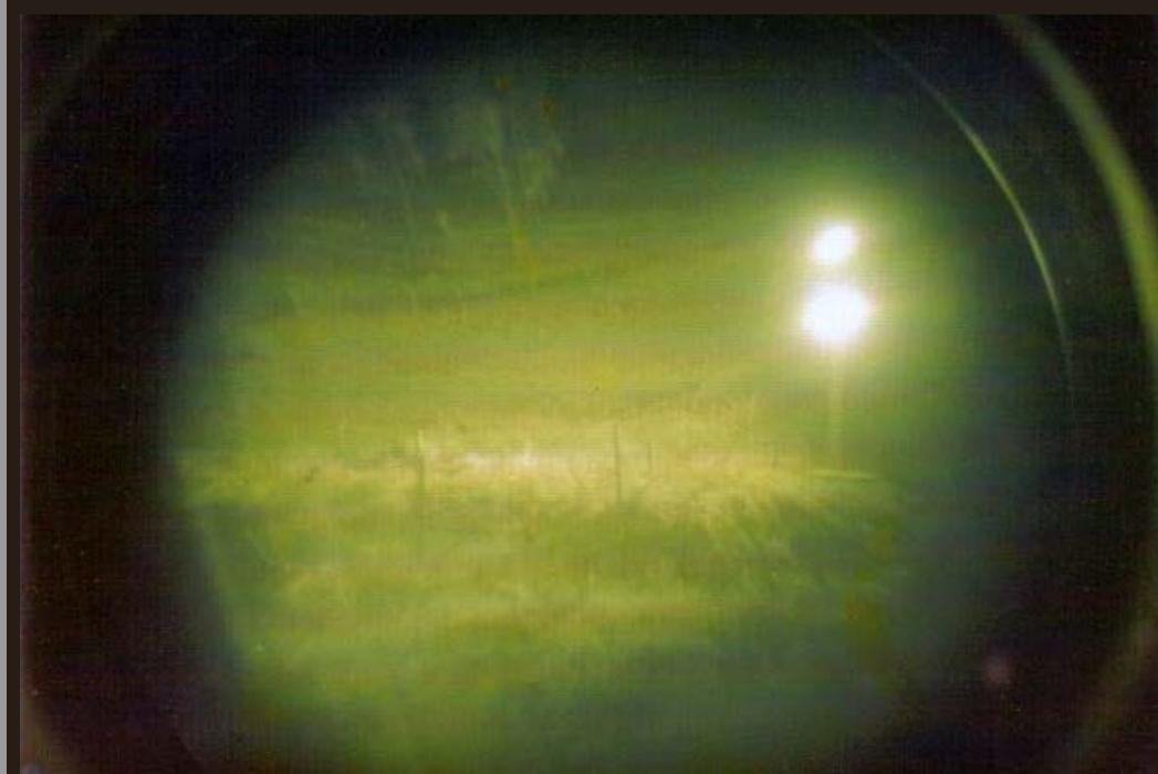
9. NKP Tower, Bravo-1, in Tango Baker section. Tower is located on the north perimeter in Bravo sector, with view to the South.