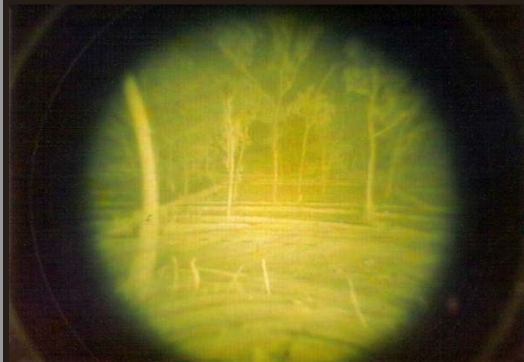
7. NKP Tower, Bravo-1, in Tango Baker section. Tower is located on the north perimeter in Bravo sector, with view to the South.