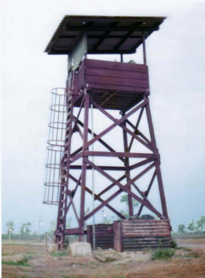
1. NKP Tower, Bravo-1, in Tango Baker section.

Attached are 5 photos I took one morning in April 1975 of the tower and tower views before sun up. Tower is located on the north perimeter in Bravo sector, with views to the east, west, north, and south.