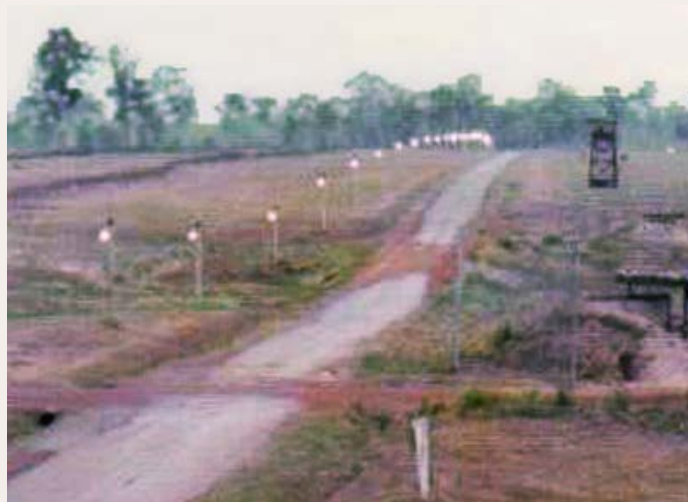
2b. NKP Tower, Bravo-1, in Tango Baker section. Close Up: Tower is located on the north perimeter in Bravo sector, with view to the East. 1974-1975.