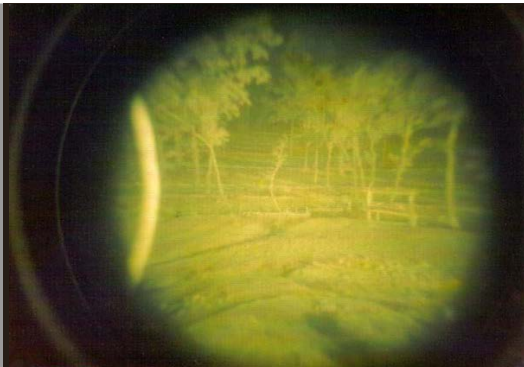
7. NKP Tower, Bravo-1, in Tango Baker section. Tower is located on the north perimeter in Bravo sector, with view to the South.