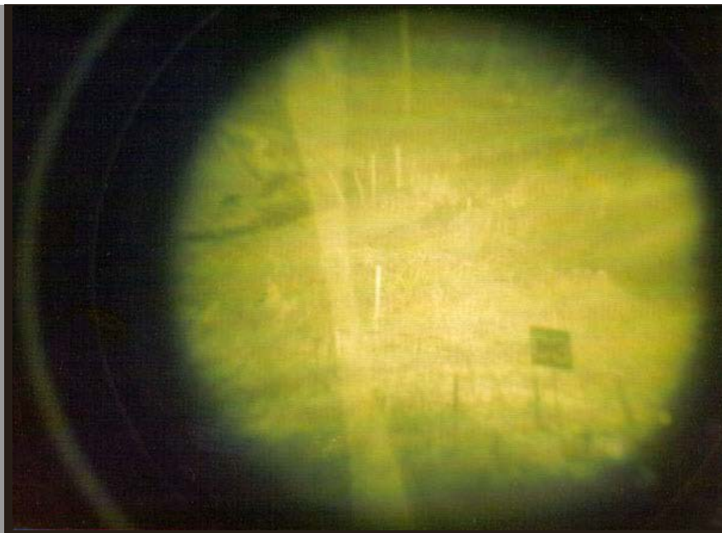
8. NKP Tower, Bravo-1, in Tango Baker section. Tower is located on the north perimeter in Bravo sector, with view to the South.