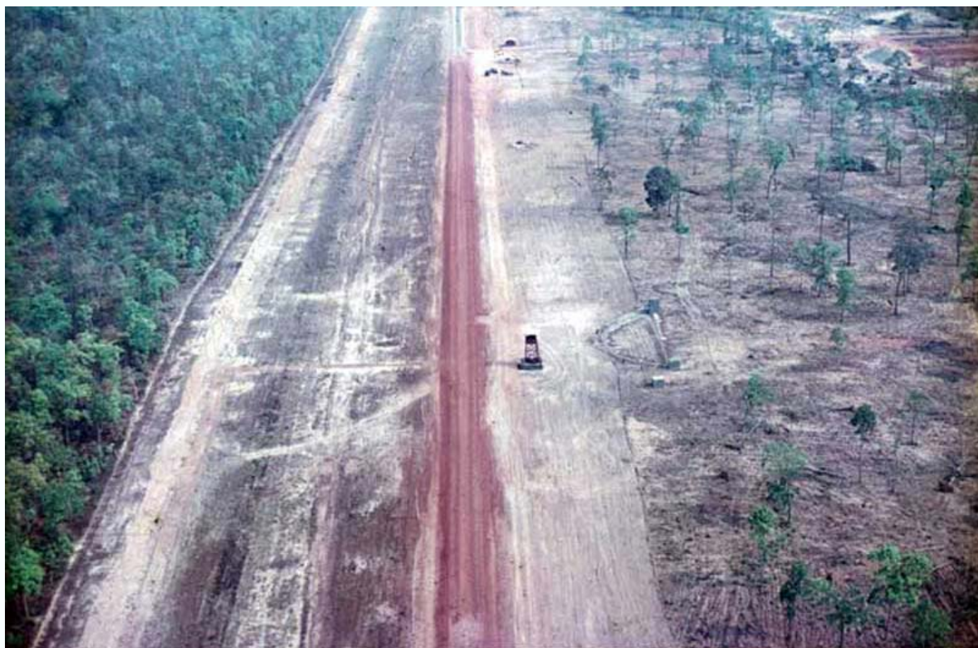
10. NKP Tower, Perimeter. Tower (center) and Bunkers can be seen. I took this photo from an HH-43 "Pedro" helo. Check out HH-43 Pedro Flight Photos.

Note-1: That reverse-shaped "D" shaped area on the ground, just to the right of the tower, is the officers' skeet range-- tough duty in the daytime hours.