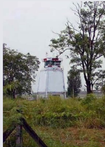
12. NKP Control Tower.