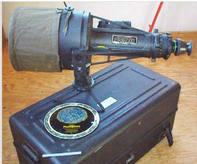
5. Starlite scope, Towers and Bunkers. Thailand and Vietnam. (Online photo)