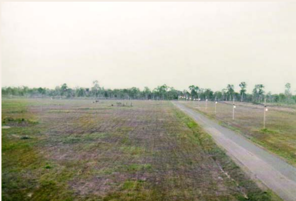
3. NKP Tower, Bravo-1, in Tango Baker section.

Tower is located on the north perimeter in Bravo sector, with view to the West.