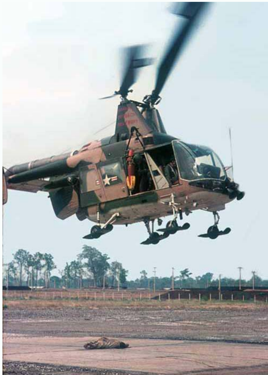
1. NKP: Photo of an HH-43 "Pedro" helo during rescue training.

Photo by Phil Carroll , LM 336, TK, 355th SPS K9; NKP, 56th SPS K9, 1970-1971.