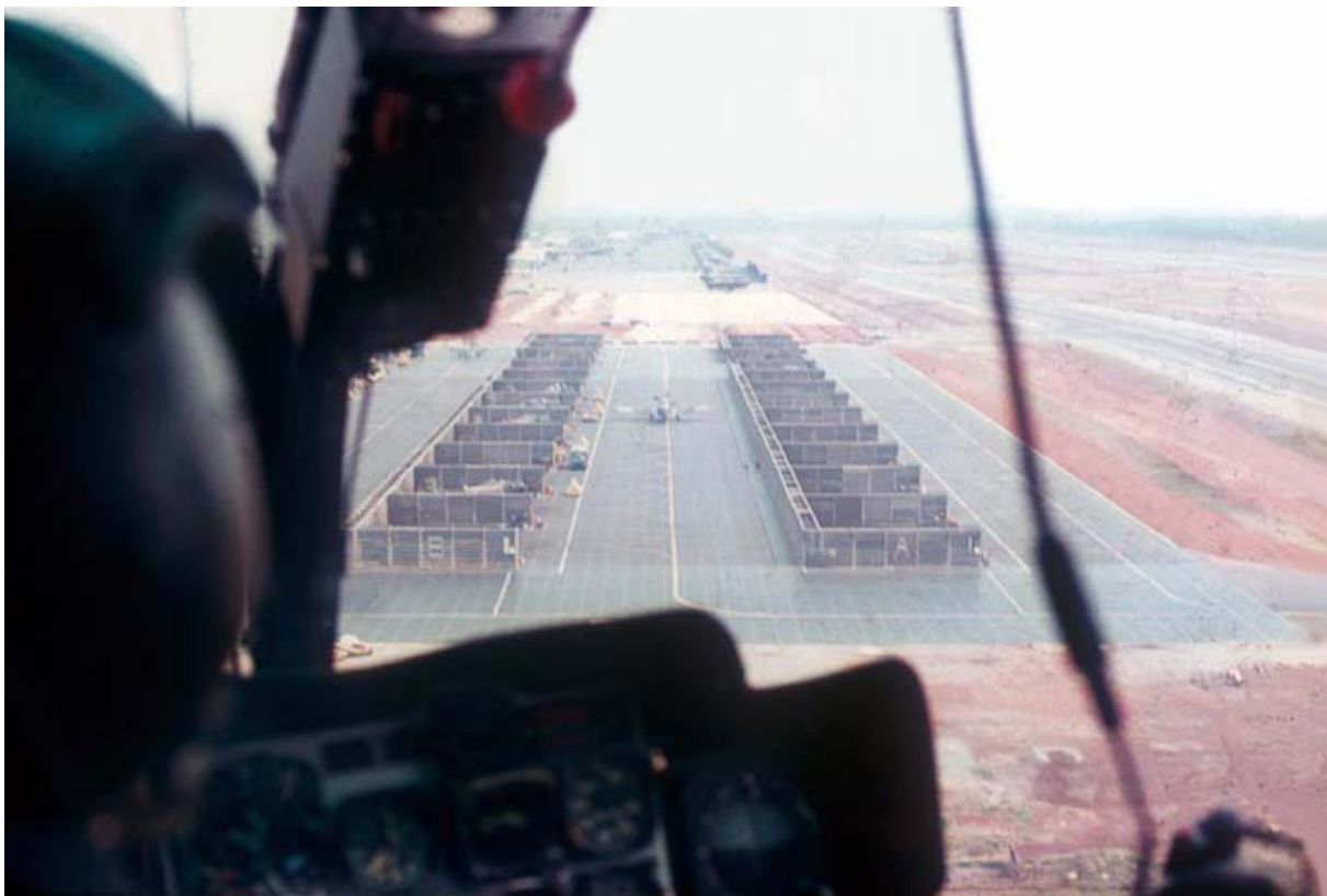
6. NKP: Aerial photo from of an HH-43 "Pedro" of the flight line.