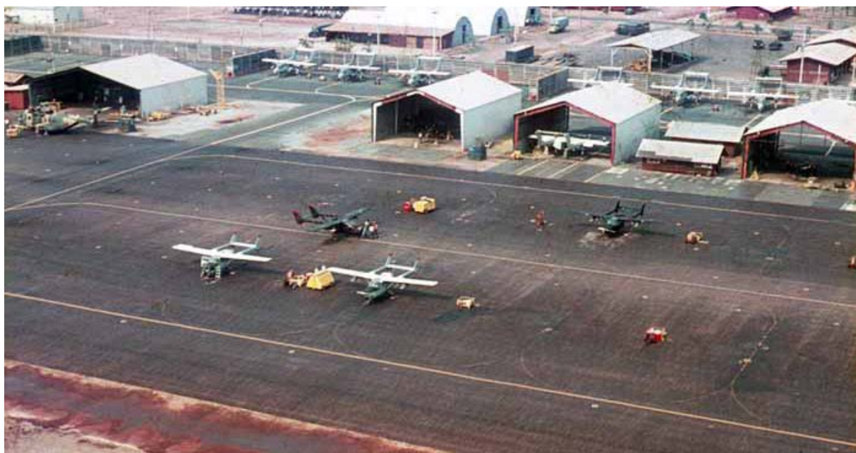
5. NKP: Aerial photo from of an HH-43 "Pedro" of the flight line.