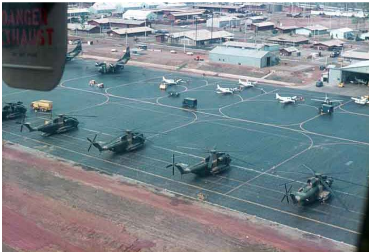
4. NKP: Aerial photo from of an HH-43 "Pedro" of the flight line. LM 336, TK, 355th SPS K9; NKP, 56th SPS K9, 1970-1971.