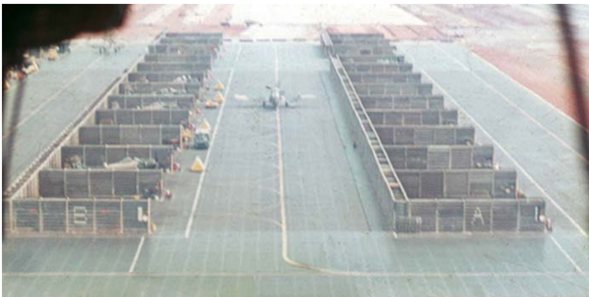
7. NKP: Aerial photo from of an HH-43 "Pedro" of the flight line. Close up.