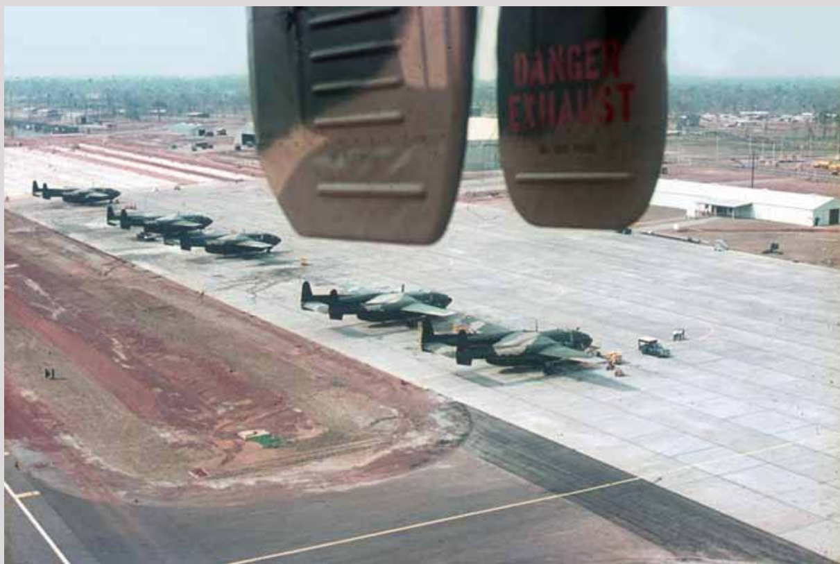
3. NKP: Aerial photo from of an HH-43 "Pedro" of the flight line.