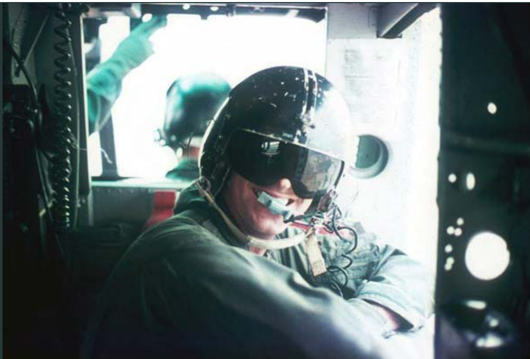
2. NKP: Photo of an HH-43 "Pedro" helo crew.