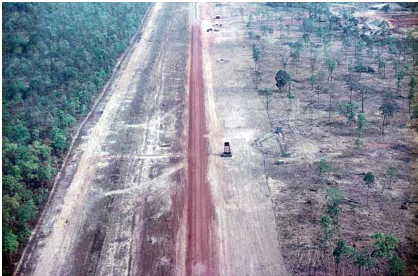
9. NKP Tower, Perimeter. Tower (center) and Bunkers can be seen. I took this photo from an HH-43 "Pedro" helo.

Note-1: That reverse-shaped "D" shaped area on the ground, just to the right of the tower, is the officers' skeet range-- tough duty in the daytime hours.