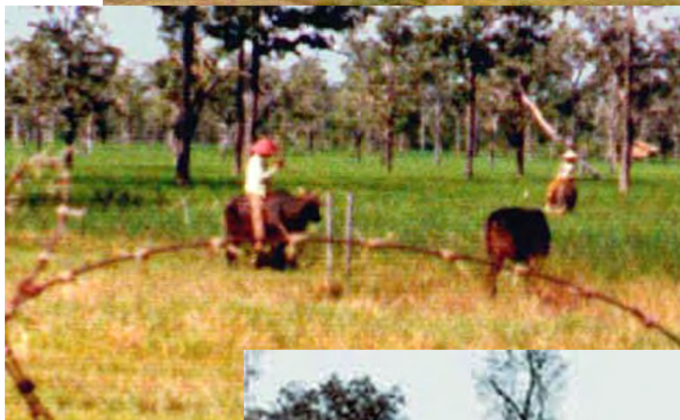
19. (left) Closeup of mamasan on her waterbuffalo. Mamasan and daughter-san tending rice paddy outside the perimeter. Daylight hours were okay to farm -- nighttime-- the paddy was a free-fire zone.