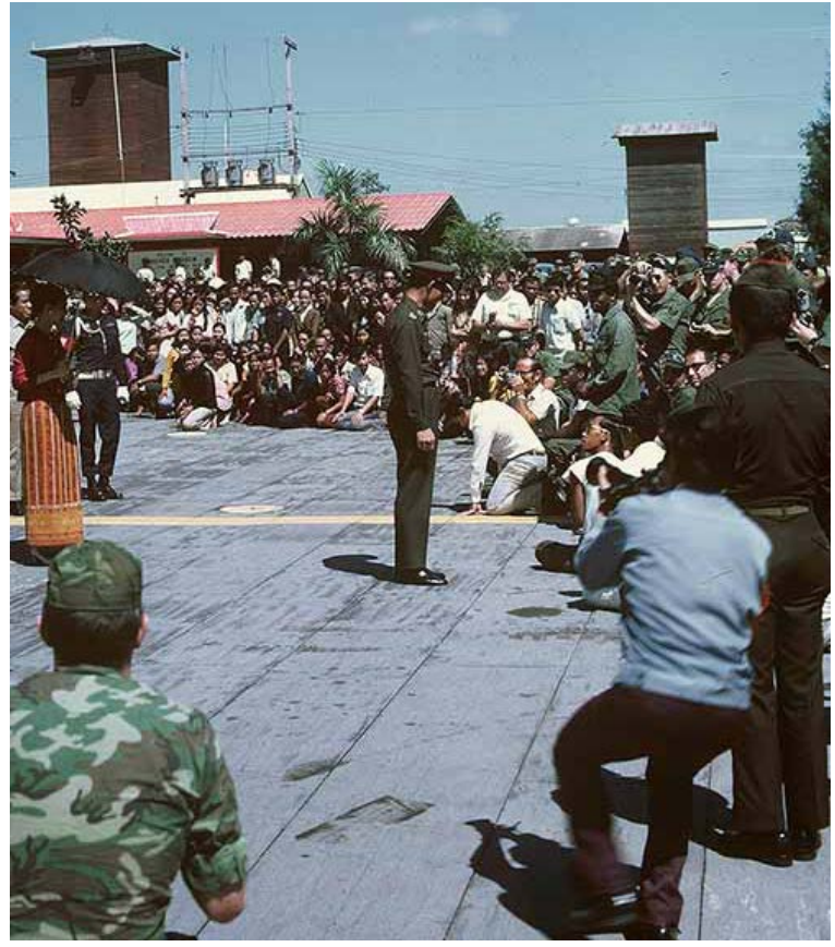
20. NKP RTAFB: Royal Thai King acknowledges subjects.