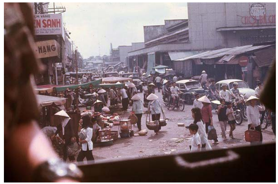
11. TSN AB: Downtown Saigon, en route to Biên Hòa AB Firing Range.