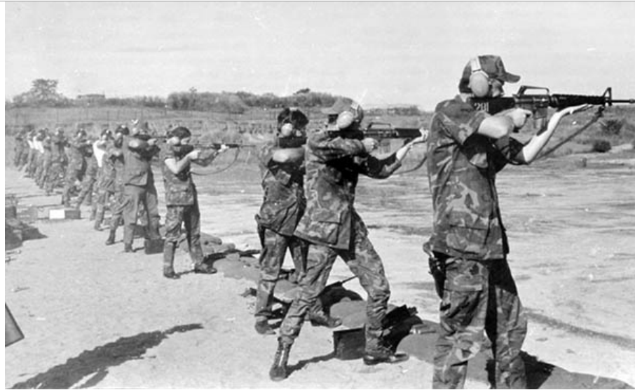
12. TSN AB: Once while I was at Tân Sơn Nhút AB we traveled to Biên Hòa AB for weapons qualification. These photos were taken going to Biên Hòa and at their range. And no we did not have that many left handed shooters. They printed the picture backwards and I can't find the negatives to correct it.