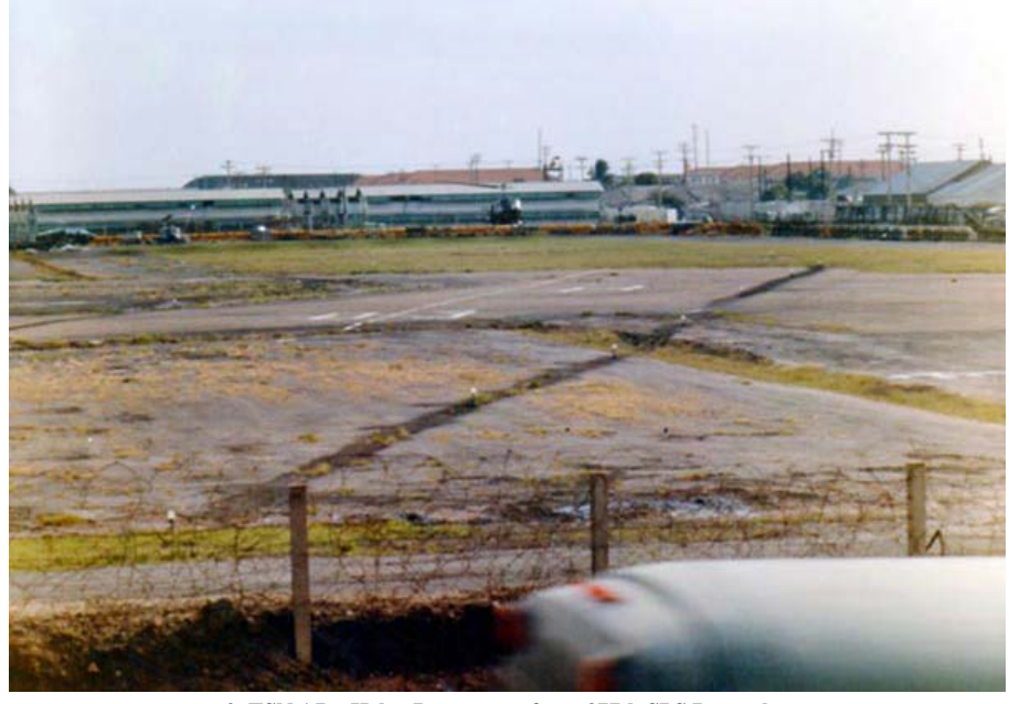
2. TSN AB: Heleo Port across from 377th SPS Barracks.