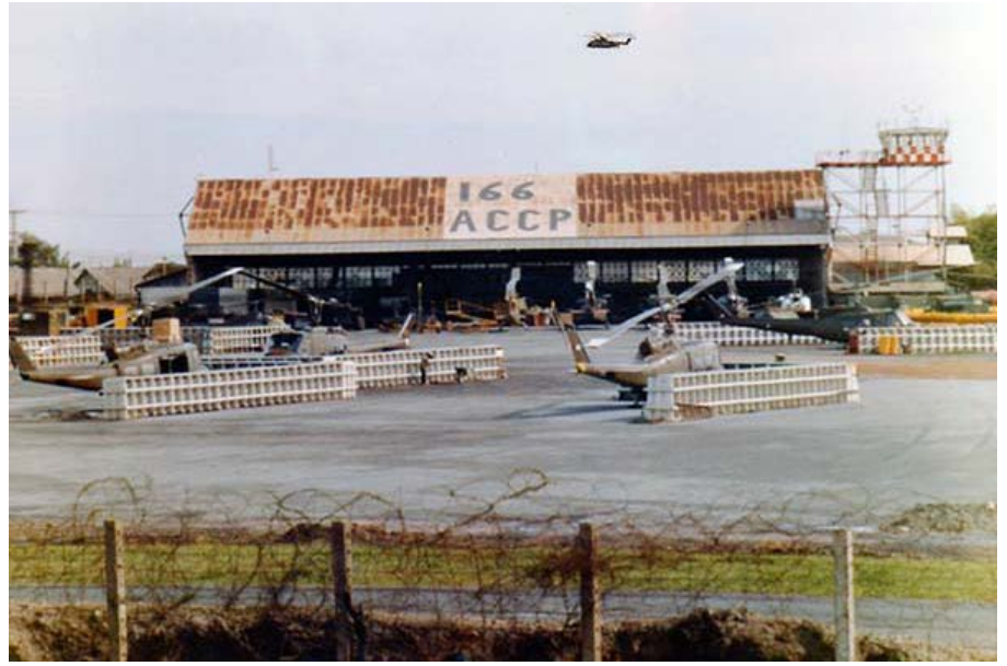
3. TSN AB: Heleo Port Hanger and Huey parking.