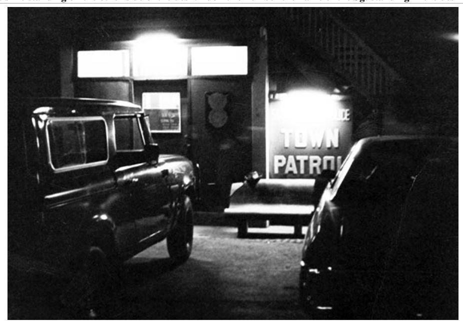
17. NKP RTAFB: Town Patrol Office.