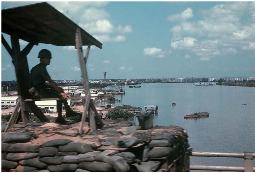
15. TSN AB: Makong Delta VNAF post.