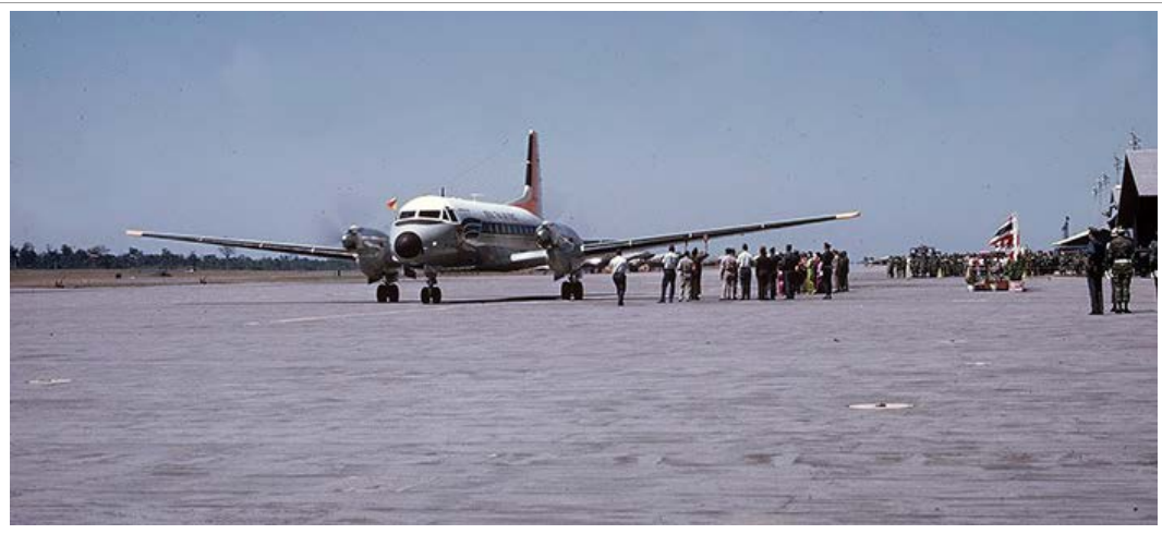
18. NKP RTAFB: I took the following pictures when the Royal Thai King visited NKP.