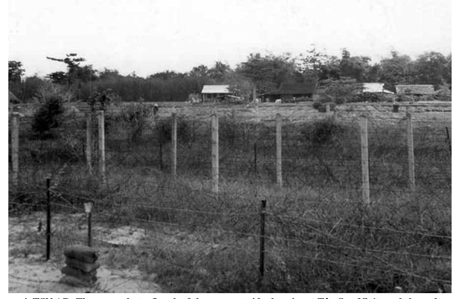
4. TSN AB: These are photos I took of the area out side the wire at Tân Sơn Nhút, and showed my parents what it looked like. In this photo you can see where a claymore was set up.