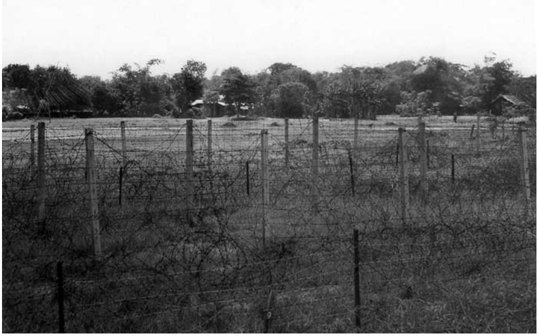
5. TSN AB: Perimeter fence line.