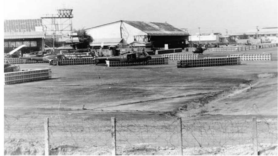
1. TSN AB: This photo is of the heleo port across the street from the 377th SPS Barracks. What I remember most were helicopters seemingly coming and going at all hours of the day and night. My memory is it took me about three days before I can say I quit hearing them even when I was awake.

I took these while working the flight line at Tân Sơn Nhút. I believe they are are of the same C-118 that landed with some sort of emergency. What I remember of this incident is shortly after they gave the all clear and the aircraft began to taxi again the the front nose gear collapsed.