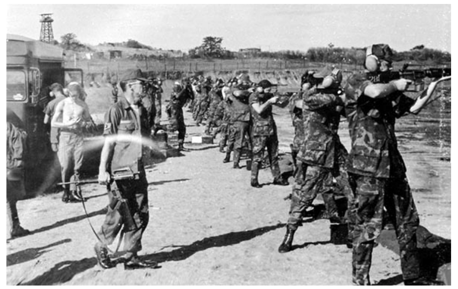
14. Biên Hòa AB: Range for weapons qualification.