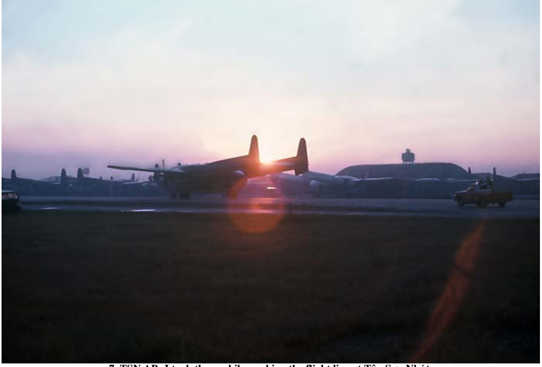
7. TSN AB: I took these while working the flight line at Tân Sơn Nhứt. I believe they are of the same C-118 that landed with some sort of emergency. I remember that shortly after this incident, after they gave the all clear, the aircraft began to taxi again the the front nose gear collapsed.