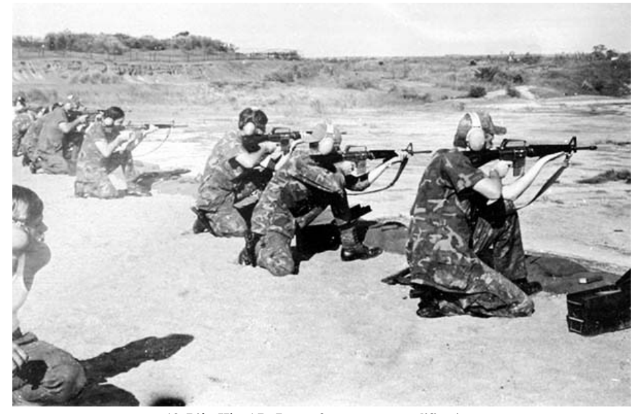
13. Biên Hòa AB: Range for weapons qualification.