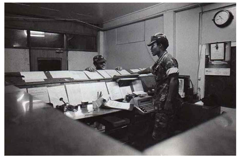
16. NKP RTAFB: A couple of picture I have of the Town Patrol Office in NKP. My memory is a base photographer took these photos for the base newspaper. That's me standing on the other side of the desk. I don't remember the name of the Sgt standing in the desk area.