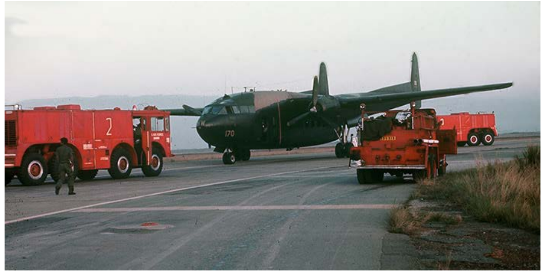
8. TSN AB: Crash Crews surround C-118 Spooky in-flight-emergency after landing safely.