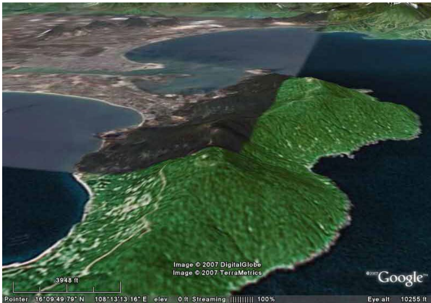
Monkey Mountain, imaged/angled West at 10,255 feet altitude.