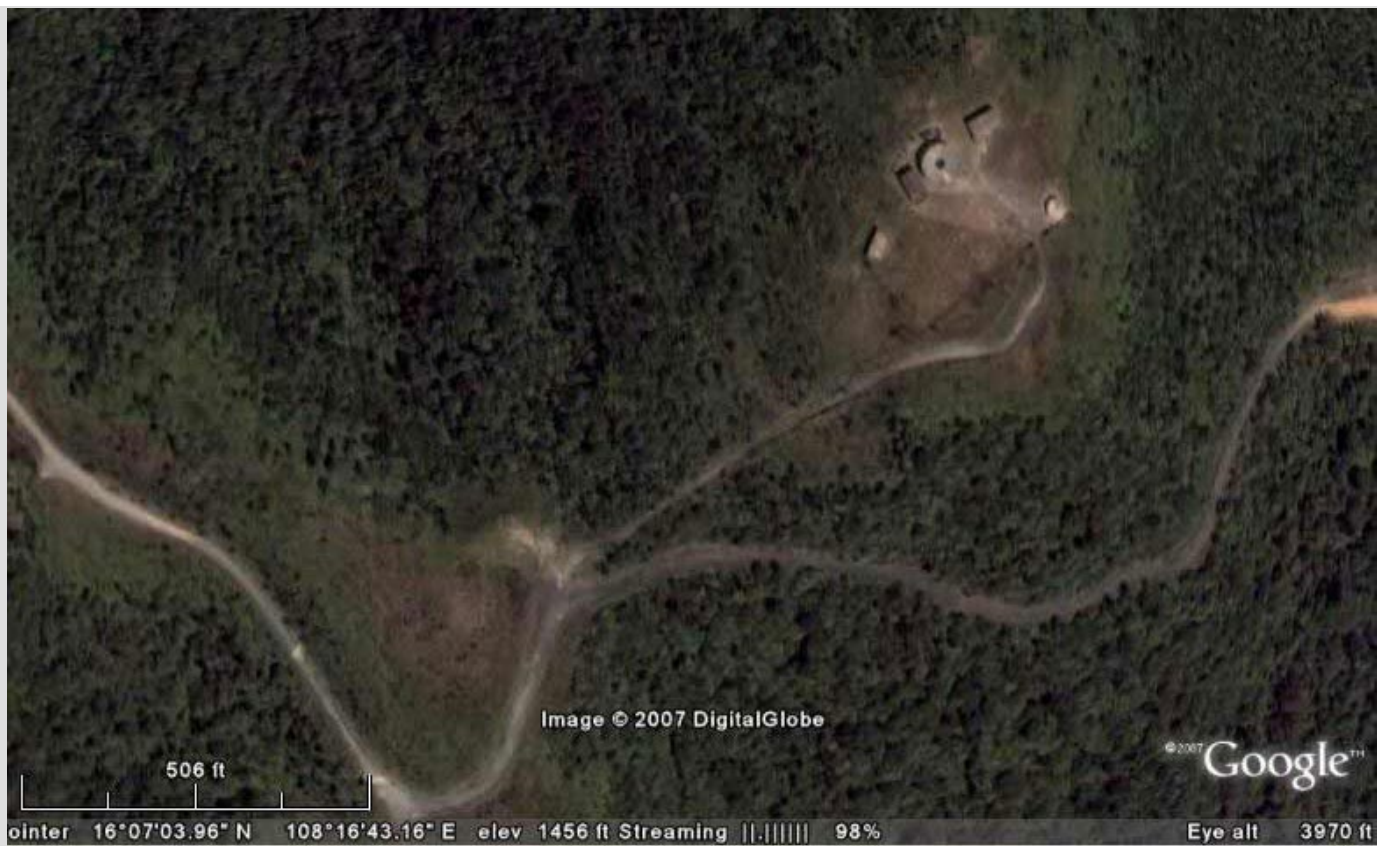
Monkey Mountain, imaged Fly Over North at 3,970 feet altitude.