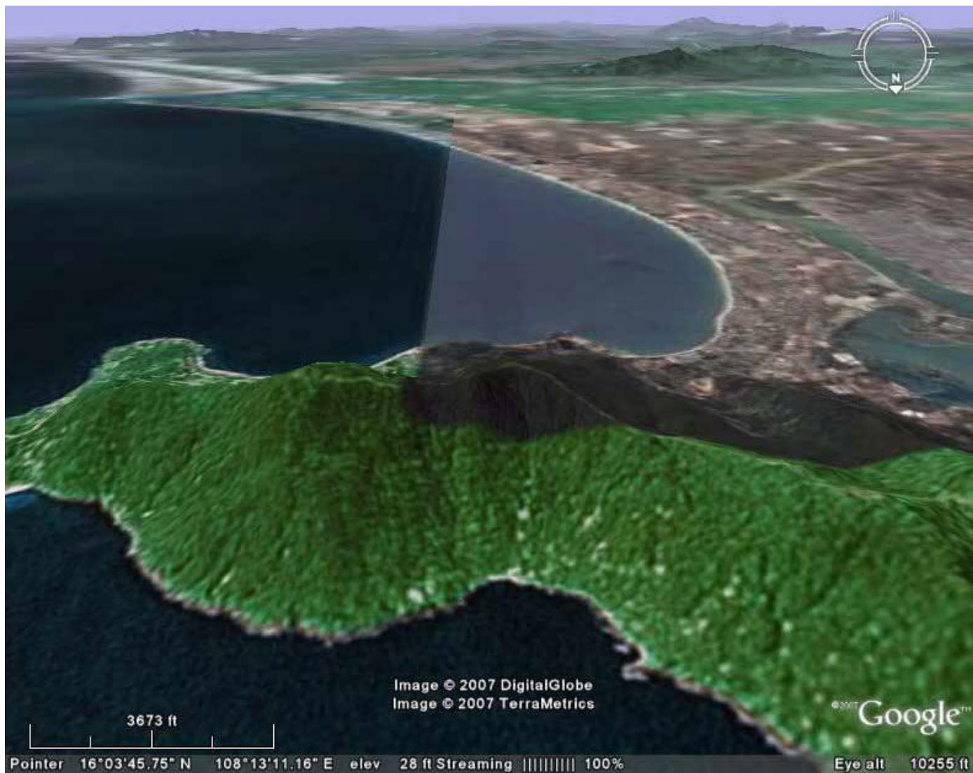
Monkey Mountain, imaged/angled South at 10,255 feet altitude.