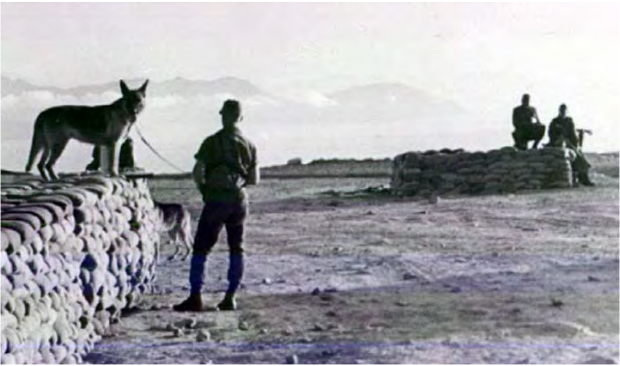
The town was a village and is now a hotel location and not a town. I was an Army operations officer for the Hawk Unit on the island June 1967- December 1967 then to Cam Ranh till Jun 1968. Was at Cam Ranh during Tet and back to the island 25 times or more.