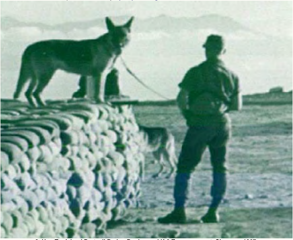
3. Hon Tre Island Portcall Radar, Bunker and K-9 Tower support. Close up. 1967.