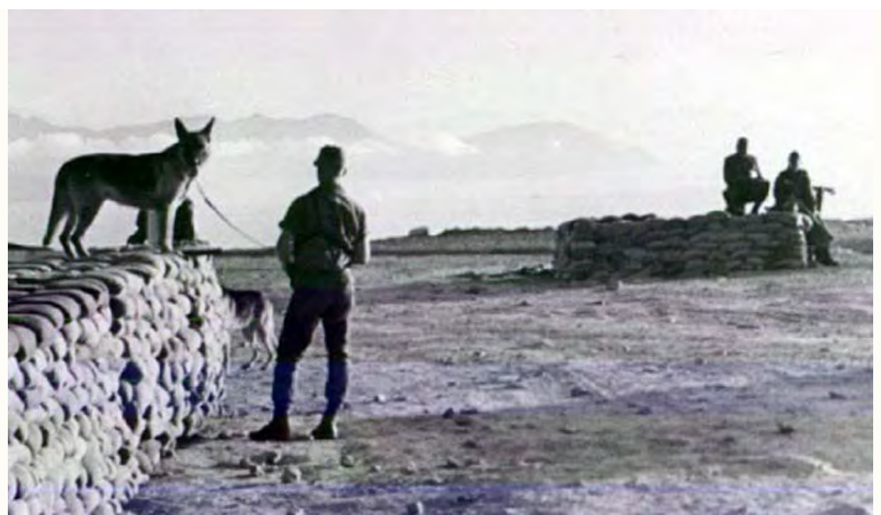
2. Hon Tre Island Portcall Radar, Bunker and K-9 Tower support. Close up. 1967.