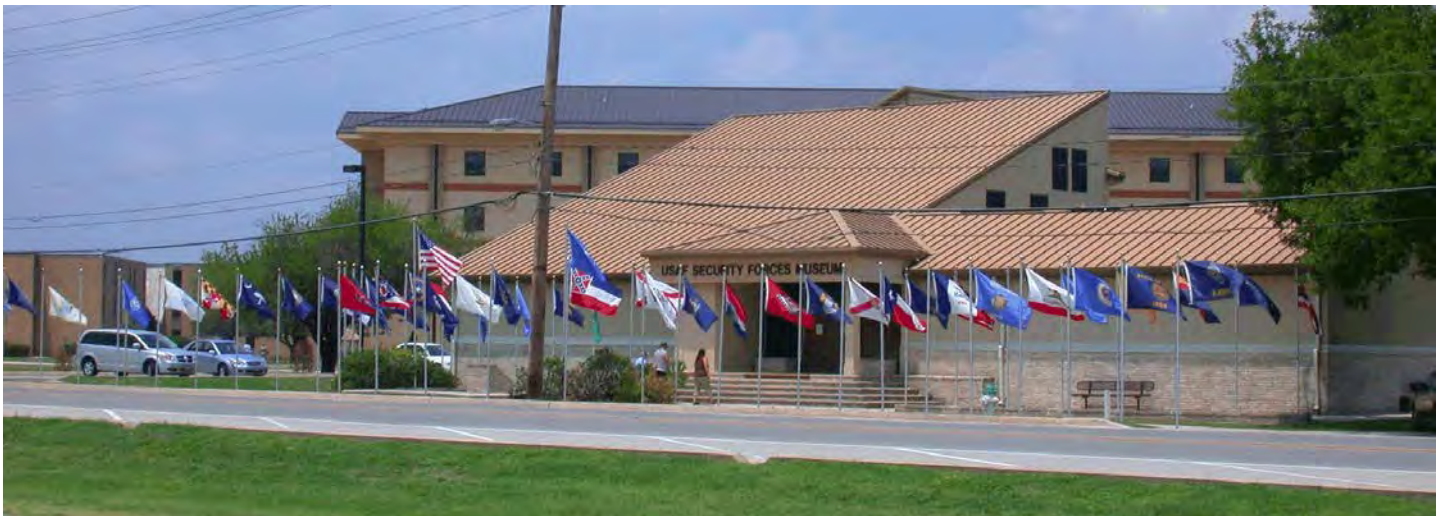
Front Entrance to the Security Forces Museum at Lackland Air Force Base