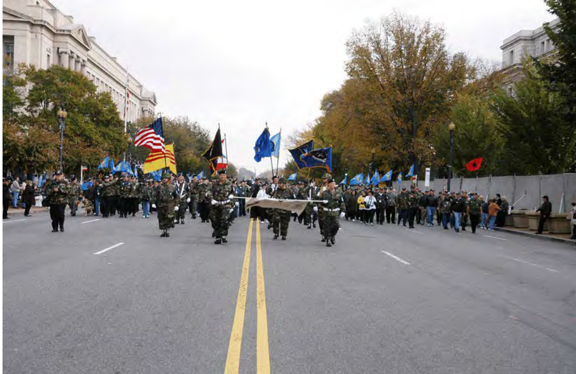
The Vietnam Security Police Association passing in review during the parade to celebrate Veteran's Day 2007 and the 25 th Anniversary of The Wall. Photo taken by VSPA Photographer Lou Reda (Phan Rang 68-69) on Constitution Avenue, Washington D.C.