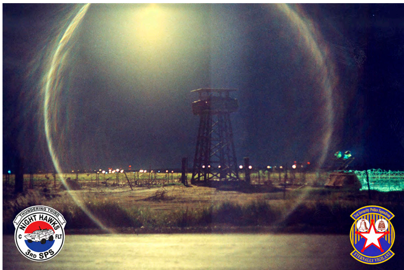
Bien Hoa Air Base – Twinkle III Flare over the East Perimeter