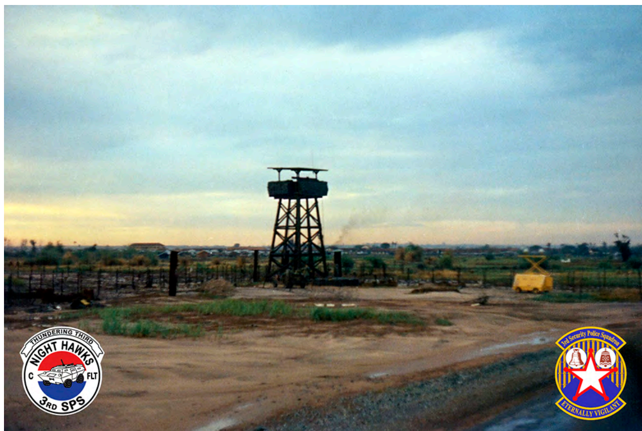
Bien Hoa Air Base – Sunrise on the East Perimeter