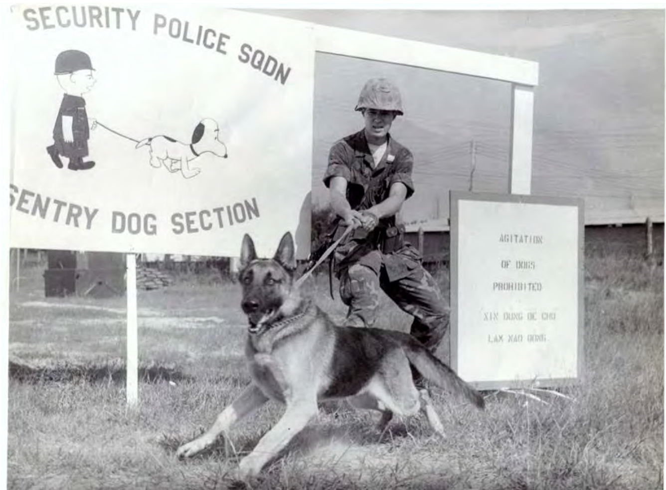
Blackie 129X and myself in front of the kennels