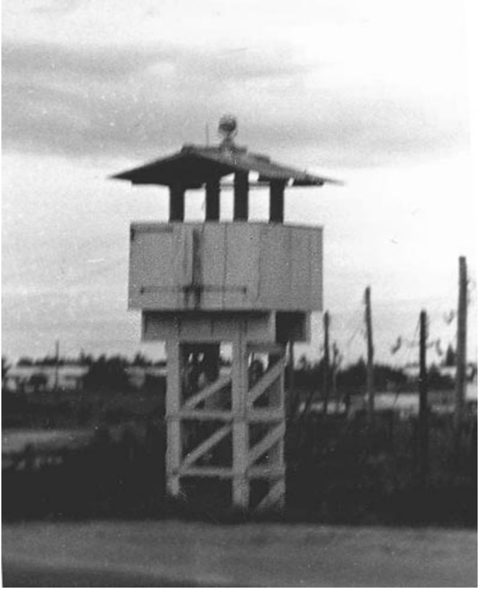
3. Đà Nàng AB, Perimeter Tower, Alpha-3.