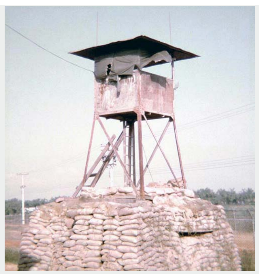
7. Đà Nàng AB perimeter Bunker and Tower. Photo by Mel Hecker, 1967.