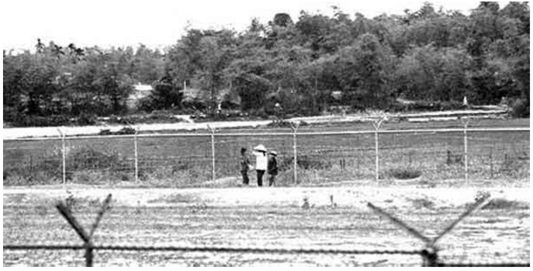
9. Đà Nàng AB, View from perimeter Tower.