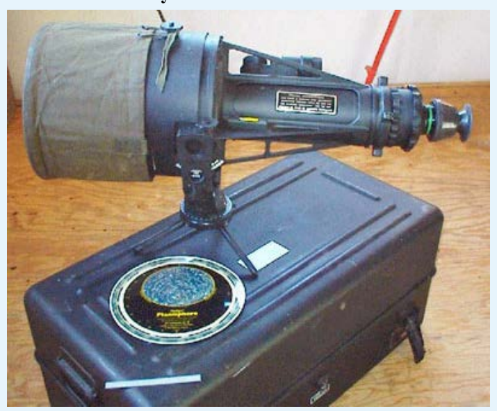
4b. Starlite scope: TVS-4 or TVS-4A "Night Observation Device" Starlite 'scope.