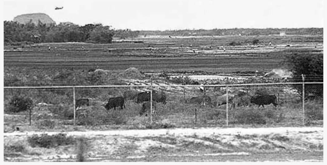
10. Đà Nàng AB, View from perimeter Tower. Marble Mountain, near the helicopter.