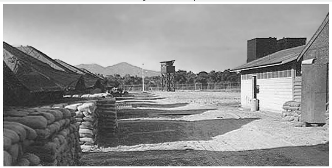
8. Đà Nàng AB perimeter Bunker and Tower. Monkey Mountain, center and across the bay.