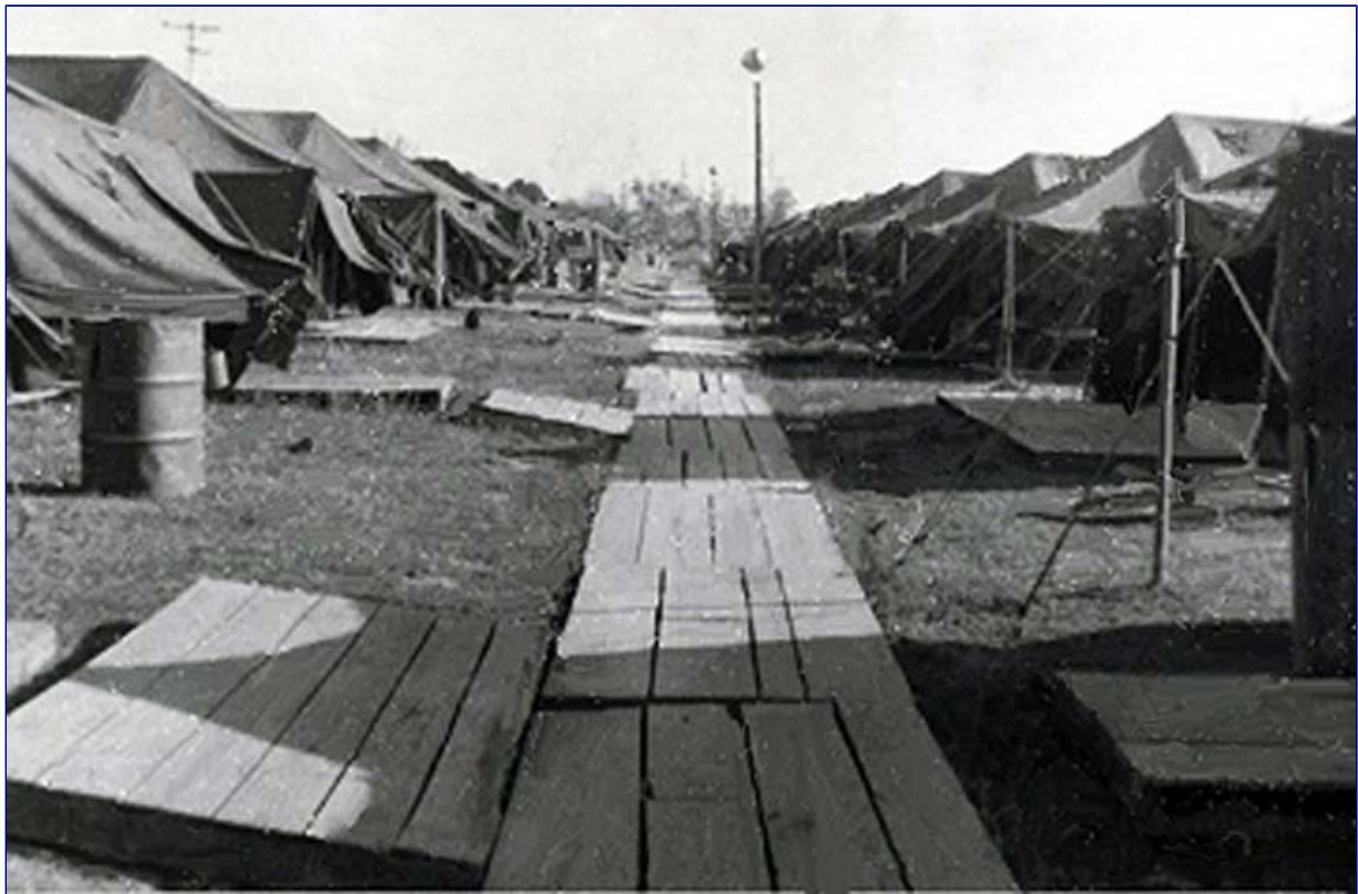
8. Đà Nẵng AB: Đà Nẵng AB, 35th APS, Tent City 1965.