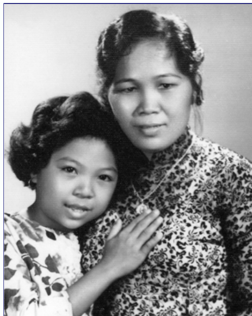
16. Đà Nẵng AB: Mamasan and daughtersan did laundry and brushed shoes for 35th APS tents, and later Hut #3.

1. My job is to defend the principles of my Country. 2. My job is to protect US property and personnel. 3. I'm trained to fire my M-16 automatically. 4. I'll kill Viet Cong without hesitation. 5. I'm the only defense against attack if the VC get through the Marines. If they do, they're dead.