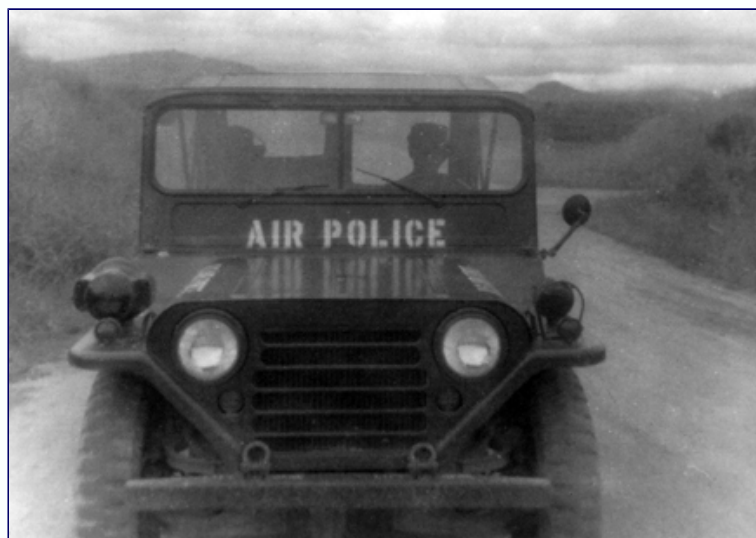
6. Đà Nẵng AB: SSgt Coleman driving an AP jeep. 35th APS Jeep, bomb dump perimeter road. 1965.