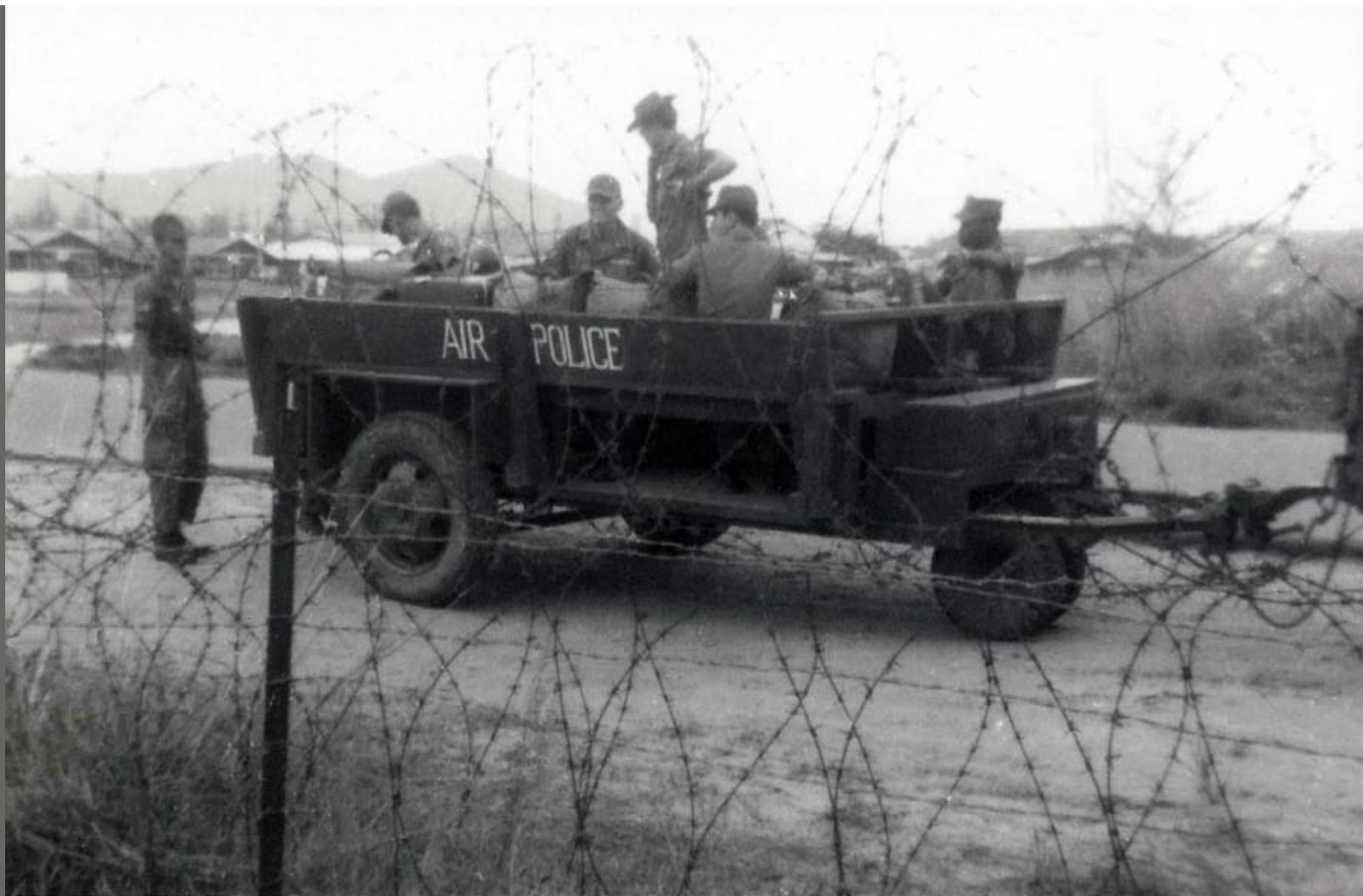
5. Đà Nẵng AB: 35th APS posting trailer, 1965-1966.