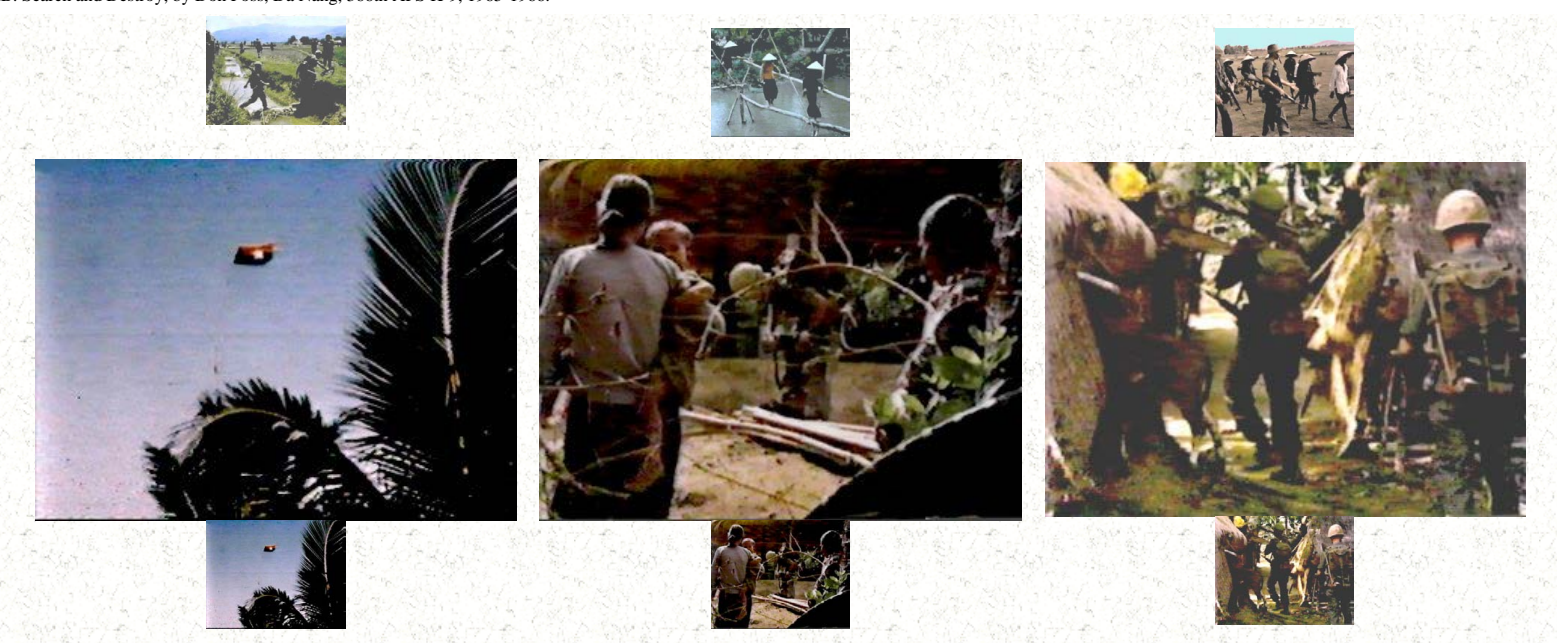
Page-1 • Page-2 • Page-3 • Page-4 • Page-5