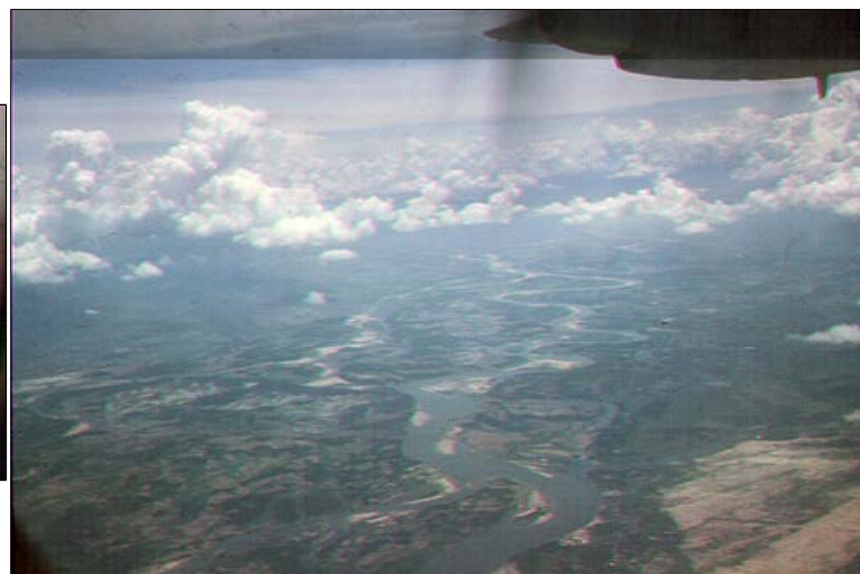
18. Đà Nẵng AB, DEROS: 1966.