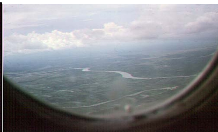
12. Đà Nẵng AB, DEROS: 1966.