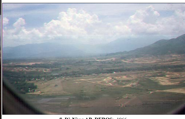
8. Đà Nẵng AB, DEROS: 1966.