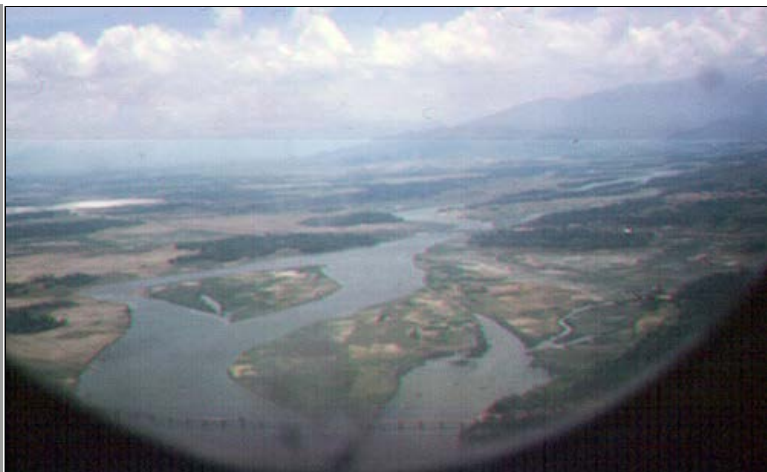
9. Đà Nẵng AB, DEROS: 1966.