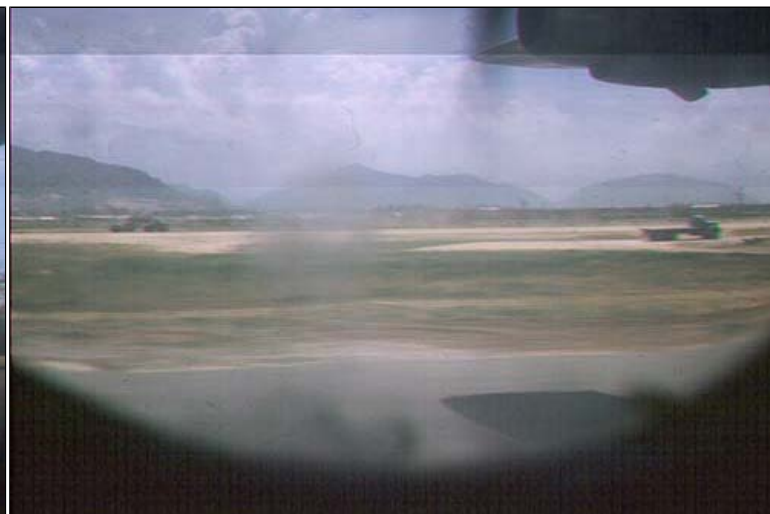
2. Đà Nẵng AB, Deros: 1966.