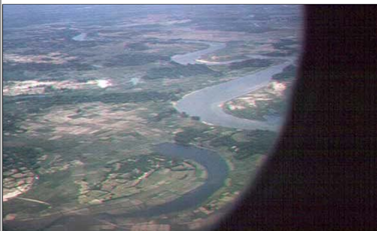
11. Đà Nẵng AB, DEROS: 1966.