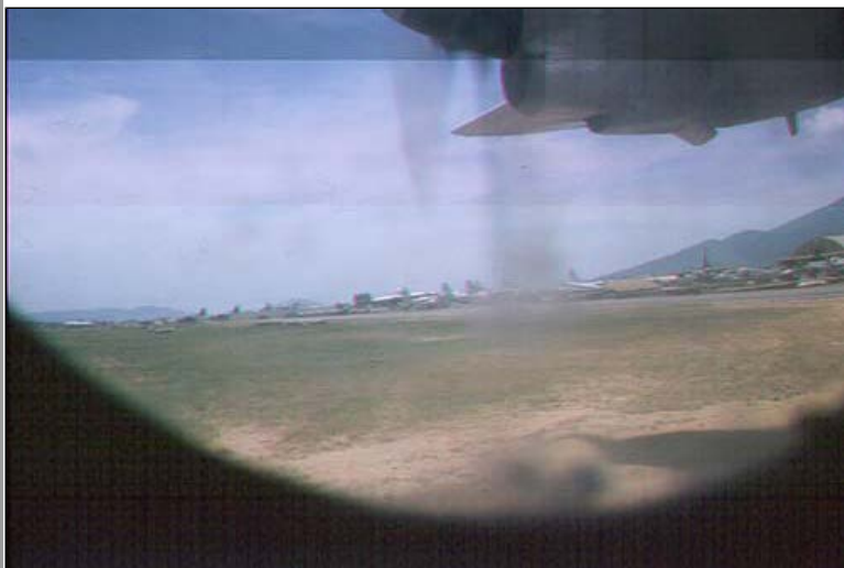
5. Đà Nẵng AB, DEROS: 1966.