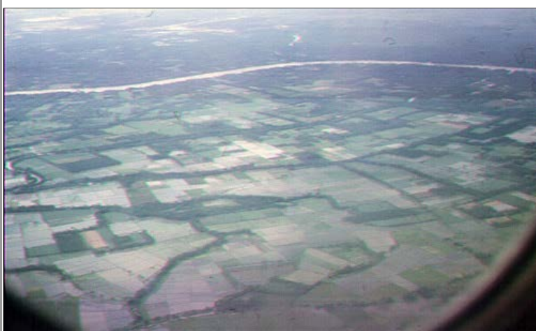
13. Đà Nẵng AB, DEROS: 1966.