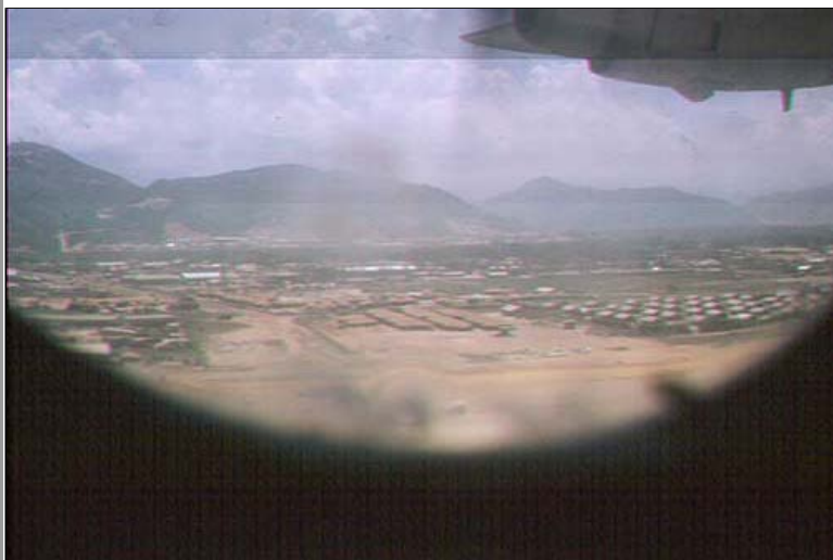
7. Đà Nẵng AB, DEROS: 1966.