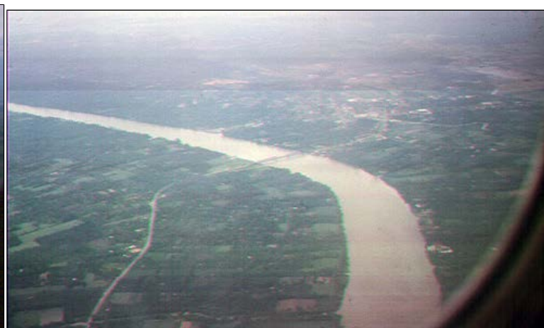
10. Đà Nẵng AB, DEROS: 1966.