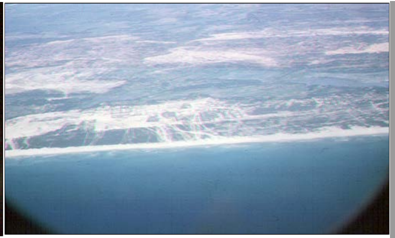
22. Đà Nẵng AB, DEROS: 1966.