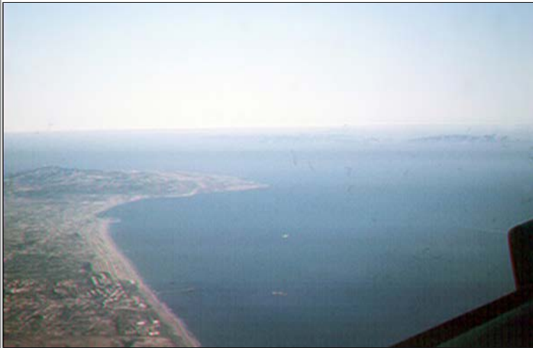
25. Đà Nẵng AB, DEROS: 1966.