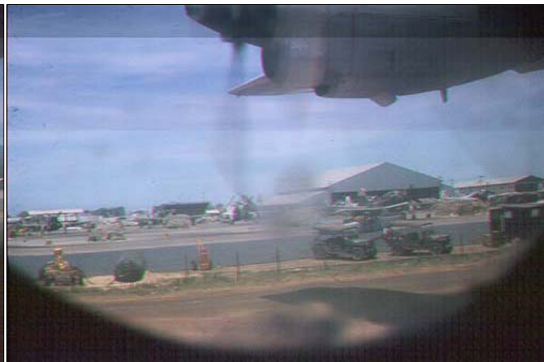
4. Đà Nẵng AB, DEROS: 1966.