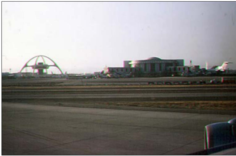
27. Đà Nẵng AB, DEROS: 1966.