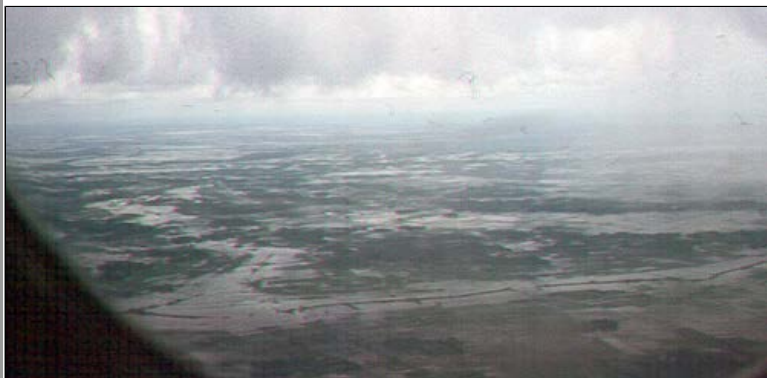
19. Đà Nẵng AB, DEROS: 1966.