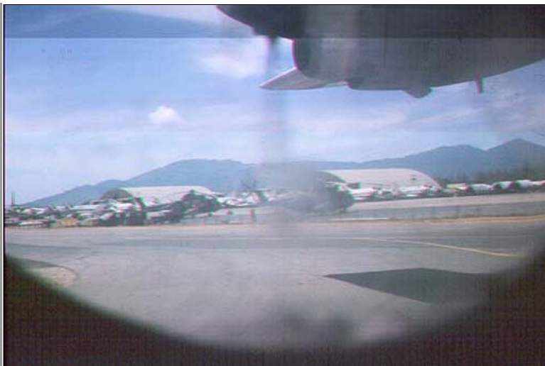
3. Đà Nẵng AB, DEROS: 1966.