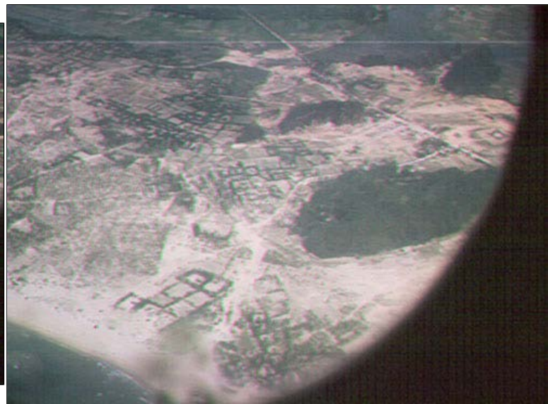
16. Đà Nẵng AB, DEROS: 1966.