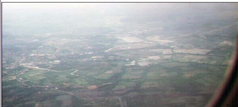
17. Đà Nẵng AB, DEROS: 1966.