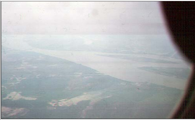
21. Đà Nẵng AB, DEROS: 1966.