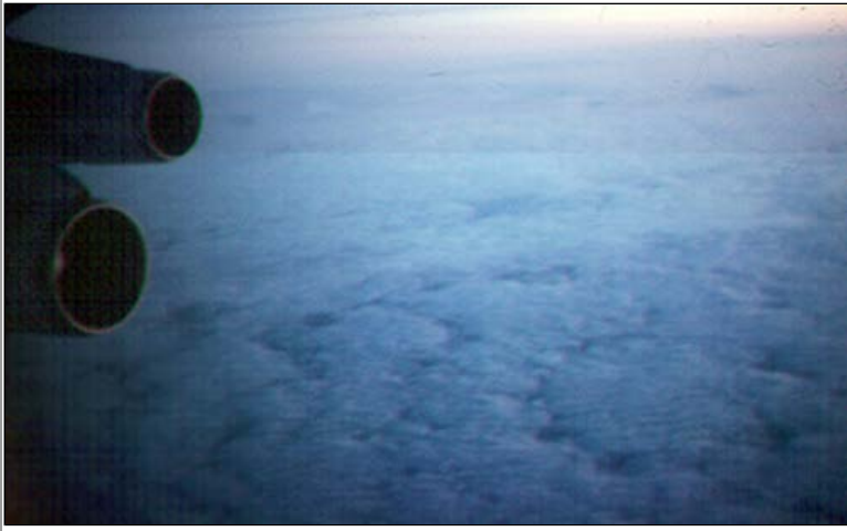
23. Đà Nẵng AB, DEROS: 1966.