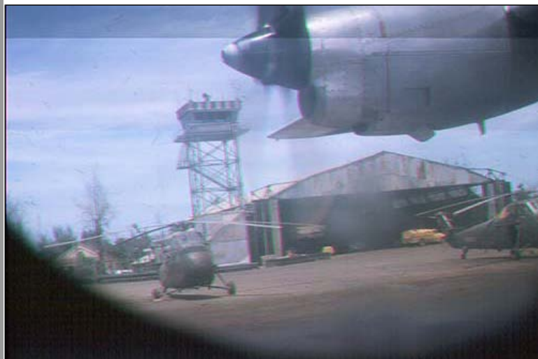
1. Đà Nẵng AB, Deros: Deros-DAY! Boarded C-130 for flight to TSN and the Freedom Bird to LAX, Los Angeles, California. 1966.