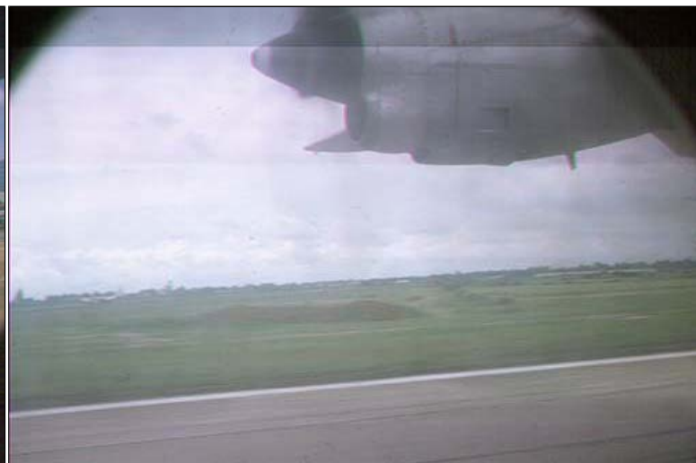
6. Đà Nẵng AB, DEROS: 1966.