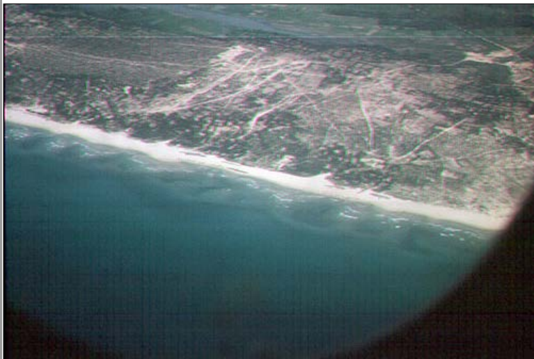
15. Đà Nẵng AB, DEROS: 1966.