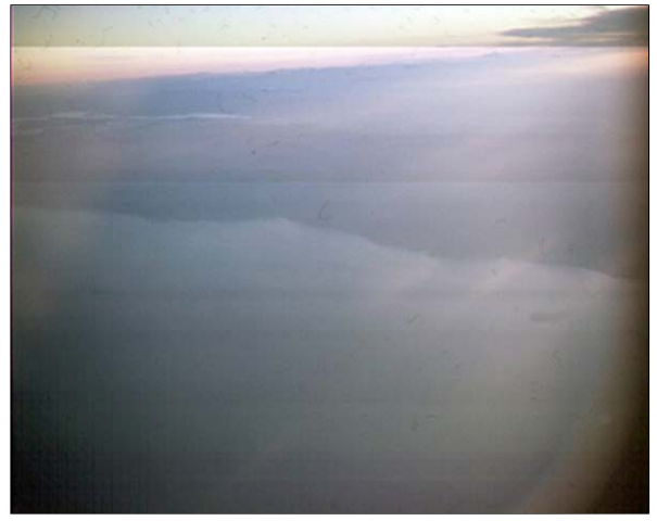
24. Đà Nẵng AB, DEROS: 1966.