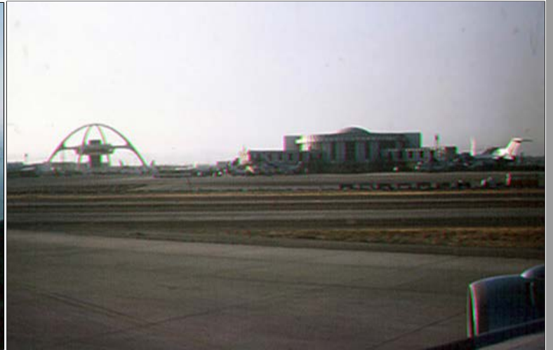
26. Đà Nẵng AB, DEROS: 1966.