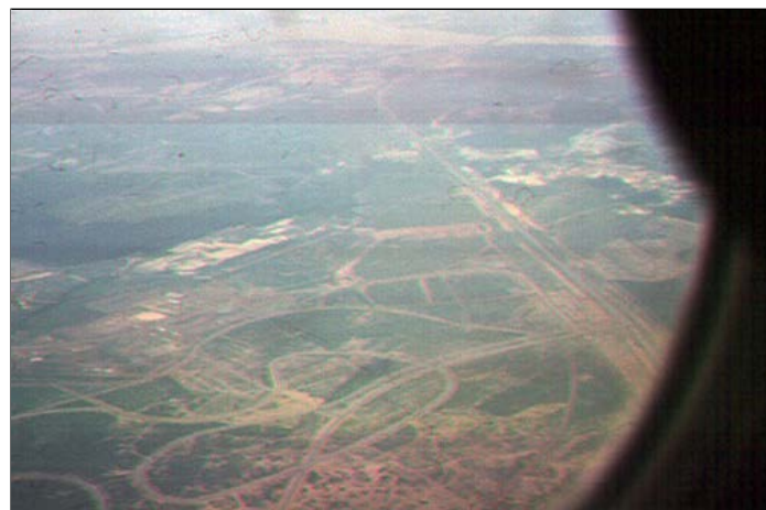
20. Đà Nẵng AB, DEROS: 1966.