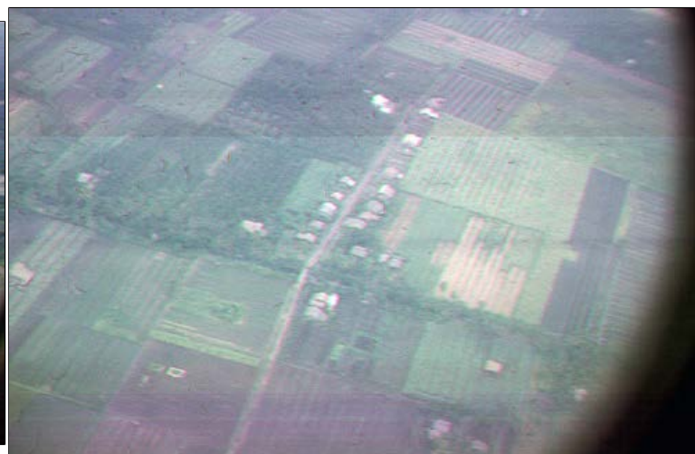
14. Đà Nẵng AB, DEROS: 1966.