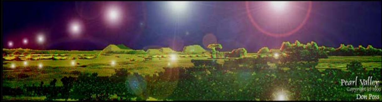
dn-pearl-valley-poss-1966.jpg A valley east of Đà Nẵng AB, lite up by a string of pearl-like flares.