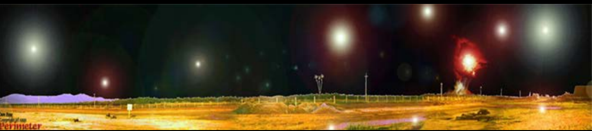
dn-perimeter.jpg 1965 Đà Nẵng AB perimeter, guarded by the USMC. USAF K-9 and sentries generally patrolled inside the wire an on base. A mutual respect quickly evolved.