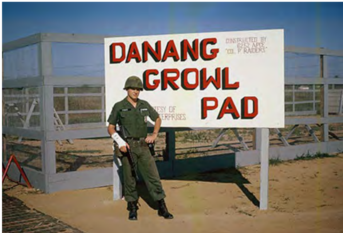
11. Đà Nẵng AB, K-9 Growl Pad: Don Poss, wist-wrap due to firing a defective slap-flare. 1965.