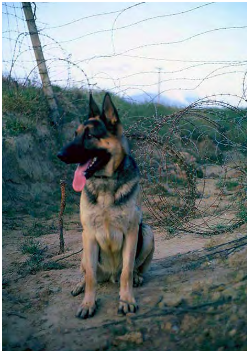
78. right. Đà Nẵng AB, K-9 Growl Pad: Blackie 129X mugs for the camera. A genuine champion pedigree. 1965.