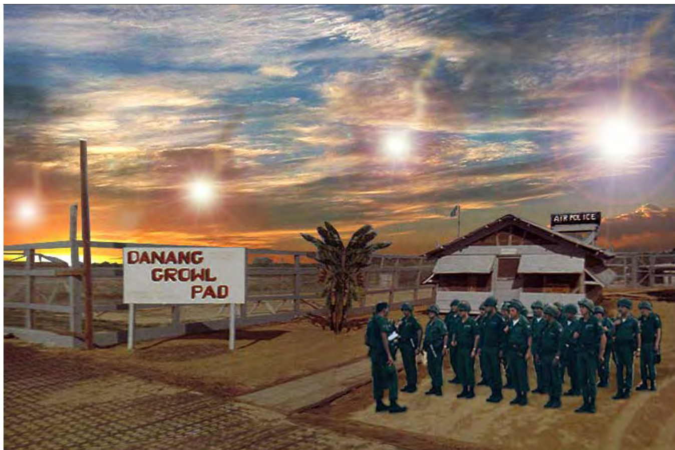
12. Đà Nẵng AB, K-9 Growl Pad: Guardmount close up.