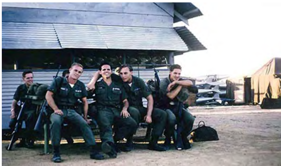
43. left. 44. center. 45. right.