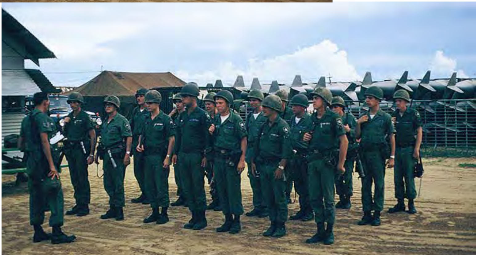
48. below. Đà Nẵng AB, K-9 Growl Pad: Guardmount called to attention . . . sort of. 1965.