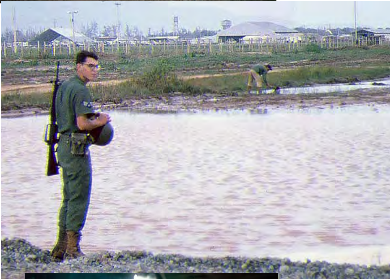
Đà Nẵng AB, K-9 Growl Pad: A1C Al . . . Well we know who's the brains of that team. 1965.