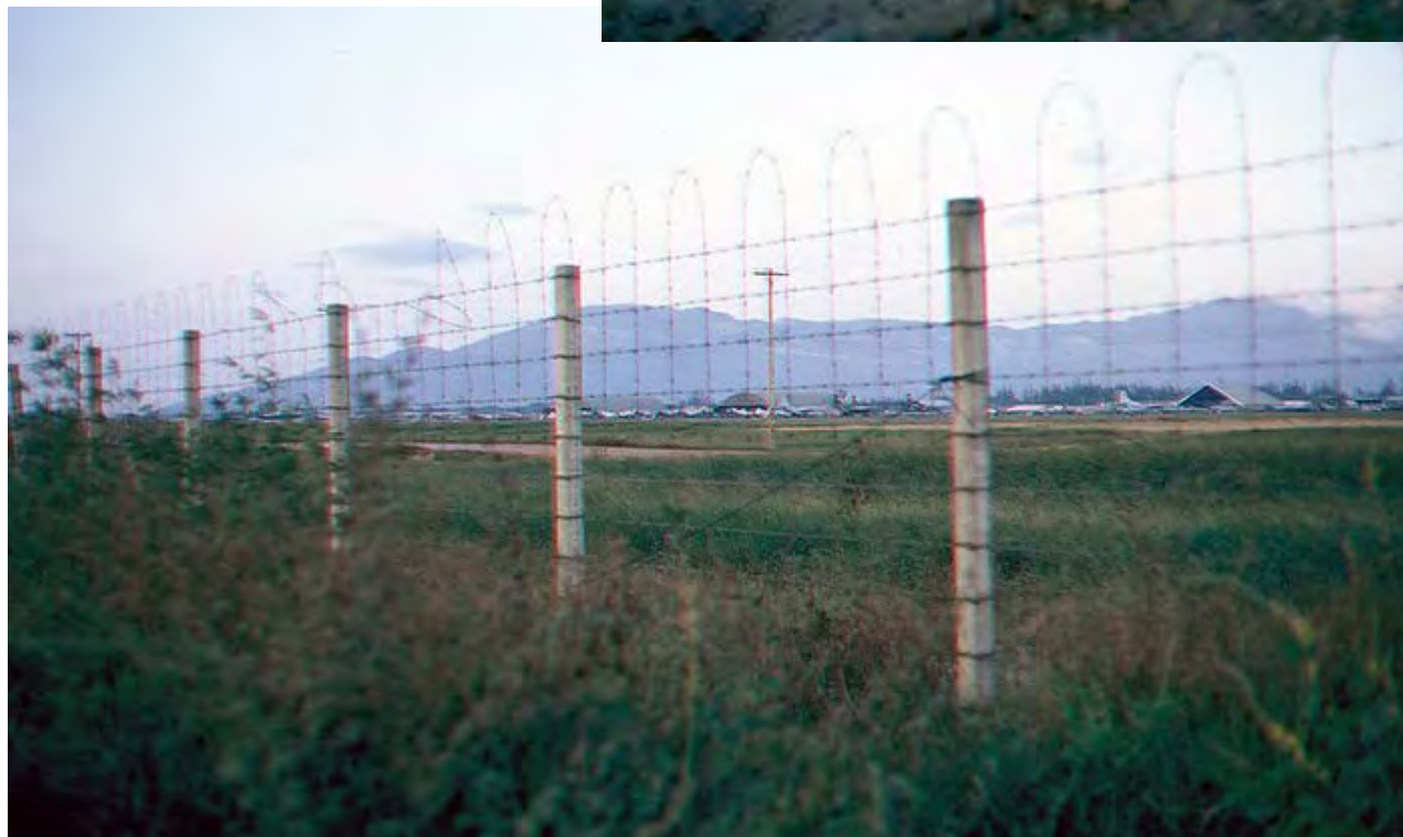
79. below. Đà Nẵng AB, K-9 Growl Pad: Air Base flight line is visible through the Ammo-Bomb Dump perimeter fence. 1965.