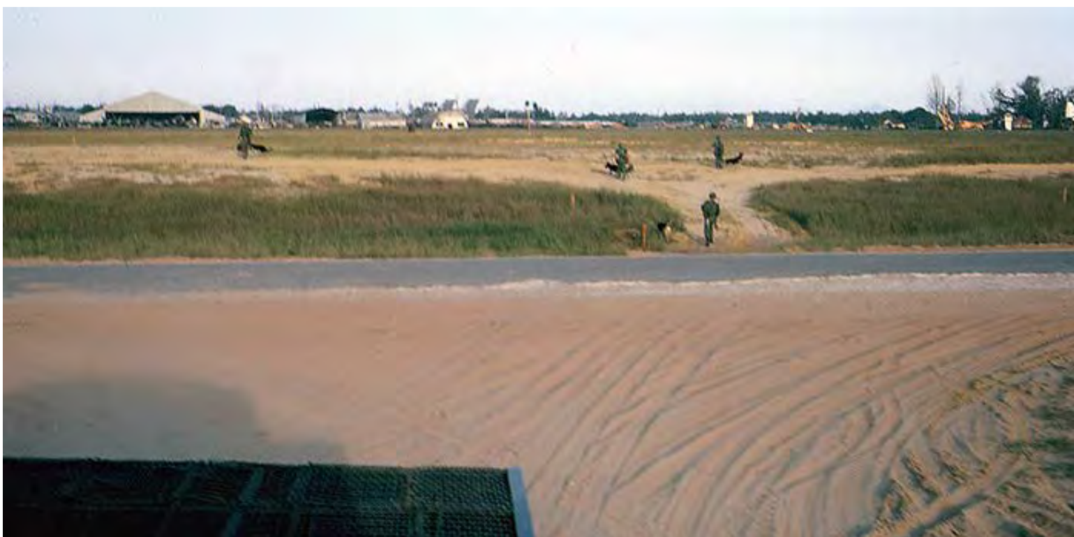
72. Đà Nẵng AB, K-9 Growl Pad: Handlers and Dogs scatter eastward to posts, which could range from 1000-2000 feet long. Across the active runway you can see flight line hangars and buildings. The area immediately in front of the handlers is the under-construction new runway. 1965-1966.