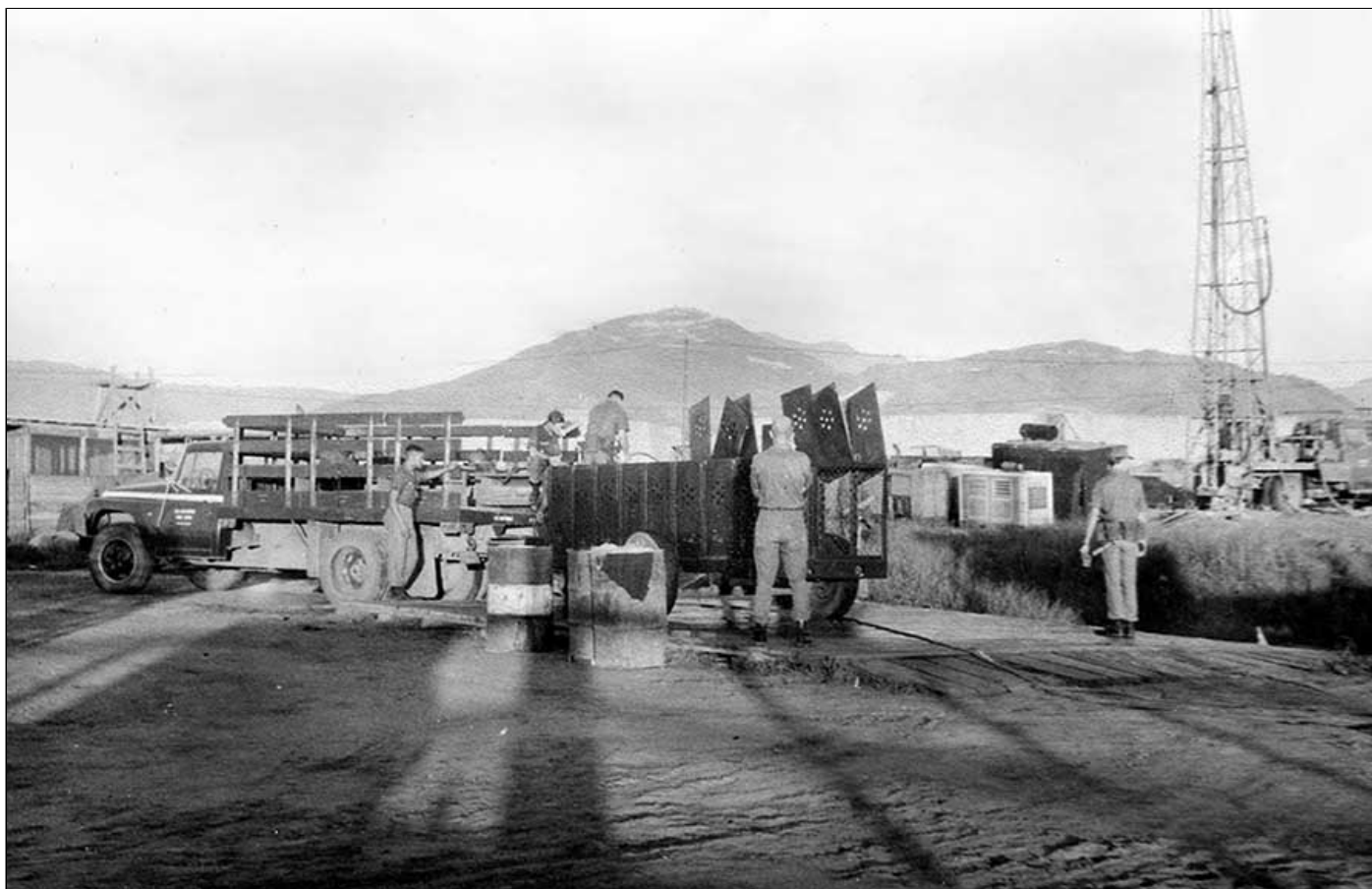
53. Đà Nẵng AB, K-9 Growl Pad: K-9 Truck and Trailer being hosed down and cleaned up. Freedom Hill 327 in background, about five miles west. Firing Range is south at its base. 1965.