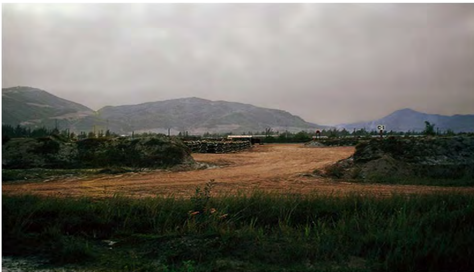
81. Đà Nẵng AB, K-9 Growl Pad: Ammo-Bomb Dump entrance road to Charlie-1 post. 1965.