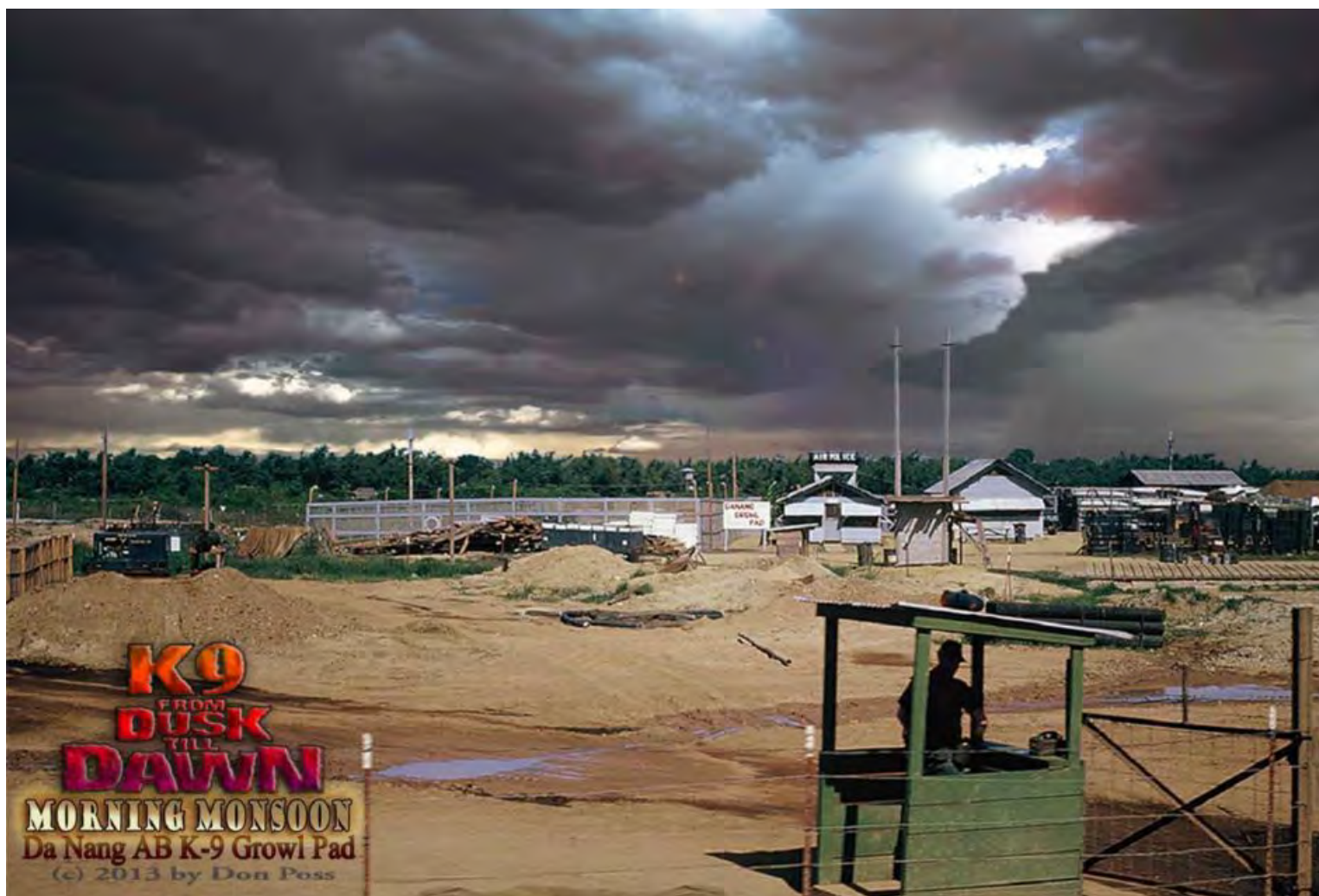
40. Đà Nẵng AB, K-9 Growl Pad: Growl Pad's Access Control Post. 1965.

23rd ABG/AP; 6252nd APS; 35th APS; 366th APS/SPS, APO for Đà Nẵng Air Base was APO San Francisco, 96337