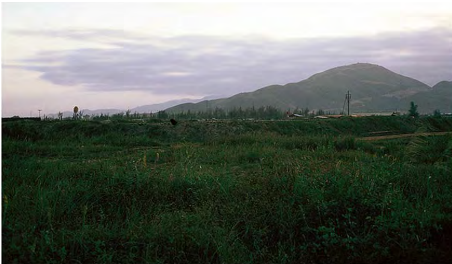
80. Đà Nẵng AB, K-9 Growl Pad: S/B West-Perimeter Road, approaching Ammo-Bomb Dump entrance road. 1965.