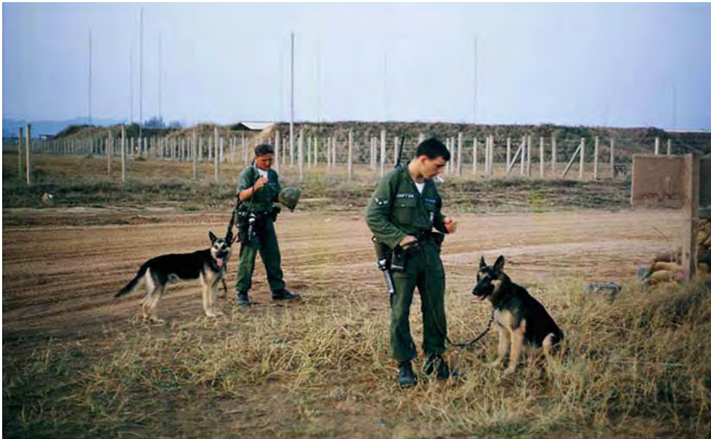
73. above. Đà Nẵng AB, K-9 Growl Pad: K-9 handlers grab a last-smoke break before entering the Ammo/Bomb Dump to patrol. 1965.