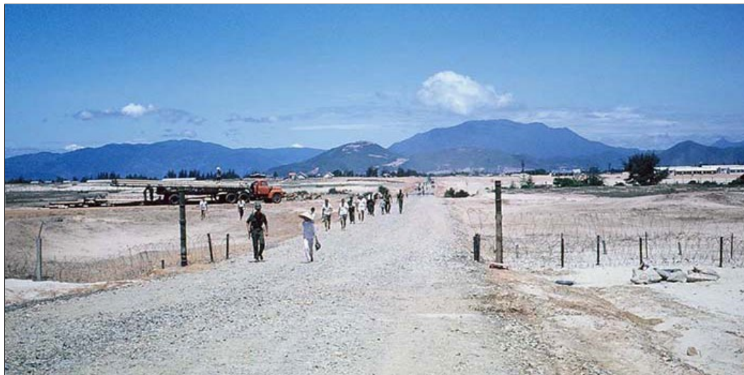
36. China Beach, Đà Nẵng: The road back to Đà Nẵng AB (Freedom Hill 327, center). I guess we'll have to pave the road to.