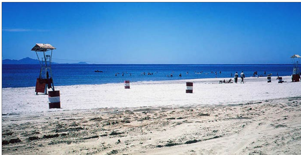
30. China Beach, Đà Nẵng: What a beach! (minus the AO trash cans)