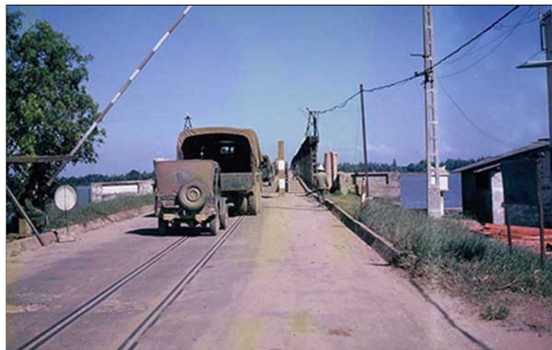
1. China Beach, Đà Nẵng: Crossing the Trinh Minh Bridge over the Han River, from Đà Nẵng Air Base to China Beach.