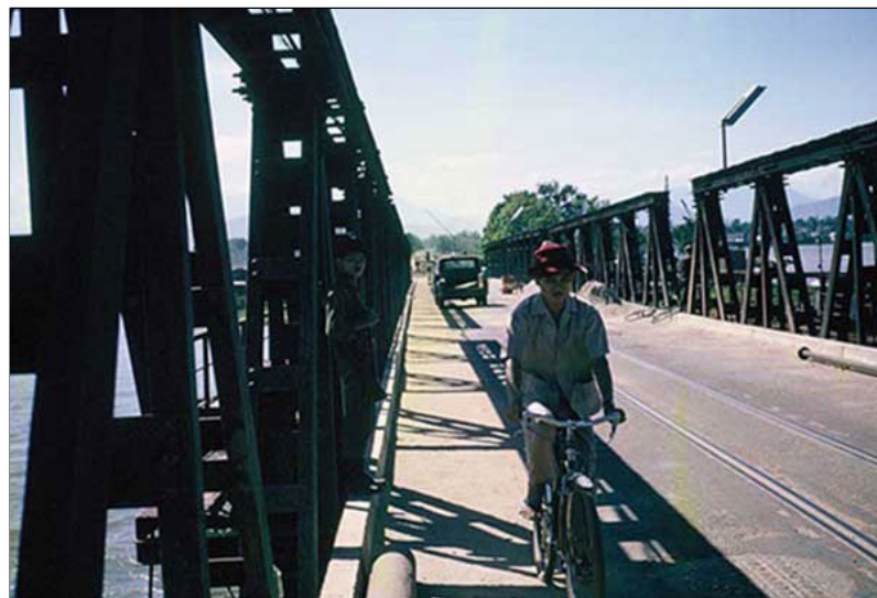
3. China Beach, Đà Nẵng: Bicycles, Pedestrians merge with military and civilian vehicle traffic.