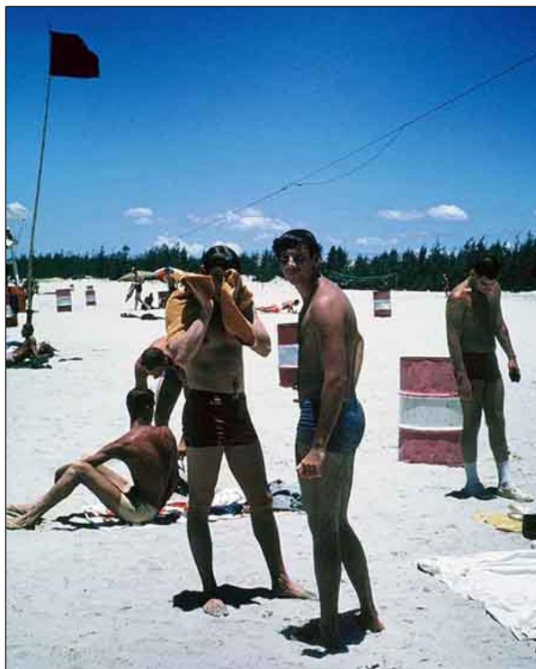
31. China Beach, Đà Nẵng: Hey... did you hear someone say, WOMEN?