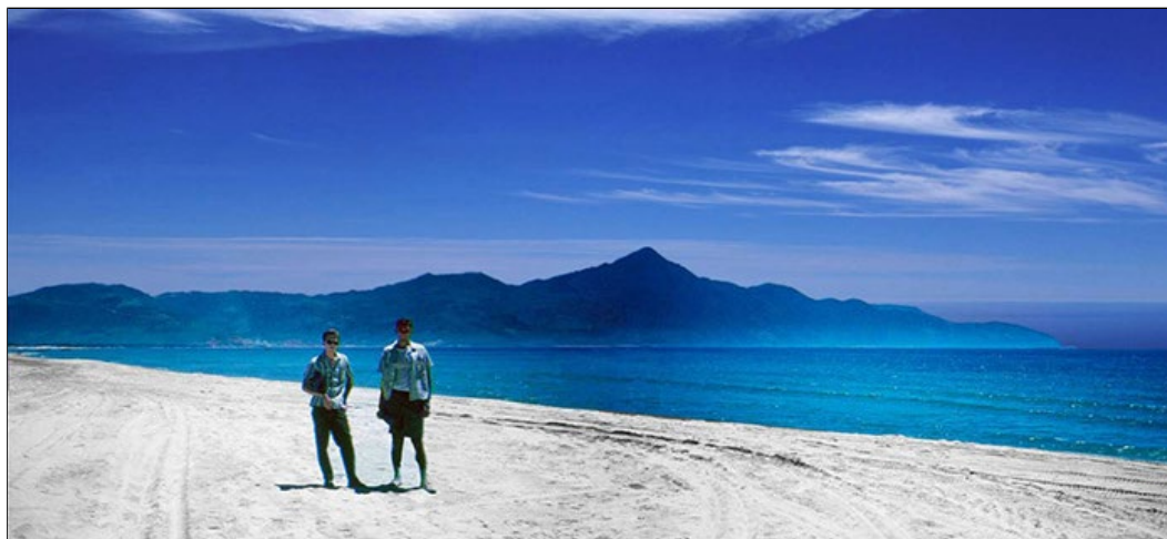
33. China Beach, Đà Nẵng: Just look at that view! Calm, warm waters, and the view!