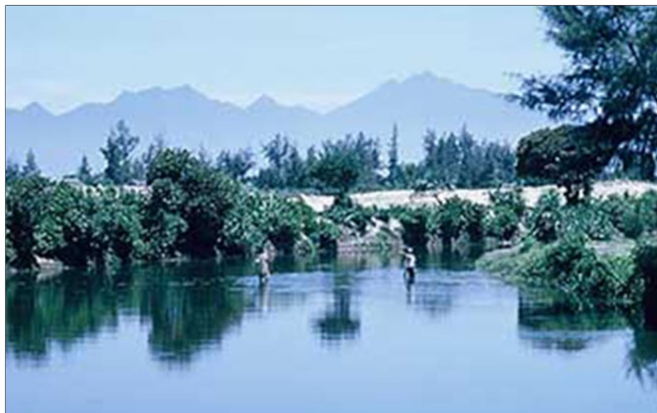
18. China Beach, Đà Nẵng: Fishermen closeup.