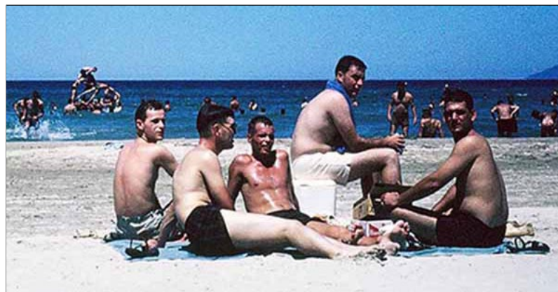
29. China Beach, Đà Nẵng: No way they can claim victory.