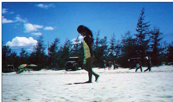
21. China Beach, Đà Nẵng: Hey... WOMAN! a WOMAN! [Several years ago an army soldier emailed that he met this girl at China Beach and married her!]