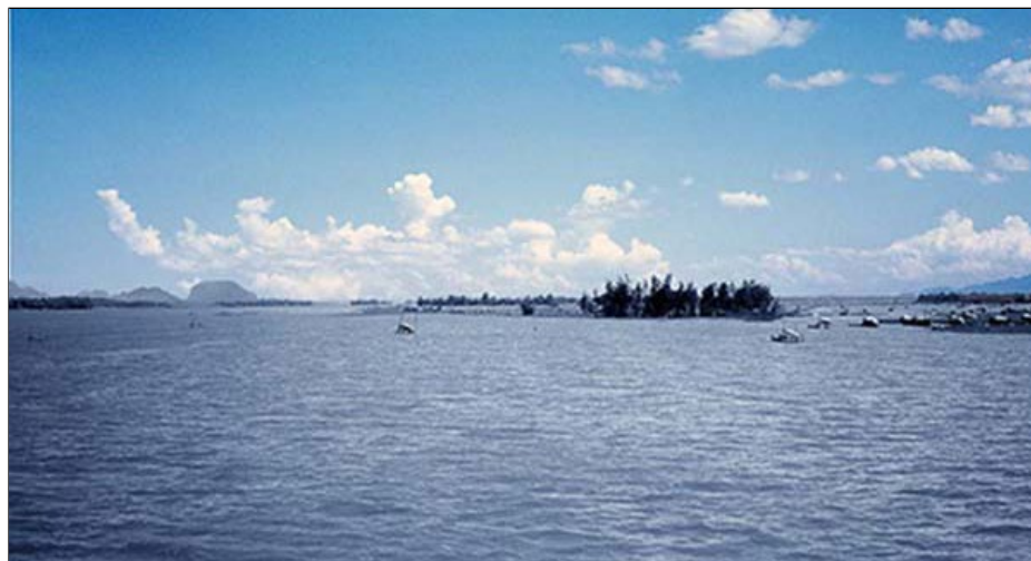
6. China Beach, Đà Nẵng: Marble Mountain, left-center, with sampan fishermen plying their trade.