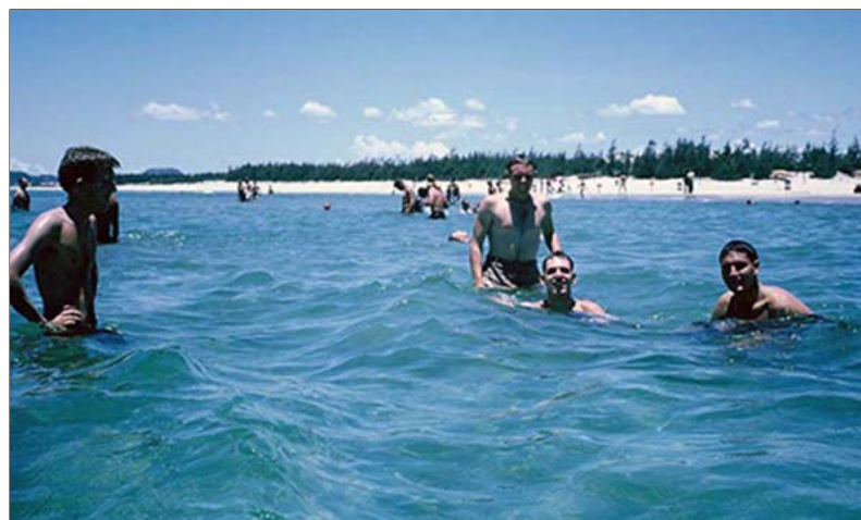
23. China Beach, Đà Nẵng: Hey... watch it!