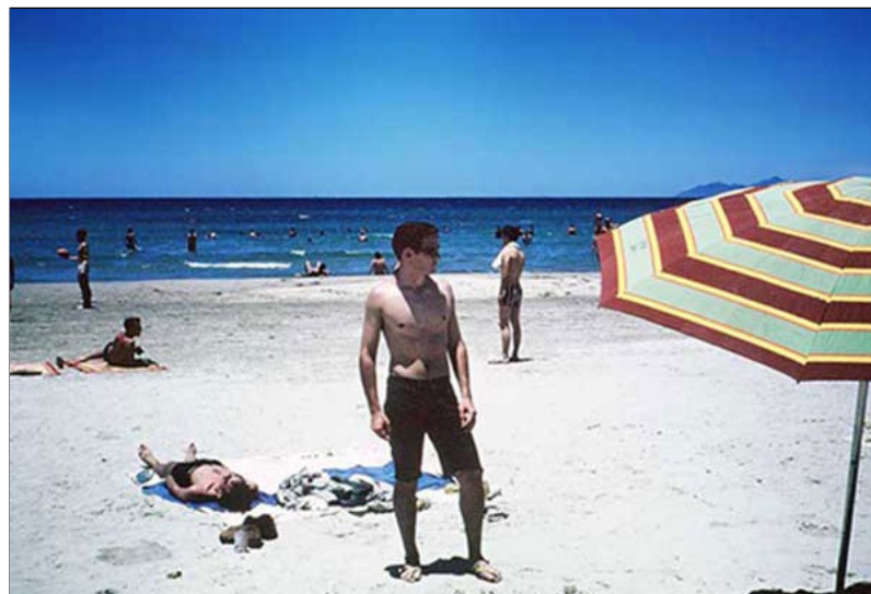
24. China Beach, Đà Nẵng: Look at'em... trying to drown each other! How stupid! I think I'll go out and join'em.