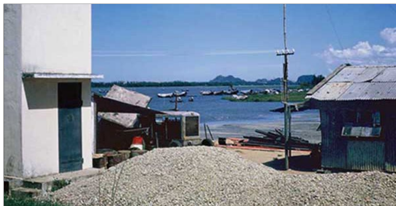
5. China Beach, Đà Nẵng: Scenic views abound on both sides of the road.