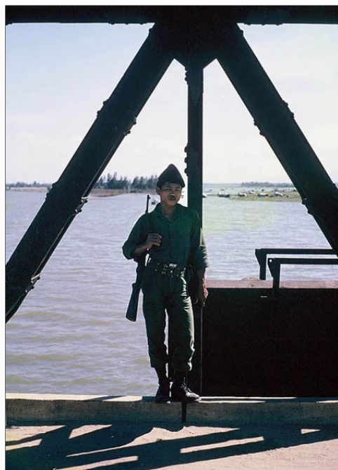
4. China Beach, Đà Nẵng: ARVN Bridge-Guard.