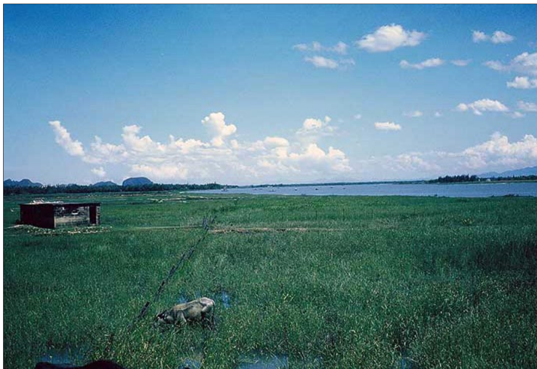
13. China Beach, Đà Nẵng: Marshland, bunkers and water buffalos.