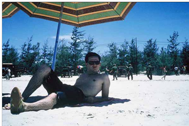
22. China Beach, Đà Nẵng: Look at those fools in the hot sun!