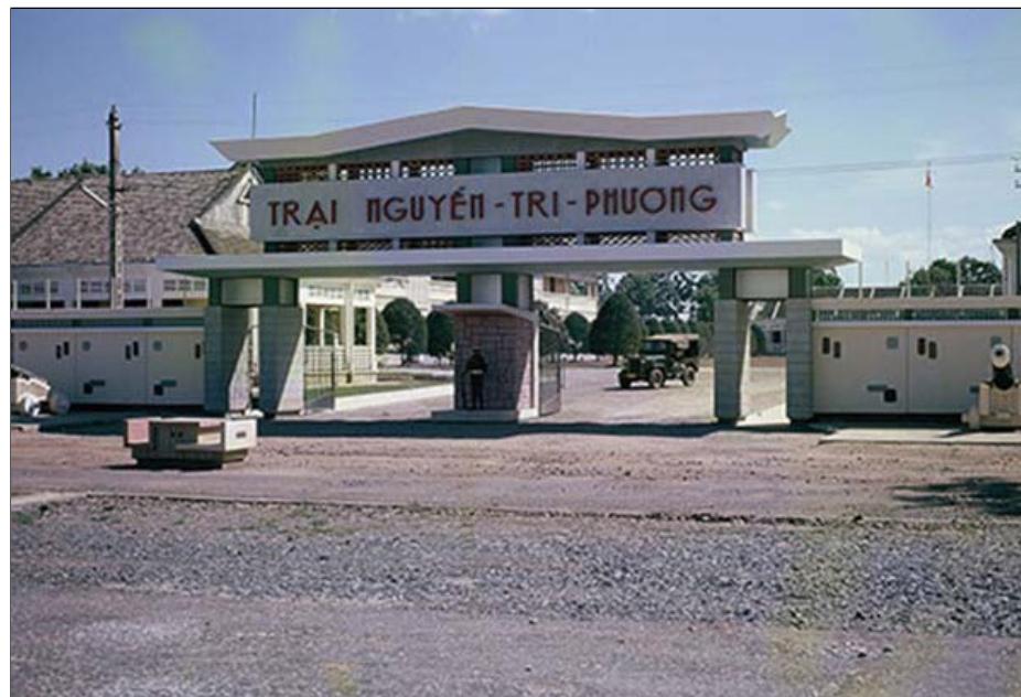
38. China Beach, Đà Nẵng: Road back to Đà Nẵng AB, ARVN government compound.