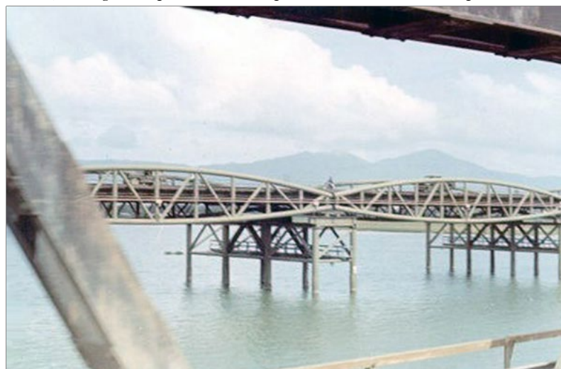
2. China Beach, Đà Nẵng: Parallel bridge.