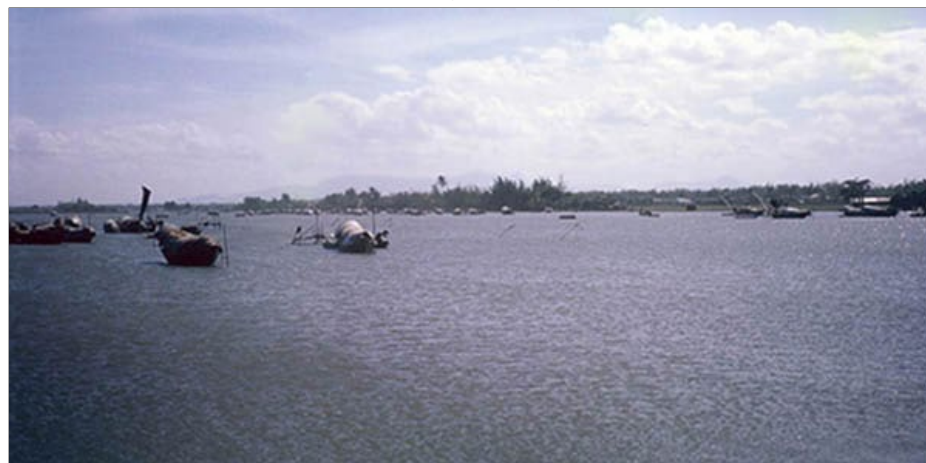
9. China Beach, Đà Nẵng: Sampans at anchor.