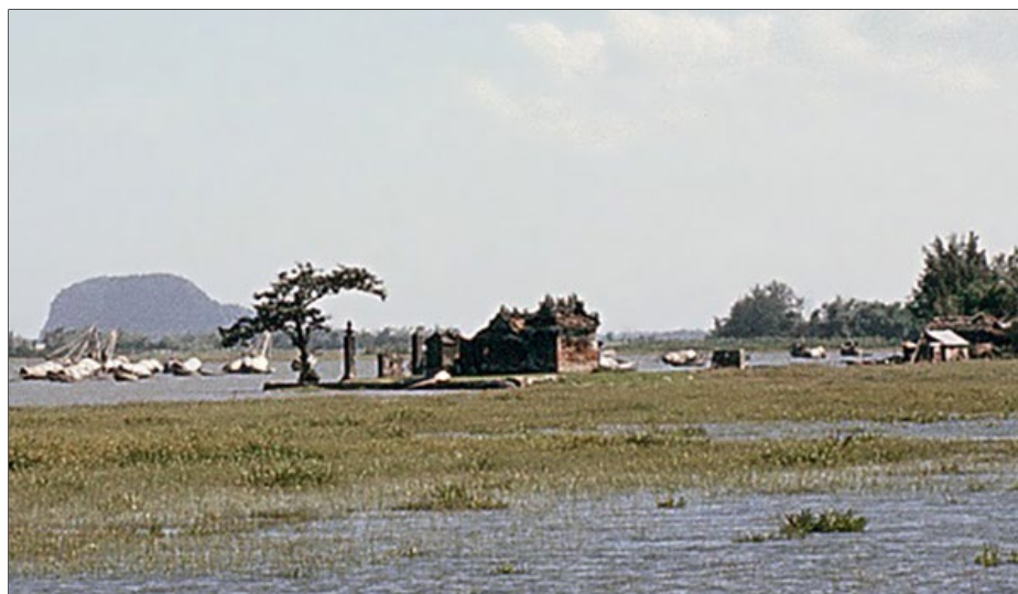
16. China Beach, Đà Nẵng: Pagoda closeup.