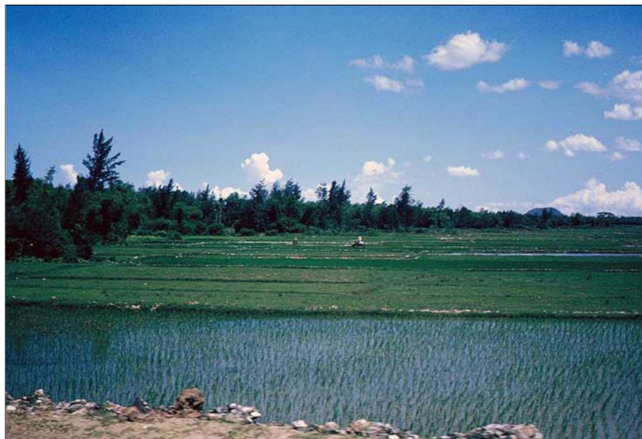
12. China Beach, Đà Nẵng: Rice Paddies.