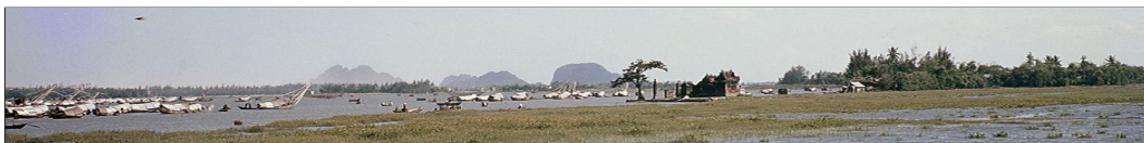
15. Click photo to see full panorama photo.