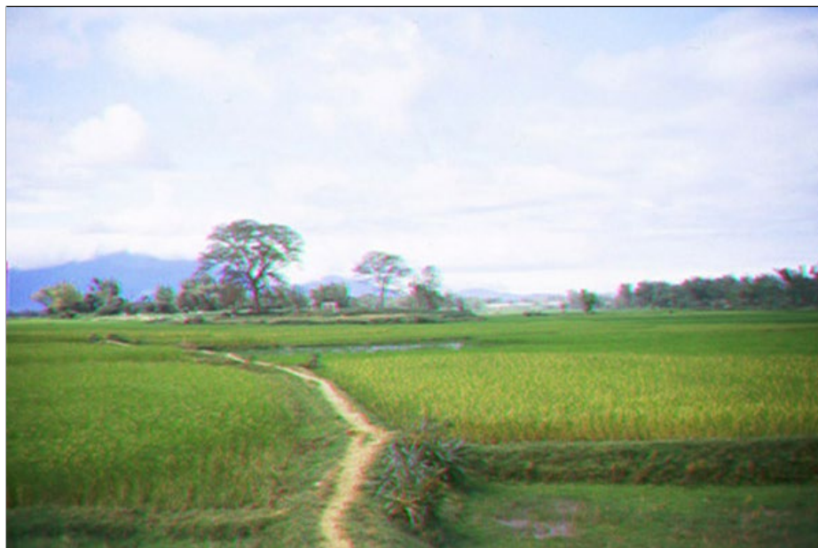
19. China Beach, Đà Nẵng: Rice fields and paddies, with Temple (center).