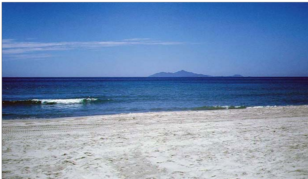
34. China Beach, Đà Nẵng: Yeah. Tourist will pay bazillions to see this. Just think... the USA's just over the horizon that'a'way.