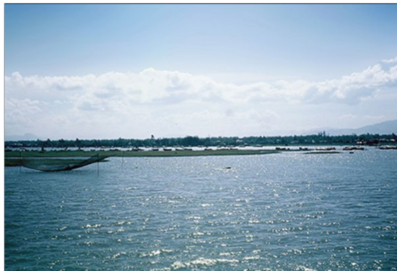
8. China Beach, Đà Nẵng: Tidal fishing nets at low tide.