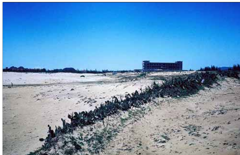
20. China Beach, Đà Nẵng: After the war... I'm goona build me a hotel right there!