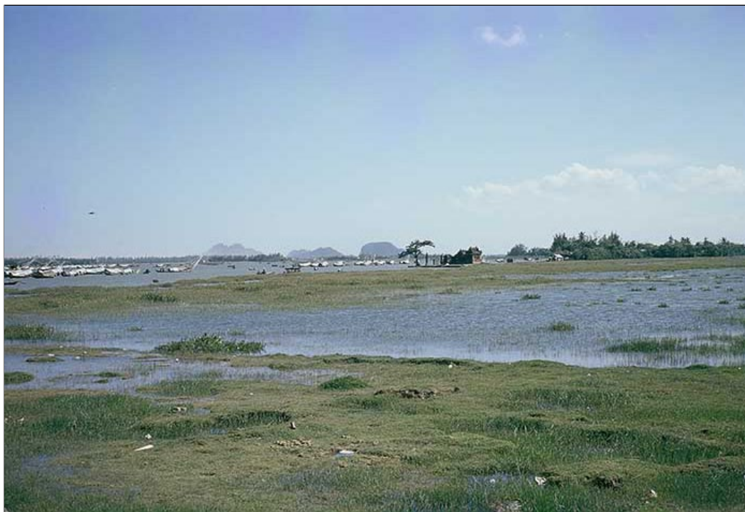
14. China Beach, Đà Nẵng: Sampans and shoreline Pagado (center).