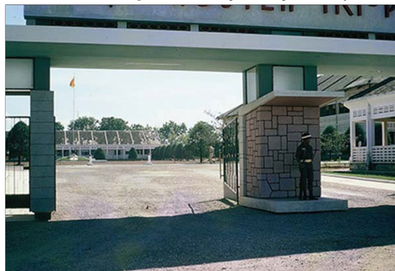
39. China Beach, Đà Nẵng: Close up of ARVN gate guard.