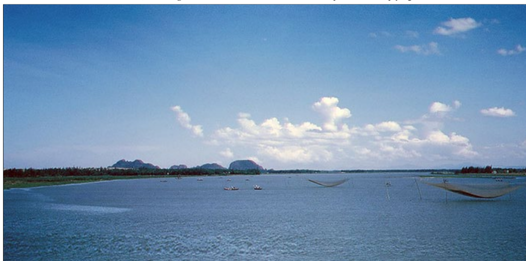
7. China Beach, Đà Nẵng: Tidal fishing nets at low tide.