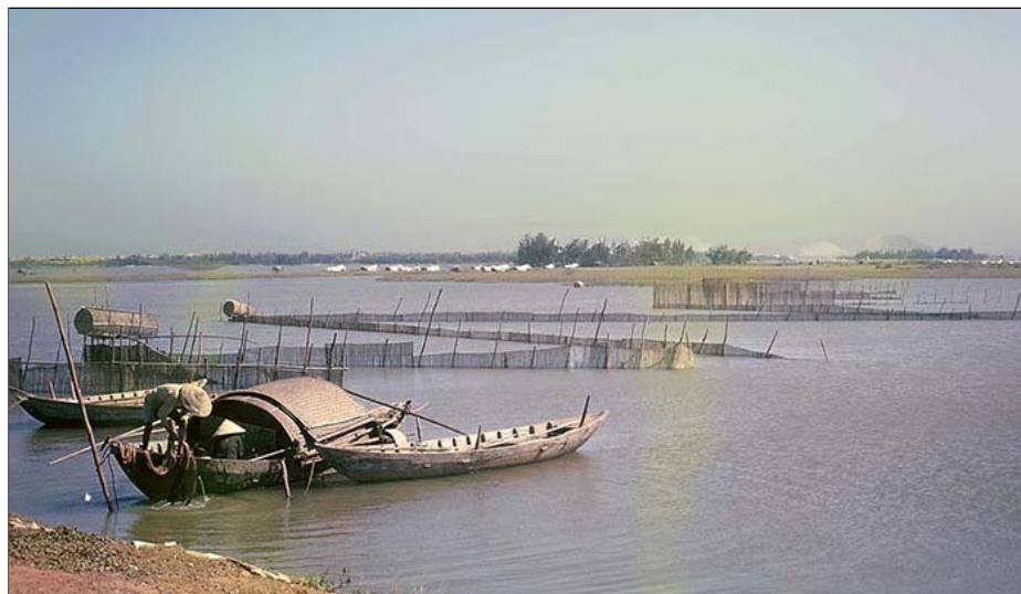
10. China Beach, Đà Nẵng: Fishermen mending nets.