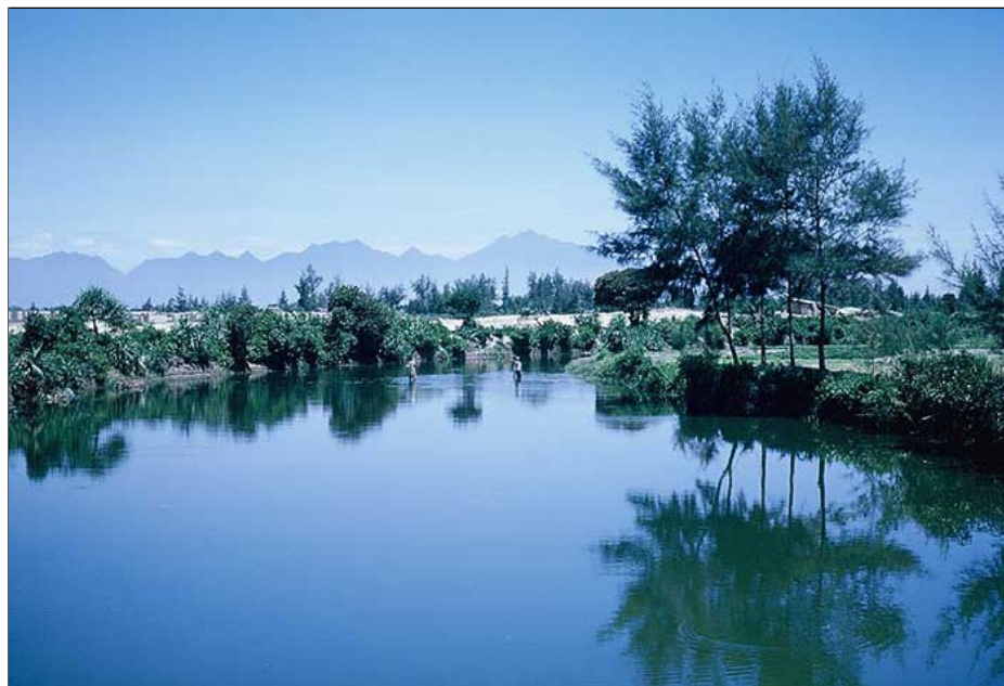
17. China Beach, Đà Nẵng: Fishermen.