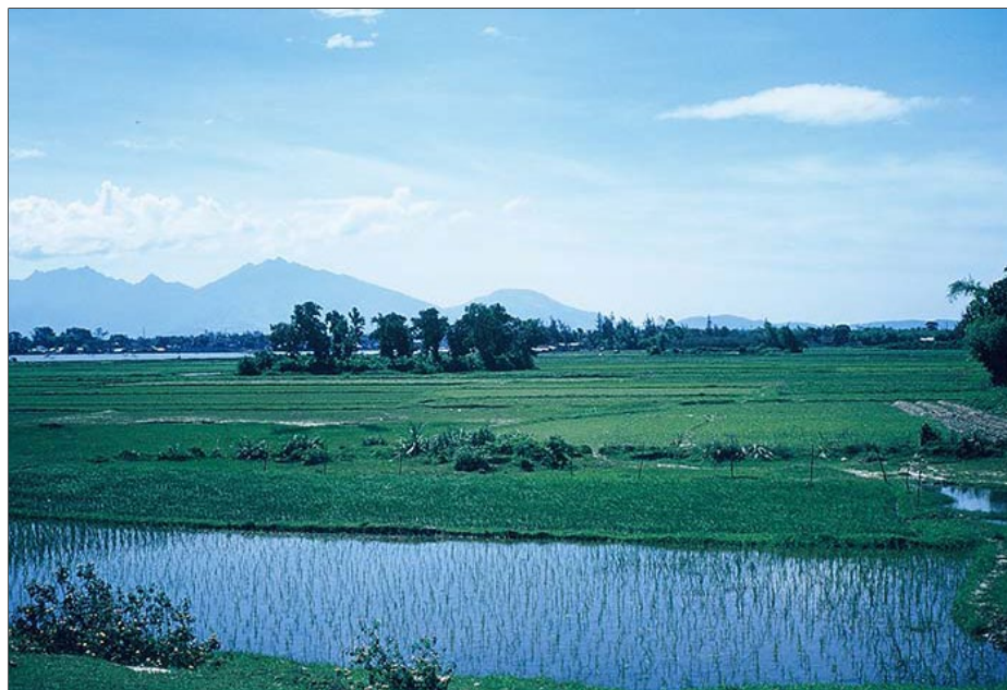
11. China Beach, Đà Nẵng: Rice Paddies.