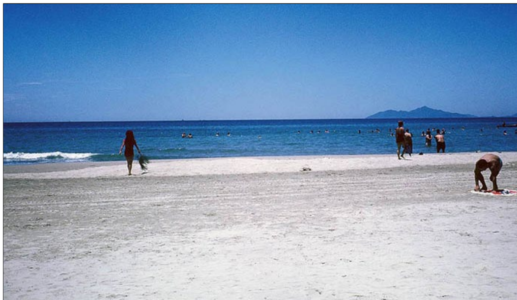
35. China Beach, Đà Nẵng: ... and there she goes! Your face scared her off!