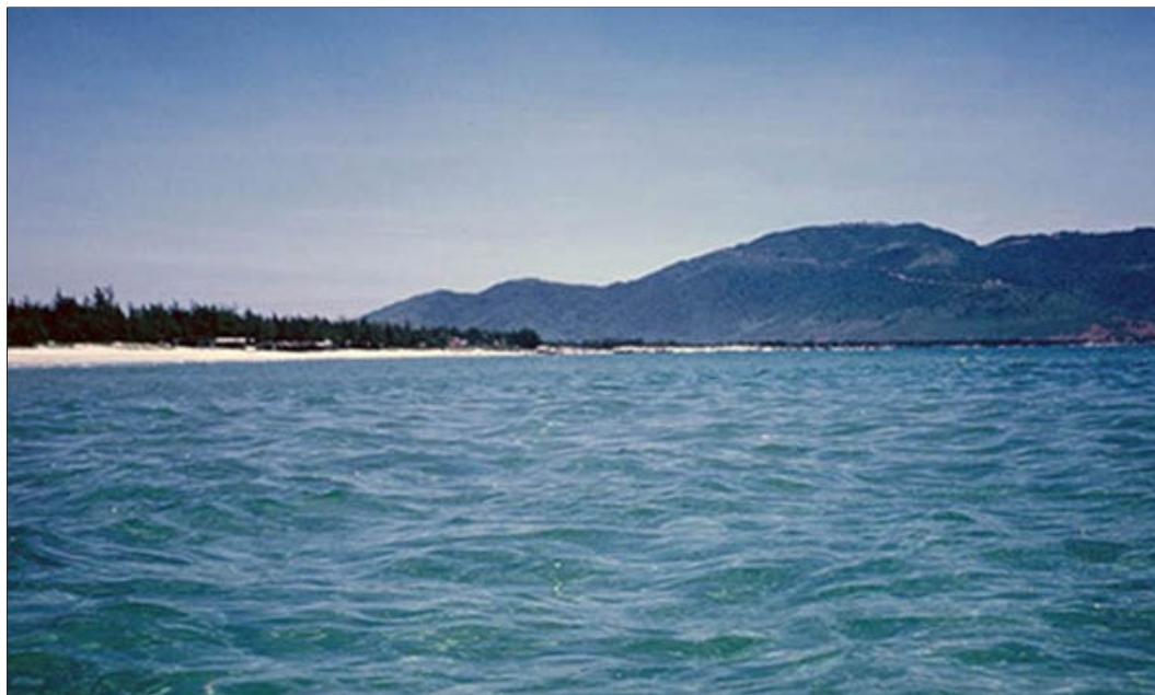
32. China Beach, Đà Nẵng: Wading 200 yards off shore and still at waist-deep! Monkey Mountain in background.