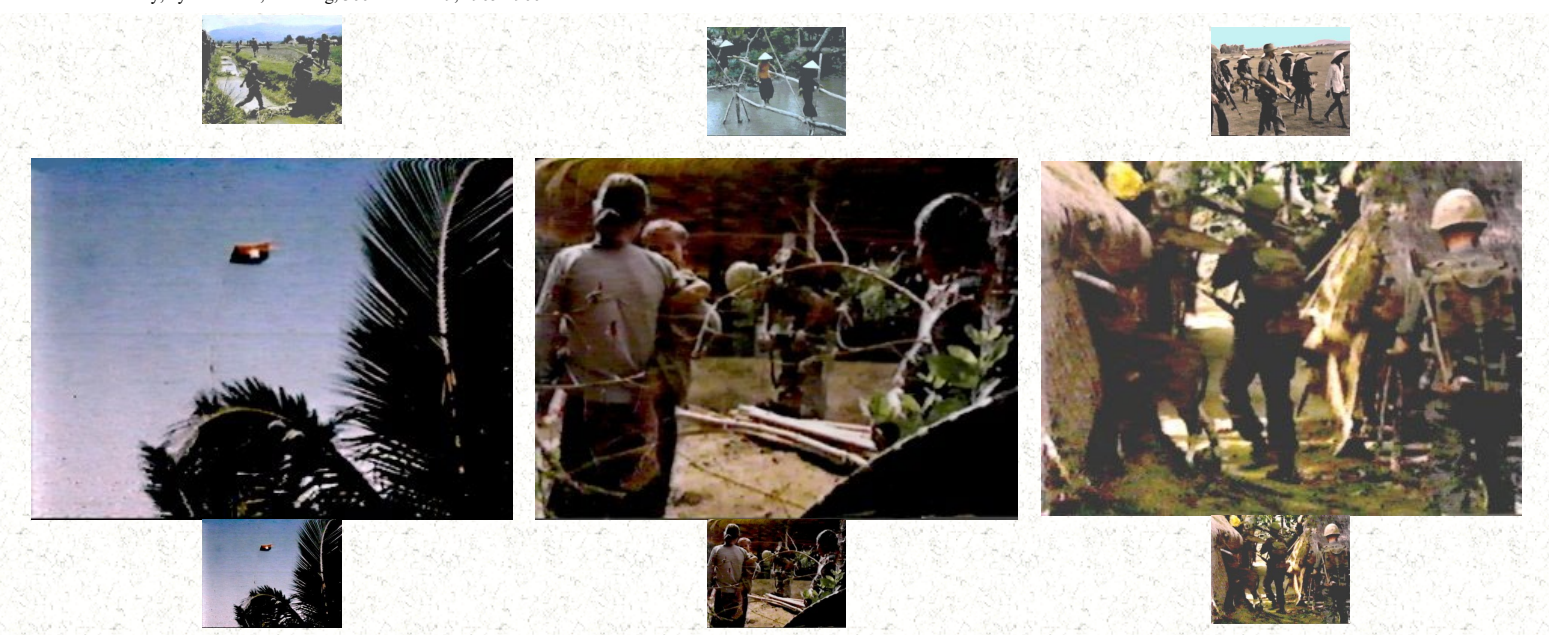
Page-1 • Page-2 • Page-3 • Page-4 • Page-5