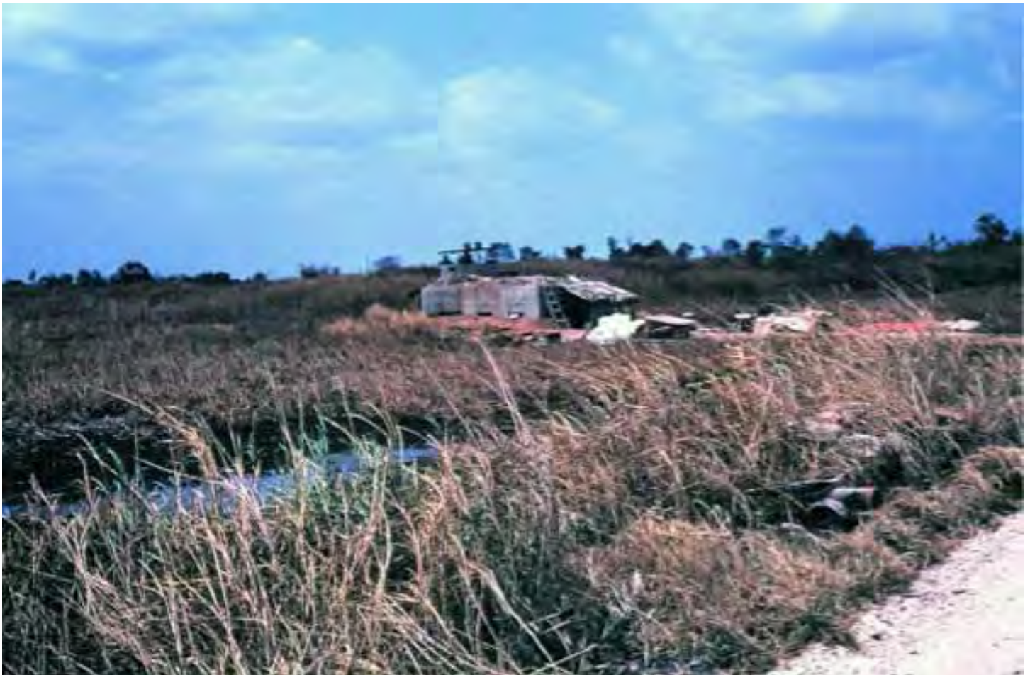
17: Binh Thuy AB, perimeter bunker.