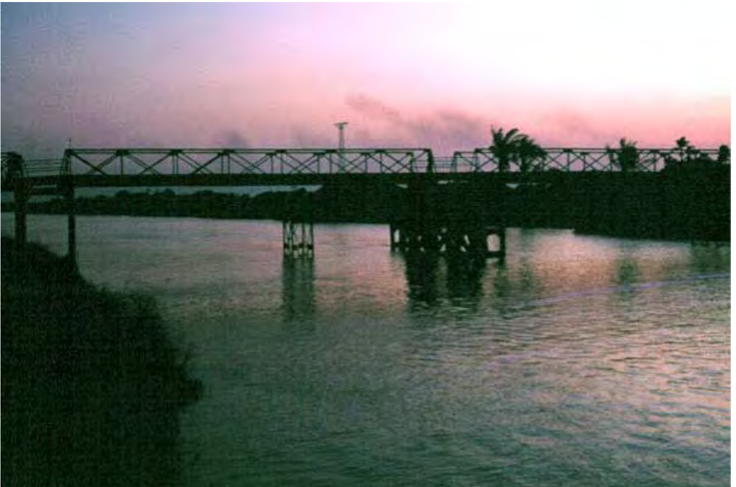
7: Binh Thuy AB, Bridge.