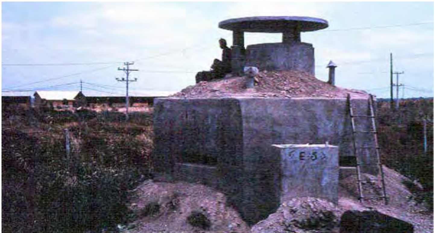
22: Binh Thuy AB, perimeter bunker.