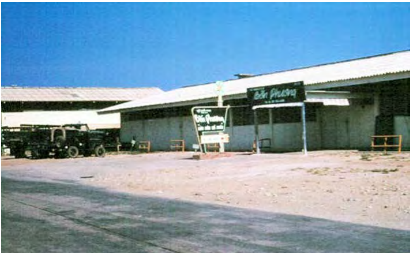
15 Binh Thuy AB.