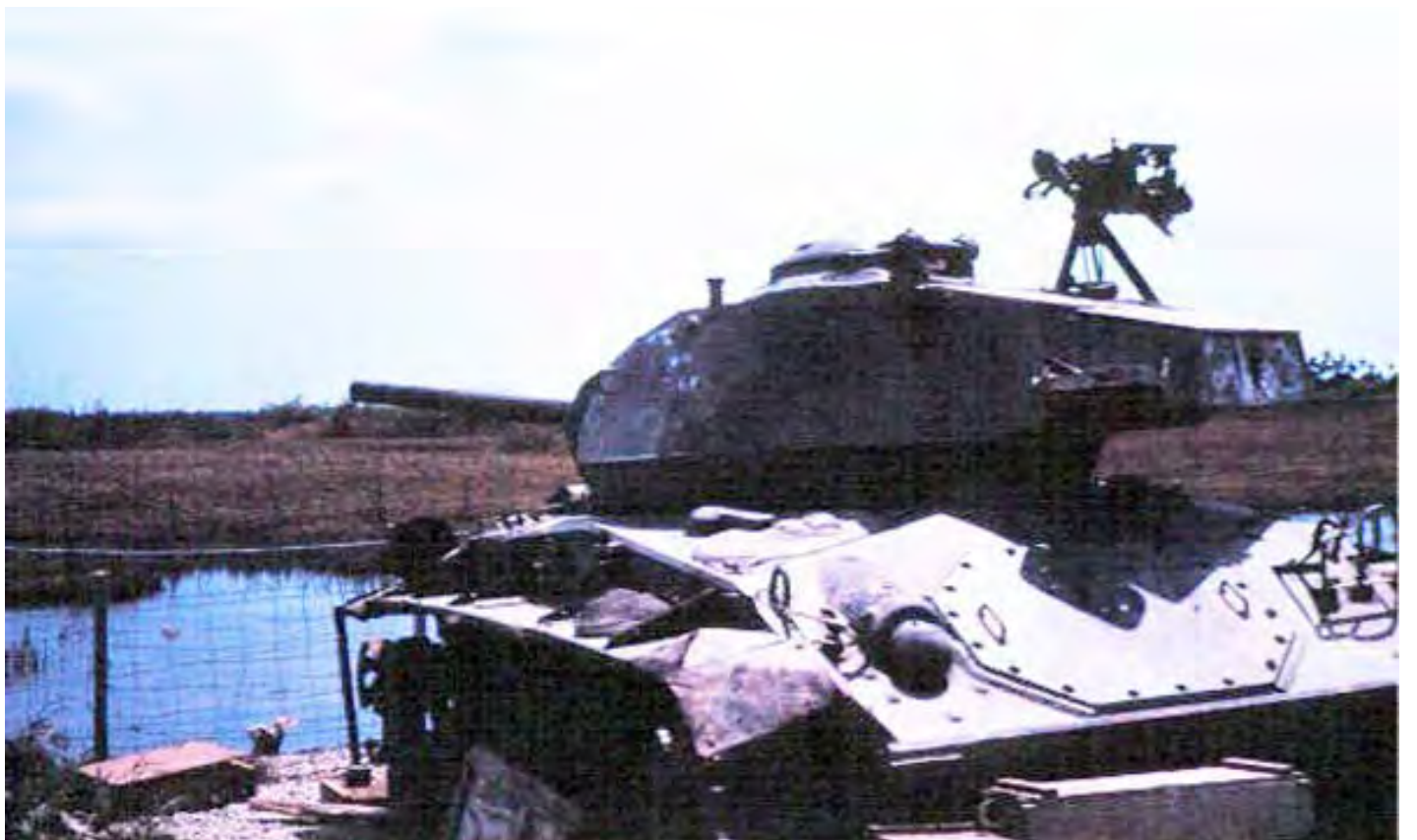
21 Binh Thuy AB, perimeter tank.