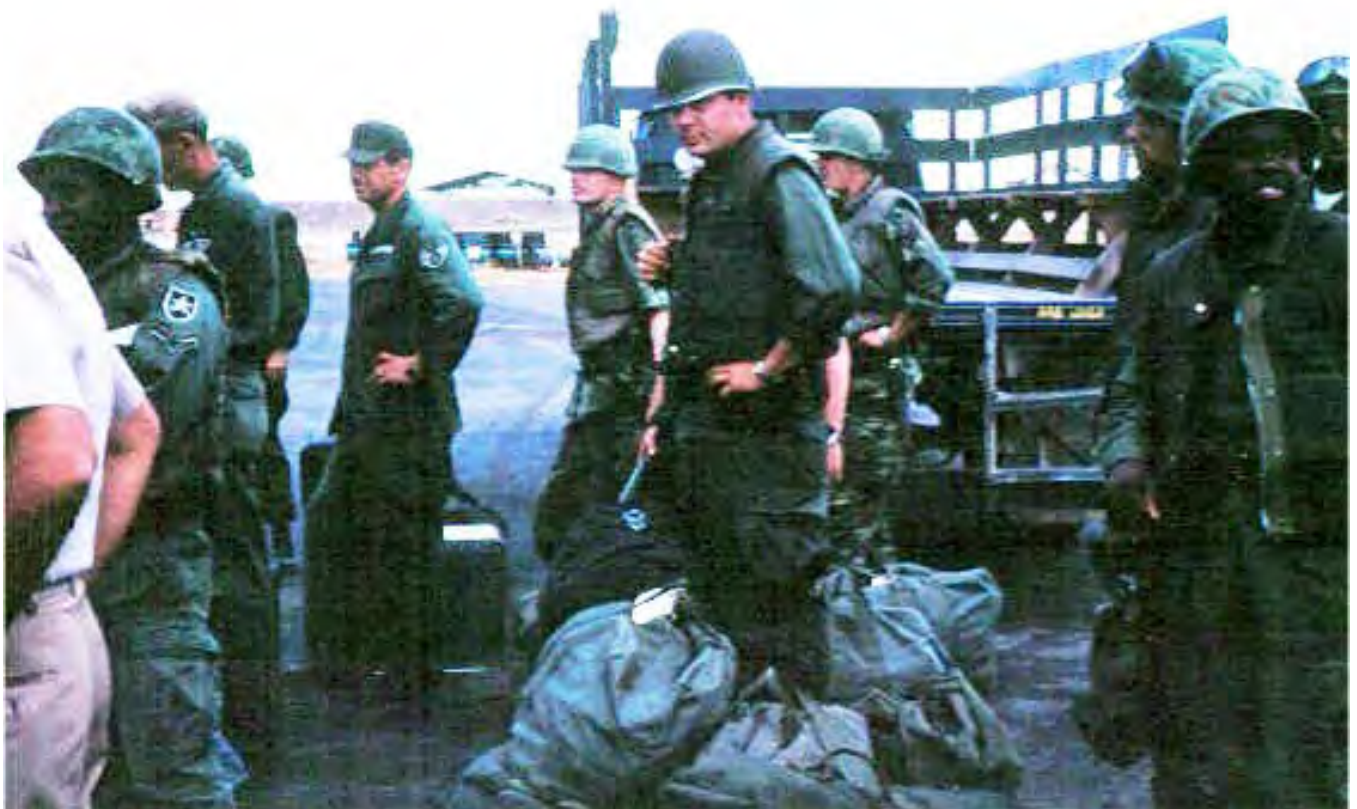
23: Binh Thuy AB, SPS.