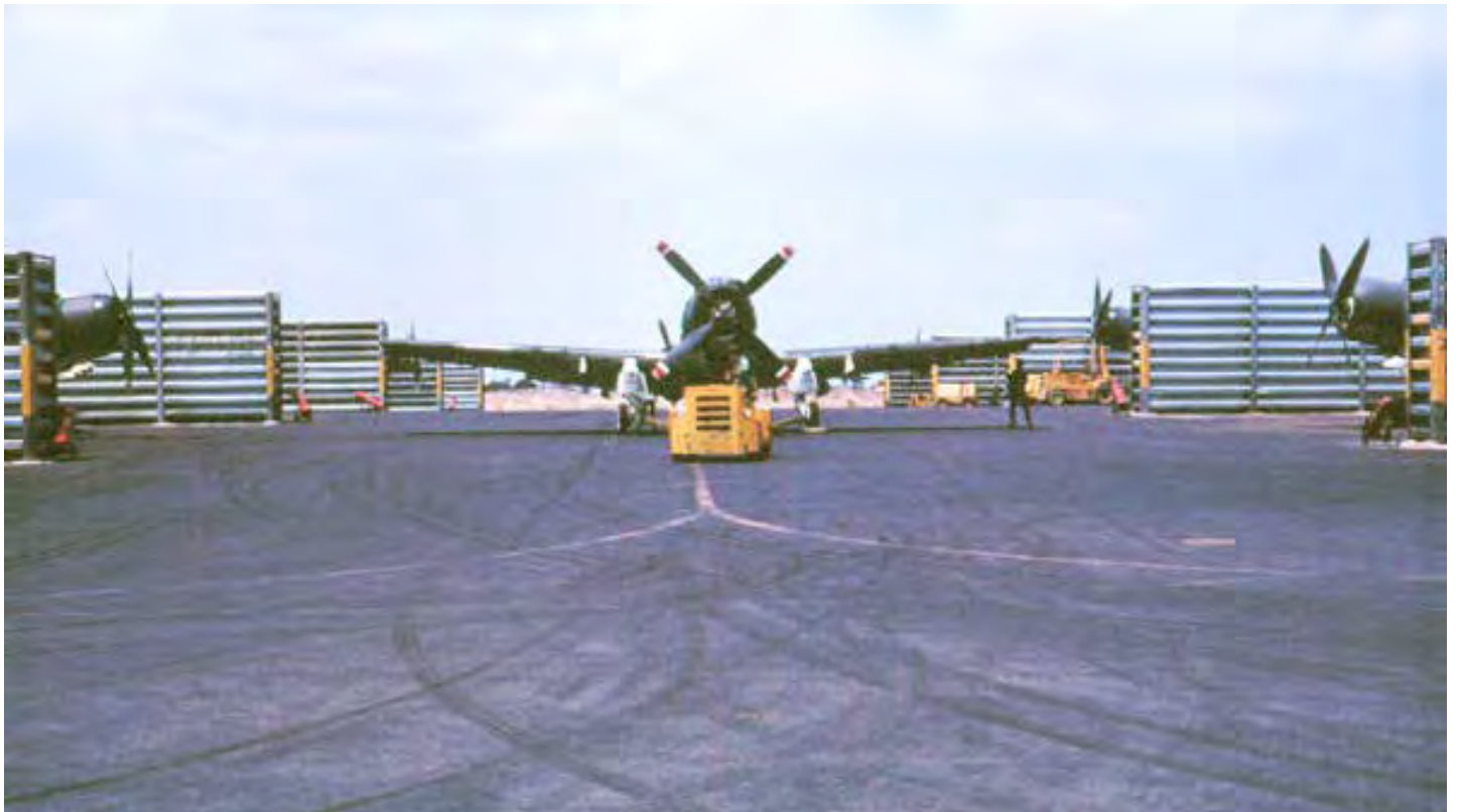
3: Binh Thuy AB, A-1E flight line.