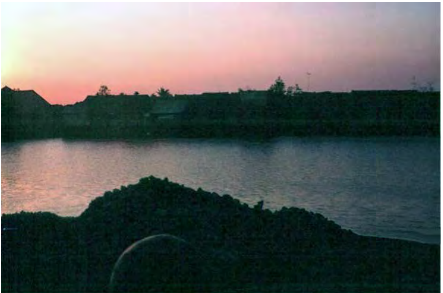
9 Binh Thuy AB, Tower view.