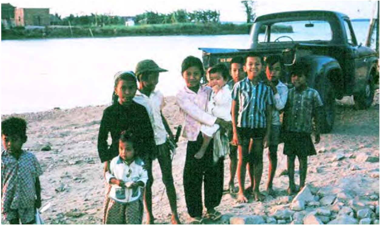
10 Binh Thuy AB, children mugging for camera.