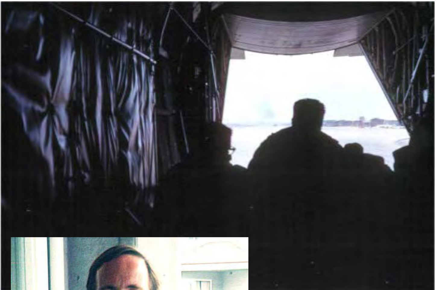
24: Binh Thuy AB, SPS in Caribou(?), taxiing on flight line.