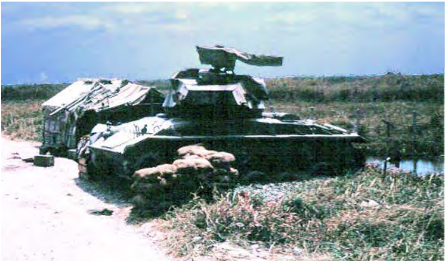
19: Binh Thuy AB, perimeter with tank.