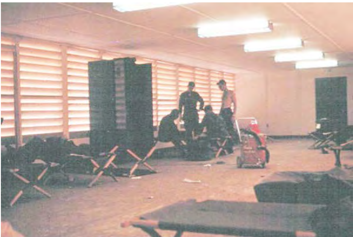
13: Binh Thuy AB, SPs setting up hooch with lockers and cots.