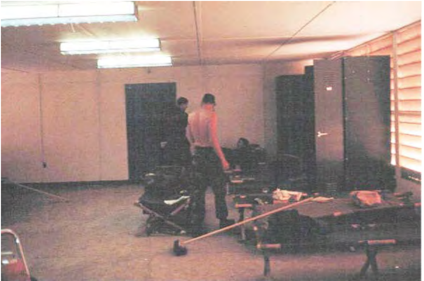
14: Binh Thuy AB, SPs setting up hooch with lockers and cots.