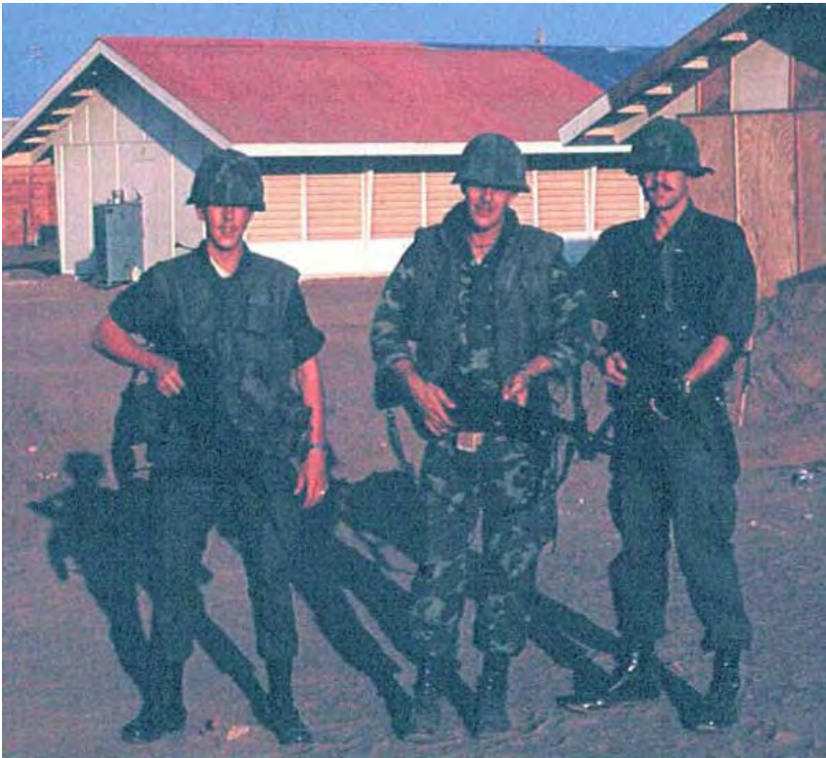
12 Binh Thuy AB, SPs.