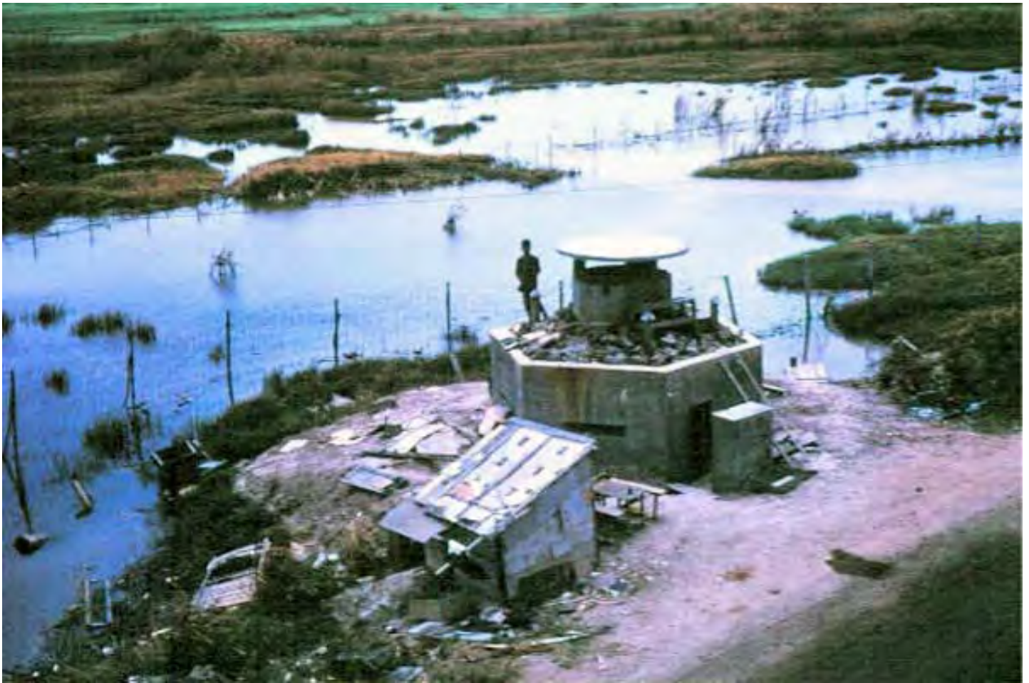
18: Binh Thuy AB, perimeter bunker overlooking marsh.