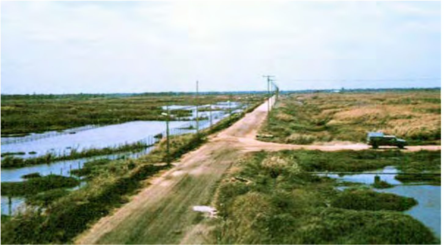
16: Binh Thuy AB, perimeter road.