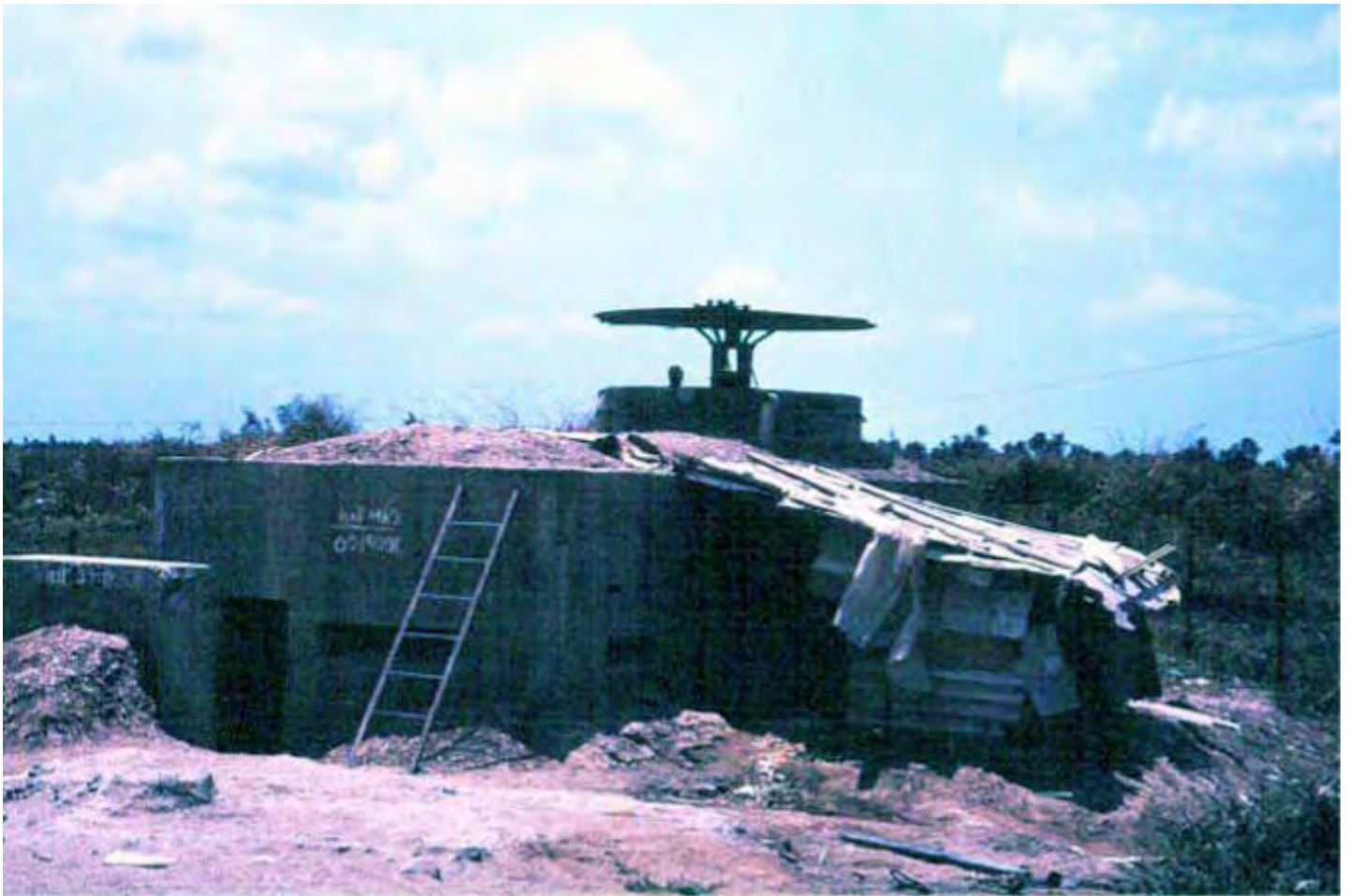
20: Binh Thuy AB, perimeter bunker.