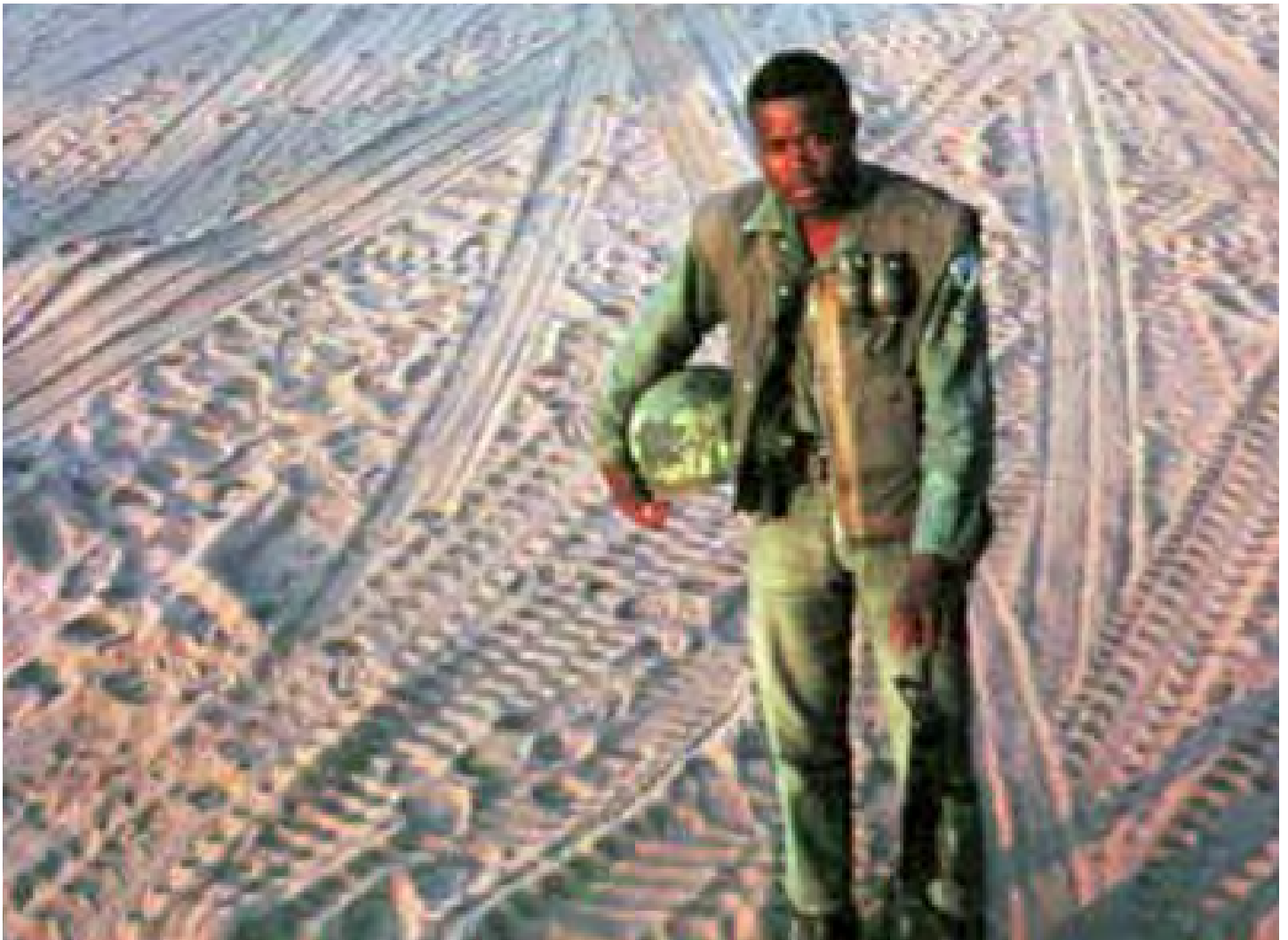
11: Binh Thuy AB, SP.