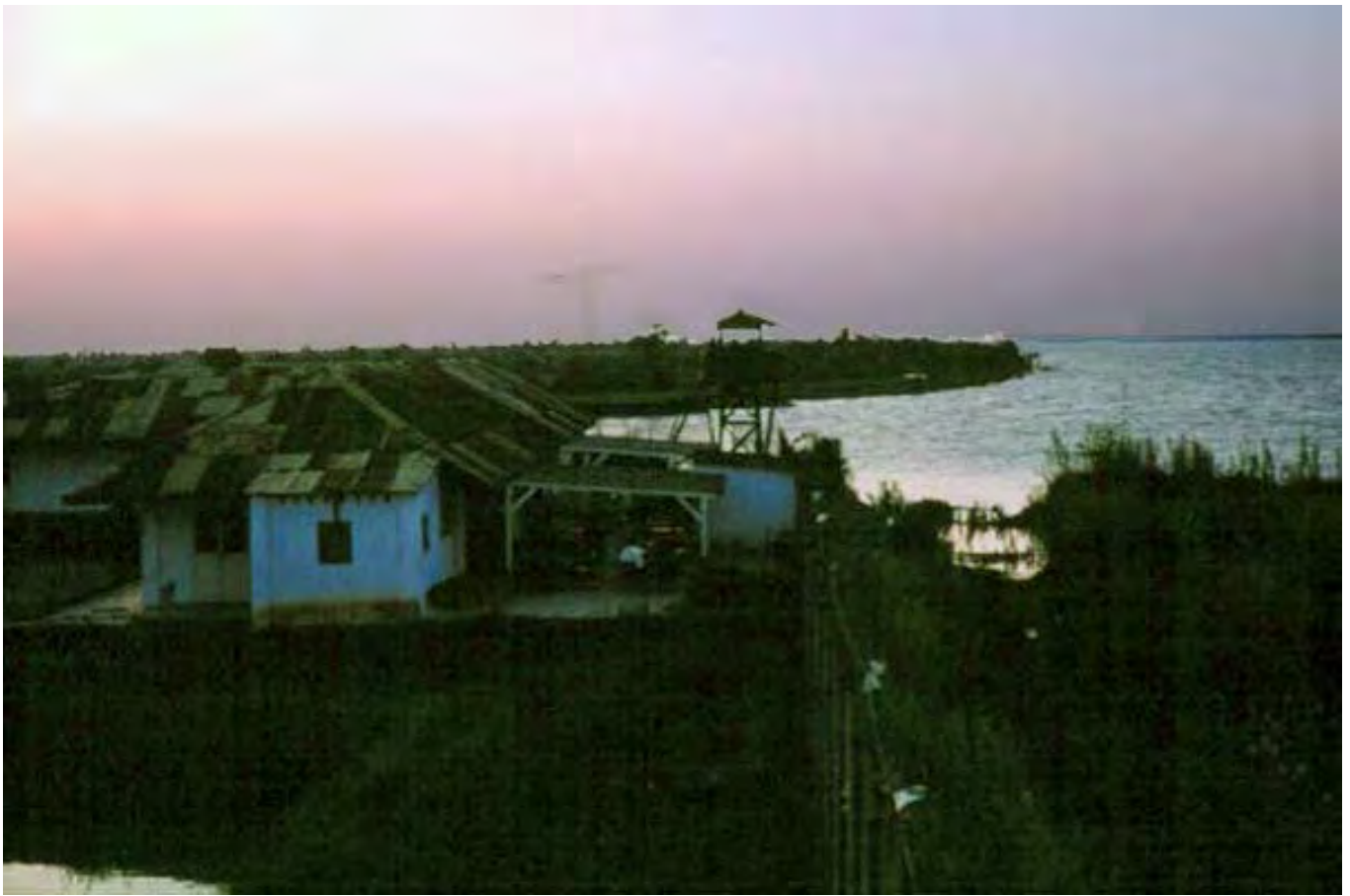
8: Binh Thuy AB, Tower (photo center).