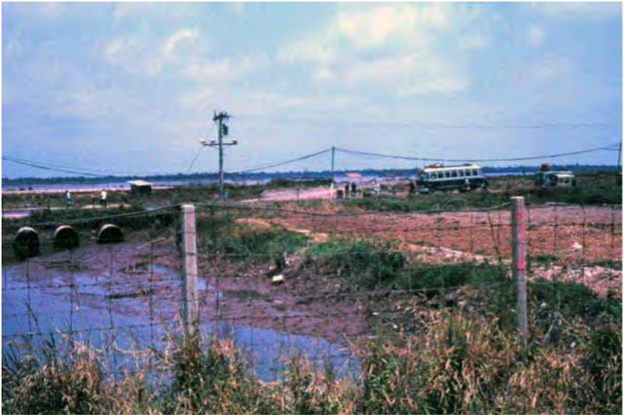
6: Binh Thuy AB, Gate checking bus.