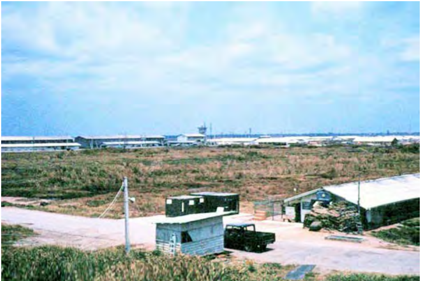
5: Binh Thuy AB, Gate.