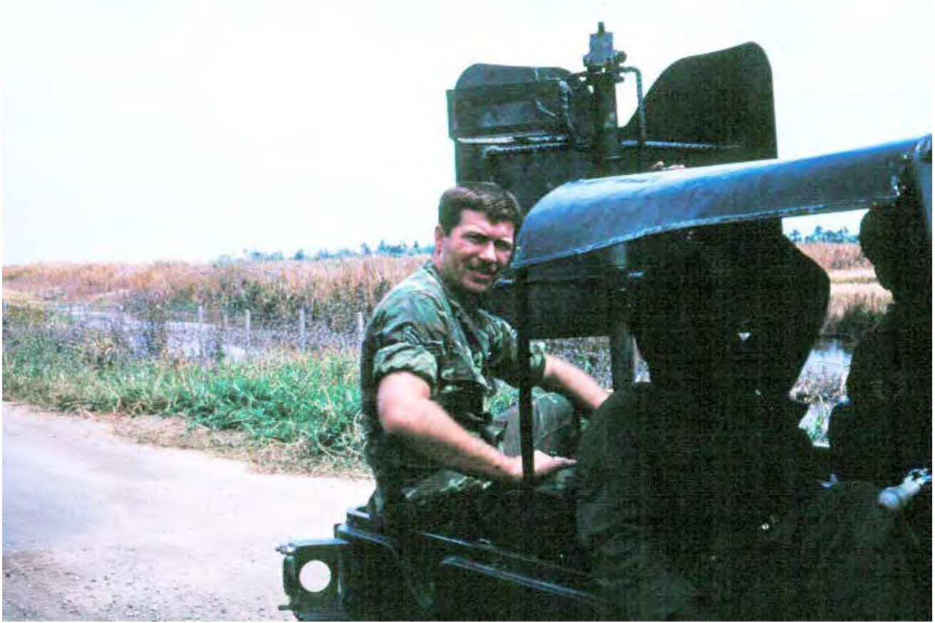
2: Binh Thuy AB, perimeter road.