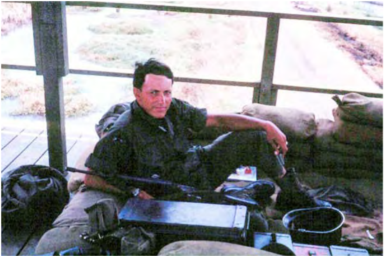
4: Binh Thuy AB, Perimeter Tower.