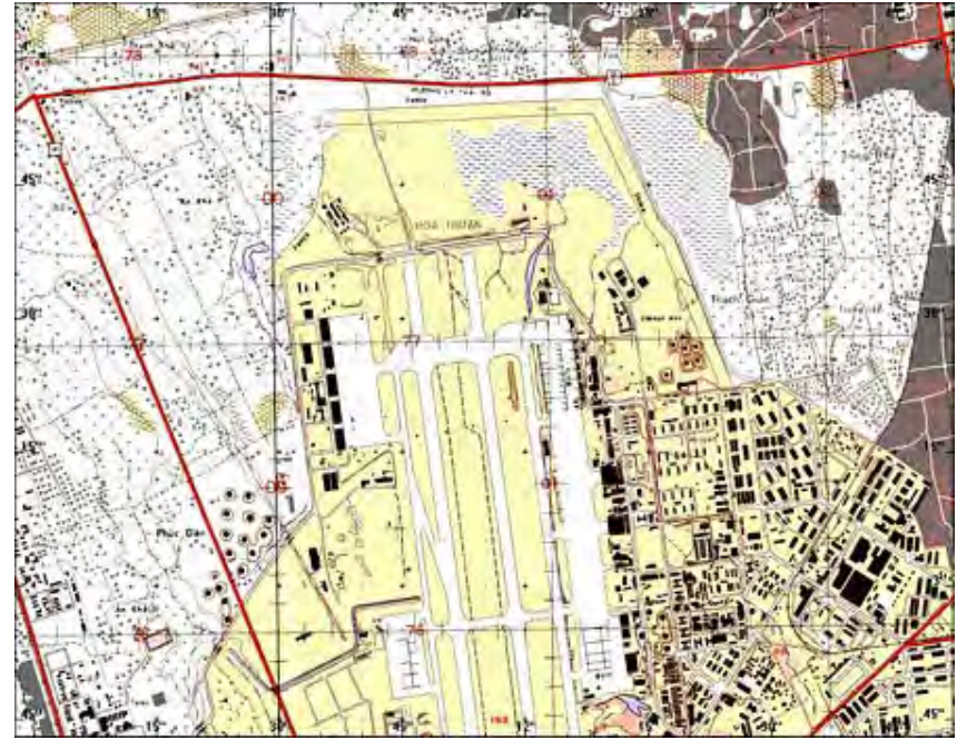
40. Đà Nẵng AB. Map.