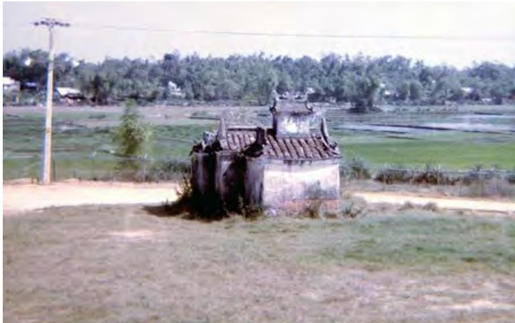
31.& 32. Đà Nẵng AB, East perimeter Road. K-9 and handler.