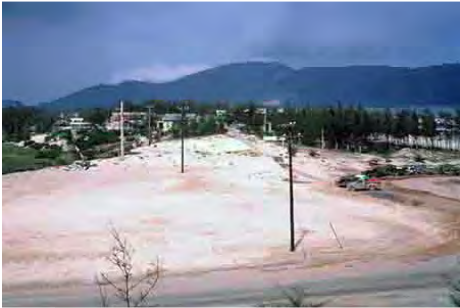
34. Road from Đà Nẵng AB to China Beach. View of Monkey Mountain.