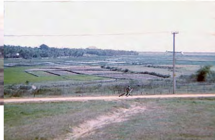
30. Đà Nẵng AB. East perimeter road Pagoda.