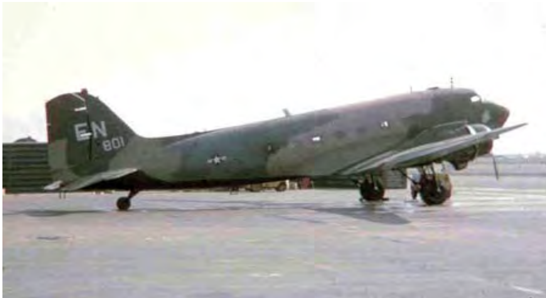
16. Đà Nẵng AB, flight line. C-47 Spooky.