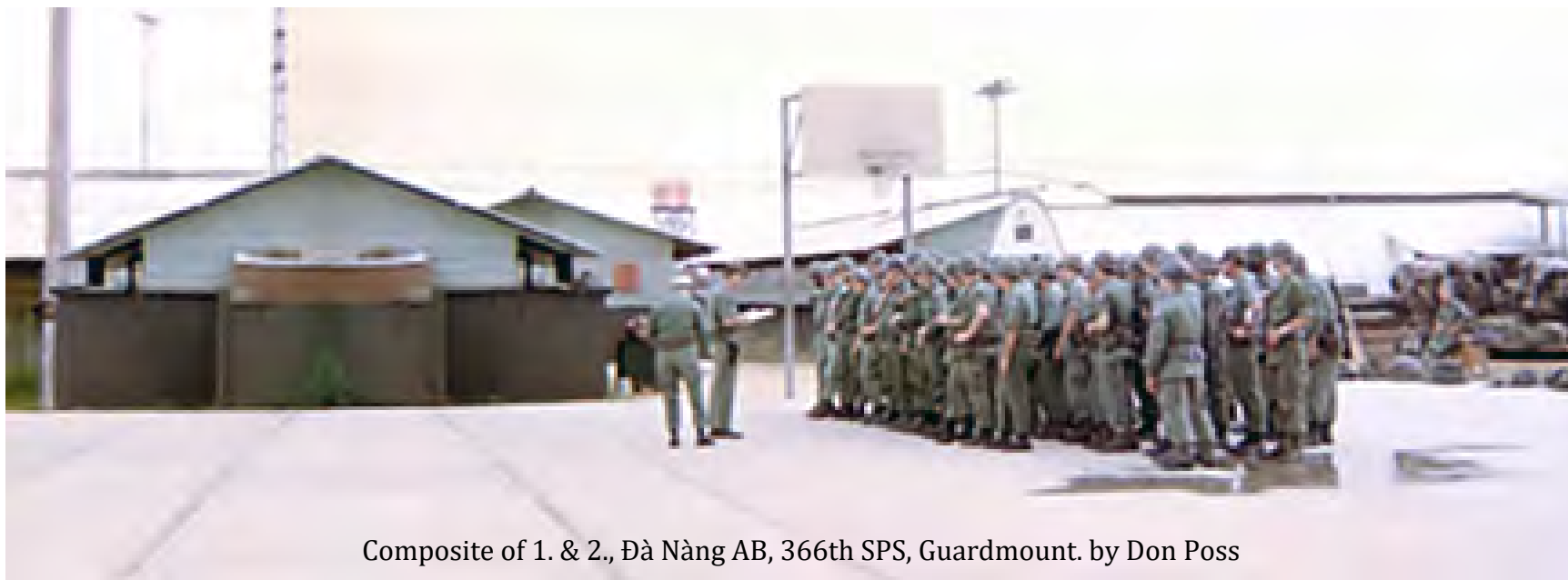
Composite of 1. & 2., Đà Nẵng AB, 366th SPS, Guardmount.