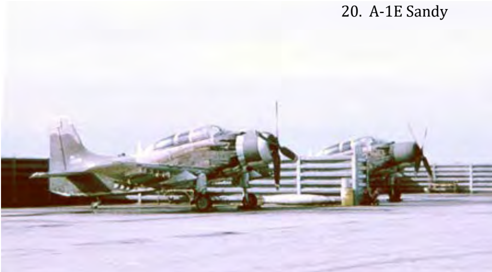
20. A-1E Sandy