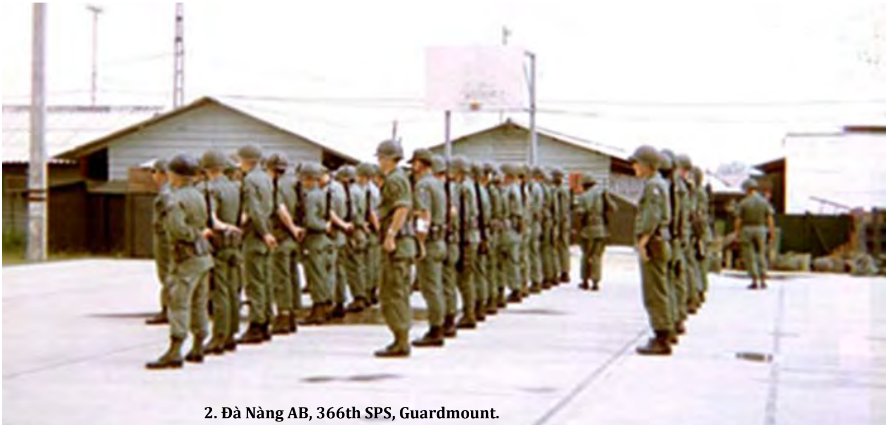
2. Đà Nẵng AB, 366th SPS, Guardmount.