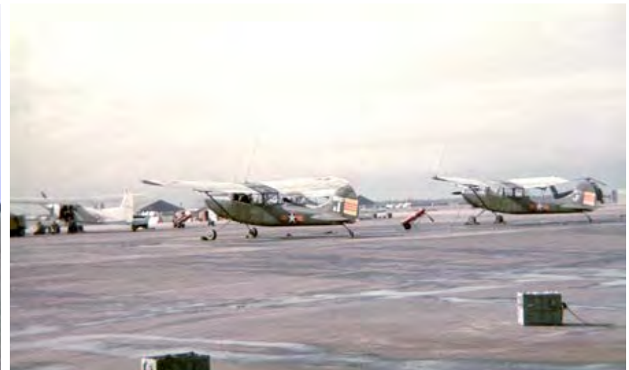
13. VNAF Bird dog FACs.