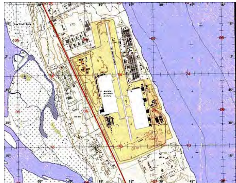
42. Đà Nẵng AB. Map.