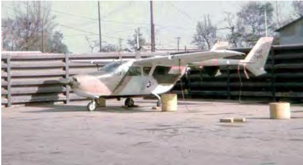
14. Đà Nẵng AB, flight line, O-2 (push/pull).