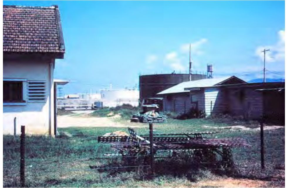
8. POL tanks (center).