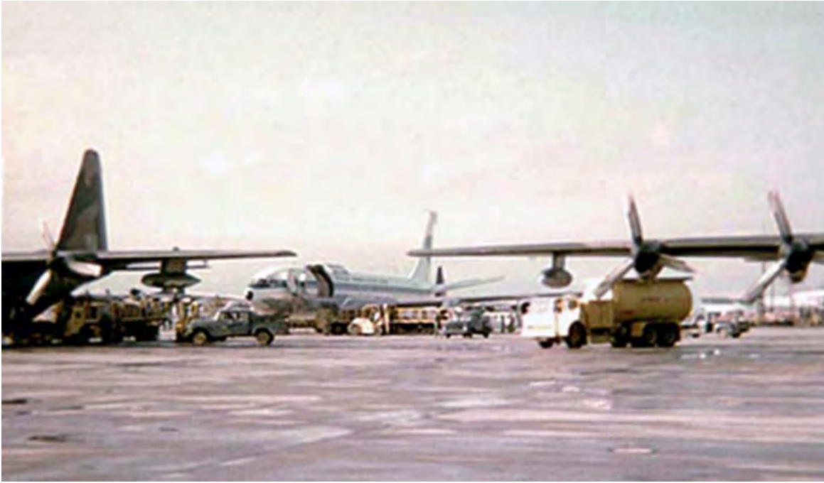
28. Đà Nẵng AB. flight line Freedom Bird.