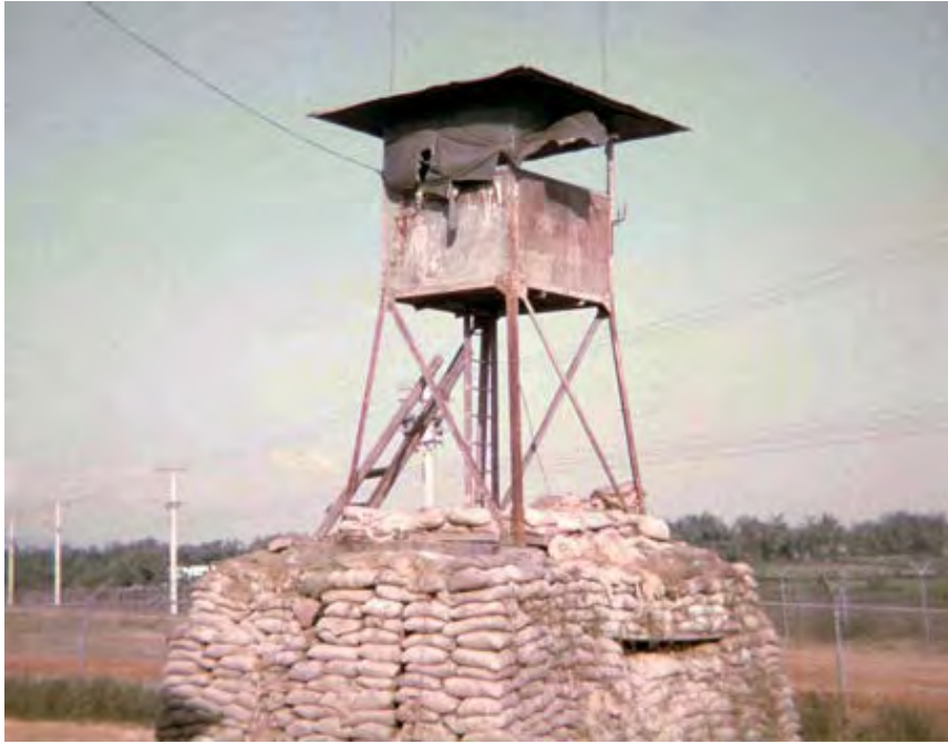
29. Đà Nẵng AB, East perimeter SP Tower.