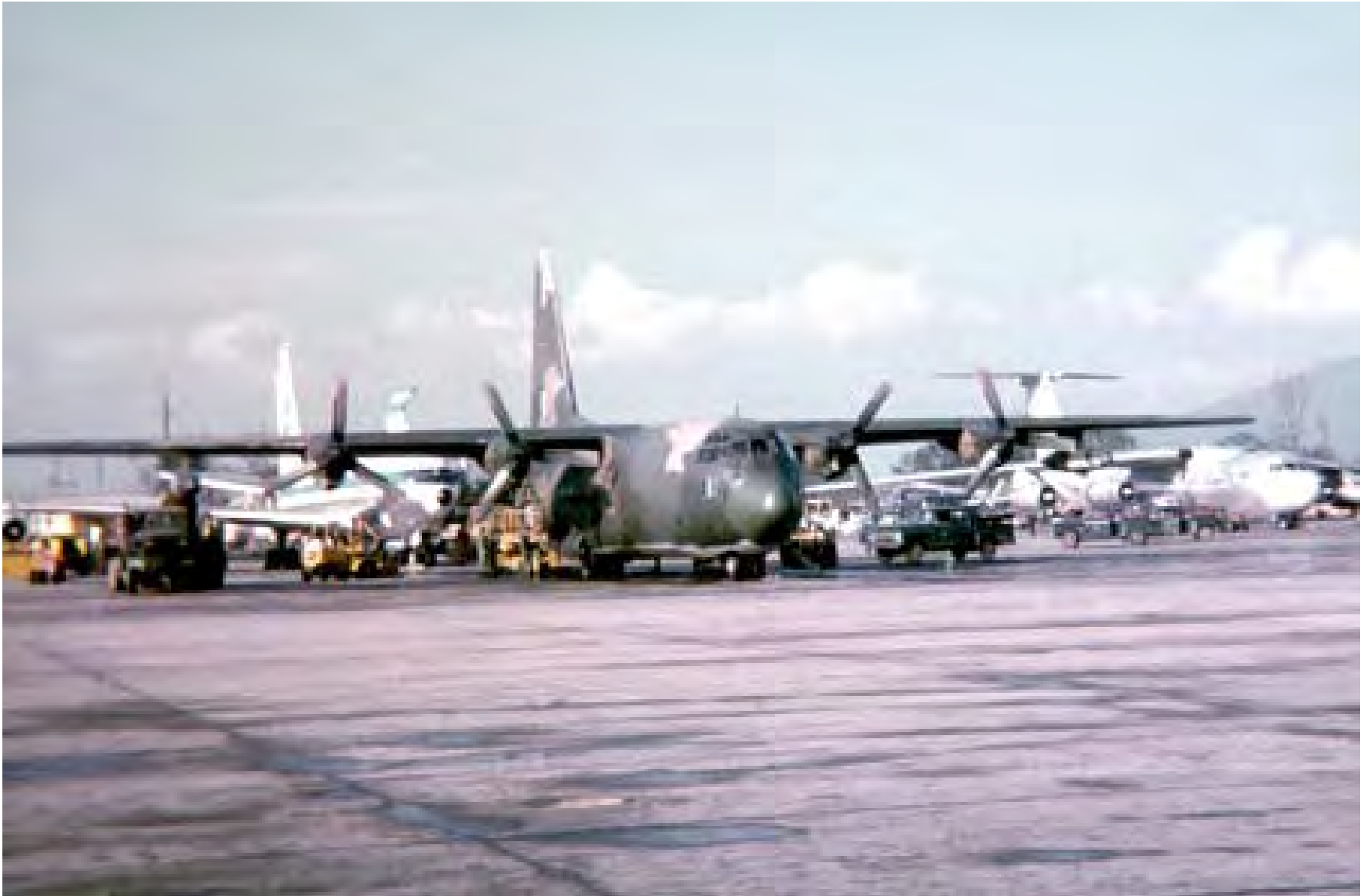
23. East flight line. C-130 and various aircraft parking.