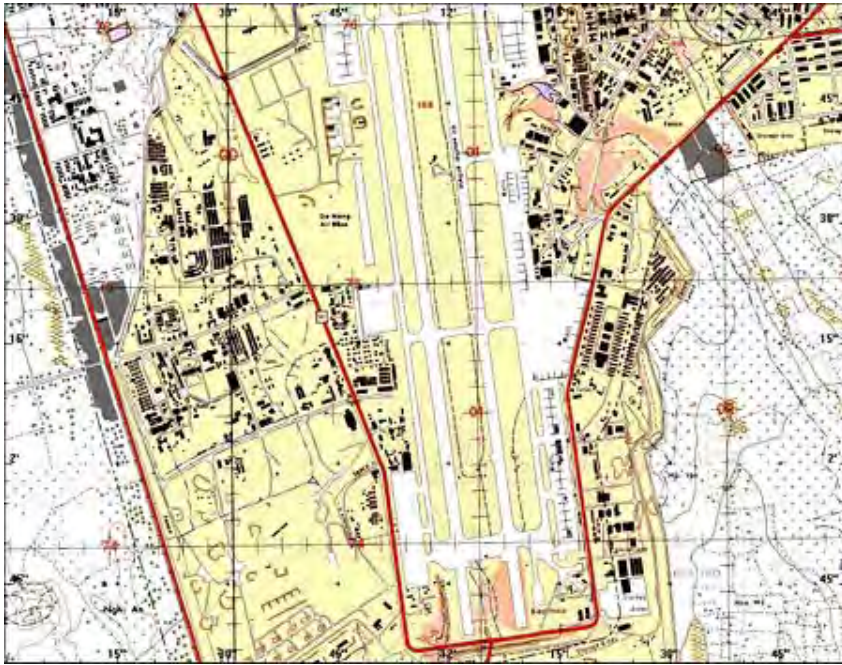
39. Đà Nẵng AB. Map.