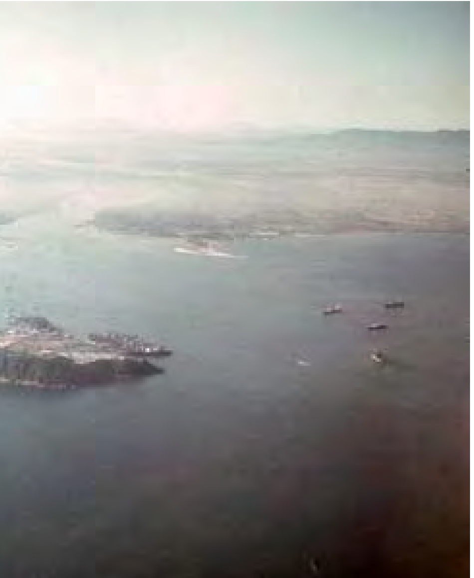
35. Đà Nẵng AB. Tourane Harbor.