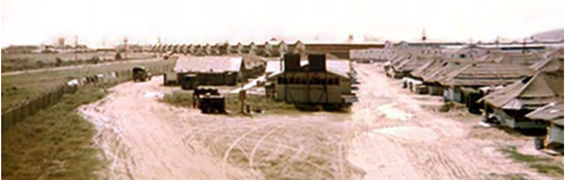
11. Đà Nẵng AB, East perimeter and Tent City. 1968.