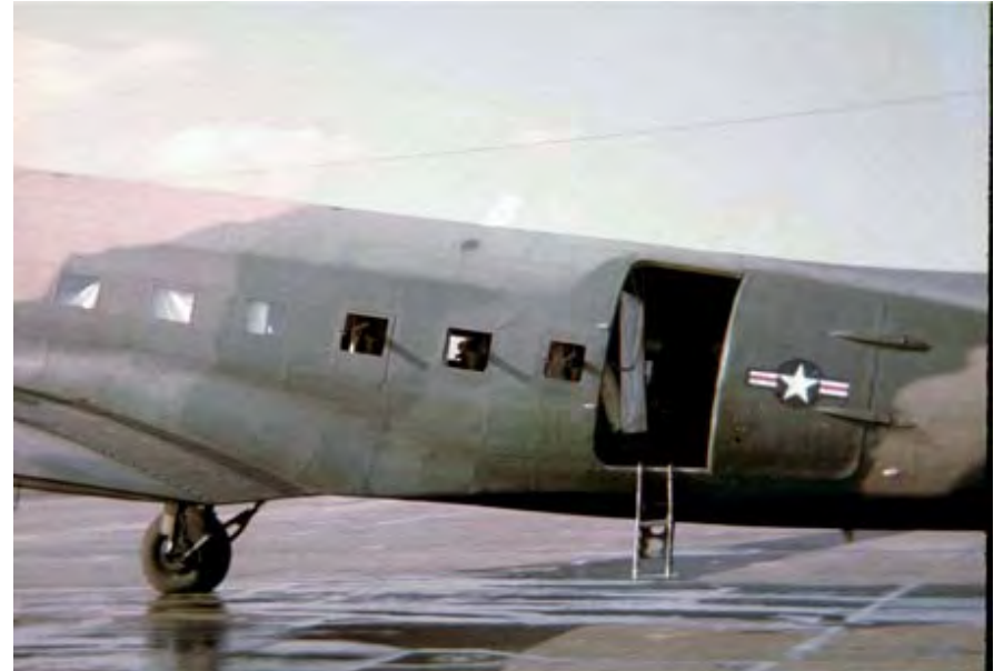
17. Đà Nẵng AB, flight line. C-47 Spooky, starboard and cockpit nose-art. 18. Đà Nẵng AB, flight line. C-47 Spooky, starboard side.