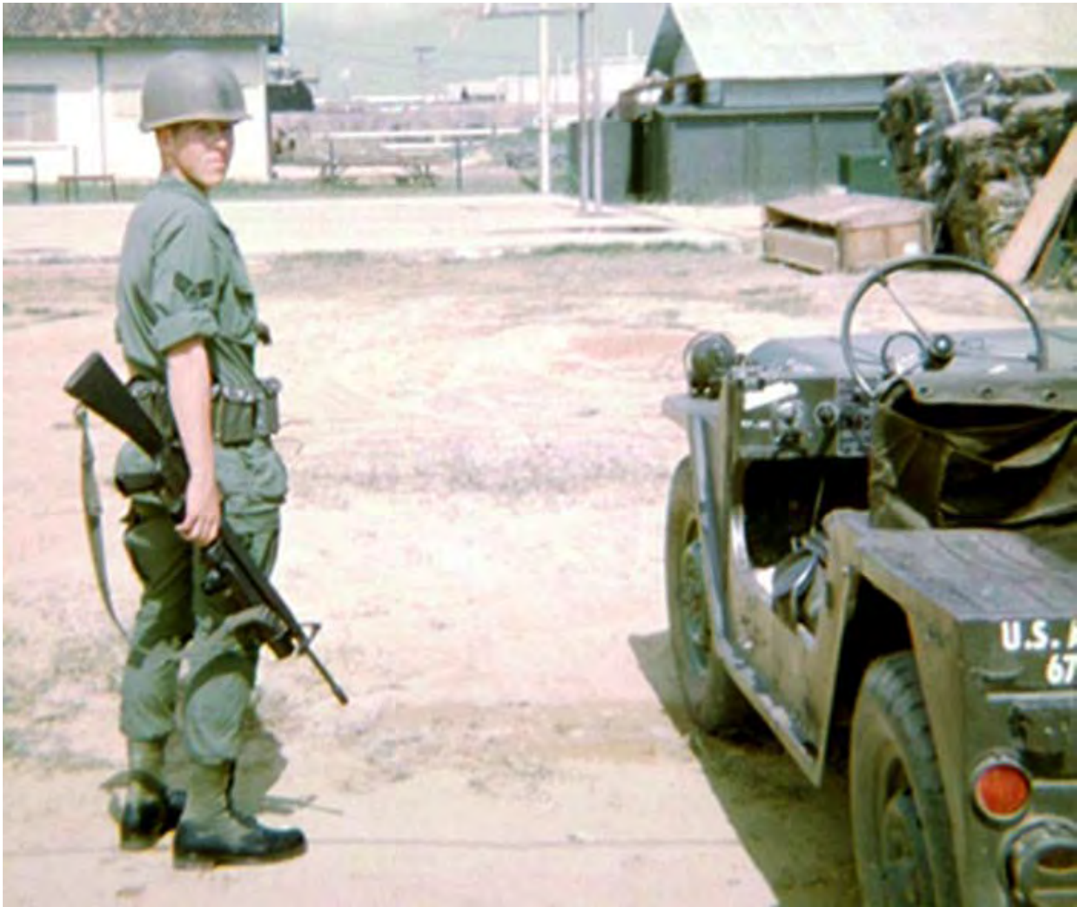
5. Mel Hecker.