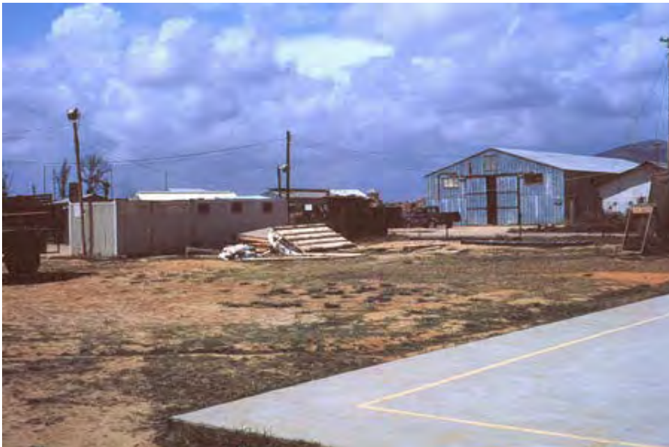
9. SPS Basketball Court.