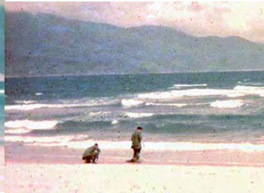
36. and 37. China Beach. Monkey Mountain in background.