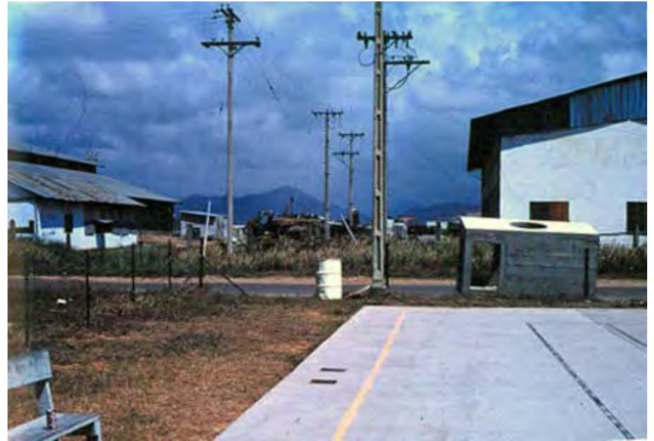
10. SPS Basketball Court.