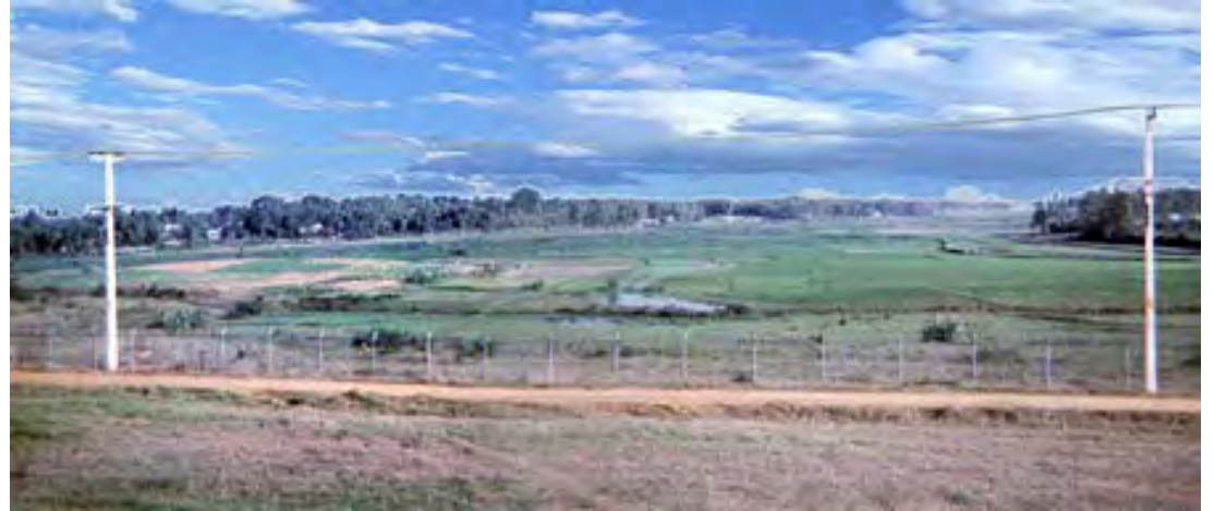
30. Đà Nẵng AB, East perimeter Road.