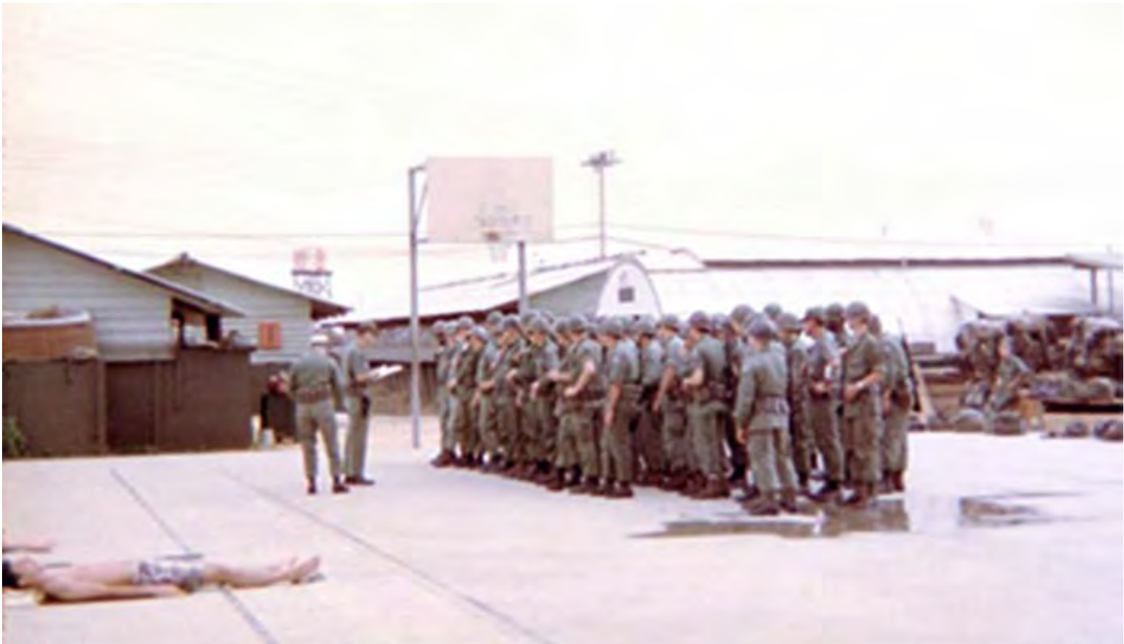
1. Đà Nẵng AB, 366th SPS, Guardmount.

I arrived at Đà Nẵng in December 1967. The Air Base was scheduled to become somewhat "state-sided" but the Tet offensive somewhat displaced that rosy scenario. SSgt Mel