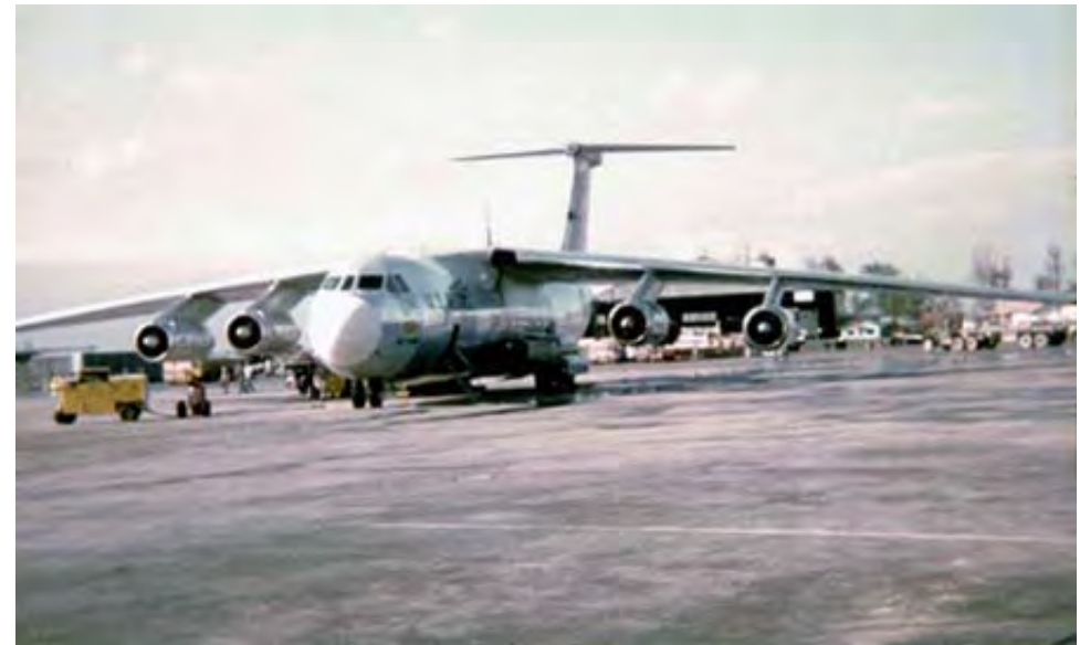
15. C-141 Starlifter. flight line.