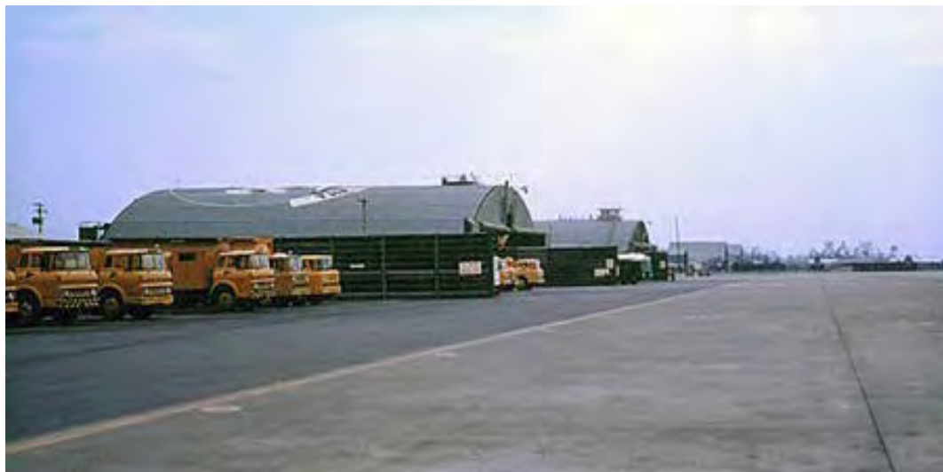
12. Đà Nẵng AB, flight line.