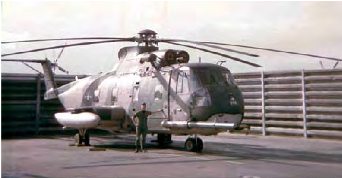
19. flight line. Jolly Green Giant.