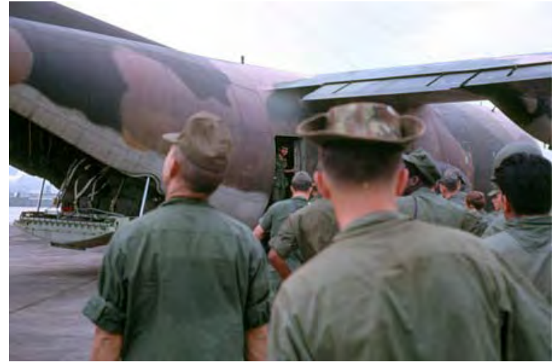
25. flight line. Boarding C-121.