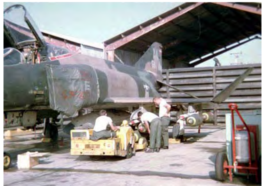
27. Fightline. Revetment. F-4 Phantom, bomb loading.