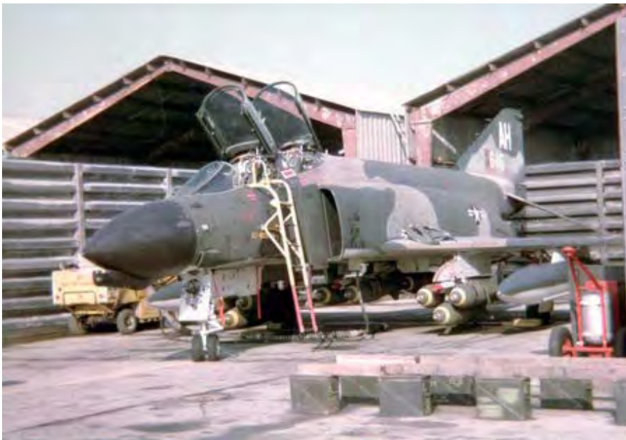
26. Fightline. Revetment. F-4 Phantom, bomb loading.