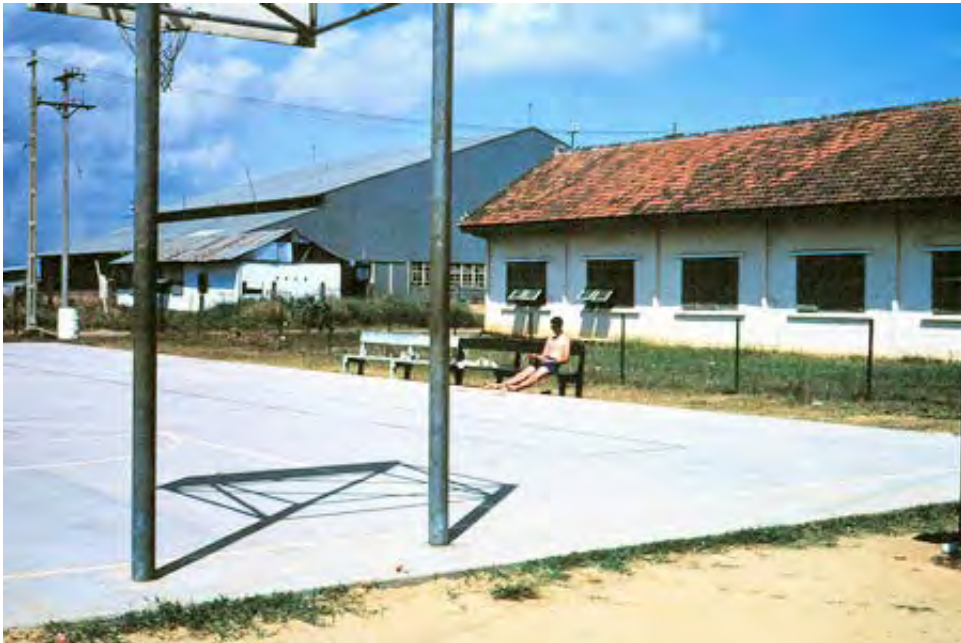
7. SPS Basketball Court.