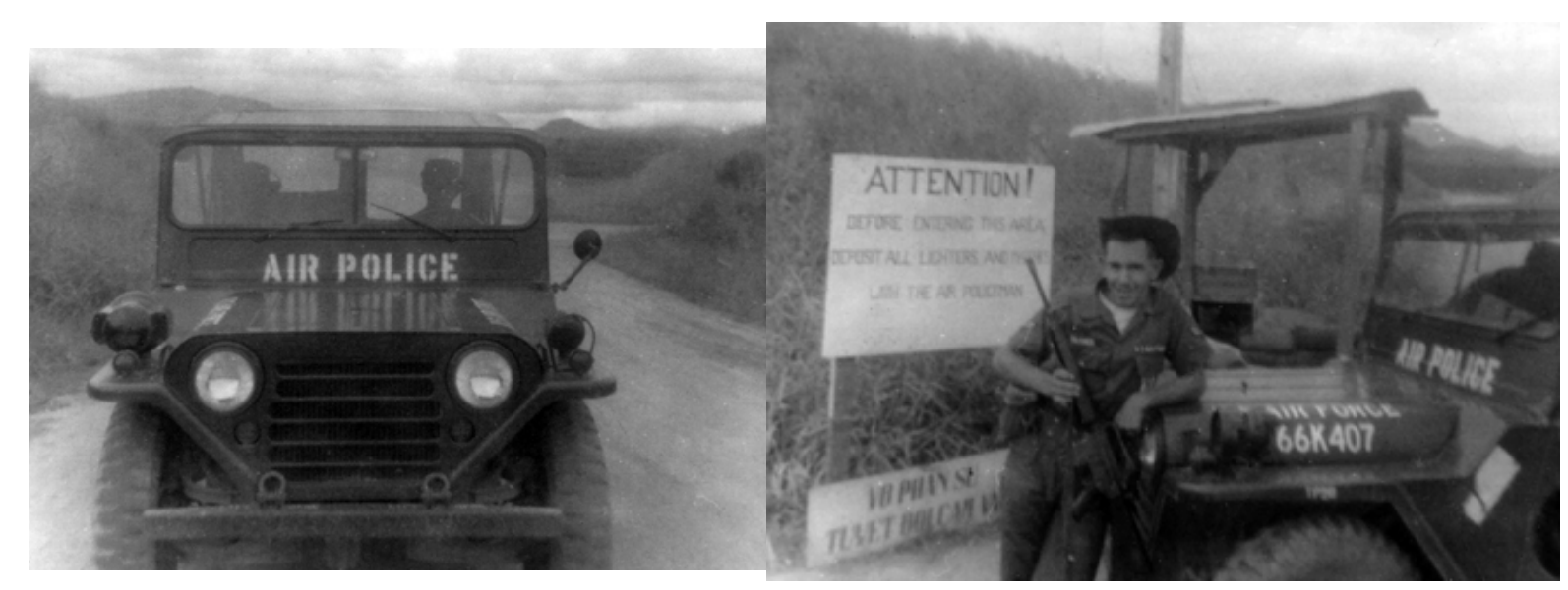
6. Đà Nàng AB: SSgt Coleman driving an AP jeep. 35th APS Jeep, bomb dump perimeter road. 1965.