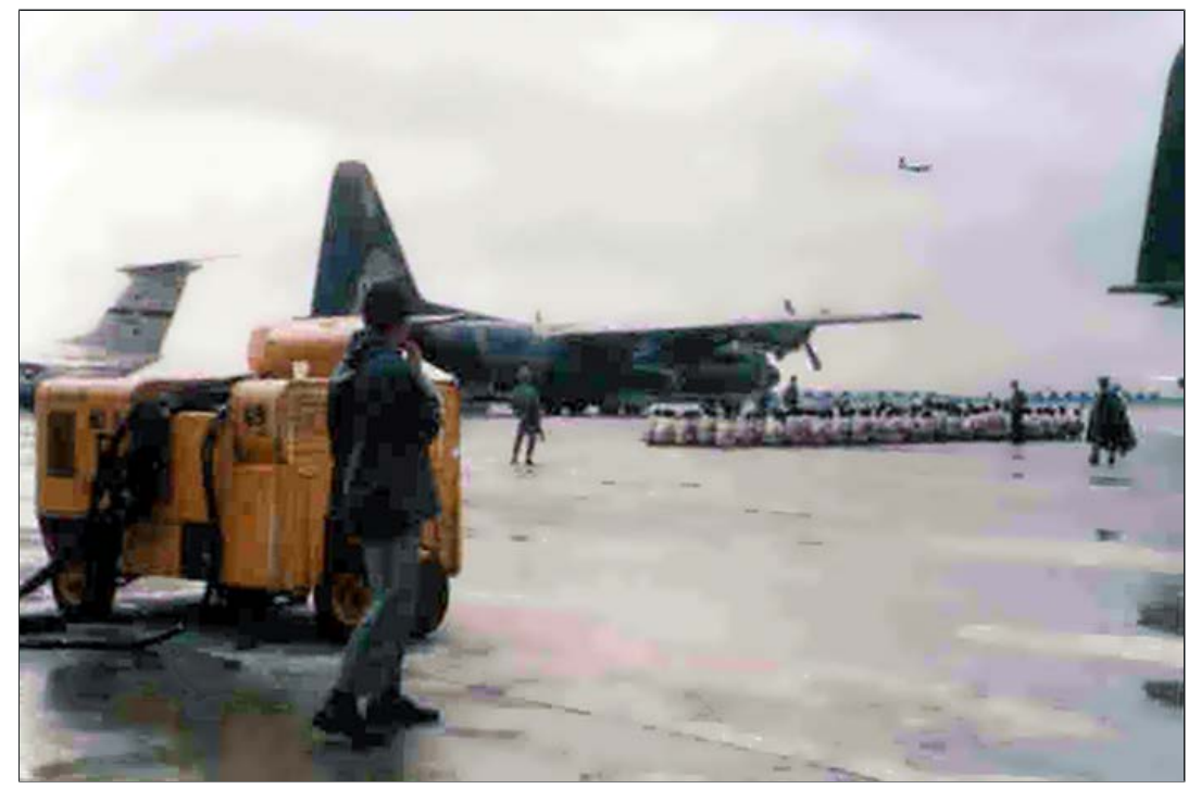
3. Đà Nàng AB: VC POWs set on flight ramp awaiting transportation from Đà Nàng's POW Camp on a C-130. c1967