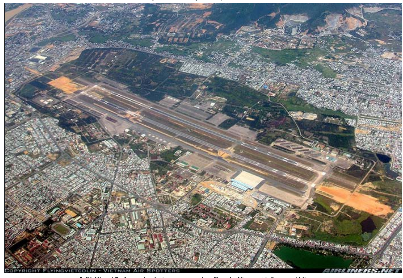
5. Đà Nàng AB: International Airport, current view.