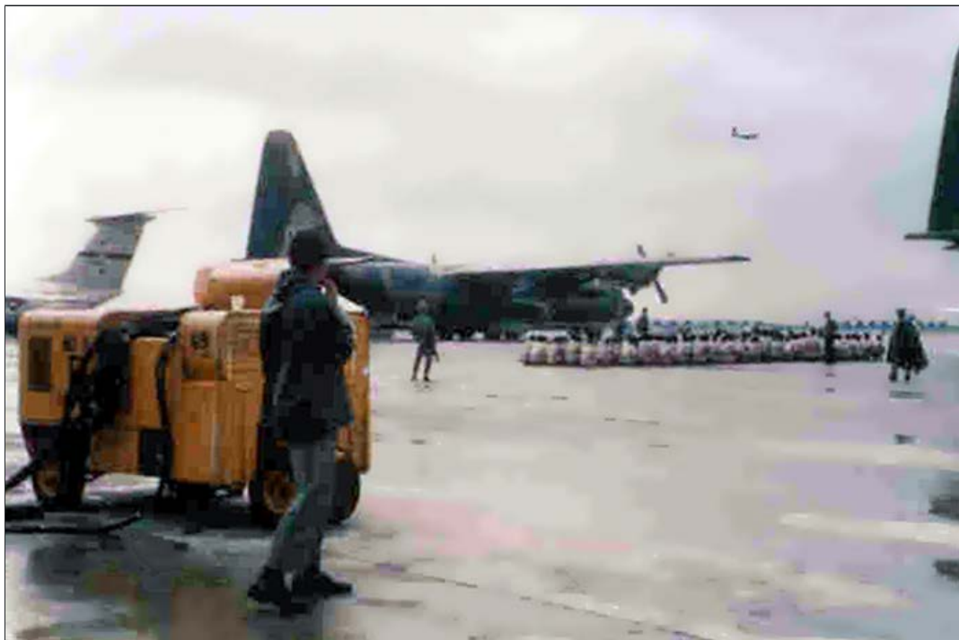
3. Đà Nẵng AB: VC POWs set on flight ramp awaiting transportation from Đà Nẵng's POW Camp on a C-130. c1967 Photo by Steen A Lunde, Airlines.net.

2. The Đà Nẵng Air Base VC/NVA POW Camp , near the base's main gate, is backlit by flares during the 1966 Buddhist uprising. U.S. forces remained neutral until near the end when General Ky led ARVN troops into the city of Đà Nẵng and broke the rebellion. ARVN AF bombed pockets of resistance near the Air Base, but were very careful not to strike the base. Photo by Don Poss 1965-1966.