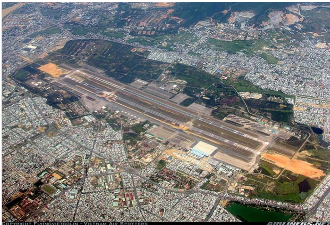
5. Đà Nẵng AB: International Airport, current view.