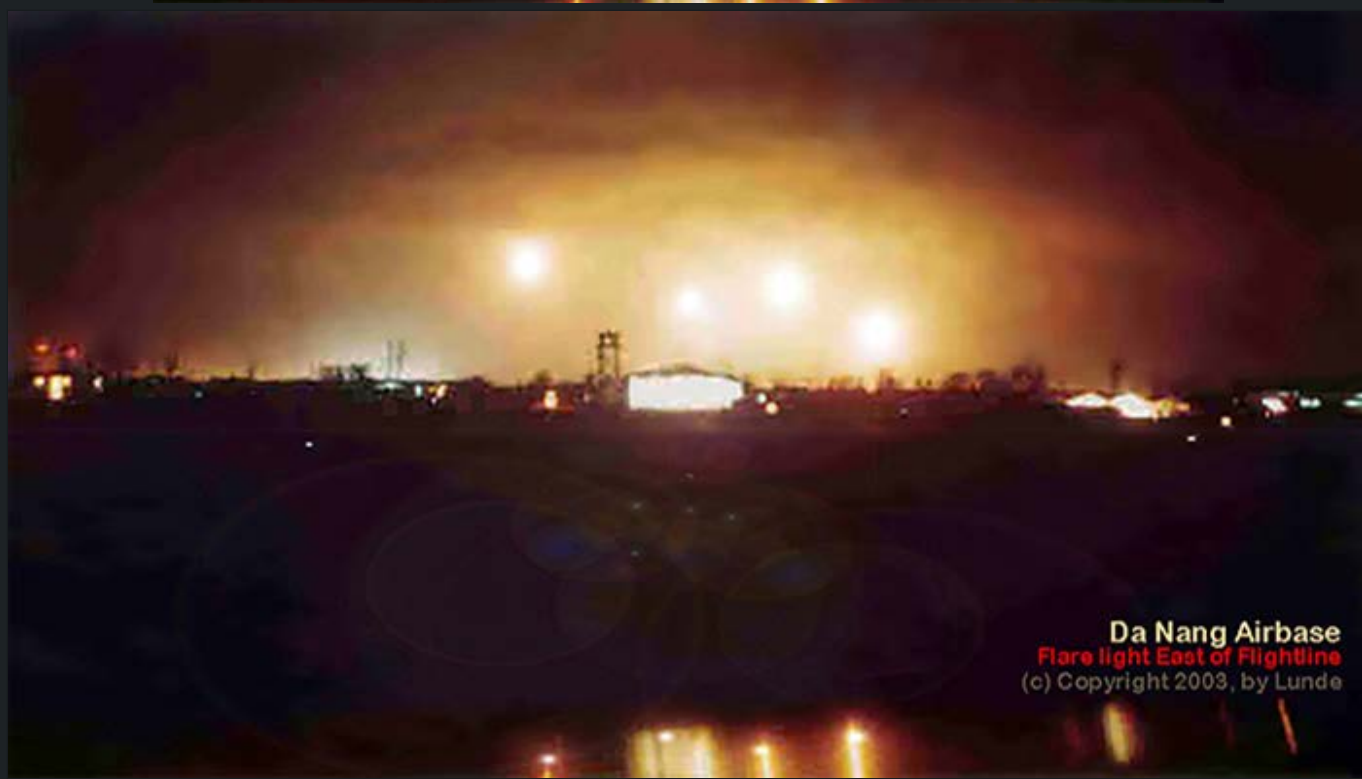
Da Nang Airbase Flare light East of Flightline