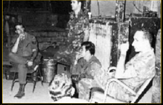
3) The entry control point ASP-1 at the off base bomb

2) In 1972, the 366th SPS was moved from the old Marine area on the west side of the runways, to a set of two story barracks on the east side near Bravo area in 1972 and that is where that photo was taken. [If the barracks were near the theatre, they are the original barracks for the 6252nd APS, in late 1964, and pre tent-city. Don Poss]