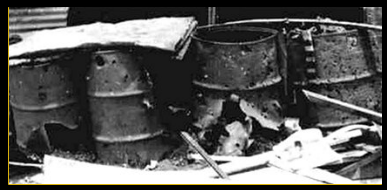
8) Close up.

7) A Security Police barracks which suffered a near miss from a 122 during the night. The rocket impacted near the bottom right corner of the photo. An SP inside was wounded by shrapnel that passed through the armholebof the flak vest he had pulled over him.