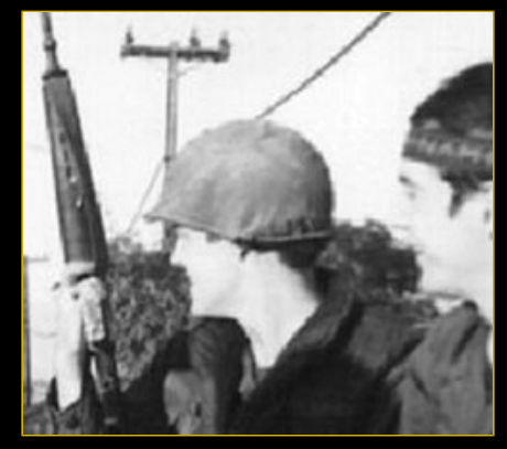
5) The paranoid one with the rifle is me.