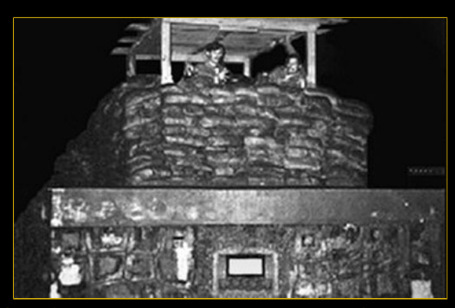
6) One of our sandbag emplacements on top of an old French concrete bunker located on the south end of the base.