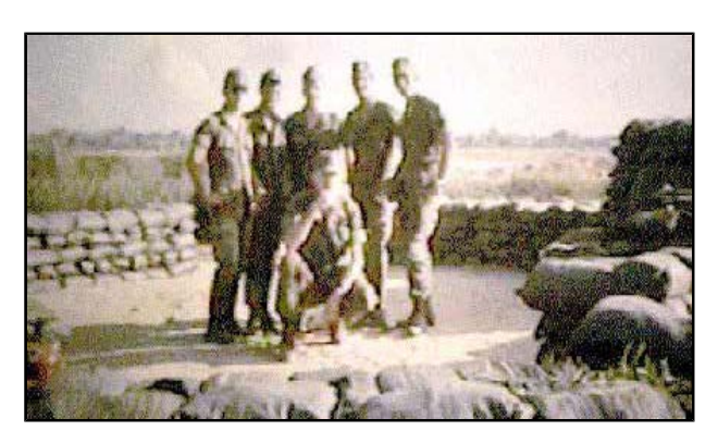
Đà Nàng Vietnam, 1966!

DN, 23rd ABG/AP; 6252nd APS, TOPDOG45, K9: Shep A902 1965-1966