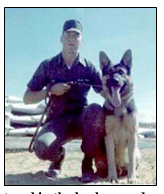
At the Growl Pad. Wing tanks stored in the background.