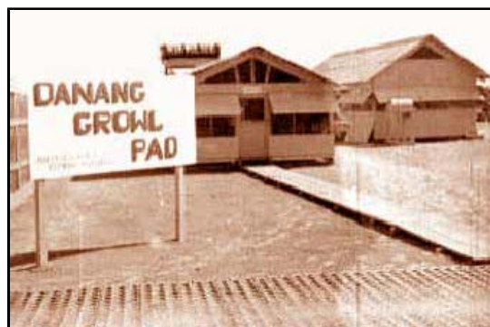
Đà Nẵng Growl Pad, 1966. Wooden plank-sidewalk is for the Monsoons. PSP planking is to drive on.