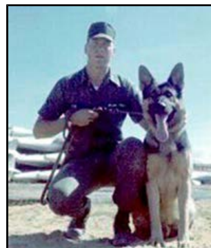
At the Growl Pad. Wing tanks stored in the background.