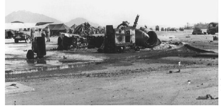
other aircraft parked on the rest of the flight line.