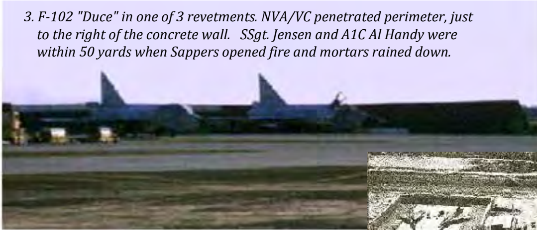
3. F-102 "Duce" in one of 3 revetments. NVA/VC penetrated perimeter, just to the right of the concrete wall. SSgt. Jensen and A1C Al Handy were within 50 yards when Sappers opened fire and mortars rained down.