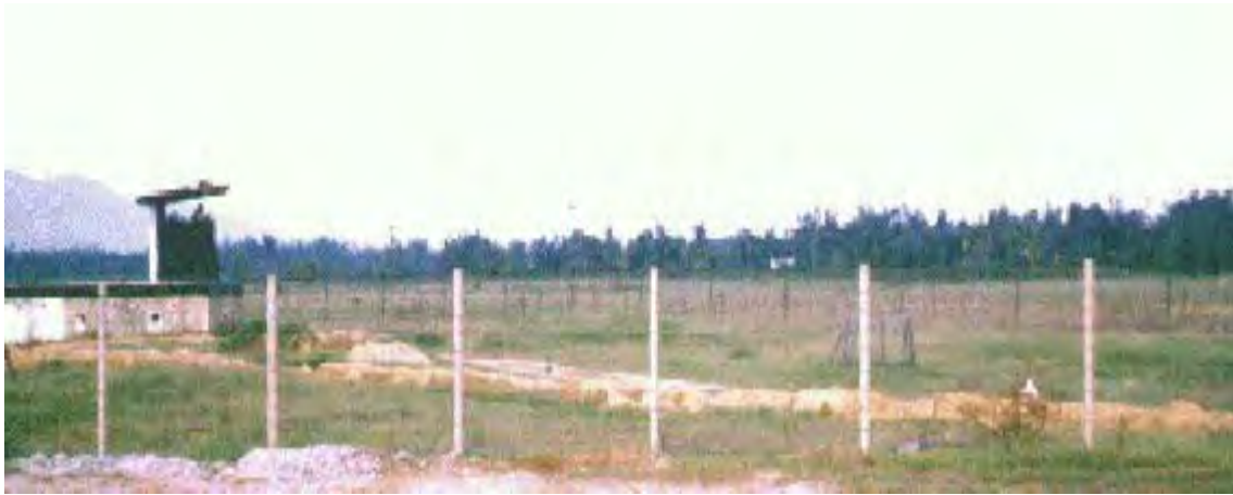
6. Da Nang Air Base, East Perimeter manned by USMC. (left) Old French bunker

When the mortar fire began, the NVA force advanced in assault under their own fire across the taxiway. As they moved past the revetments, the NVA ripped open the fuel cells in the C-130's with automatic weapons fire, threw grenades into the fuel and fired the aircraft, destroying them. A team of NVA worked their way around behind the alert F-102's, and fired either RPG's or 57mm recoilless rifle rounds up the engine exhaust pipes of three of the aircraft, destroying them.