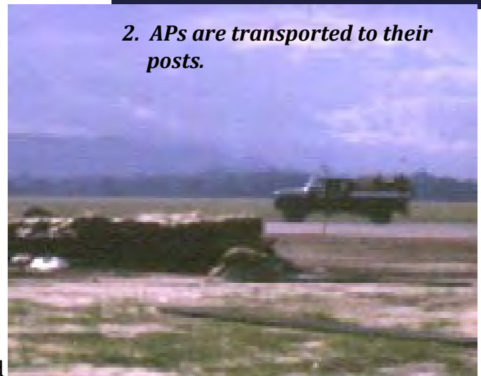
2. APs are transported to their posts.