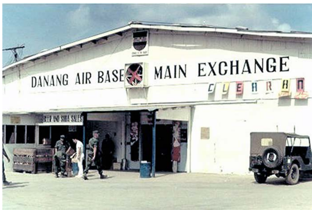
2. Đà Nẵng AB: Main Exchange. 1968.