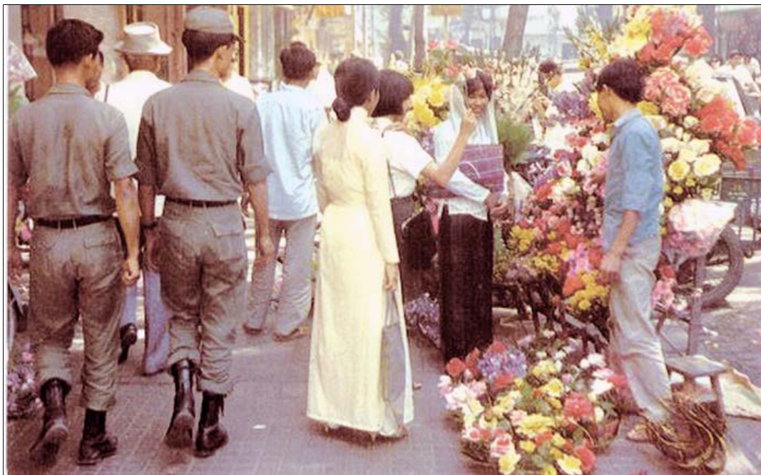
7 . Saigon, SVN: Saigon Flower Market. 1968.