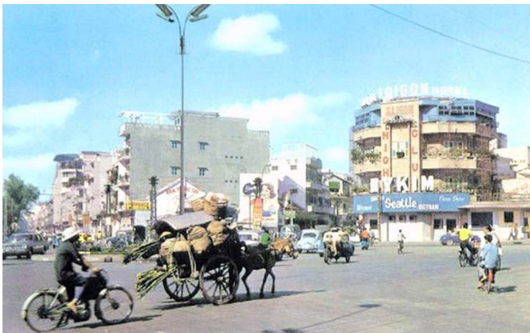
6. Saigon, SVN: Saigon Hotel. 1967.