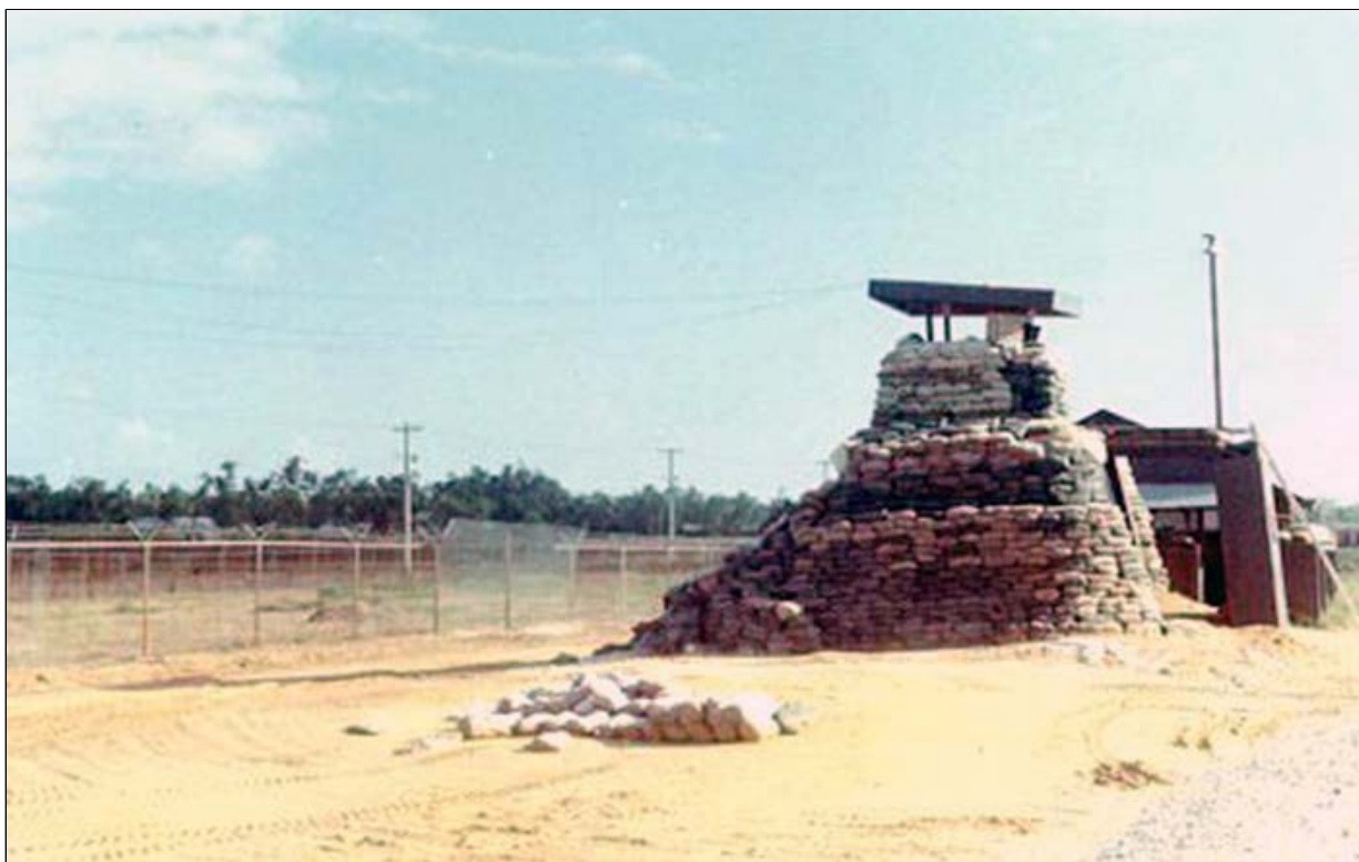
1. Đà Nẵng AB: SP Tower-Bunker post on the Perimeter, by Camp Đà Nẵng, which later became known as Gunfighter Village. Spooky used to have nightly workouts in the treeline in the background of this picture. Photo by Vernon Hodge, 1968.