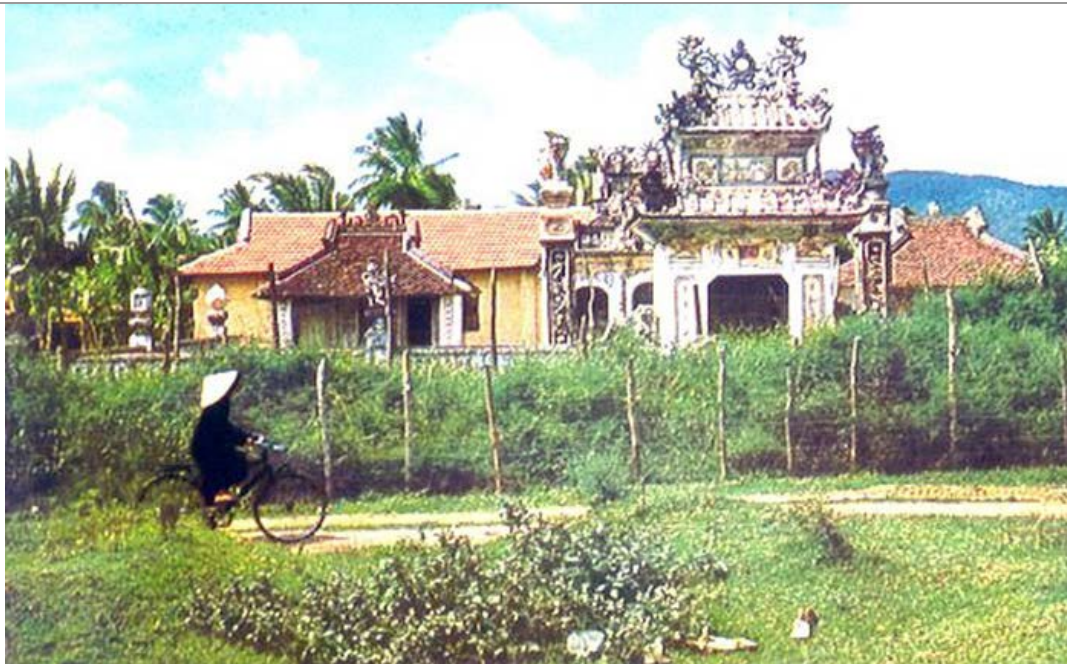
5. Đà Nẵng AB: Photo by Vernon Hodge, 1968.