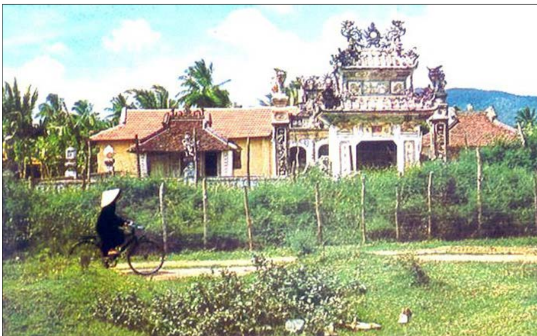
8 . Đà Nẵng AB: Pagoda Temple along road.