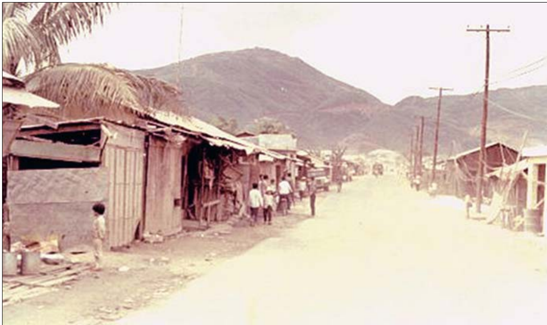
3. Đà Nẵng AB: Dog Patch, which was the small Vietnamese Area between what was called Four-Corners and Freedom Hill 327. Photo by Vernon Hodge, 1968.