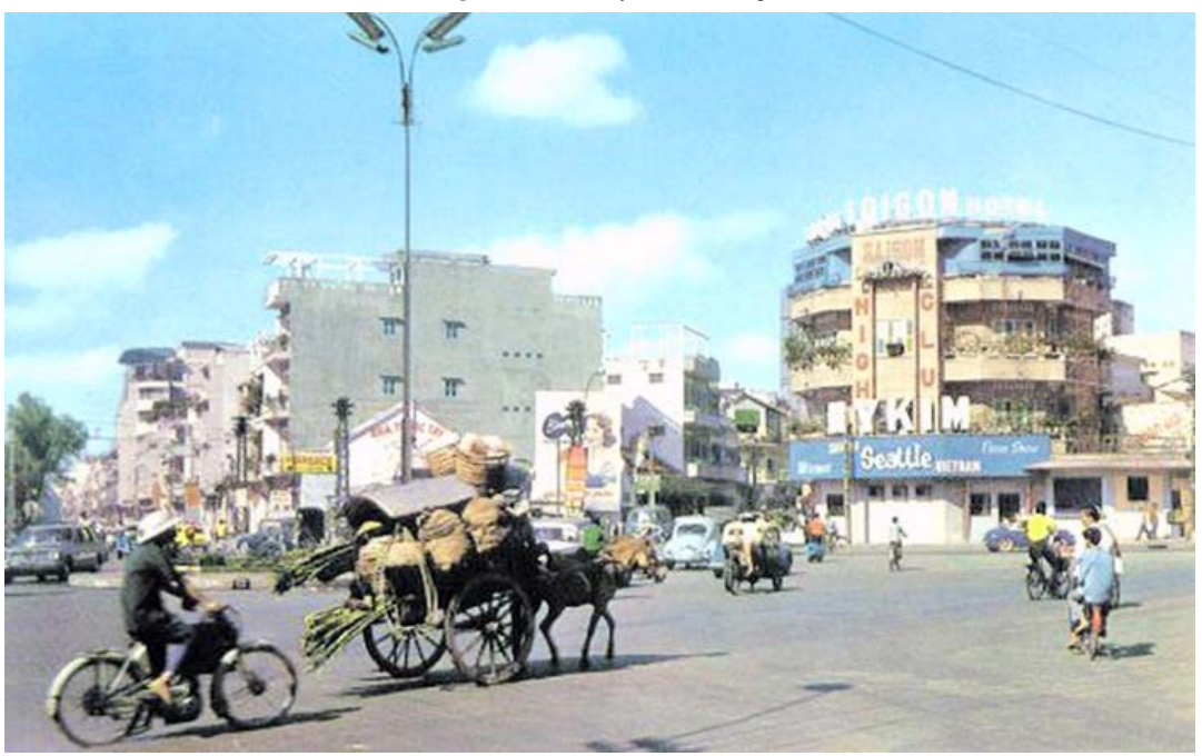
6. Saigon, SVN: Saigon Hotel. Photo by Vernon Hodge, 1967.