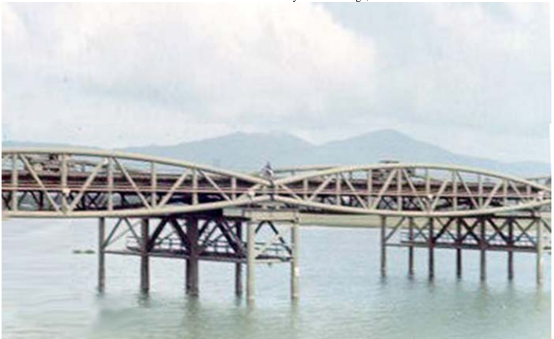
4. Đà Nàng AB: Photo by Vernon Hodge, 1968.