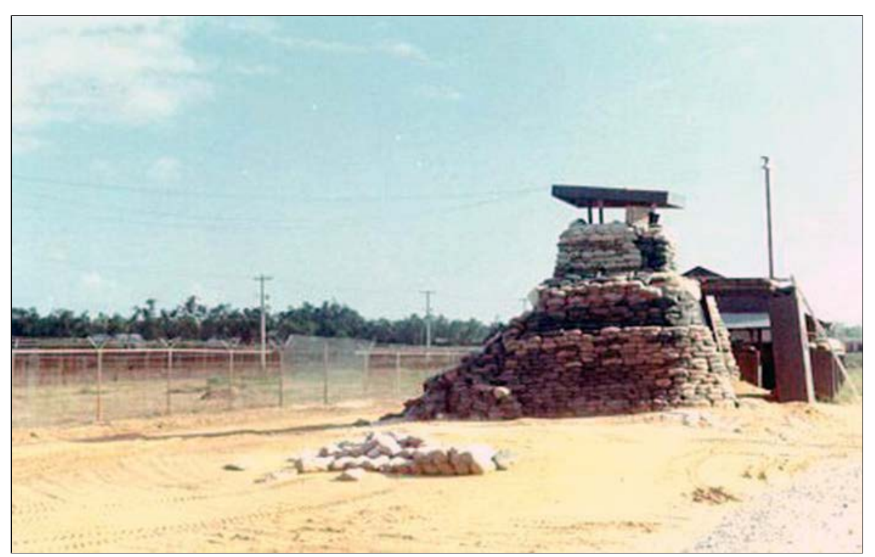
1. Đà Nàng AB: SP Tower-Bunker post on the Perimeter, by Camp Đà Nàng, which later became known as Gunfighter Village. Spooky used to have nightly workouts in the treeline in the background of this picture. Photo by Vernon Hodge, 1968.