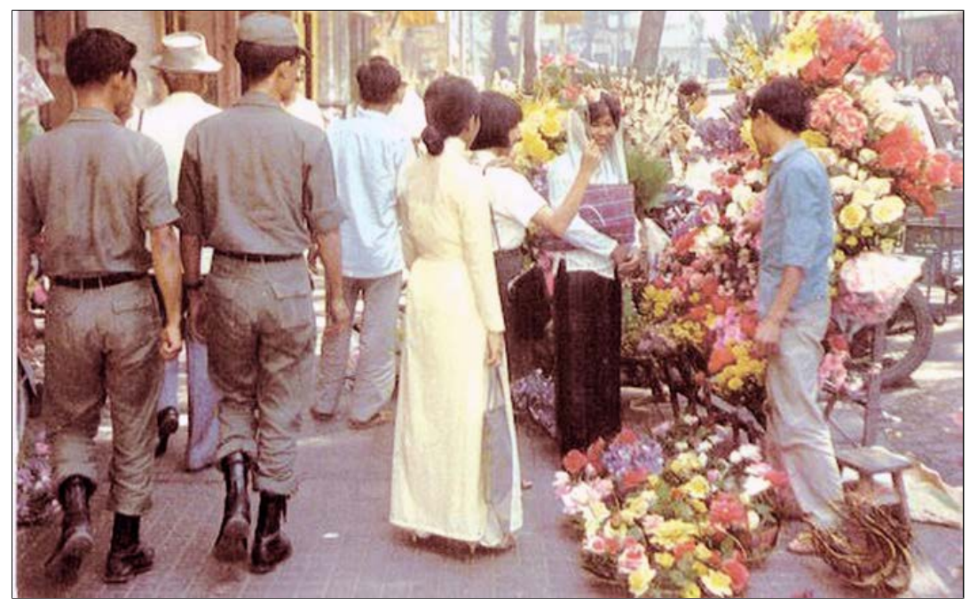
7. Saigon, SVN: Saigon Flower Market. Photo by Vernon Hodge, 1968.