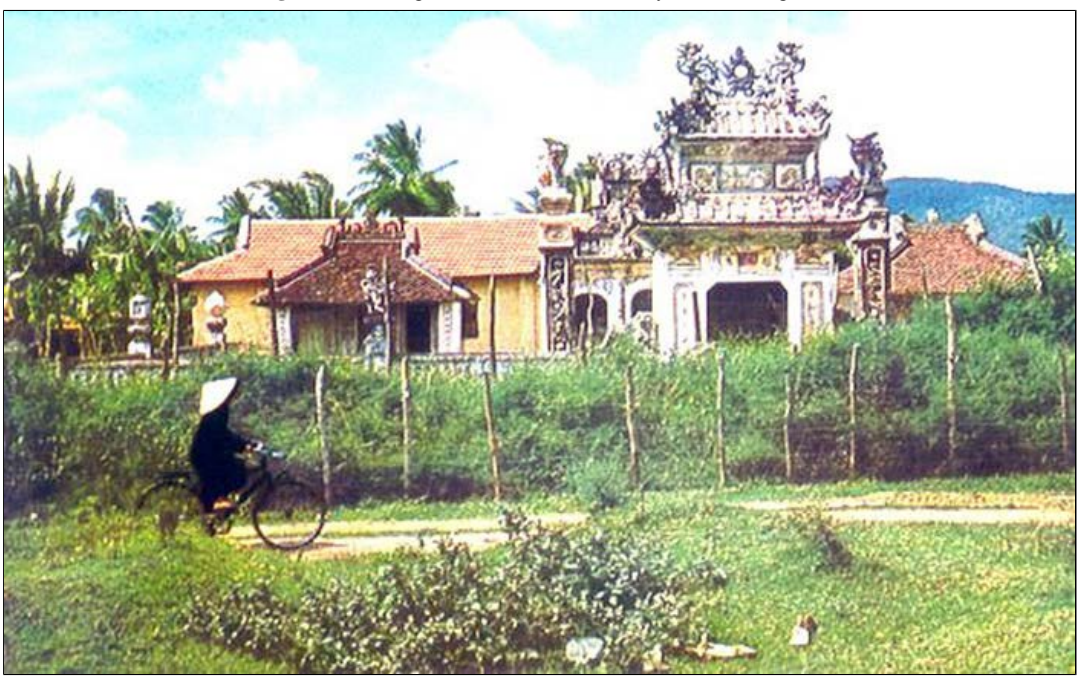
8. Đà Nàng AB: Pagoda Temple along road. Photo by Vernon Hodge, 1968.