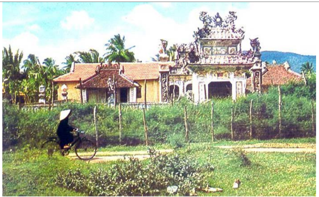
5. Đà Nàng AB: Photo by Vernon Hodge, 1968.