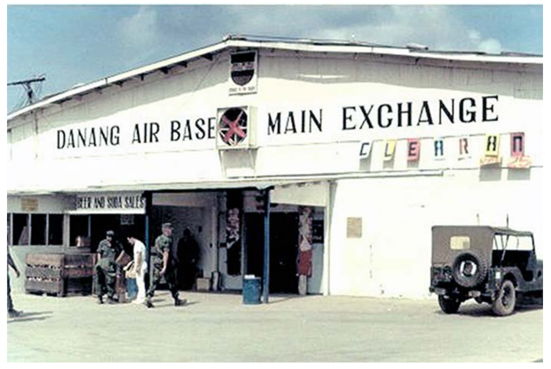
2. Đà Nàng AB: Main Exchange. Photo by Vernon Hodge, 1968.