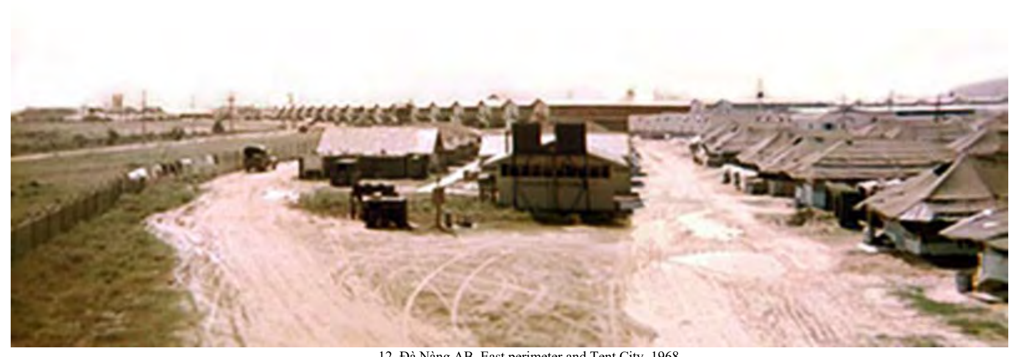
12. Đà Nàng AB, East perimeter and Tent City. 1968.