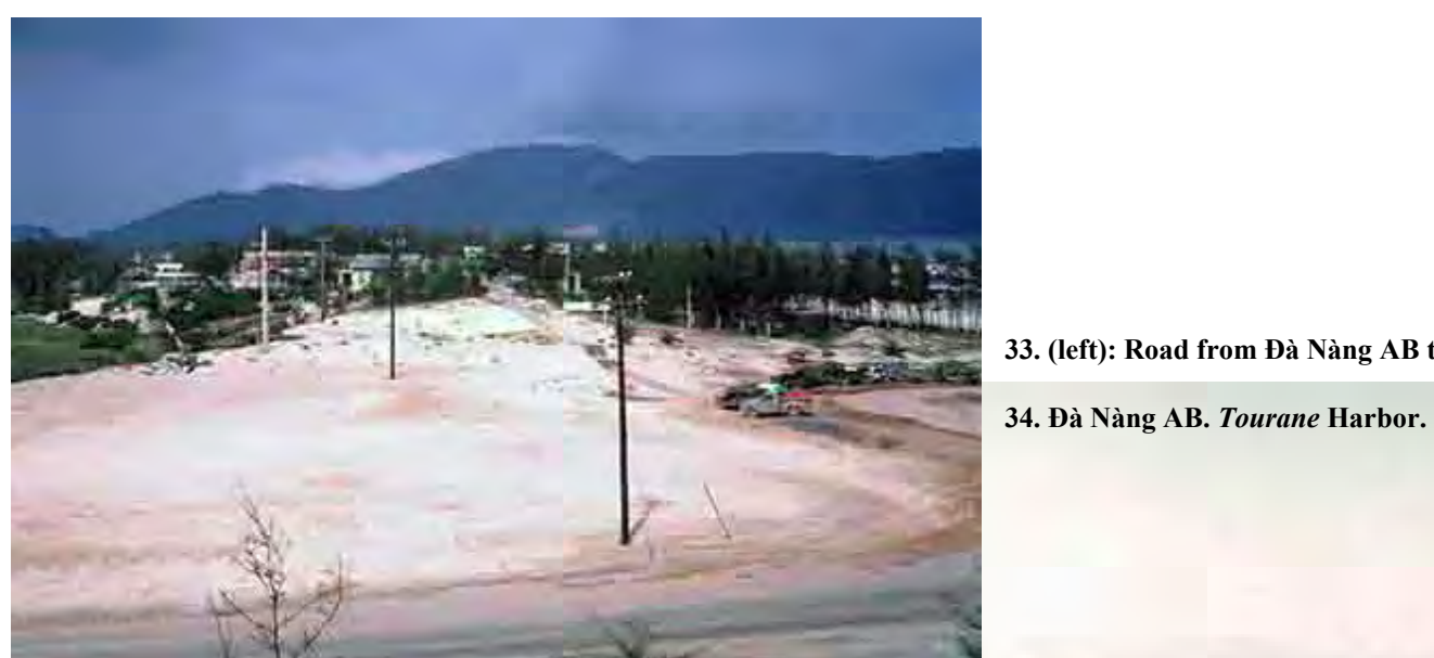
33. (left): Road from Đà Nàng AB to China Beach. View of Monkey Mountain.