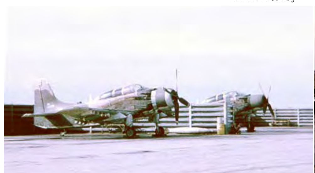
22. A-1E Sandy