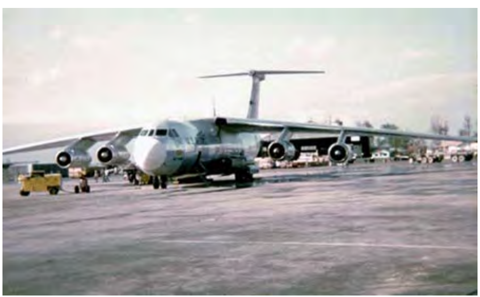
16. Đà Nàng AB, flight line. C-47 Spooky.