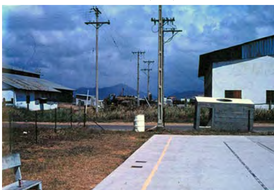
11. SPS Basketball Court.