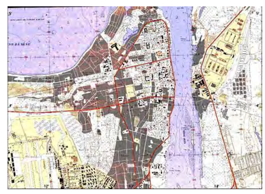
41. Đà Nàng AB. Map.