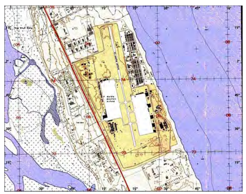
42. Đà Nàng AB. Map.