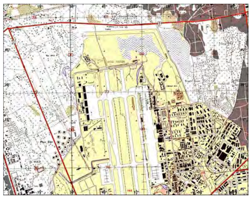
40. Đà Nàng AB. Map.