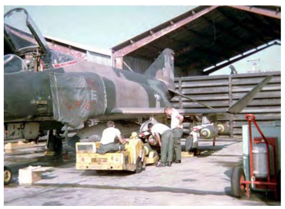
28 Fightline. Revetment. F-4 Phantom, bomb loading.