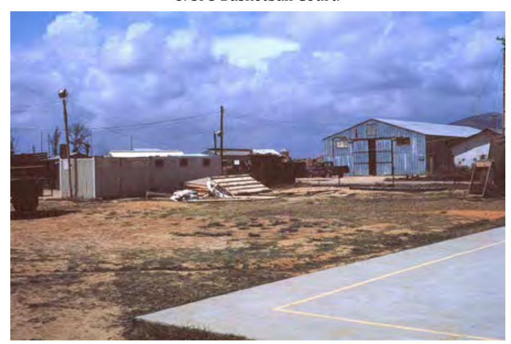
10. SPS Basketball Court.