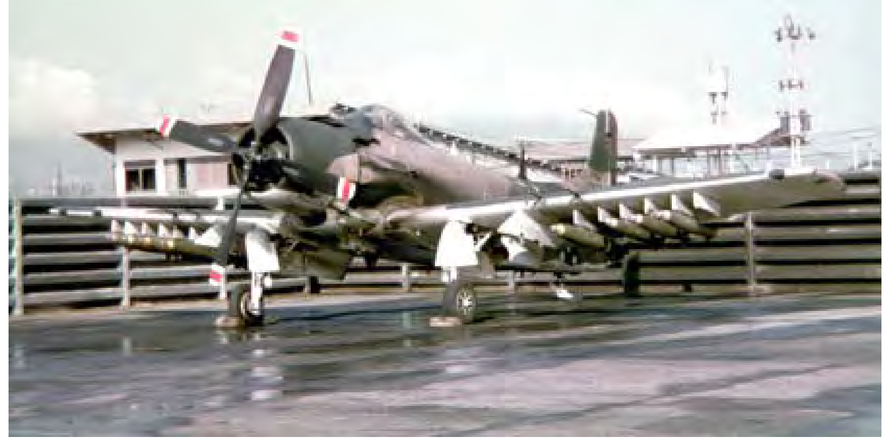
23. A-1E, Sandy.