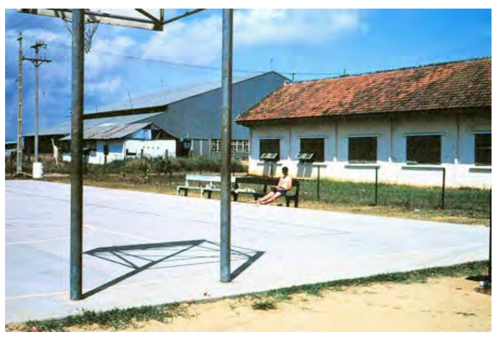
8. SPS Basketball Court.