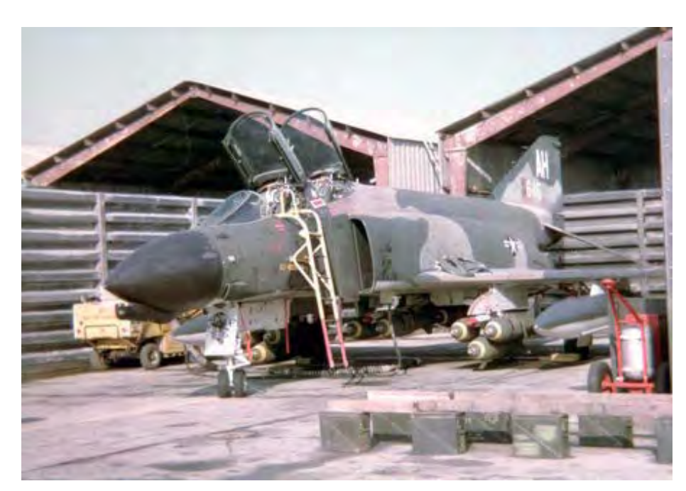
27. Fightline. Revetment. F-4 Phantom, bomb loading.