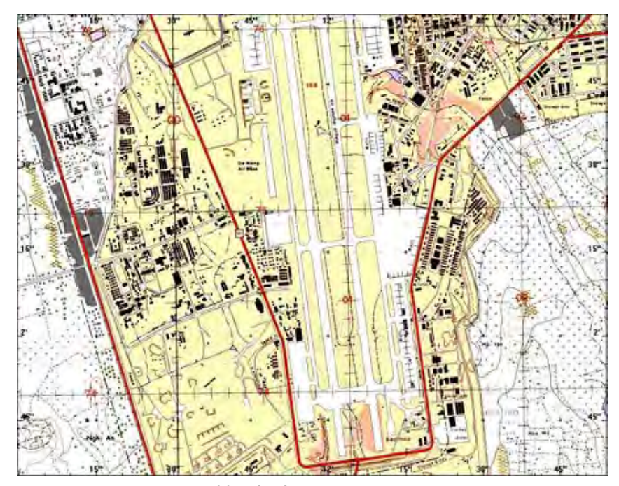
39. Đà Nàng AB. Map.