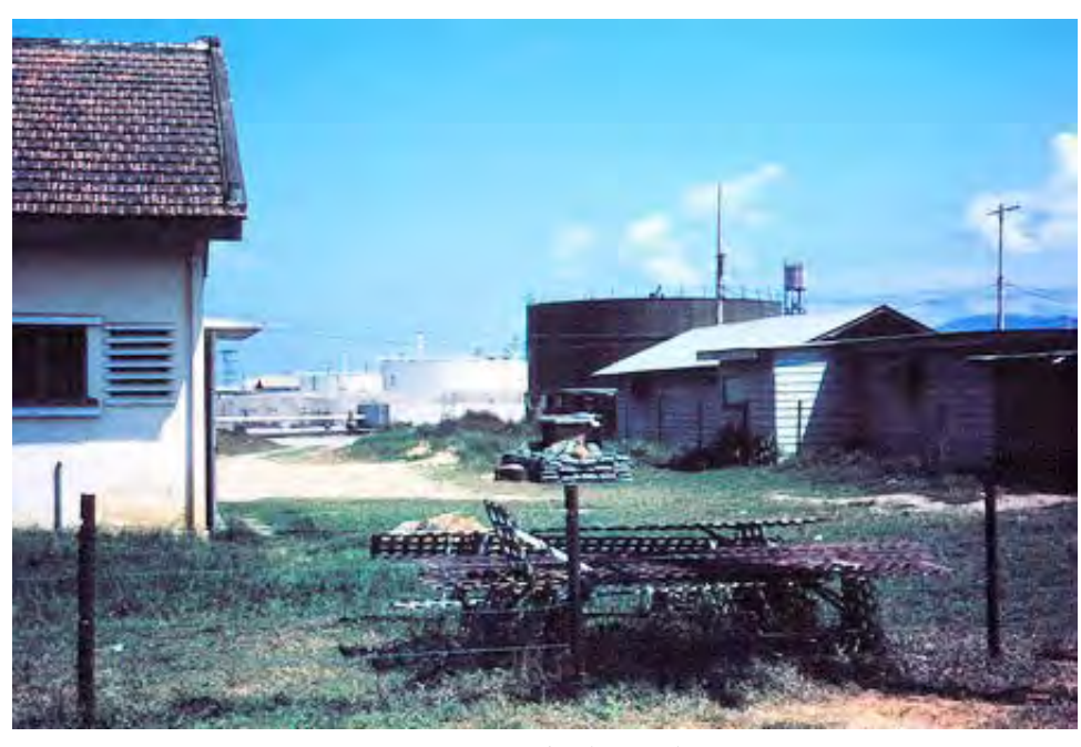
9. POL tanks (center).