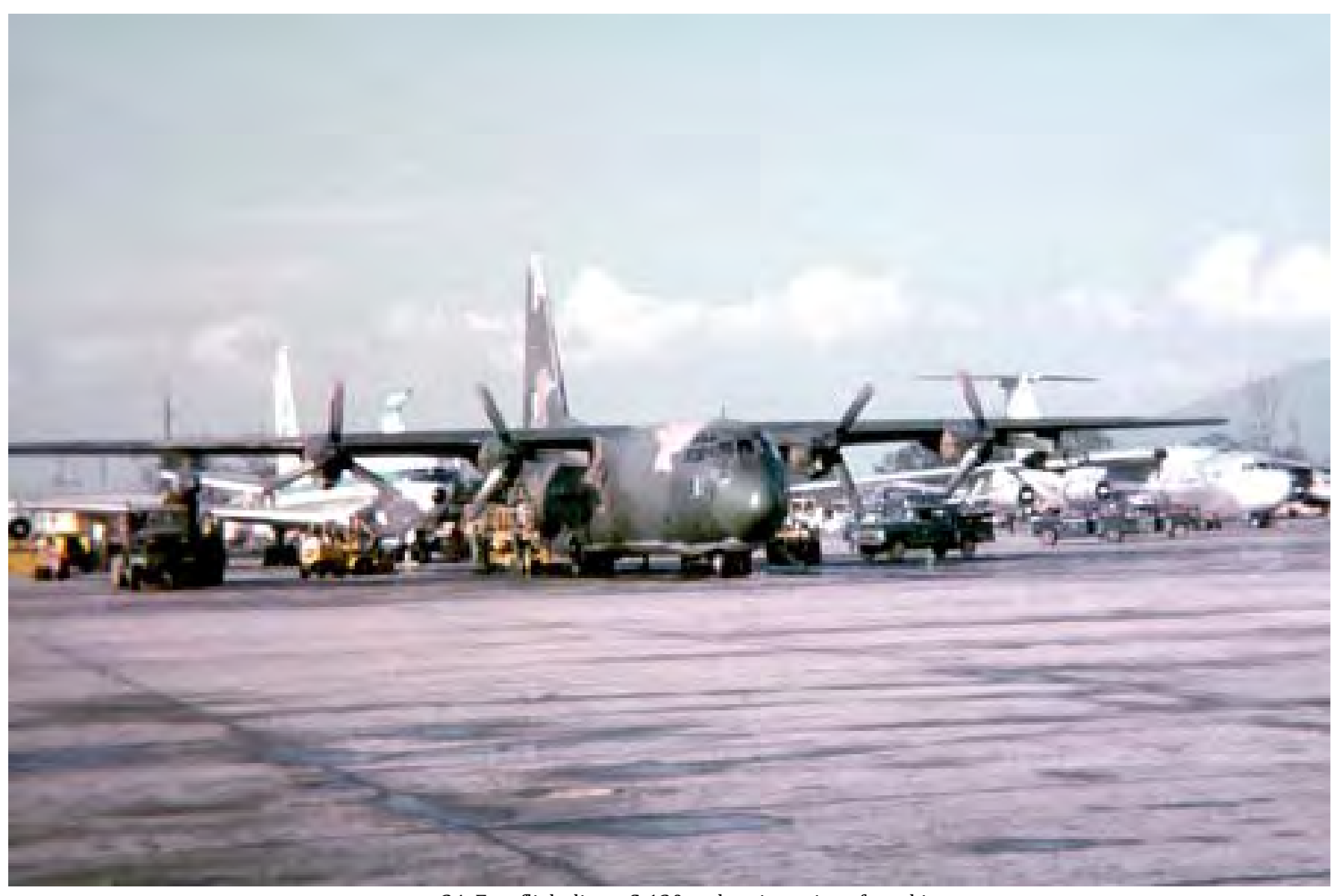
24. East flight line. C-130 and various aircraft parking.