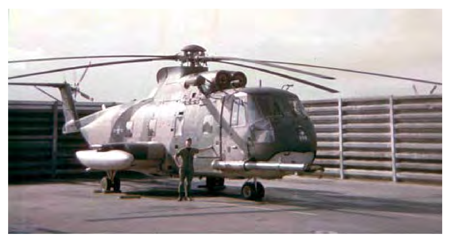
20. Flight line. Jolly Green Giant.