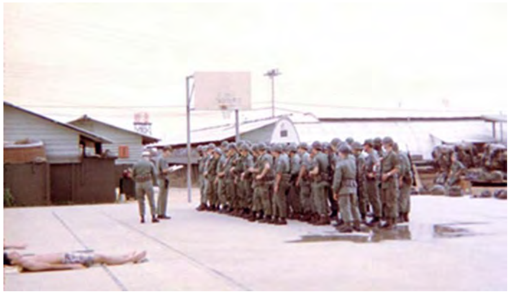
1. Đà Nàng AB, 366th SPS, Guardmount.

I arrived at Đà Nàng in December 1967. The Air Base was scheduled to become somewhat "state-sided" but the Tet offensive somewhat displaced that rosy scenario. SSgt Mel