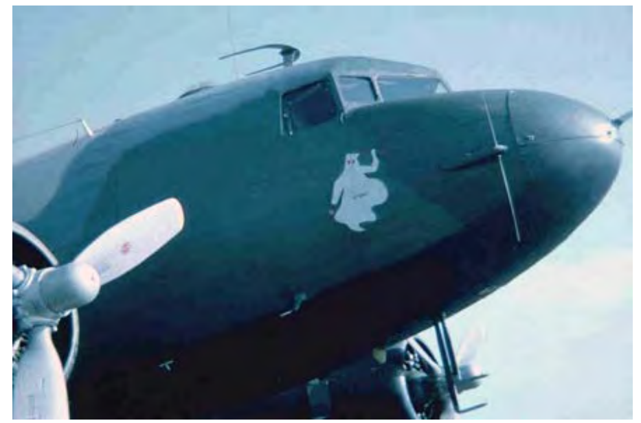
18. Đà Nàng AB, flight line. C-47 Spooky, starboard and cockpit nose-art.