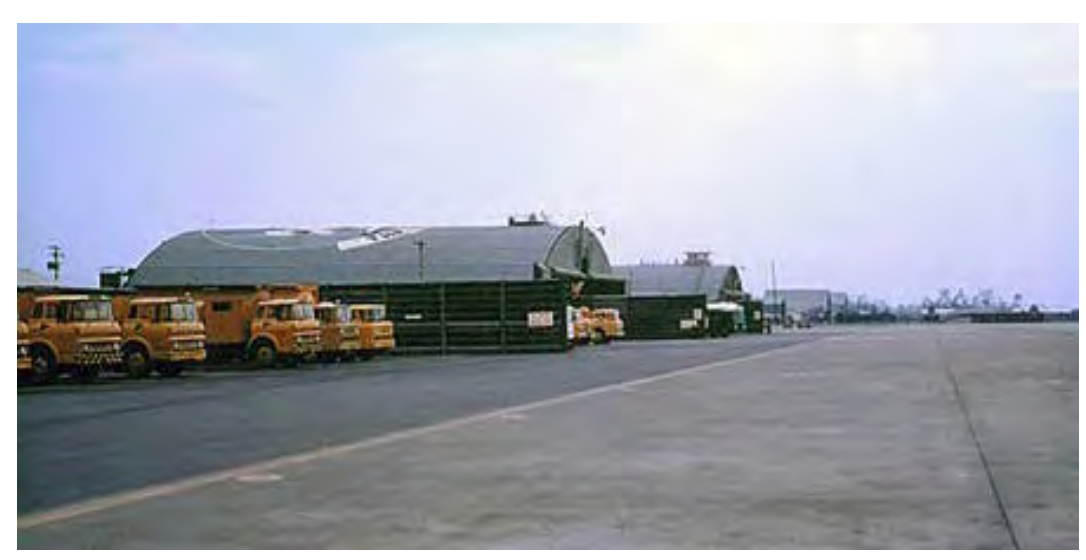
13. Đà Nàng AB, flight line.