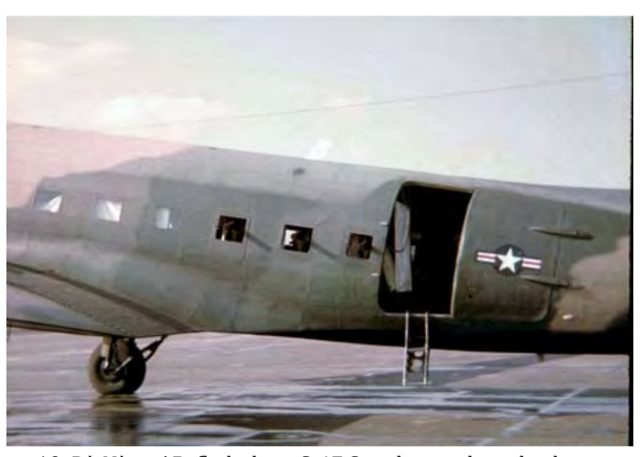
19. Đà Nàng AB, flight line. C-47 Spooky, starboard side.