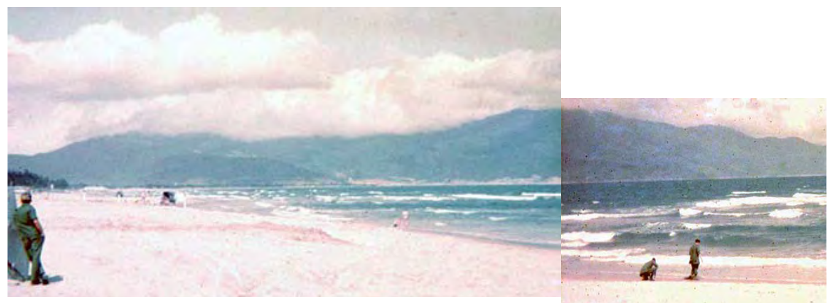
36. (above) and 37. (right) China Beach. Monkey Mountain in background.