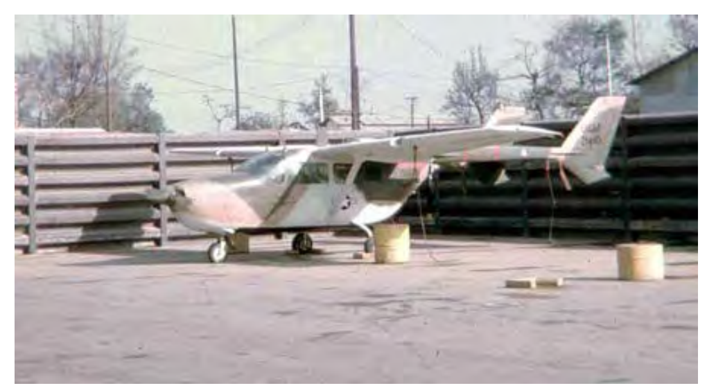
15. C-141 Starlifter. flight line.