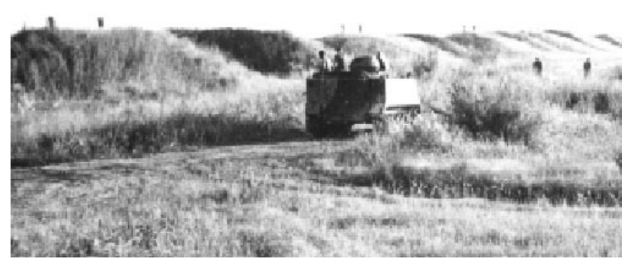
7. Đà Nàng AB, M113 APC. Ammo Dump Bunkers . 1971.