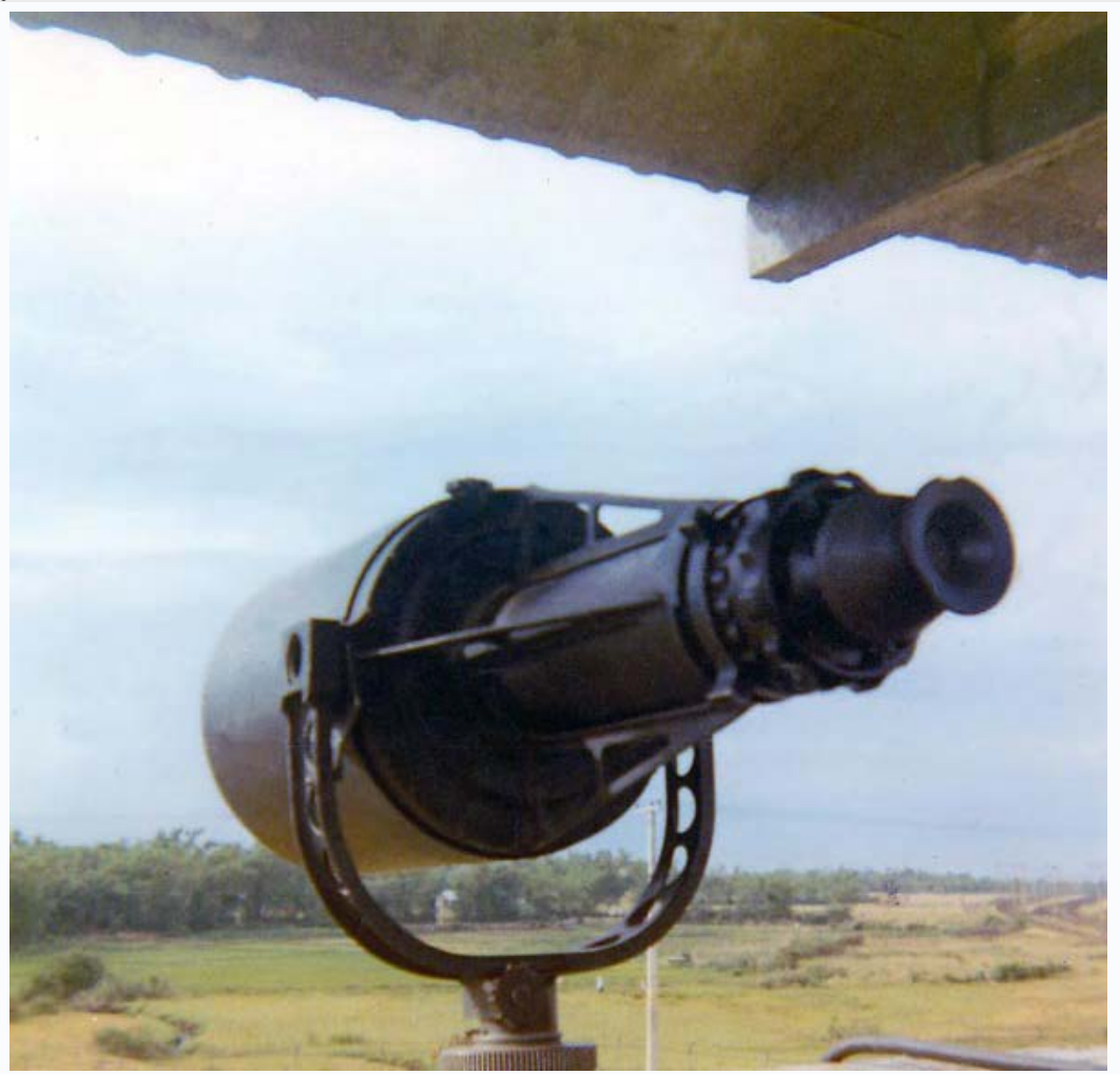
9. Đà Nàng AB, Perimeter Tower, Alpha-3, Starlite scope