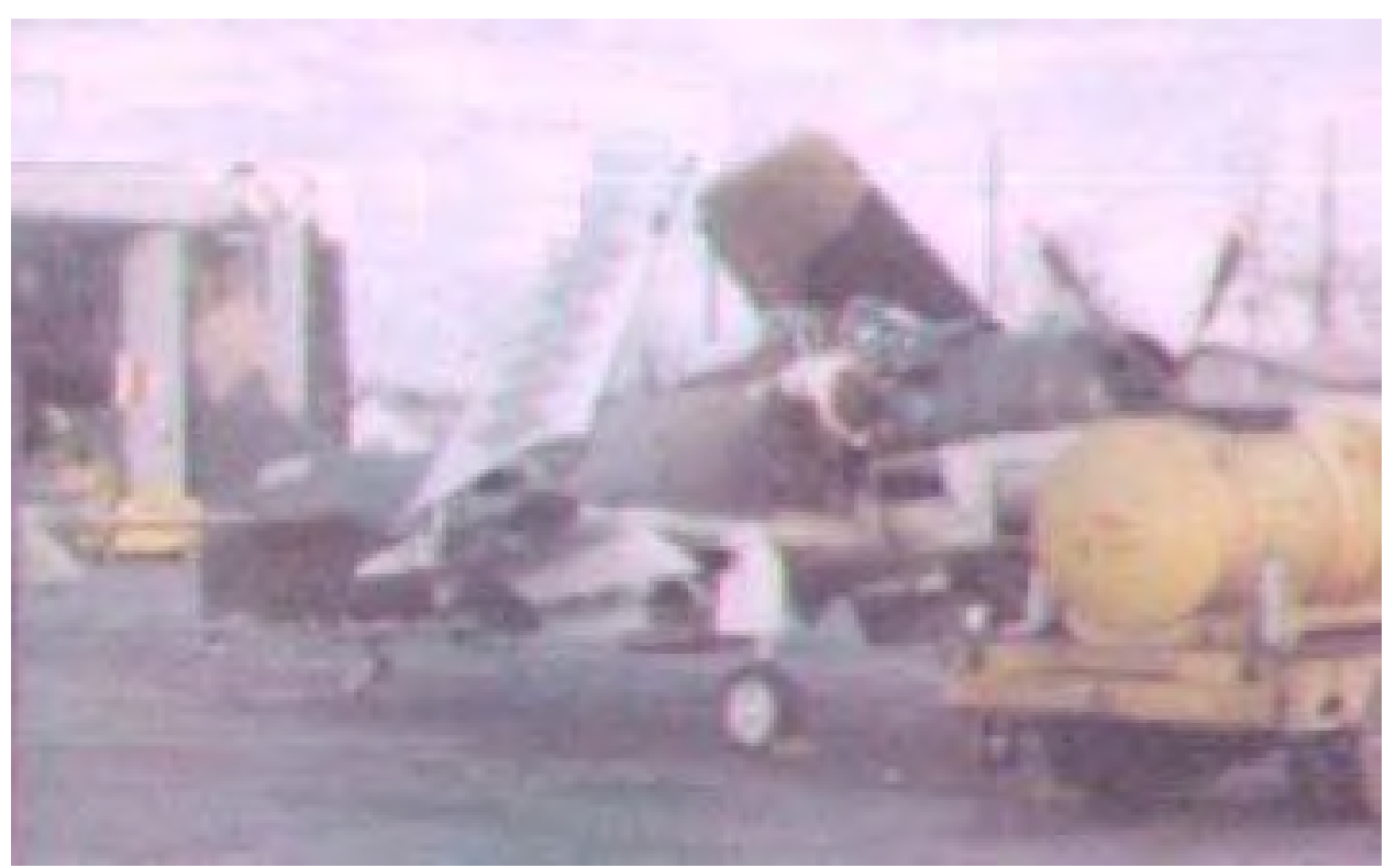
30. A1E Sandy being readied for Air Rescue and Recovery Mission, Đà Nàng AB, RVN, 1969.