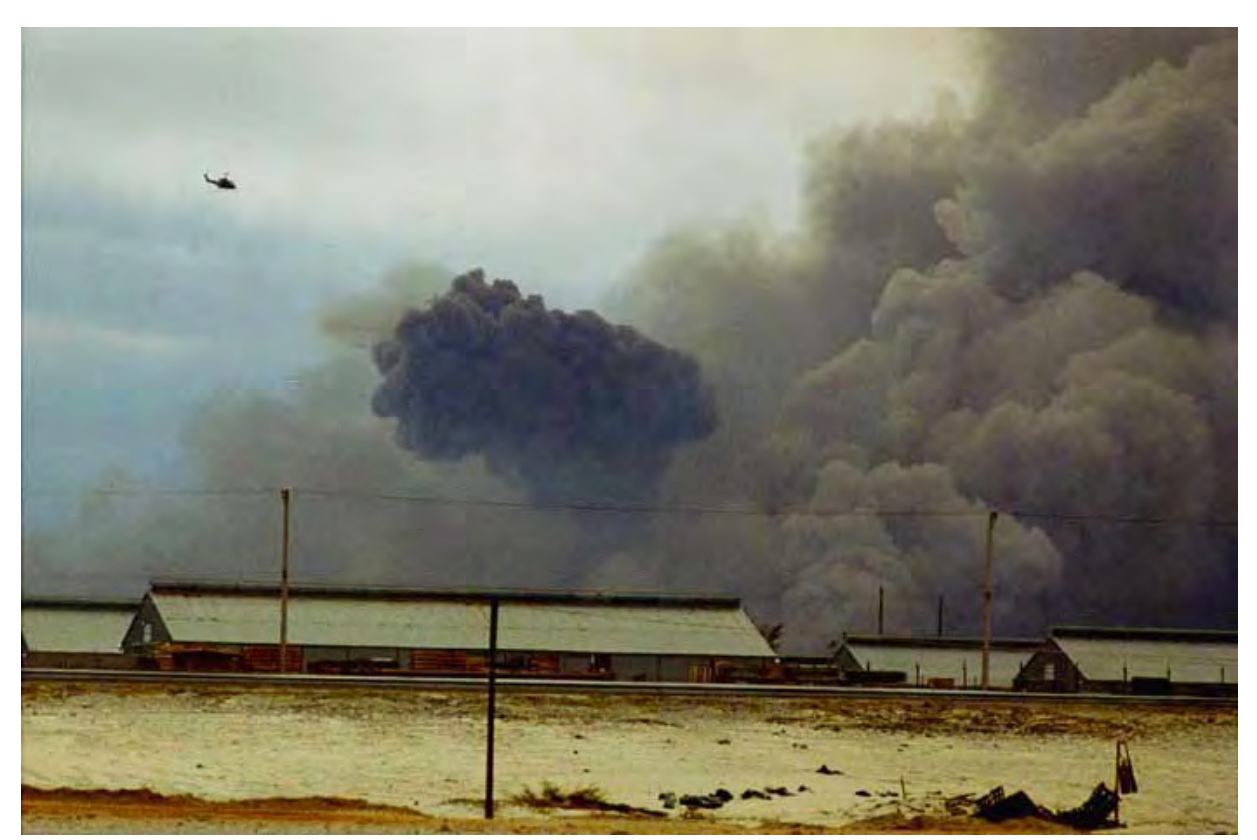
15. Bomb explosions rocked the valley for some time.