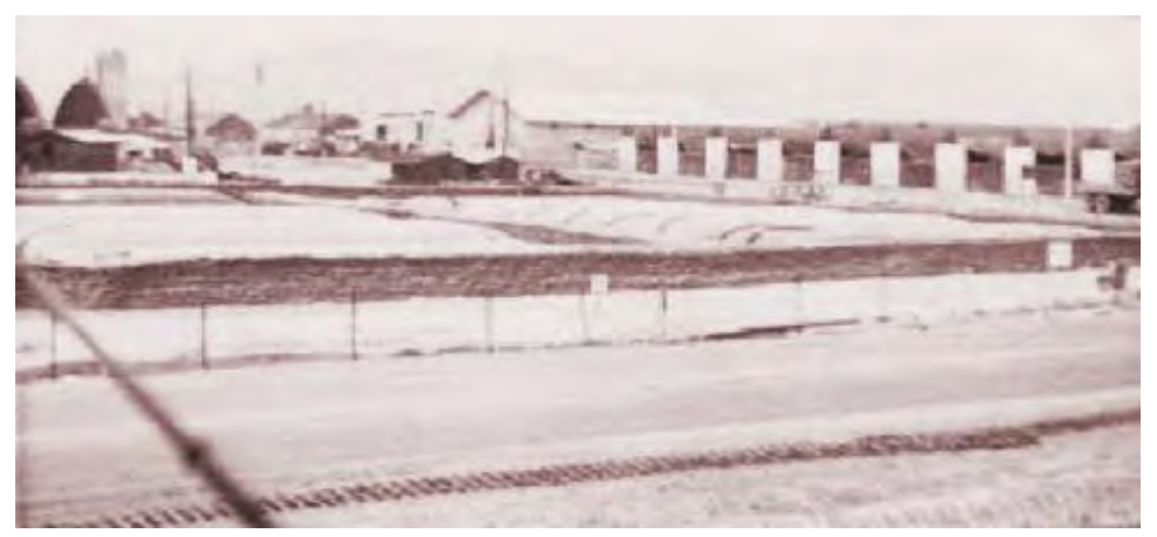
33. Looking toward Gunfighter Village , from the Mortar Site. The center building took a 122 Rocket just prior to this pic being taken.

32. The Silk Factory that was at the South end of the runway outside the perimeter. Charlie took it in Tet 1969, set up a .51 cal machinegun and raised hell until the Marines repoed it.