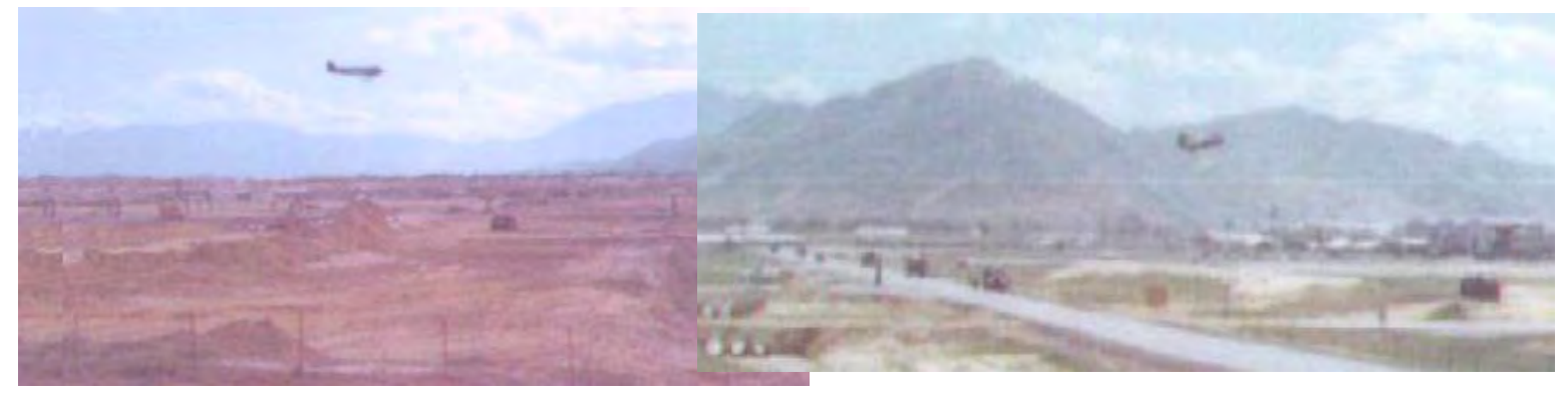
20. Above-right. Chinook begins climb out. Looking toward Freedom Hill 327.