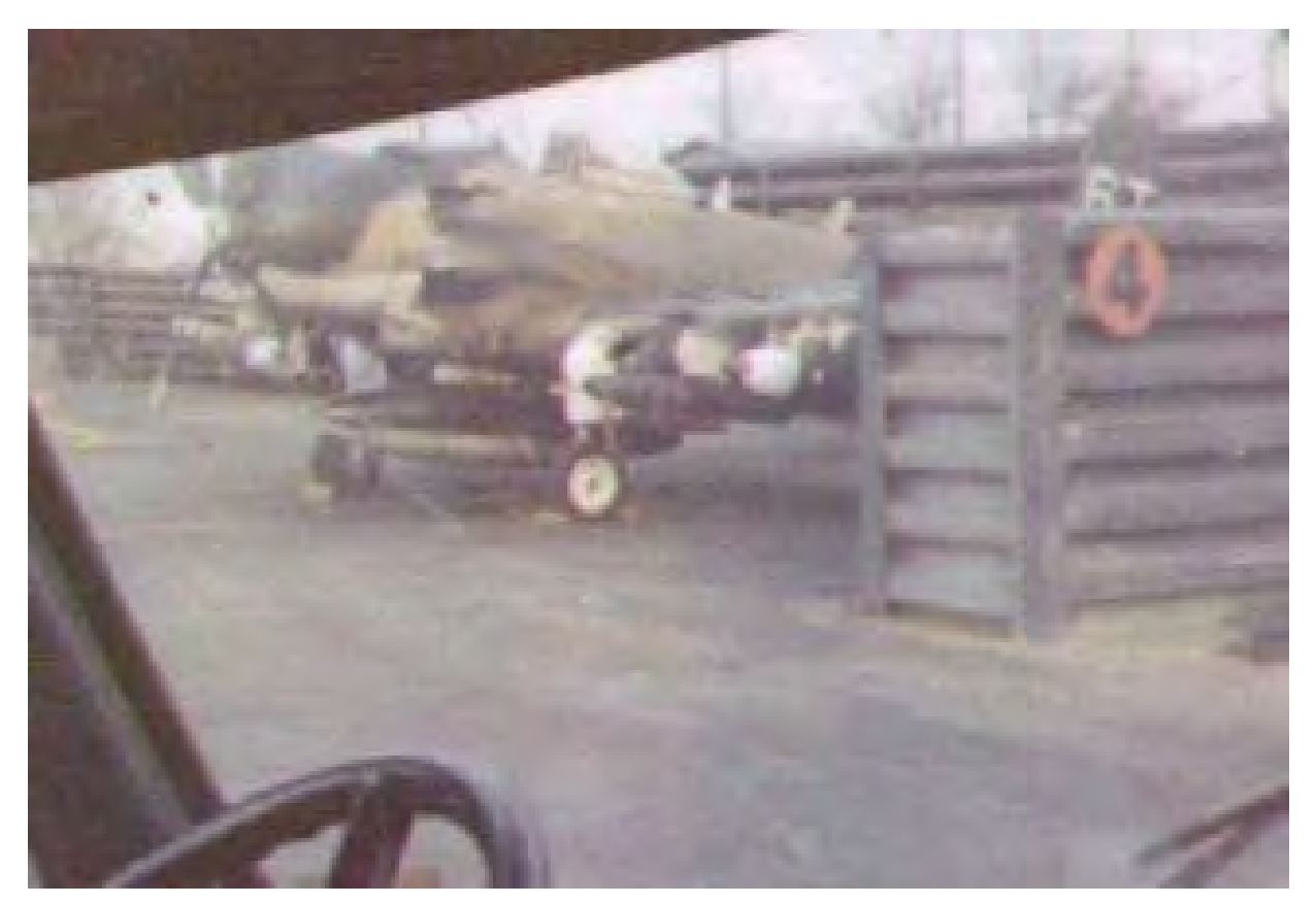
31. A1E Sandy, ready and waiting for Air Re and Recovery Mission, Đà Nàng AB, RVN, 1969.