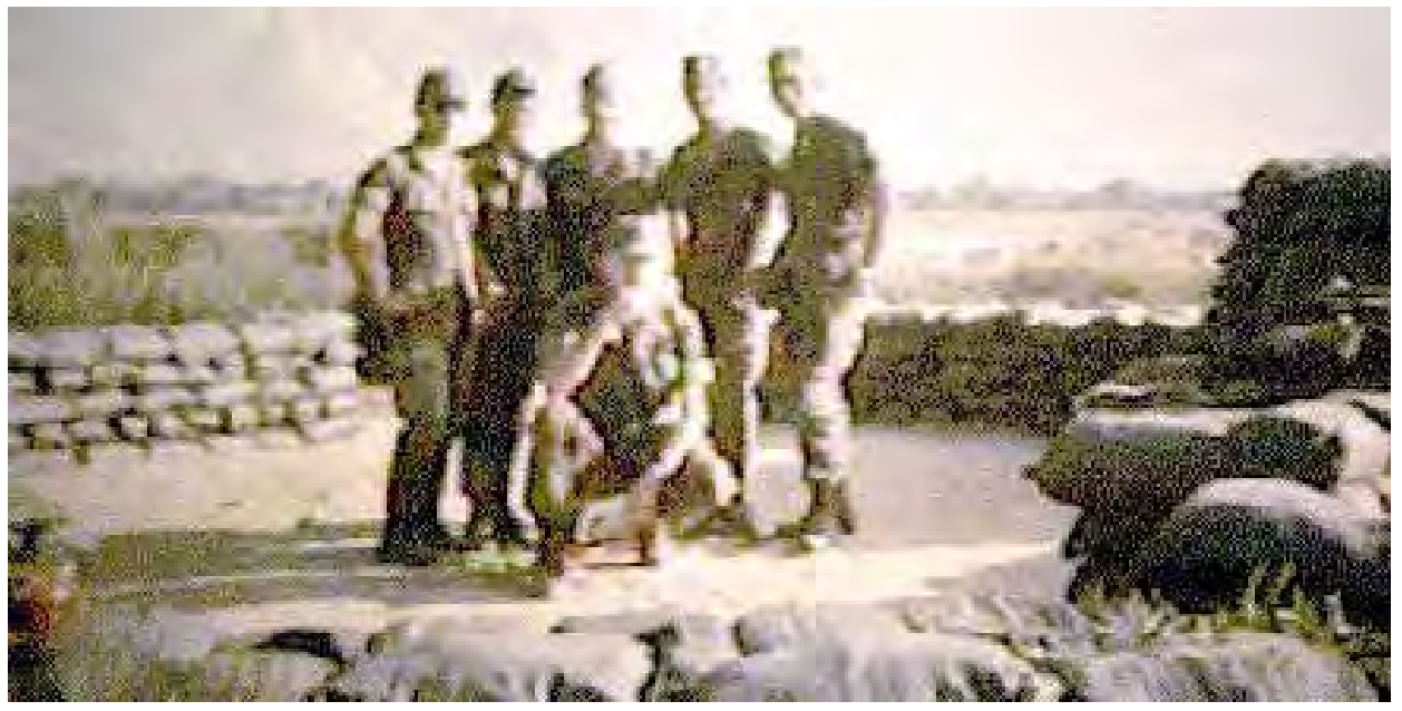
4. USAF 81mm Mortar Team at Đà Nàng AB, RVN.