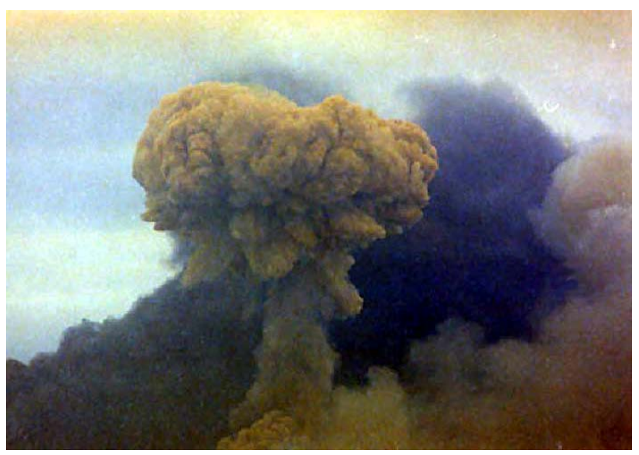
14. Explosion attributed to a grass fire that got out of hand.