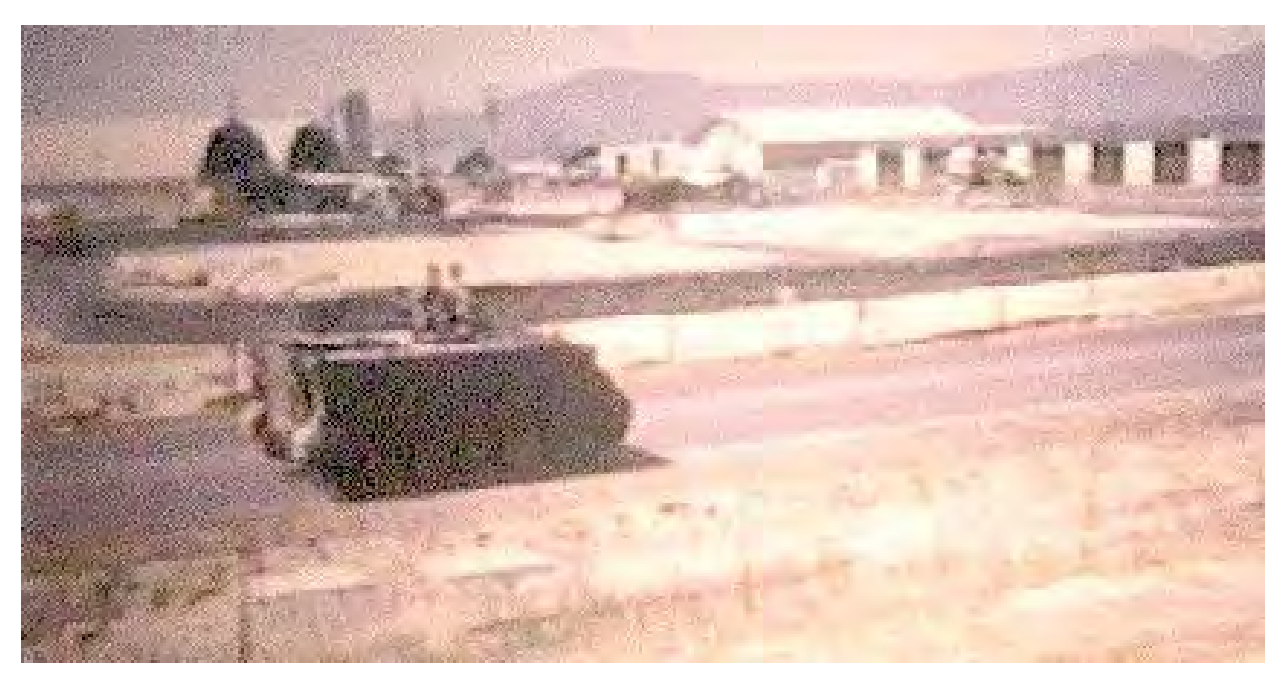
21. USAF Security Police APC on the south perimeter road , adjacent to the 81mm Mortar Pit, looking toward Gunfighter Village, Đà Nàng AB, RVN, 1969.