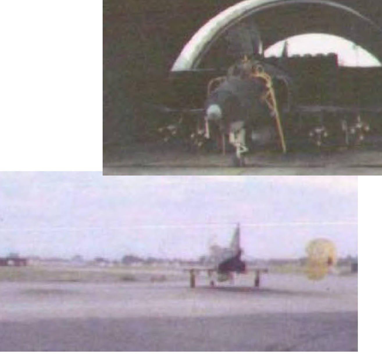
29. F4 Phantom returning from mission, Đà Nàng AB,RVN, 1969.

28. Below. F4 Phantom primed and ready for mission, sitting in cement and steel revetment, Đà Nàng, AB, RVN, 1969.