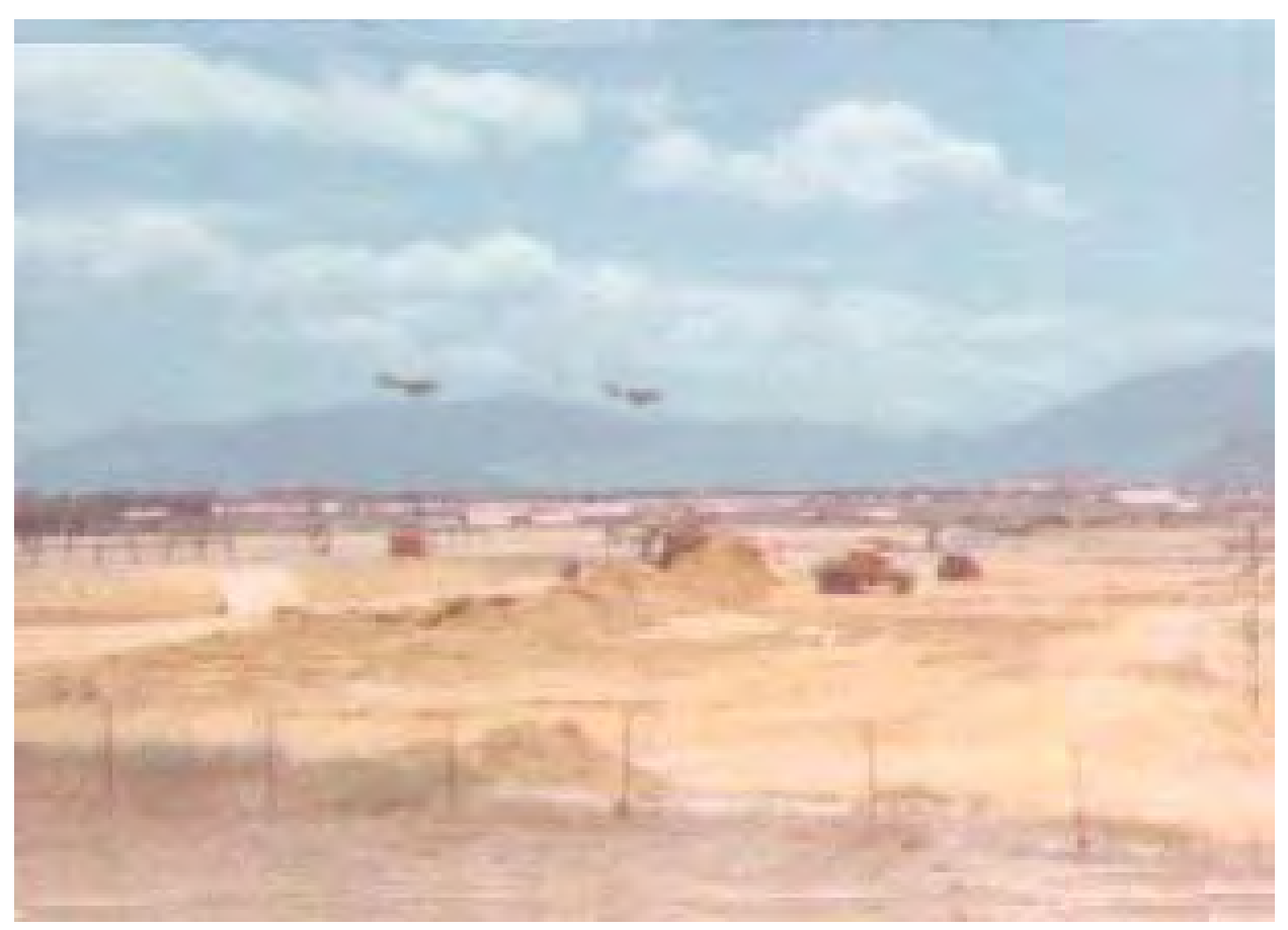
22. Looking toward Happy Valley and Hill 327, from the Mortar Pit Đà Nàng AB, RVN, 1969.