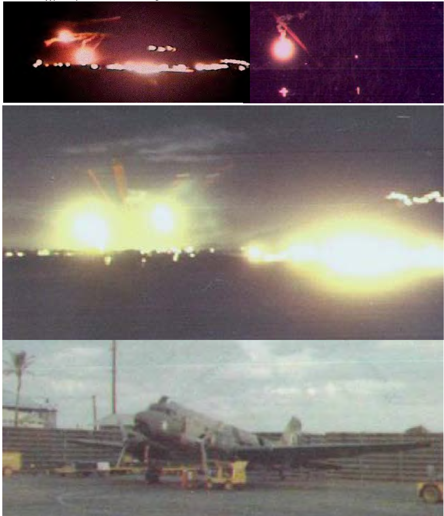
26. Spookie sitting in protective parapit, Đà Nàng AB, RVN 1969.

23. ( Row-1, Left ). 24. ( Row-1 Right ). & 25. (Row-2). Spookie hosing down, dropping flares, and lighting up the skys in Happy Valley to the south of Đà Nàng AB, RVN 1969.