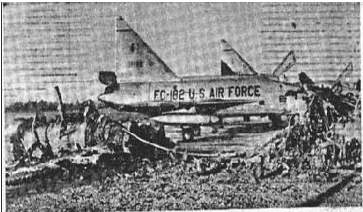
VIET CONG SURPRISE ATTACK ON DA NANG AB DESTROYED F-102 DELTA DAGGER (FOREGROUND).