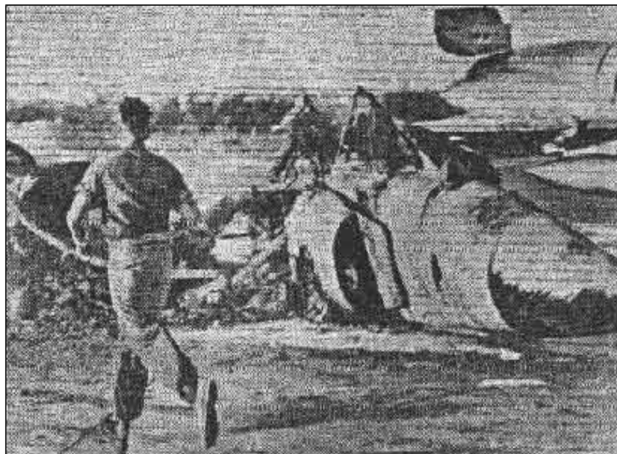
A U.S. SOLDIER RUNS PAST A DESTROYED F-102 AFTER VIET CONG RAID ON DA NANG.