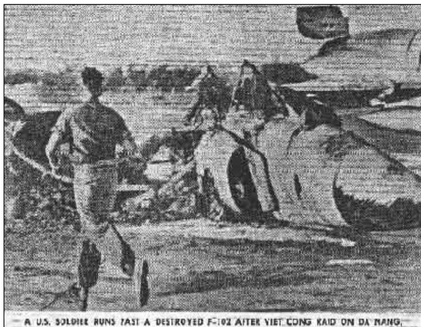
A U.S. SOLDIER RUNS PAST A DESTROYED F-102 AFTER VIET CONG RAID ON DA NANG.