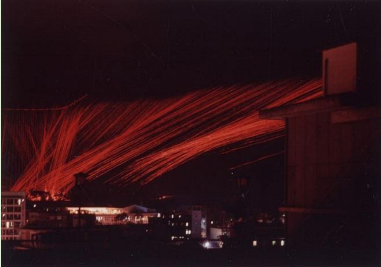
Time lapse photograph of an AC-47 helping defend Tan Son Nhut Air Base during the enemy Tet Offensive in 1968.

The Freedom Bird due to land that morning, circled the air base for several hours before landing. When it finally did land, fires were still burning from the attack. That flight also brought in about seven new handlers from a pipeline USAF sentry dog class. That evening as we started to get ready for work the new handlers were moving into the hut. Three of those handlers were Bill Grife, Gill Perry and Pete Koenig. They later described how it felt circling the base, looking down at the smoky fires. Talk about a welcome wagon!