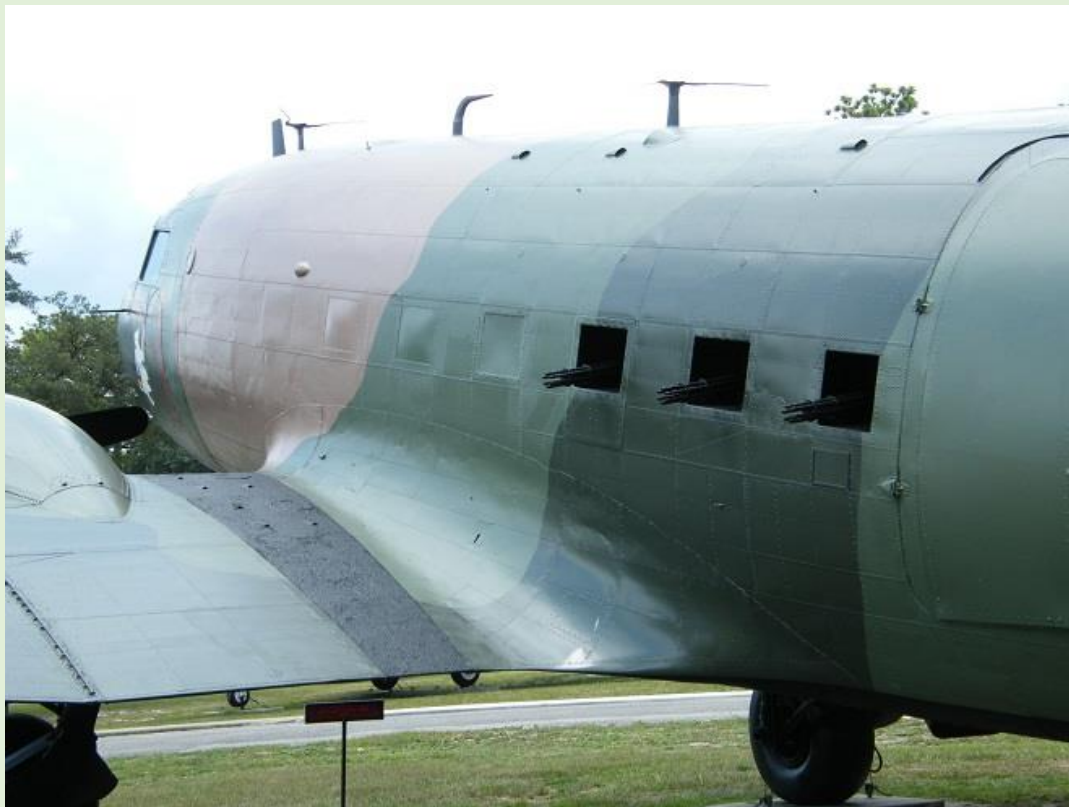
"Spooky" #43-49010, on display at the Air Force Armament Museum in Florida.

The area was hit with well over 100 rockets that night. After the rockets stopped I started sweeping my part of the perimeter. We could here gunfire in all directions. The VC attempted to overrun a Vietnamese military camp located off base. The Spooky flying overhead dropped a few flares, and circled the camp firing it's minguns. It was a very impressive light show, with what appeared to be a laser beam emitting from the aircraft and the sound of a million bees roaring. Then appearance of a solid beam of light was caused by tracer rounds (every 6th round in the ammo belt).