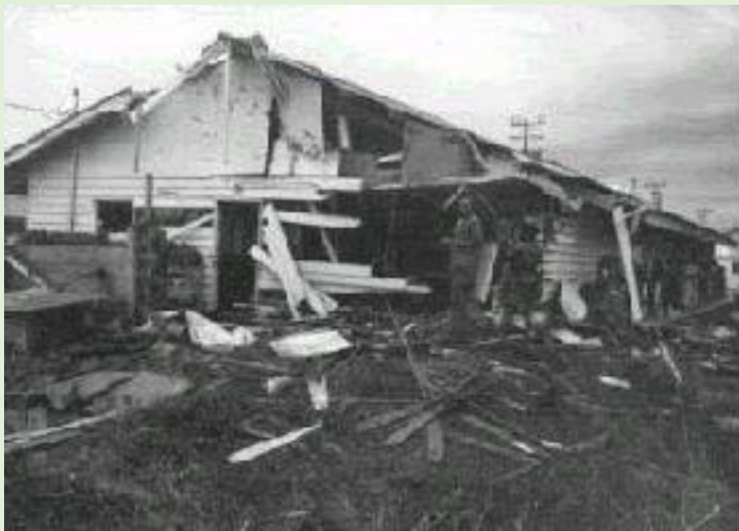
Rocket attack damage on Da Nang AB Air Base