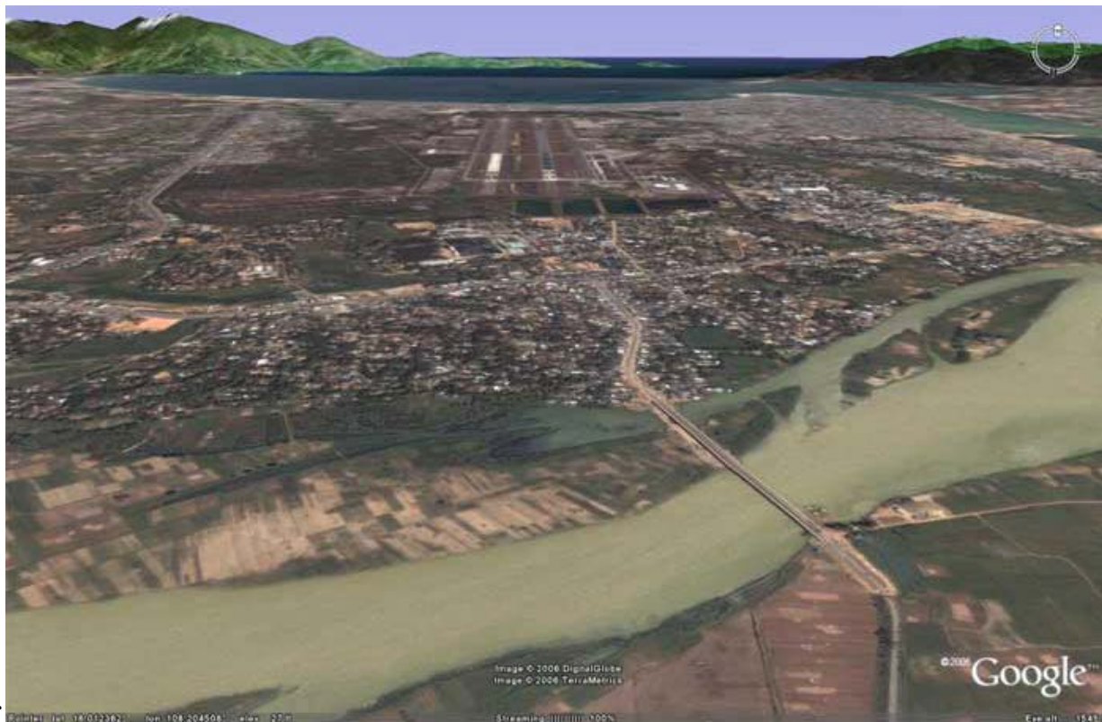
• Satellite of imaged/angled North at 1,545 feet altitude.