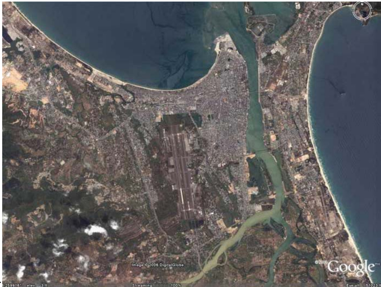
• Satellite of imaged Fly Over at 10 Miles altitude. DN AB,