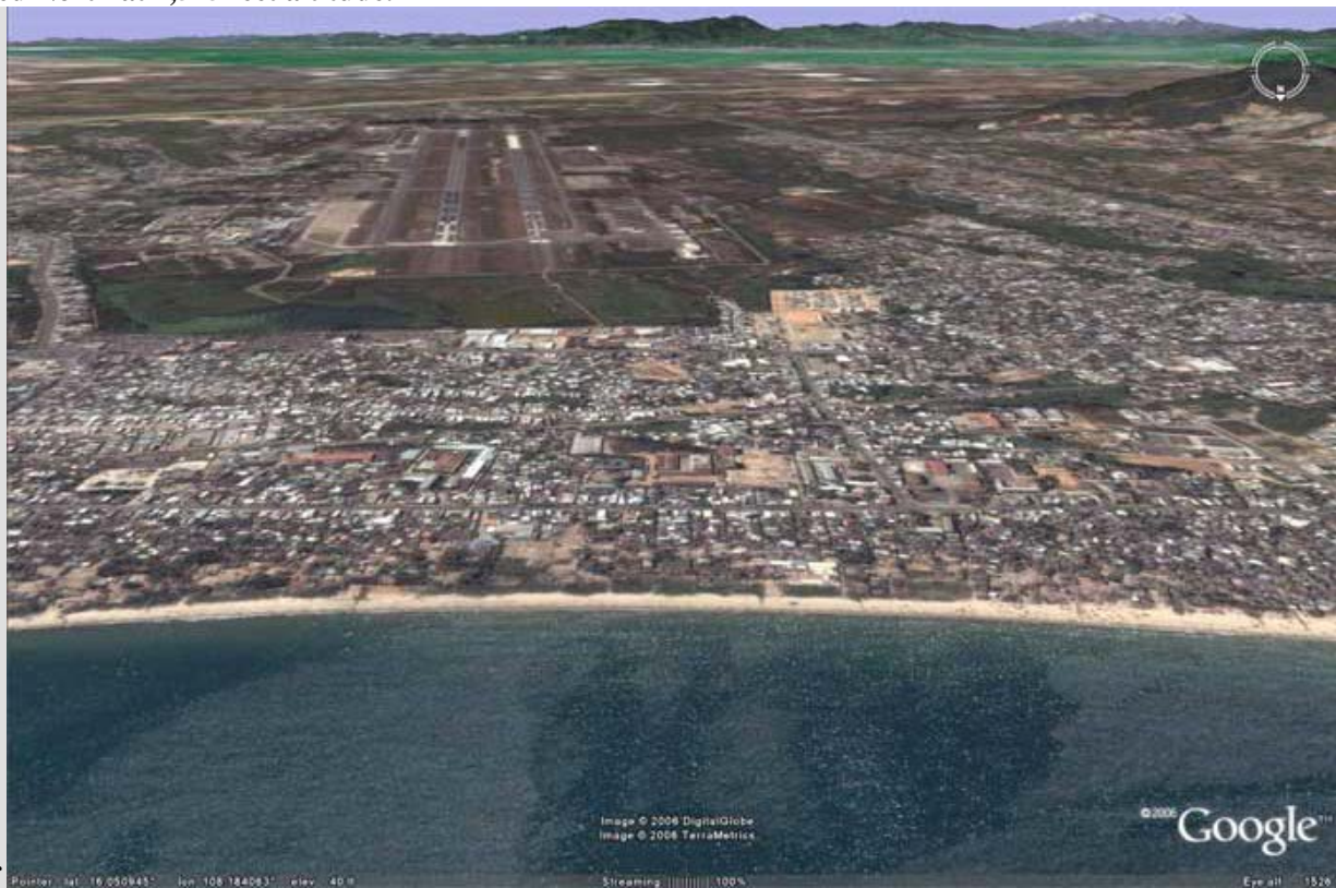
• Satellite of imaged/angled South at 1,526 feet altitude.