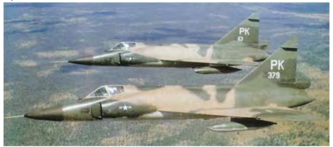
Camouflaged F-102 interceptors on patrol over South Vietnam

I was transferred from the 68th Fighter Interceptor Squadron (FIS) Itazuke AB, Japan to the 509th FIS Clark AB, Philippines, in June 1964. I was flying F-102's. On 4 August 1964, the Squadron was recalled for an actual DEFCON (not practice) in the middle of the night. We were told to bring clothes for two weeks. I threw some essentials into a B-4 bag, put it on the back of my motorcycle, and got to the Operations Building. I was the first to arrive. I was assigned an aircraft and preflighted it and got into the cockpit. The Squadron Ops officer was about ready to brief me, when I saw the two alert birds light AB's on the runway. He looked at me and said "follow them"!