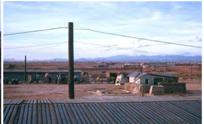
32. Đông Hà Air Field: Truck parking