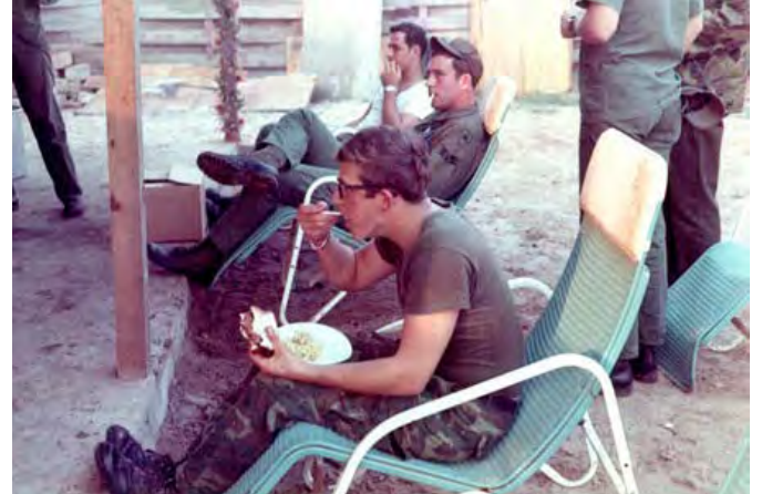
58. Đông Hà Air Field: