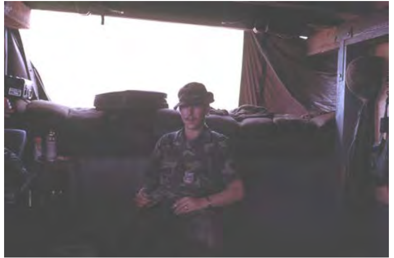
67. Đông Hà Air Field: