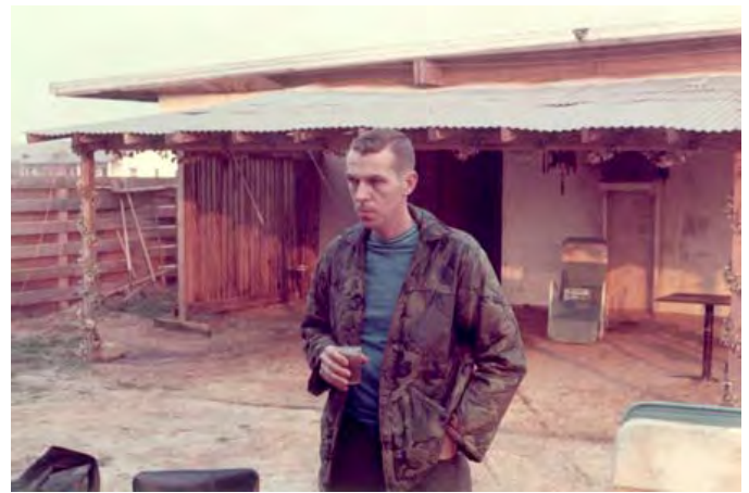
95.Đông Hà Air Field: