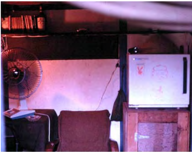
41. Đông Hà Air Field: Mini office. Small frig and adult beverages... nice fan.