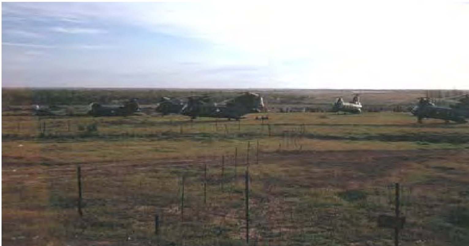
72. Đông Hà Air Field: Chinook choppers.