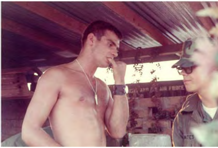
61. Đông Hà Air Field: Someone say 'Party'?