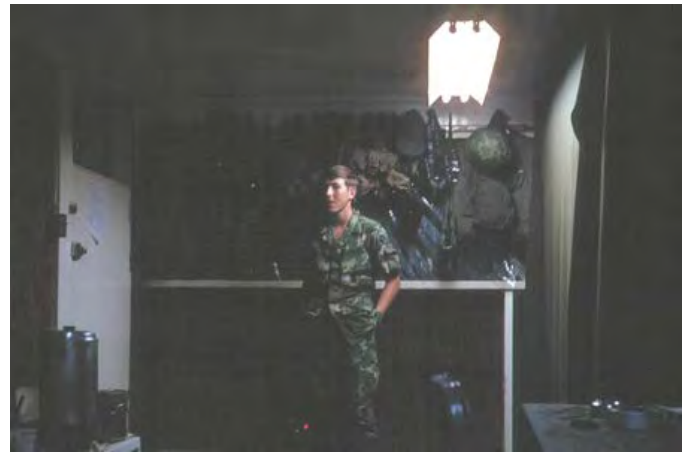
12. Đông Hà Air Field: Command Post.