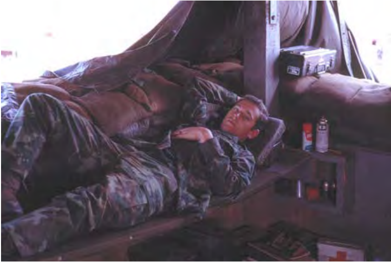
66. Đông Hà Air Field: Bunk.