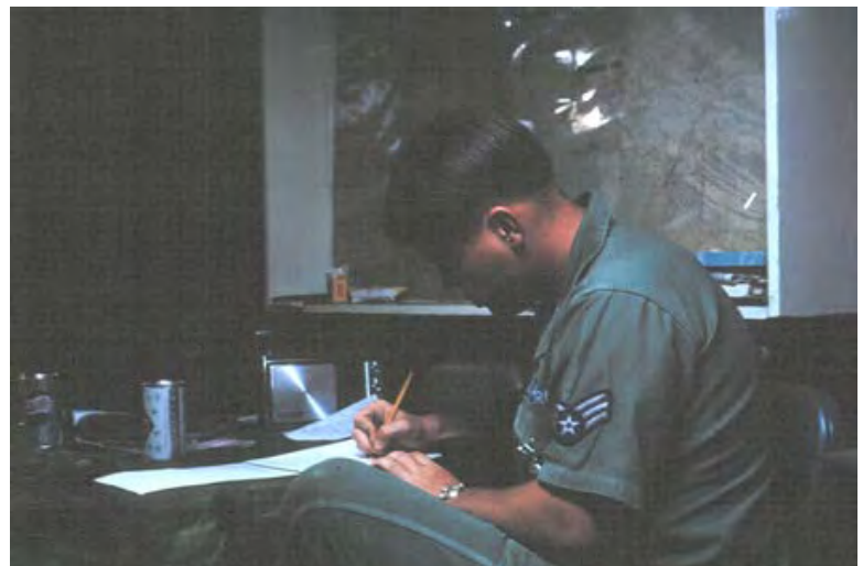
10. Đông Hà Air Field: Command Post.