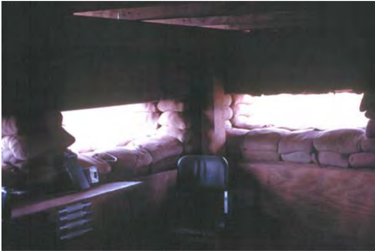
37. Dong Ha Air Field: Bunker.