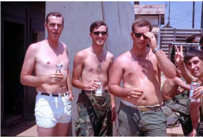
55. Đông Hà Air Field: