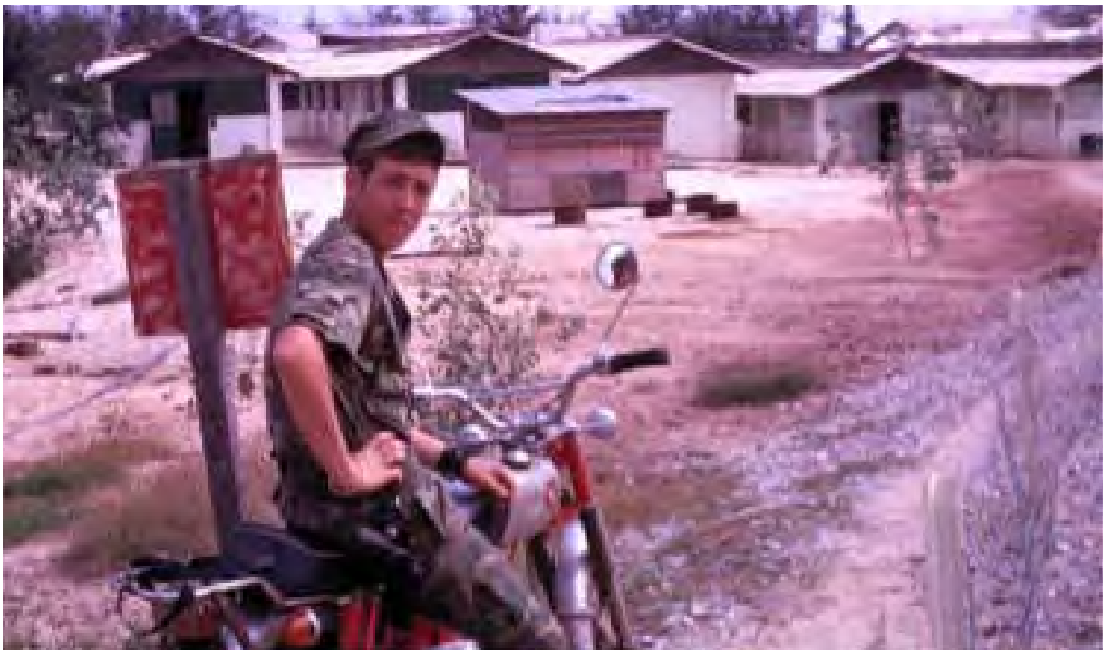
65. Đông Hà Air Field: Motorcyle to China Beach anyone?