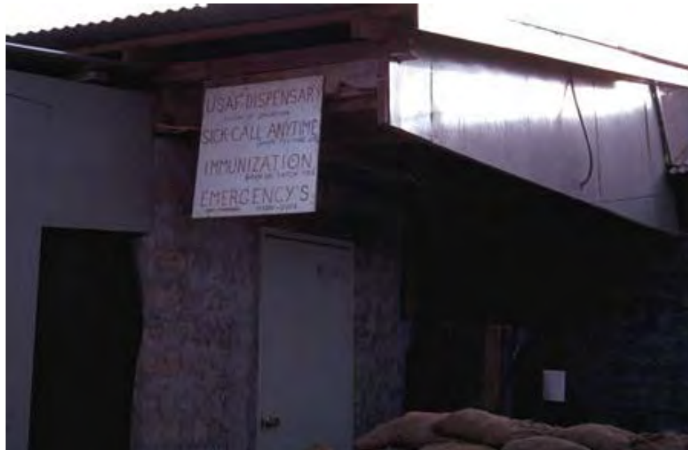
33. Đông Hà Air Field: USAF Dispensary; Sick Call; Immunization; Emergency's.