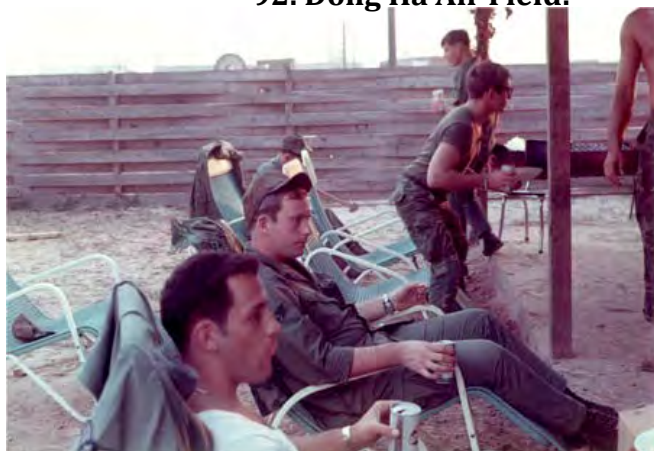
92. Dông Hà Air Field: