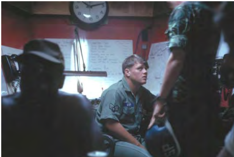
7. Đông Hà Air Field: Command Post.