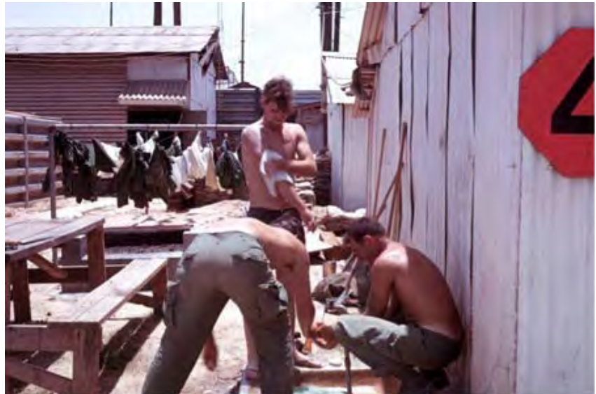
64.Đông Hà Air Field: