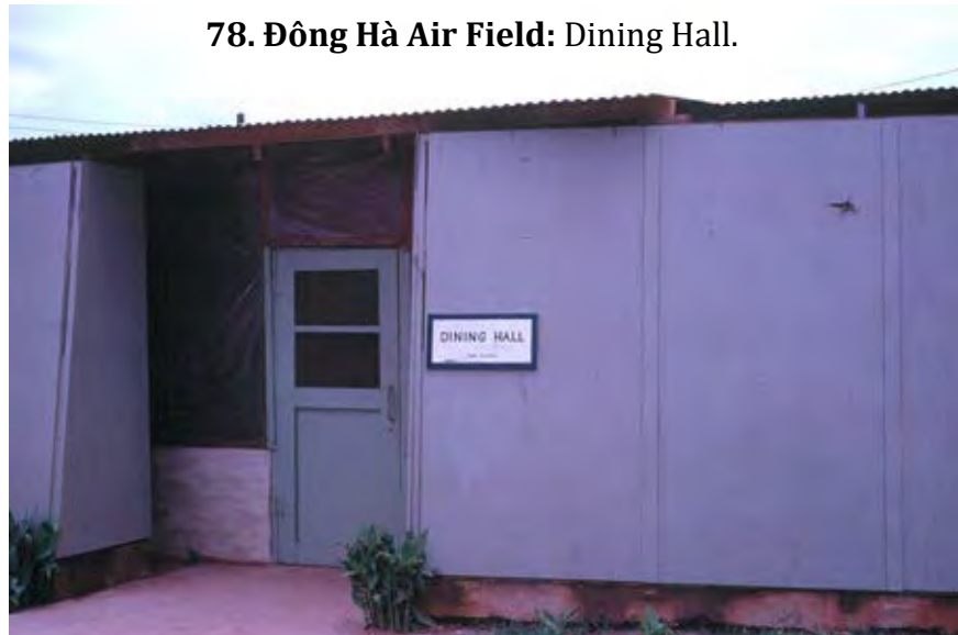
78. Đông Hà Air Field: Dining Hall.