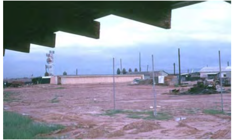
42. Đông Hà Air Field: