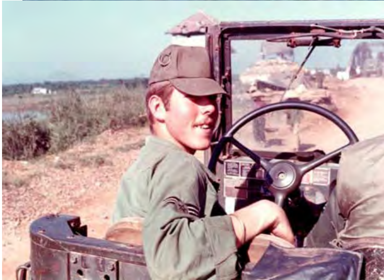
46. Đông Hà Air Field: