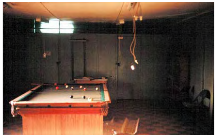
51. Đông Hà Air Field: Day room with pool table. Damaged interior.