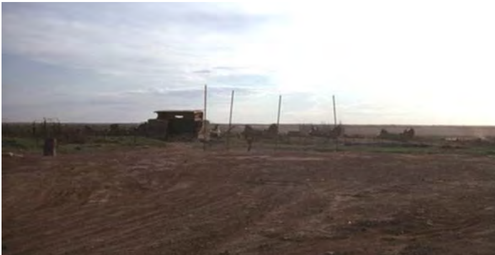
70. Đông Hà Air Field: Bunkers and Chinook choppers.