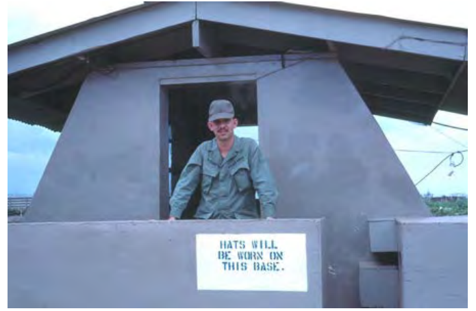
85.Đông Hà Air Field: Main Gate.