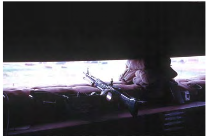
40. Dong Ha Air Field: M60.