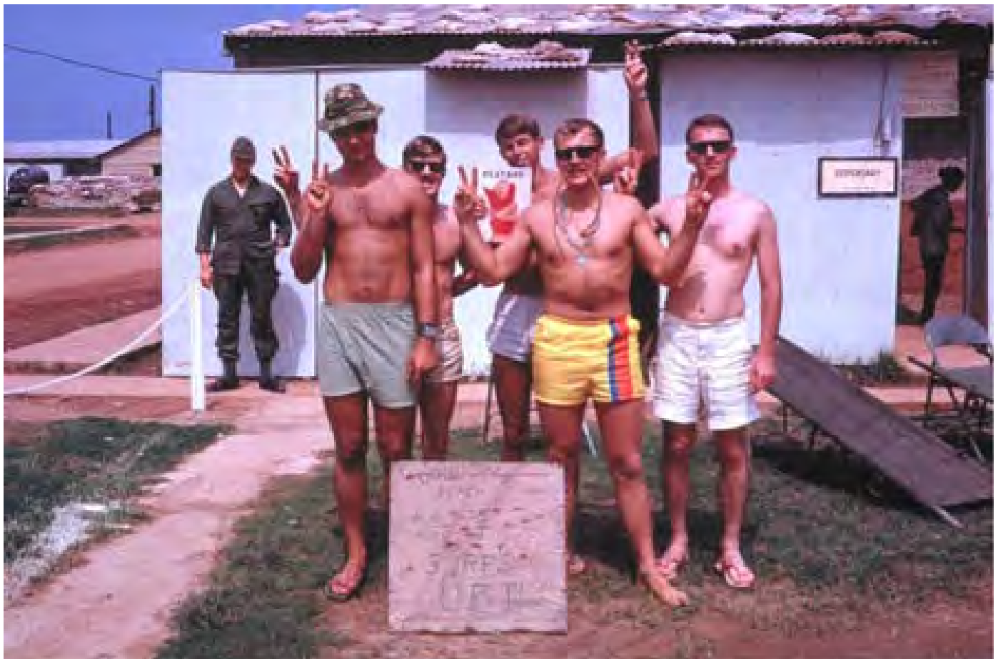
59. Đông Hà Air Field: