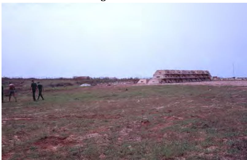
74. Đông Hà Air Field: Delta Med Evac Hospital, 3rd Marine Div. I Corps. April 1968.