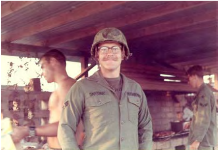
63. Đông Hà Air Field: