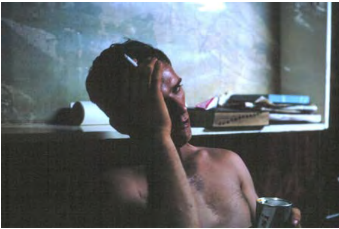
11. Đông Hà Air Field: Command Post.