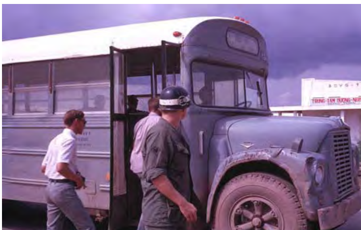
50. Đông Hà Air Field: Bus.