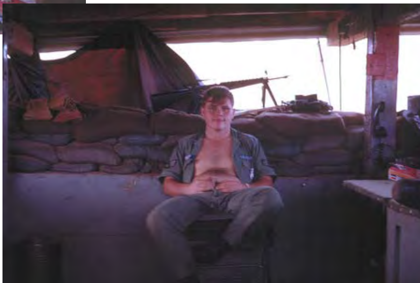
83. Đông Hà Air Field: