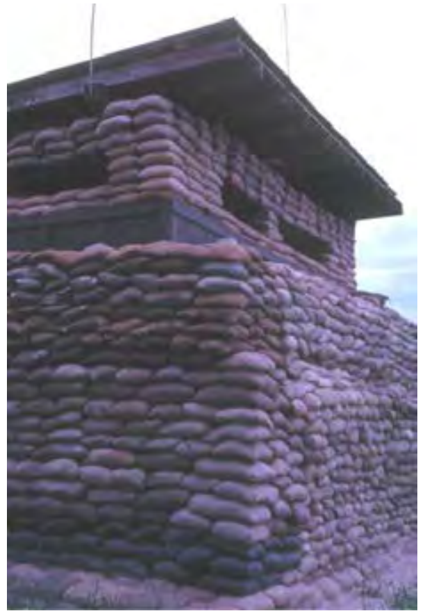
36. Dong Ha Air Field: Bunker.