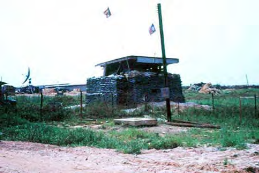
35. Dong Ha Air Field: Bunkers.