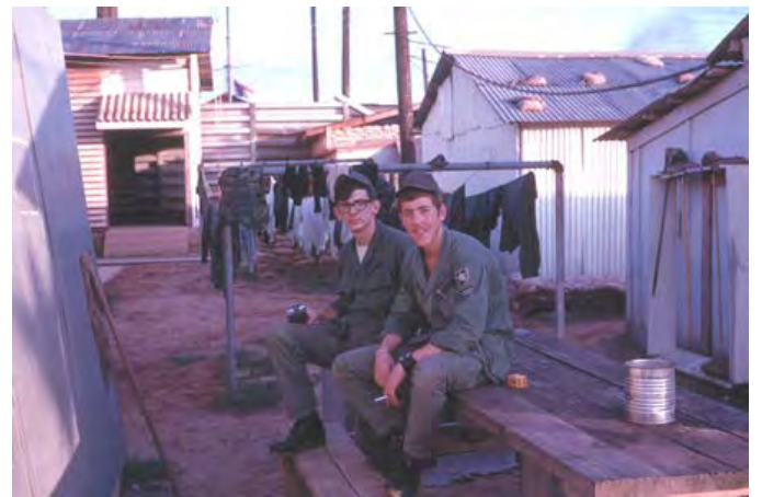
87.Đông Hà Air Field: