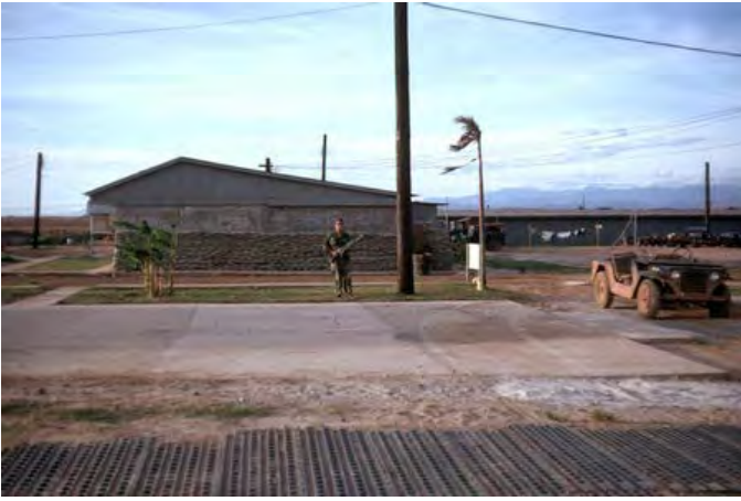
84.Đông Hà Air Field: