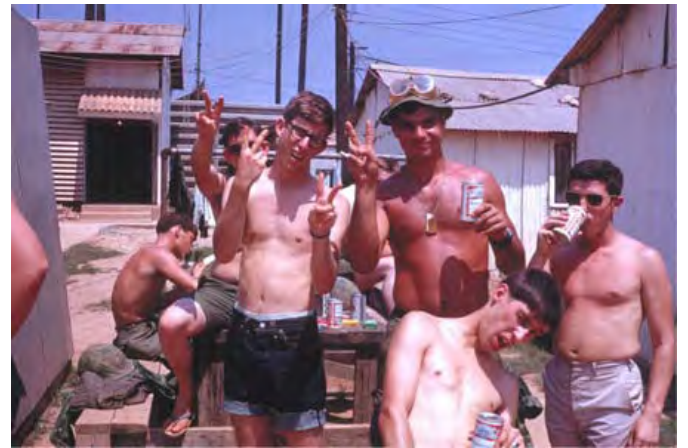
56. Đông Hà Air Field: