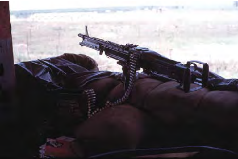
68. Đông Hà Air Field: