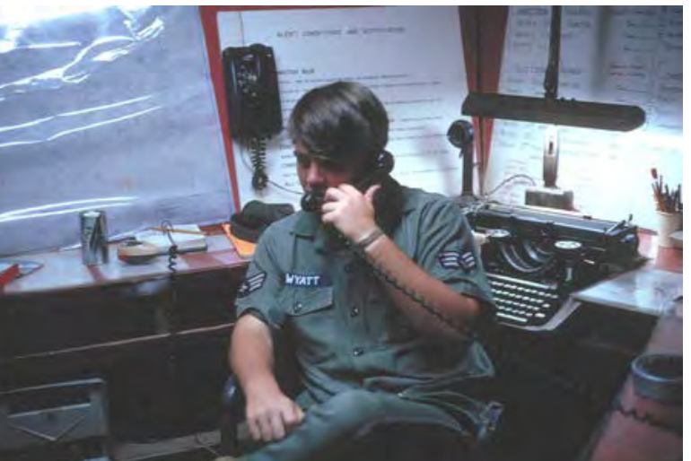
9. Đông Hà Air Field: Command Post.