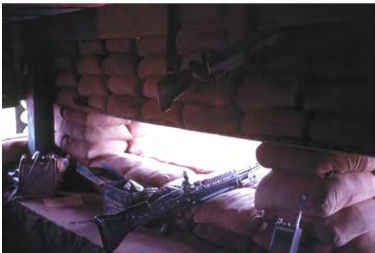
39. Dong Ha Air Field: M60.