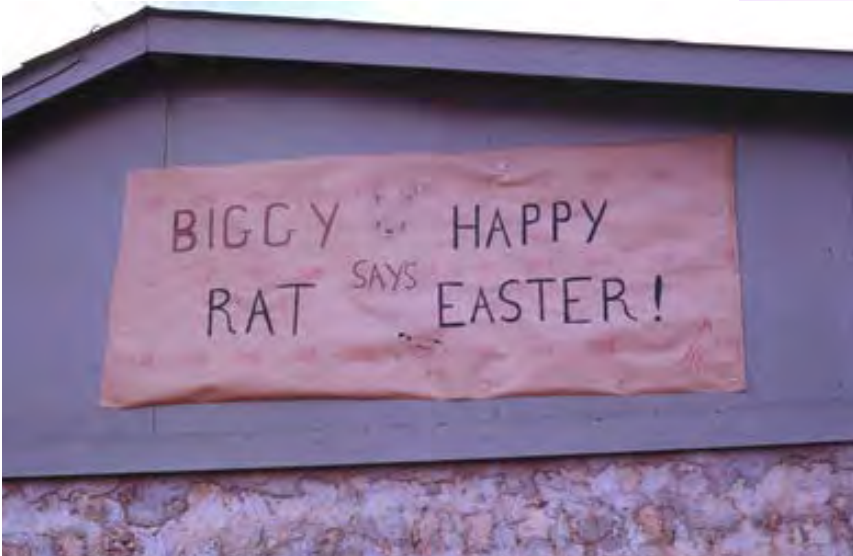
54.Đông Hà Air Field: Easter Party Time!