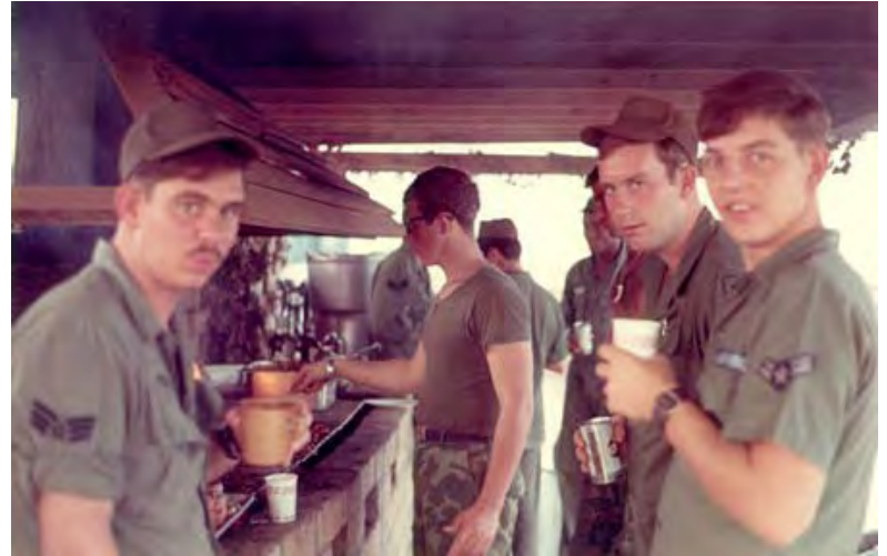
62. Đông Hà Air Field: Yep!