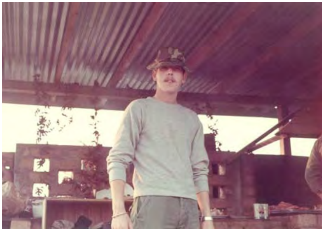
94. Đông Hà Air Field: