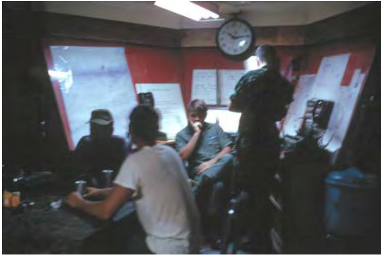
5. Đông Hà Air Field: Command Post.