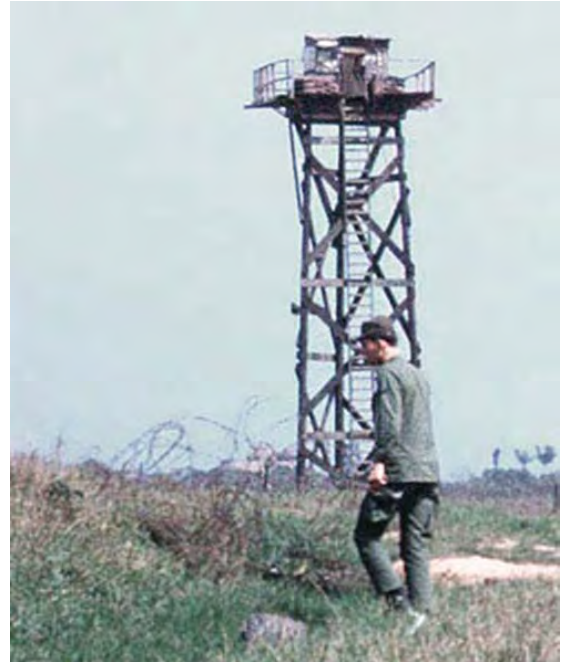
1 & 2. Đông Hà Air Field: Mines and Trip flares placed on perimeter. Look close and notice the in-place railroad rail between the men walking and the man squatting (near their feet) placing a flare.