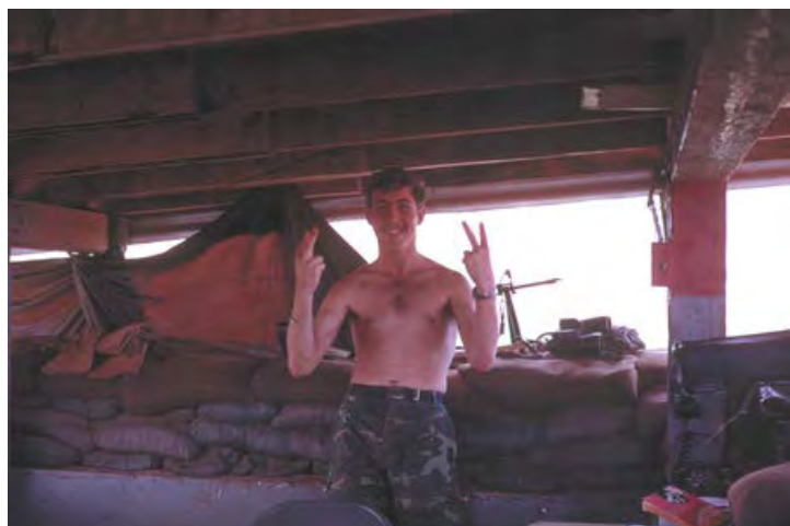
82. Đông Hà Air Field: