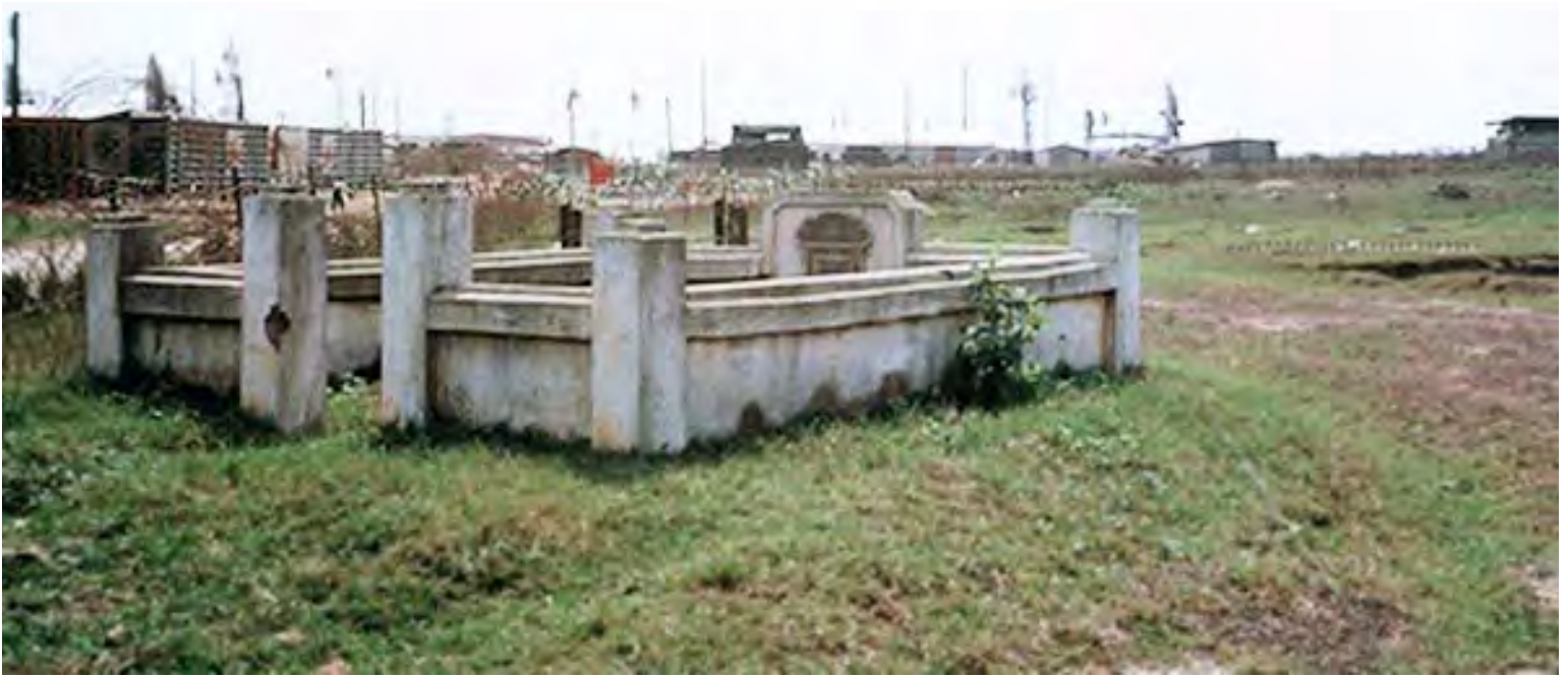
31. Đông Hà Air Field: Graveyard, bunkers, radar... all in a days work.