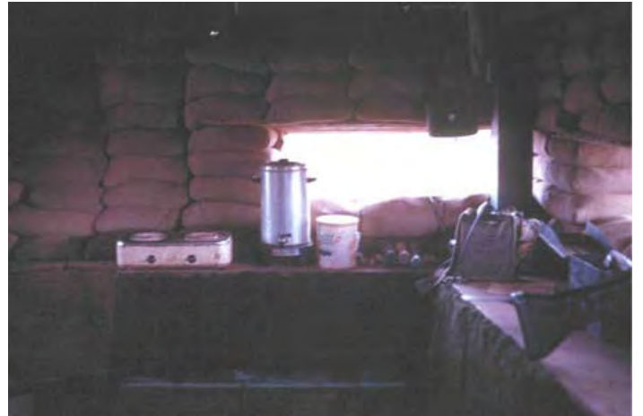
38. Dong Ha Air Field: Bunker with essentials: hotplate, coffee maker; M60.