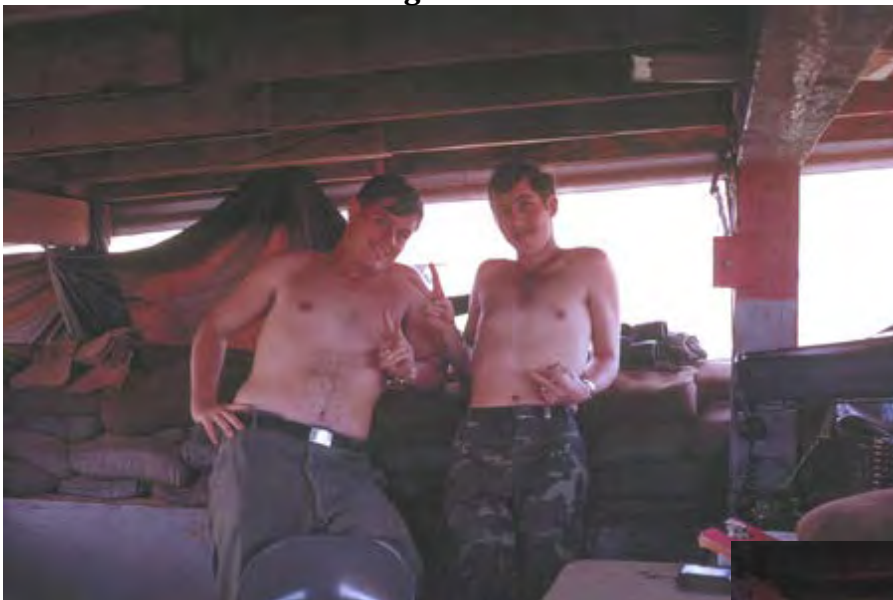
80. Đông Hà Air Field: