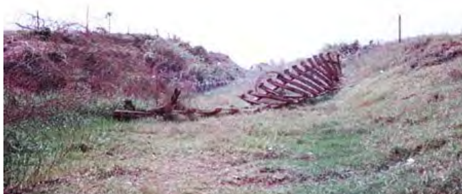
3. Railroad Track torn up.