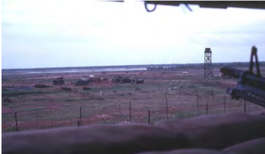
34.Đông Hà Air Field: Towers and bunkers.