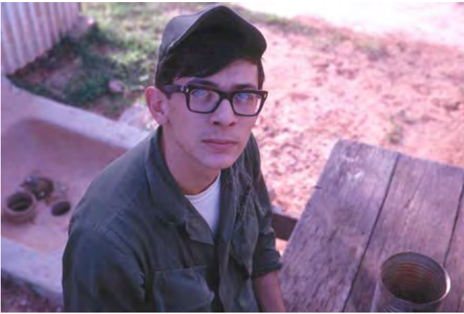
86.Đông Hà Air Field: