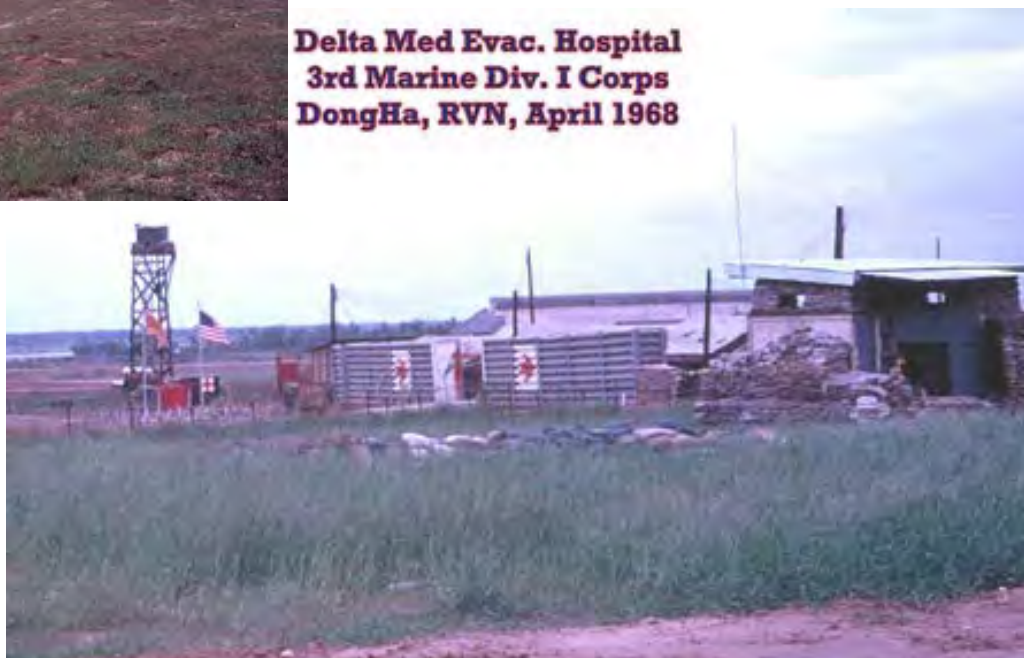
Delta Med Evac. Hospital 3rd Marine Div. I Corps DongHa, RVN, April 1968