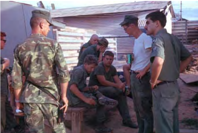
57. Đông Hà Air Field: