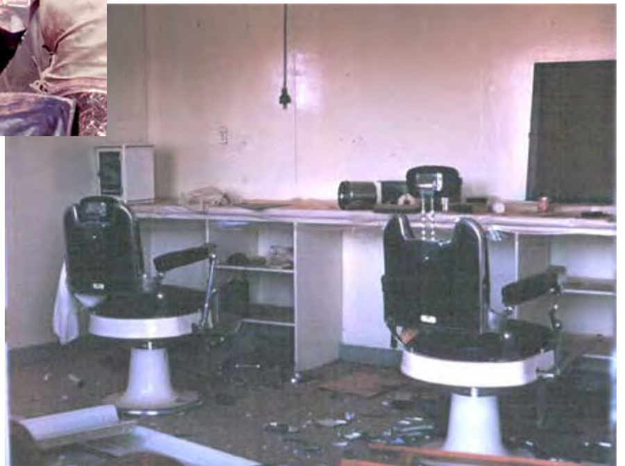
47. Đông Hà Air Field: A real barbershop!