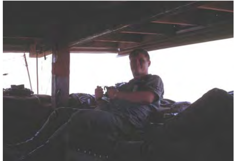
69. Đông Hà Air Field: M60.