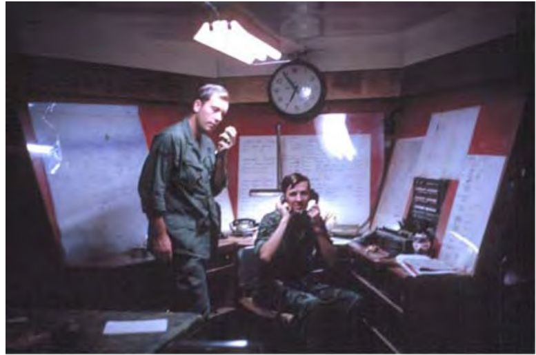
6. Đông Hà Air Field: Command Post.