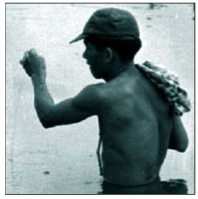
10) Vietnamese fisherman, string-fishing. Look close and you can see the line. He is one of a native ARVN fishing with a thread size string and a very small hook. He was catching what I call minnows and would use here at home for bait. He then cut the heads off and fried the bodies.