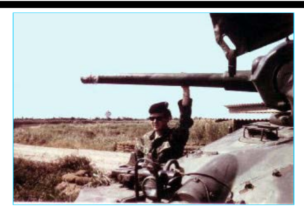
8) Duke Windsor, beside a grounded tank on perimeter road.