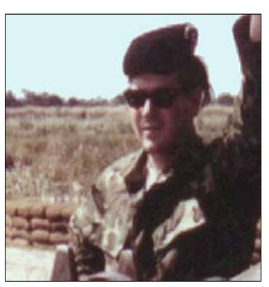
9) (Close up)